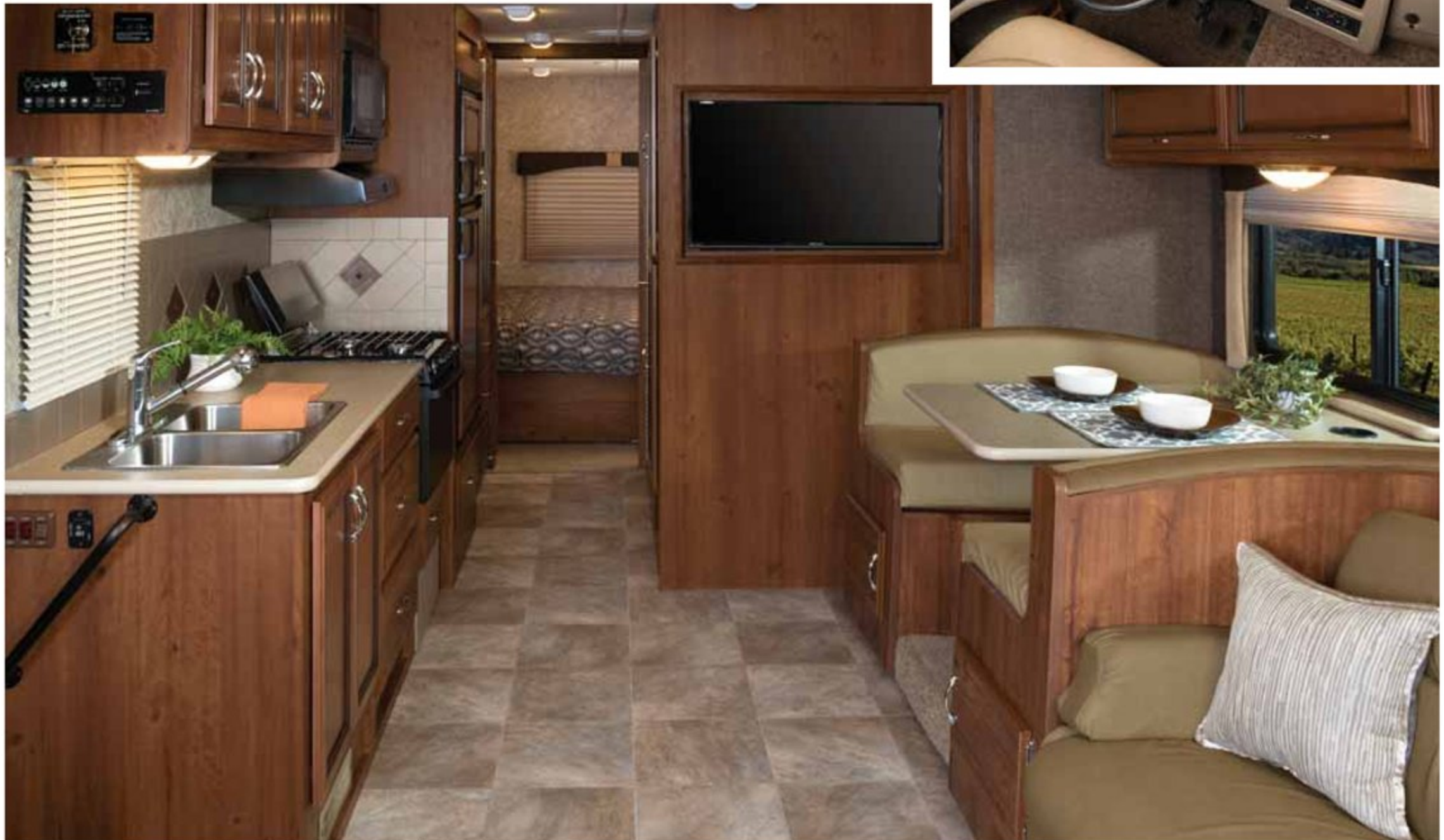
TERRA SE 33S SHOWN IN TANGO TOFFEE INTERIOR DÉCOR WITH SPICE WOOD CABINETRY