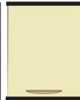
OPT. 218 HIDE-A-LOFT DROP DOWN QUEEN BED 60" X 80" W/29" LED TV