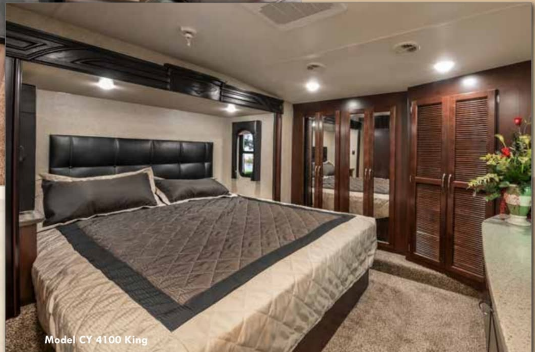
Model CY 4100 King