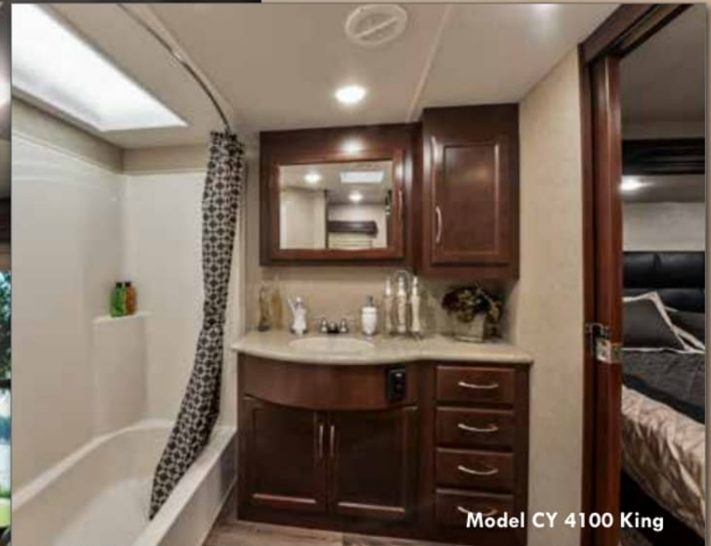
Model CY 4100 King