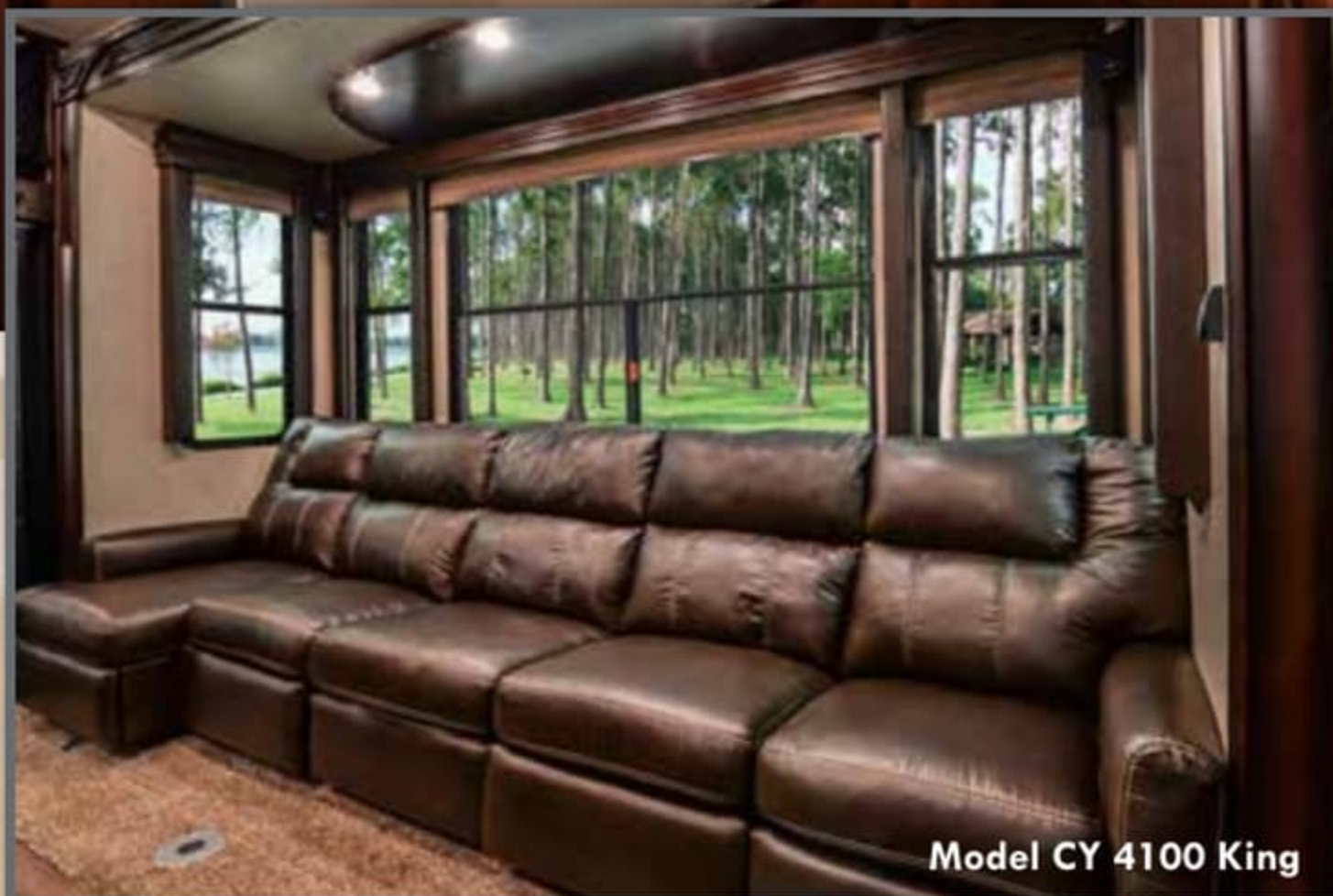
Model CY 4100 King