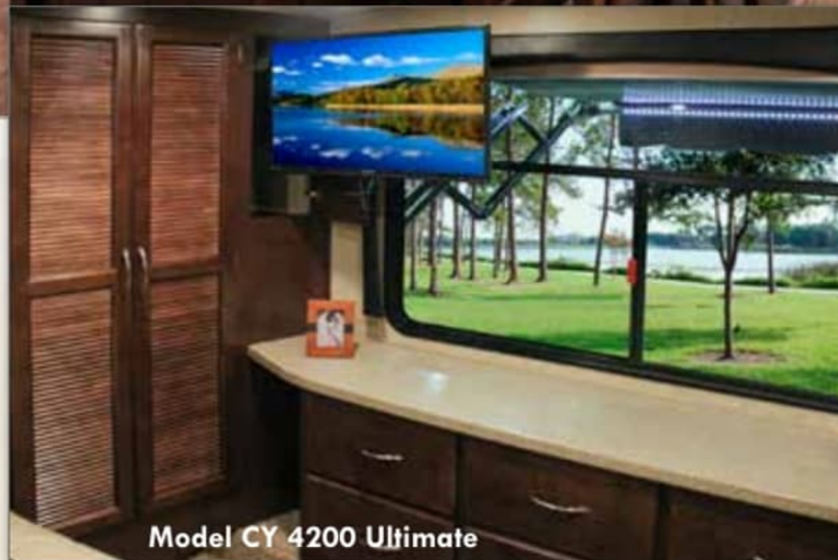
Model CY 4200 Ultimate