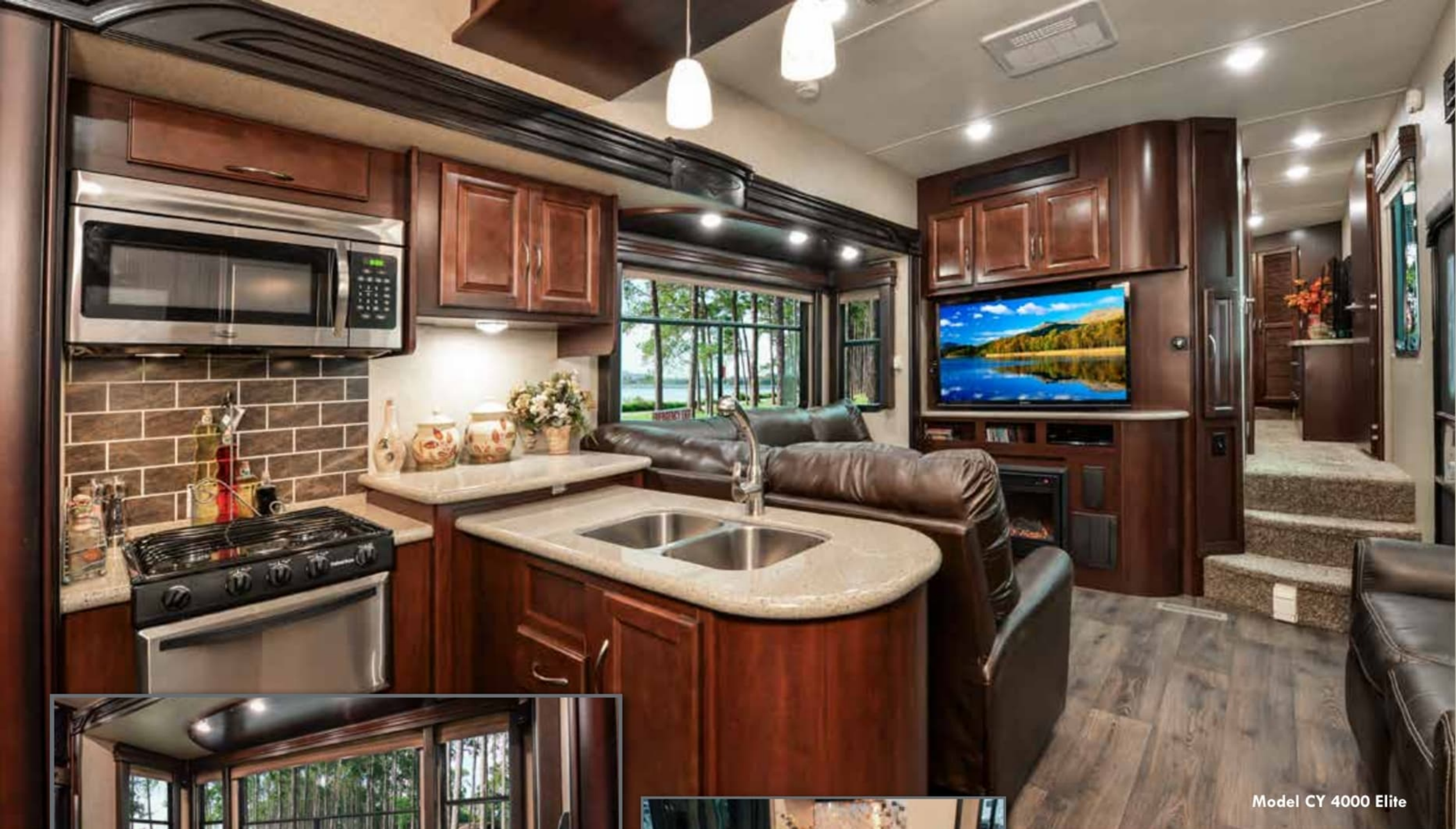
Model CY 4000 Elite