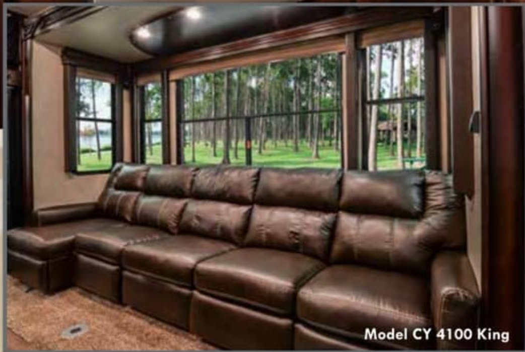
Model CY 4100 King