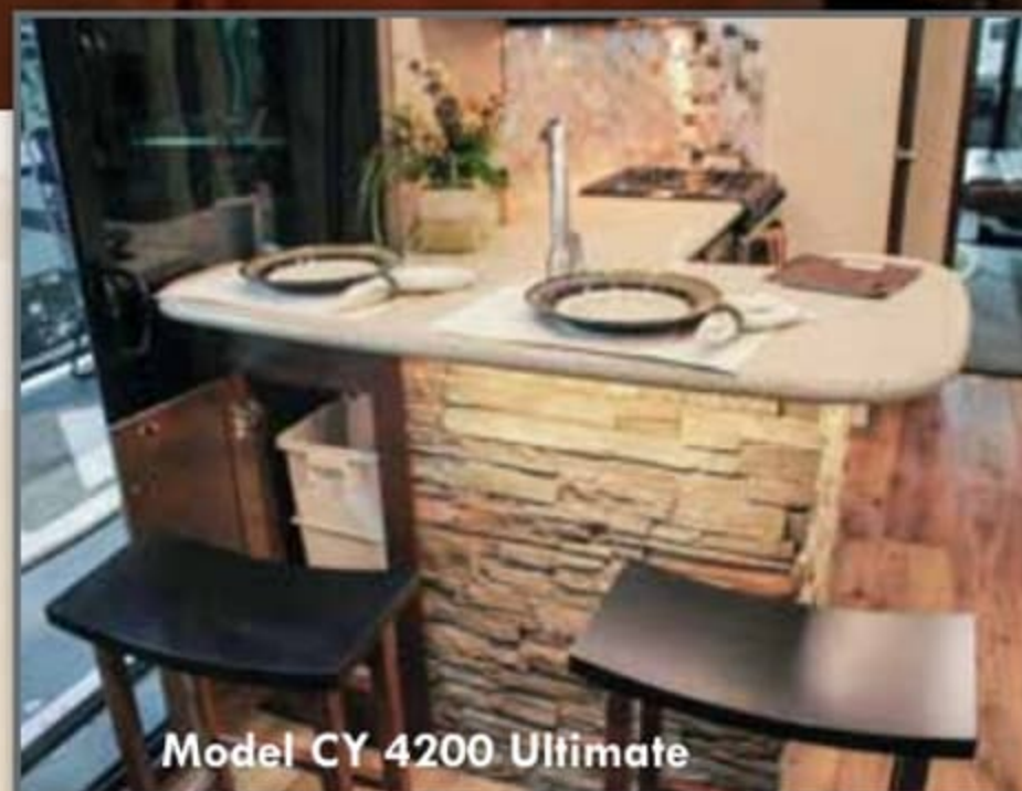
Model CY 4200 Ultimate