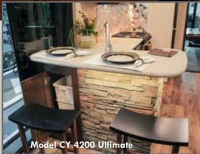
Model CY 4200 Ultimate