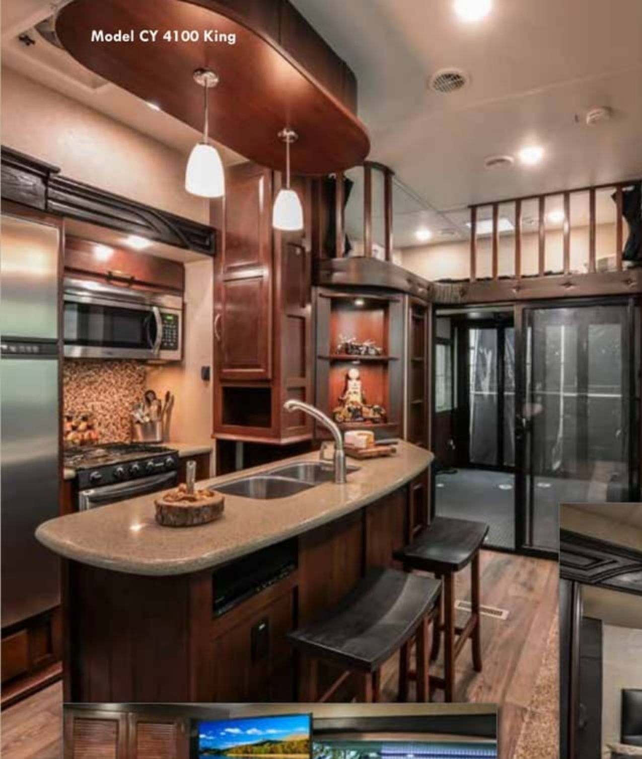
Model CY 4100 King