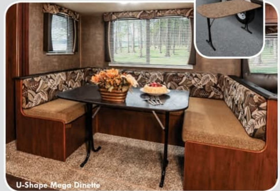
U-Shape Mega Dinette

that comfortably seats you and five other guests. Both dinettes come with a versatile table that can be used indoors or outdoors to accommodate all your dining needs.