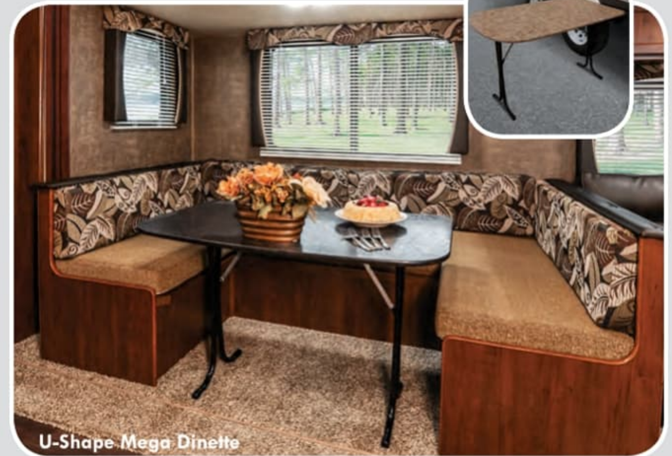
U-Shape Mega Dinette

that comfortably seats you and five other guests. Both dinettes come with a versatile table that can be used indoors or outdoors to accommodate all your dining needs.