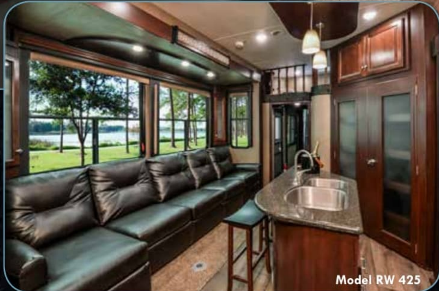
Model RW 425