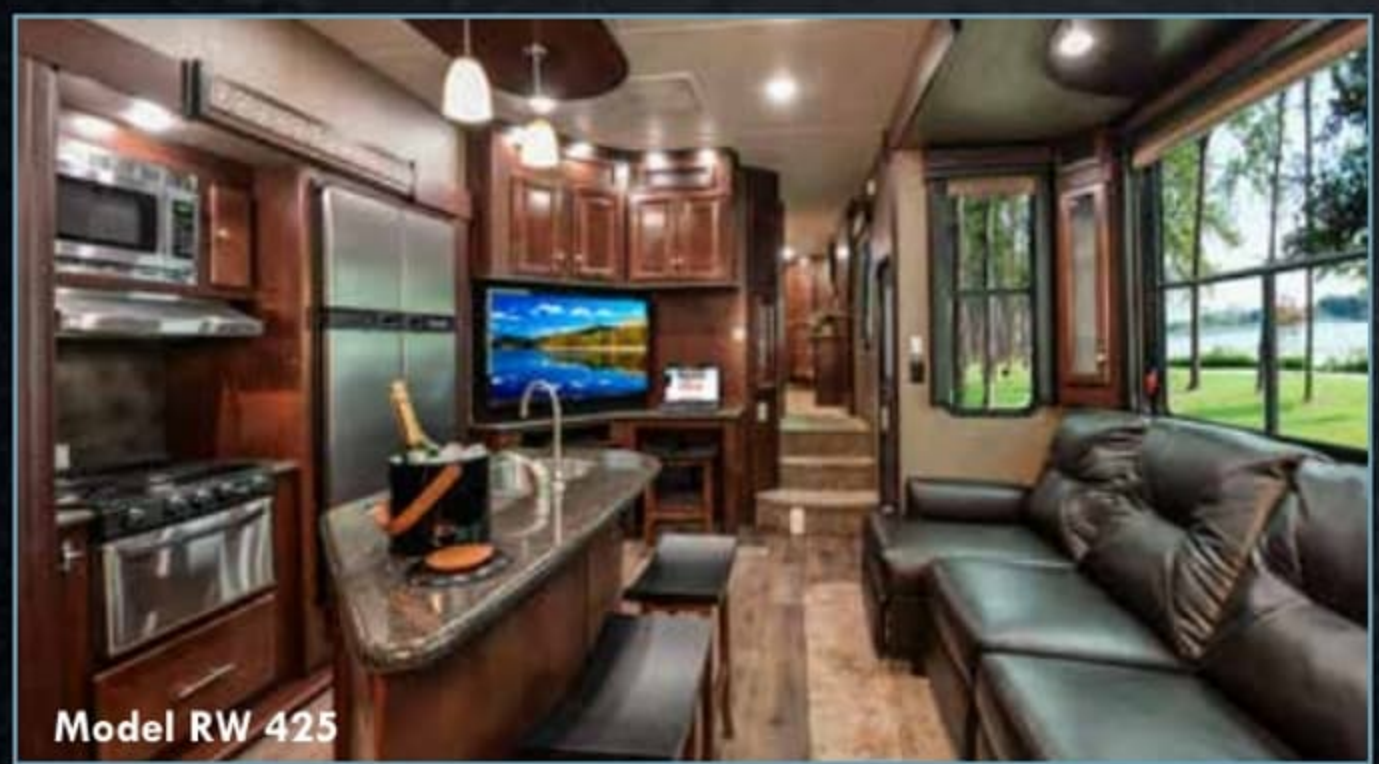
Model RW 425