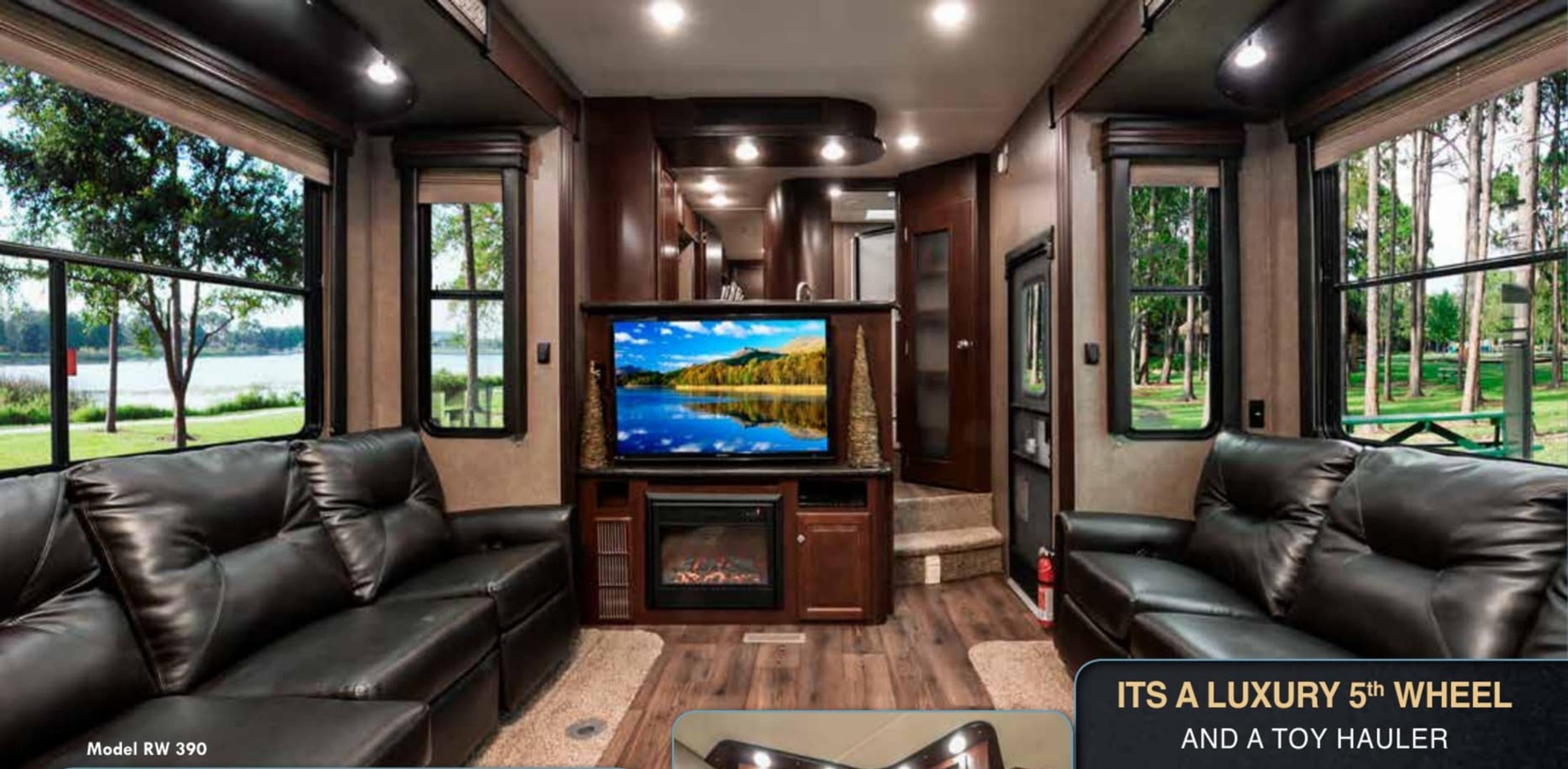
Model RW 390