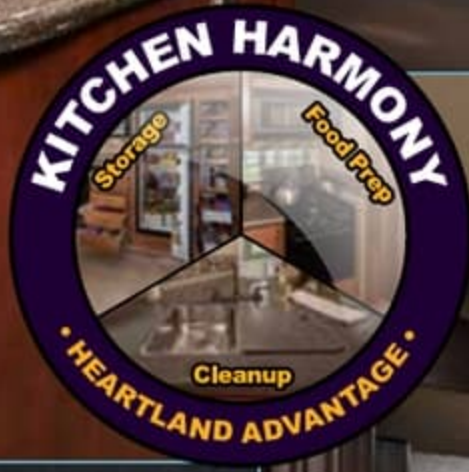
Model RW 425