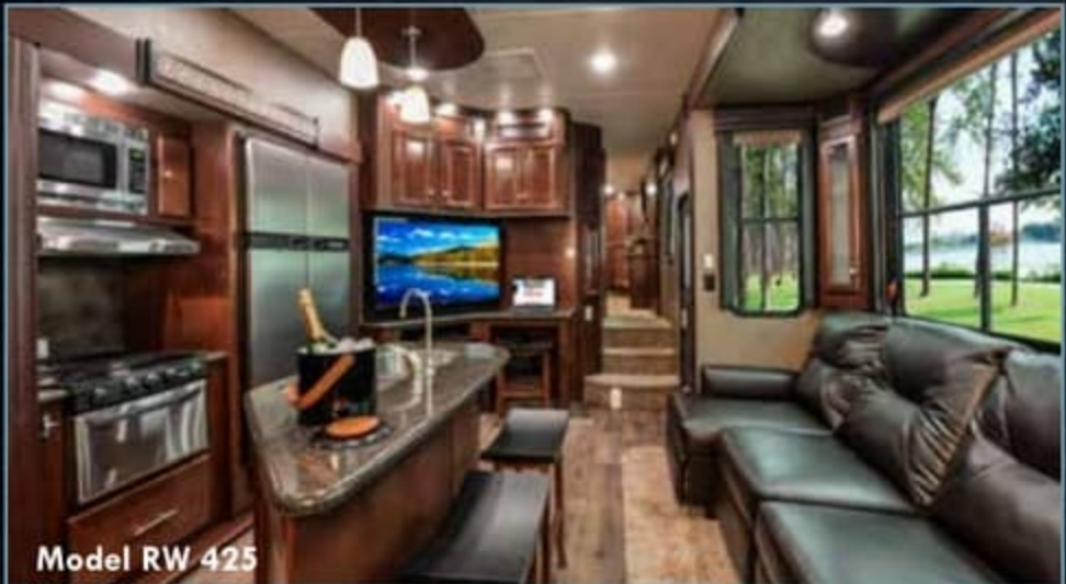
Model RW 425