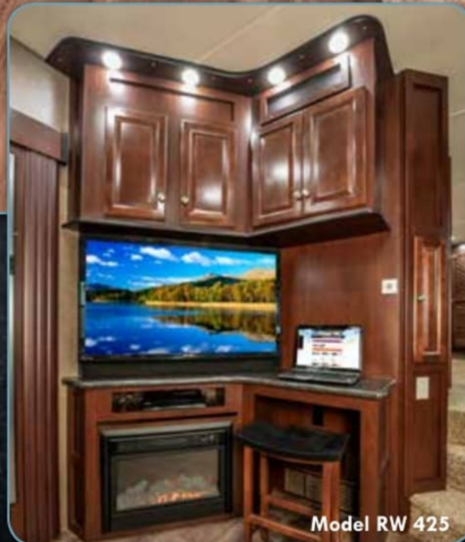
Model RW 425