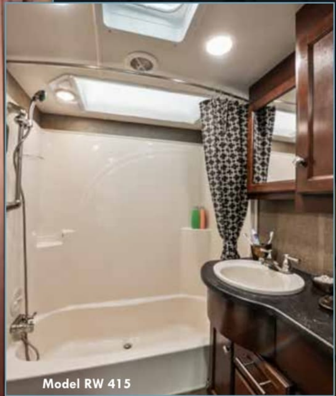
Model RW 415