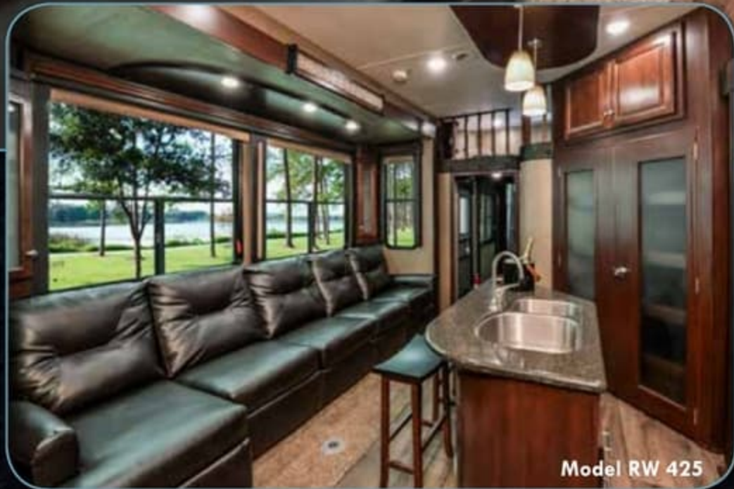
Model RW 425