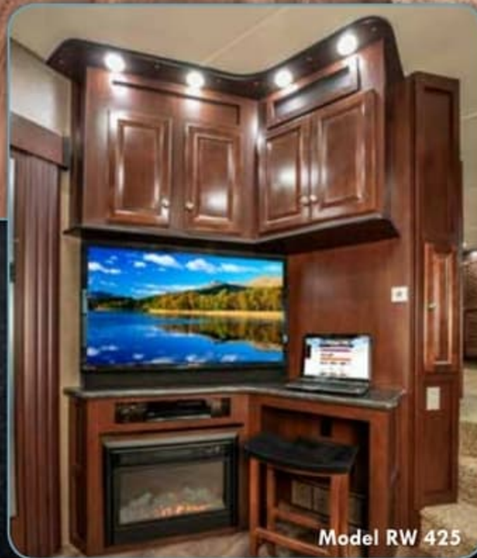
Model RW 425