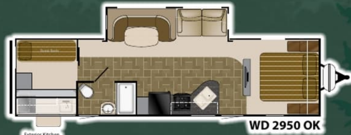
WD 2950 OK