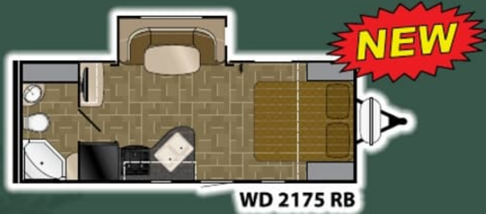
WD 2175 RB