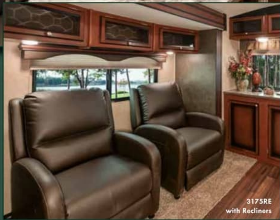
3175RE with Recliners