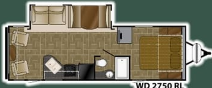
WD 2750 RL