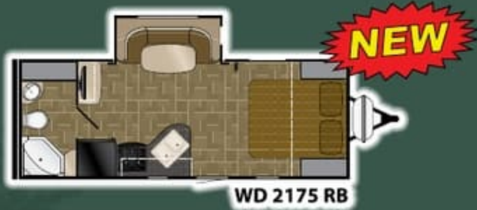
WD 2175 RB