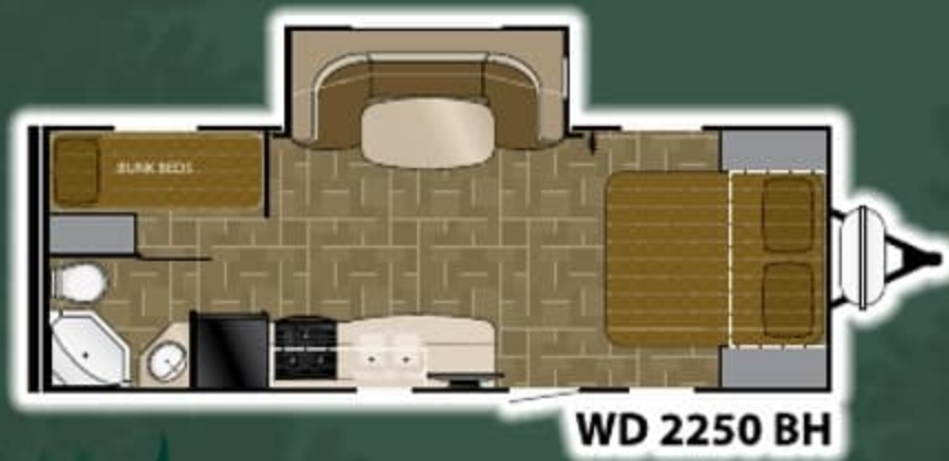
WD 2250 BH