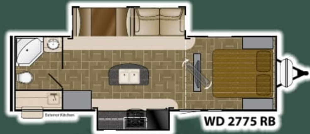
WD 2775 RB