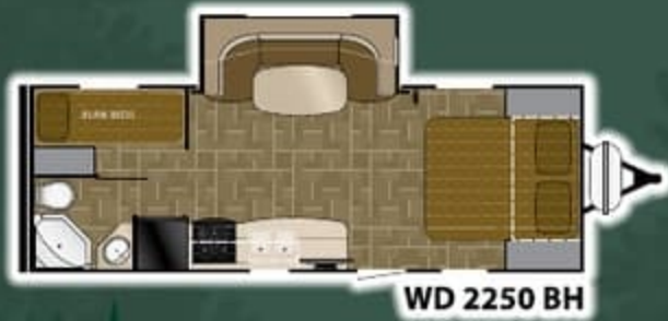
WD 2250 BH