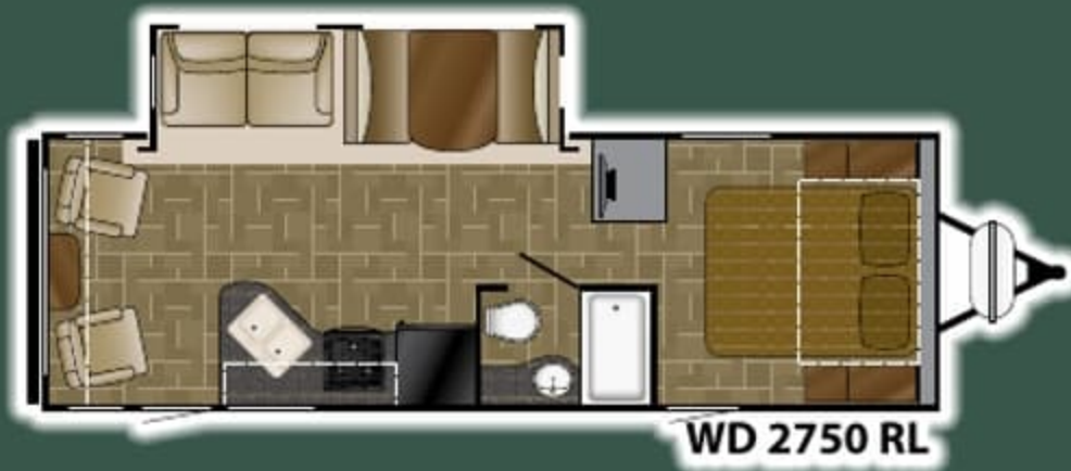
WD 2750 RL