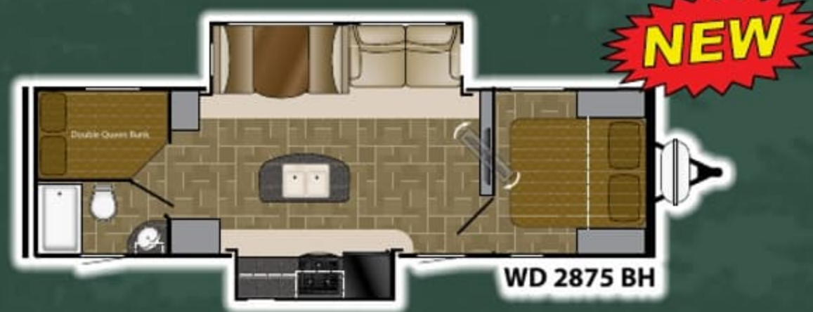
WD 2875 BH