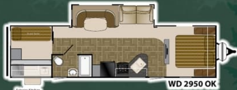
WD 2950 OK