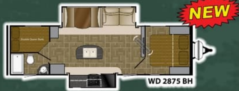
WD 2875 BH