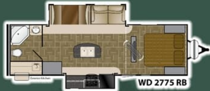
WD 2775 RB