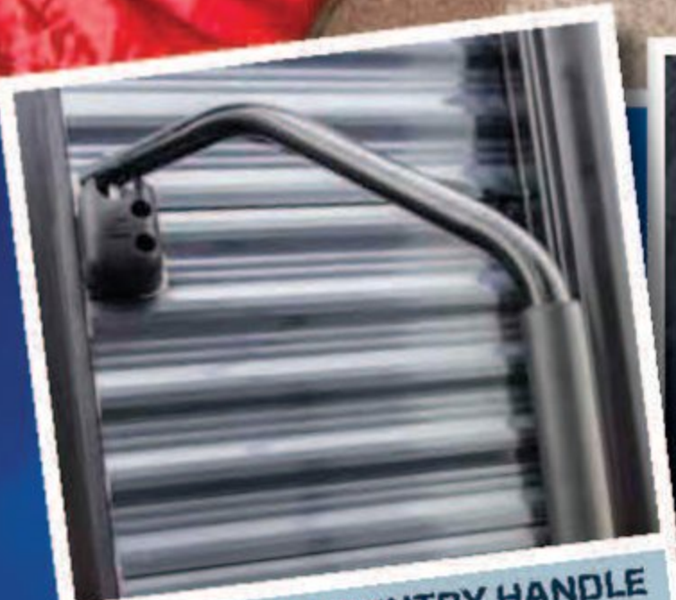
EXTRA LARGE ENTRY HANDLE Oversized non slip handle mounted with double backers for extra security