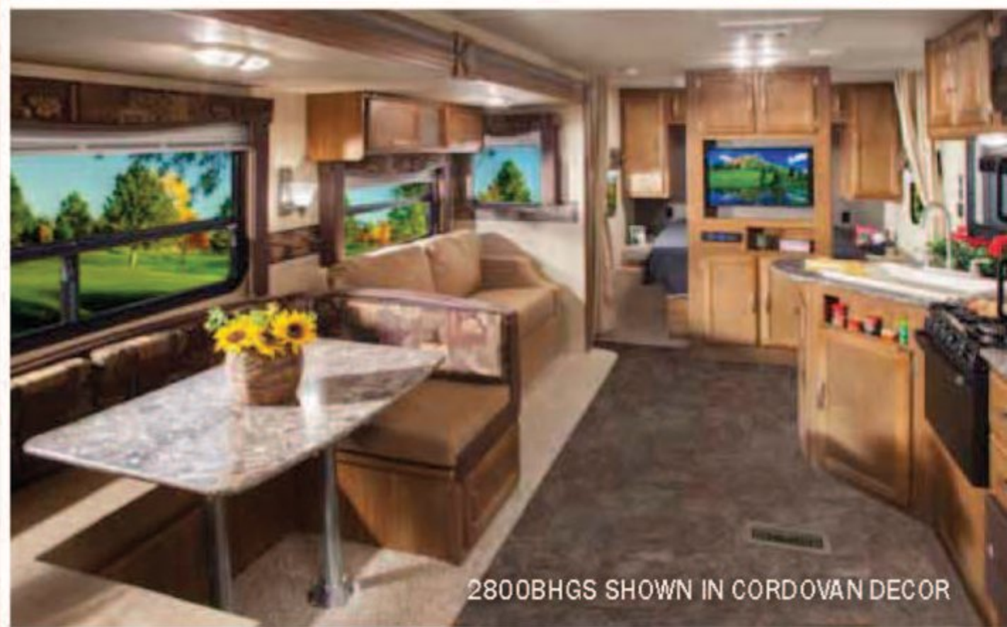
2800BHGS SHOWN IN CORDOVAN DECOR