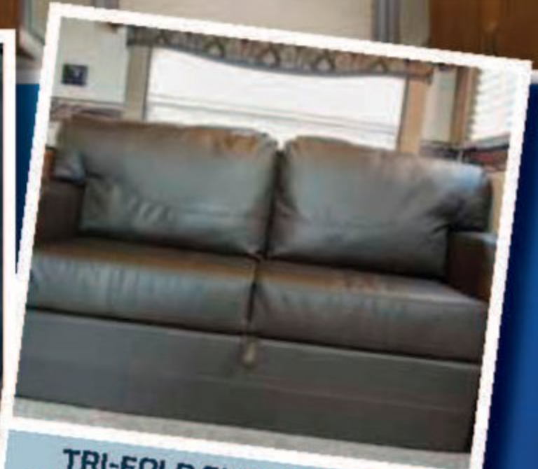
TRI-FOLD SLEEPER SOFA The fastest setup time of any sofa/sleeper & the comfort will leave your guest fighting for the bed