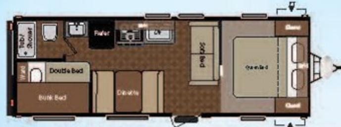
WEIGHT: 4786 LENGTH: 28' 10" ● 2600TB