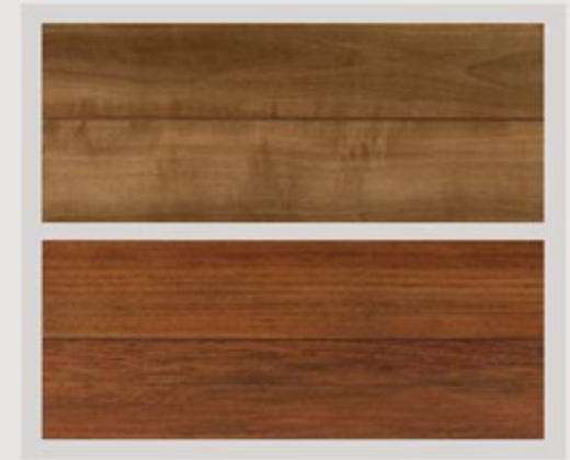
Optional Plank Flooring