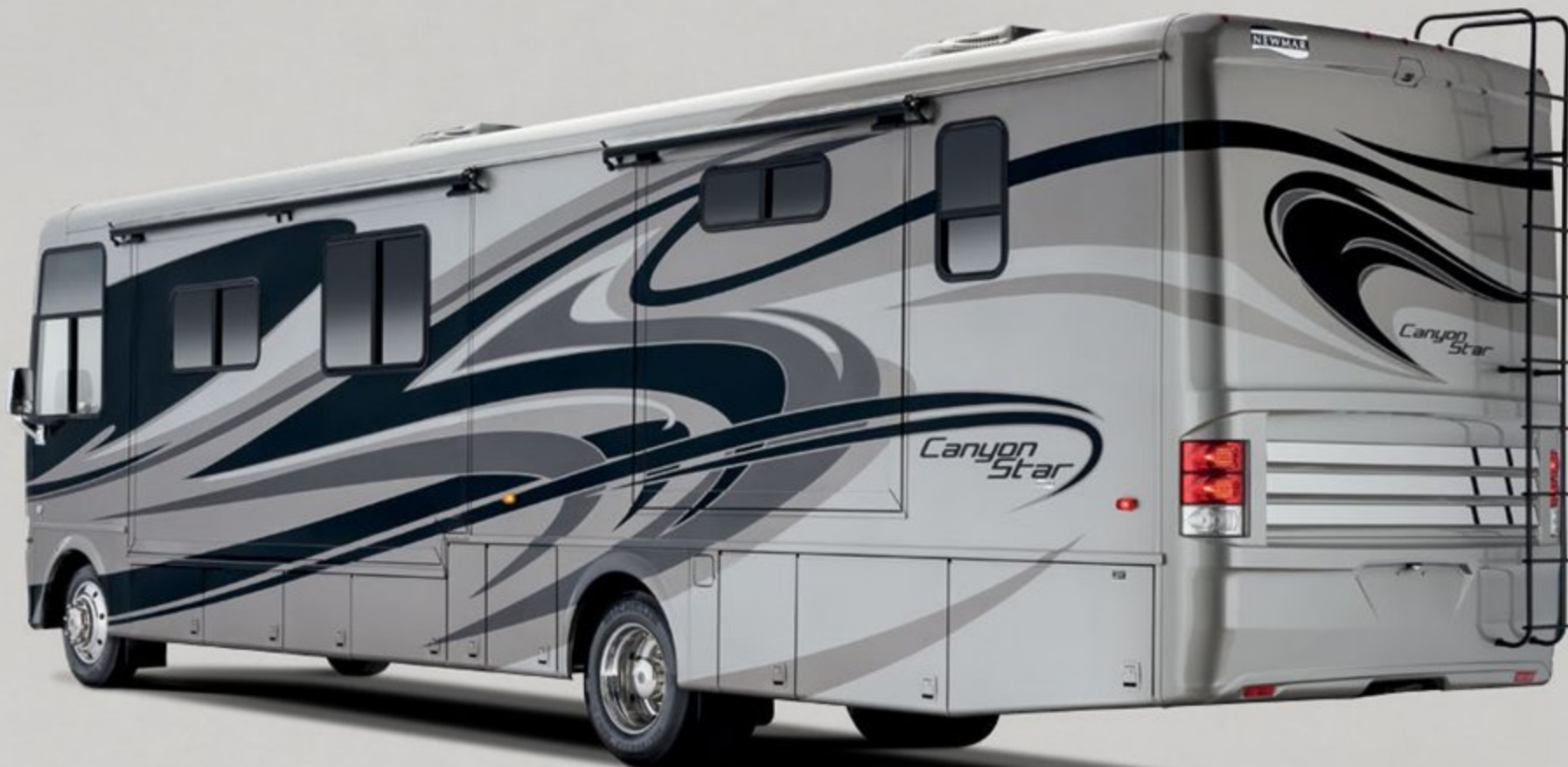
2014 Canyon Star Exterior Floor plan #3953 in Shadow Exterior