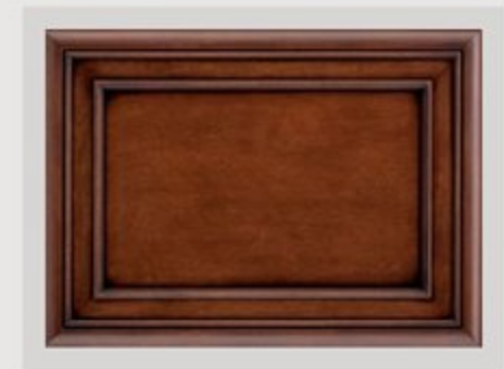
Empire/Manhattan Maple with Glazed Doors