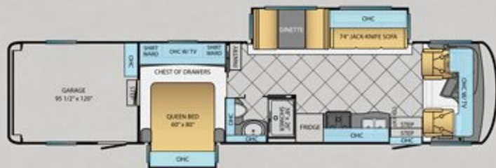
3920 TOY HAULER