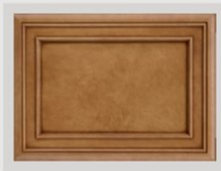
Sienna/Verona Maple with Glazed Doors