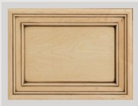
Bisque/Harvest Maple with Glazed Doors