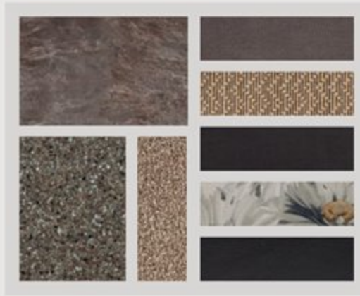
Thunder Bay Interior