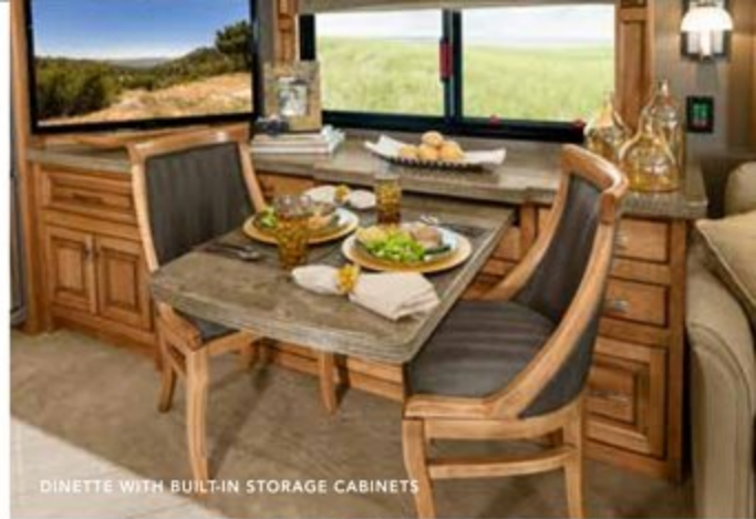
DINETTE WITH BUILT-IN STORAGE CABINETS

SHOWN 45 T2 FLOOR PLAN SONATA FABRIC SUITE WITH GLAZED CHERRY CABINETS