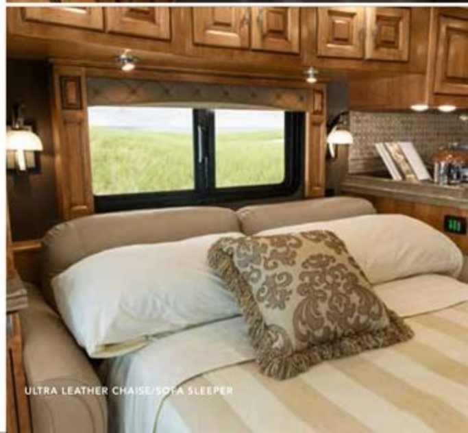
ULTRA LEATHER CHAISE/SOFA SLEEPER