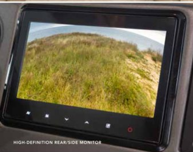
HIGH-DEFINITION REAR/SIDE MONITOR