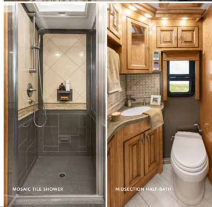
MOSAIC TILE SHOWER