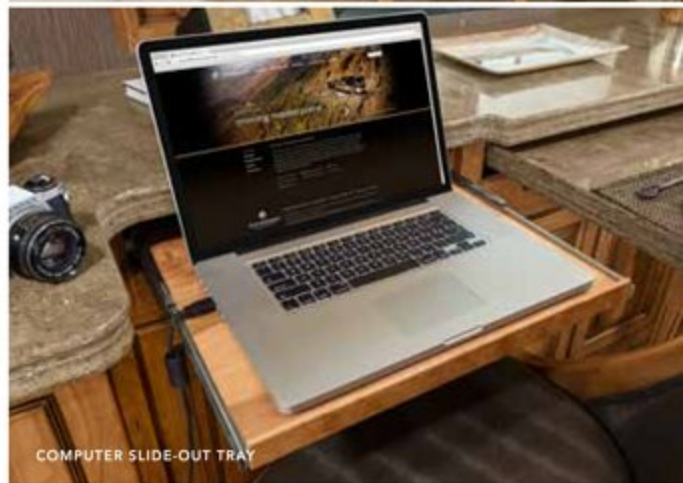
COMPUTER SLIDE-OUT TRAY