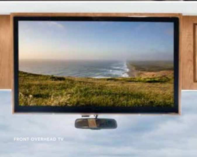
FRONT OVERHEAD TV