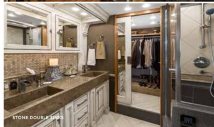
STONE DOUBLE SINKS