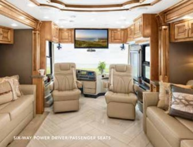
SIX-WAY POWER DRIVER/PASSENGER SEATS