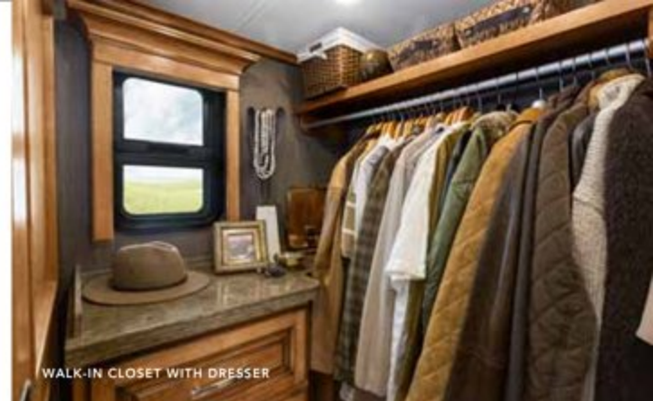
WALK-IN CLOSET WITH DRESSER

SHOWN 45 T2 FLOOR PLAN SONATA FABRIC SUITE WITH GLAZED CHERRY CABINETS