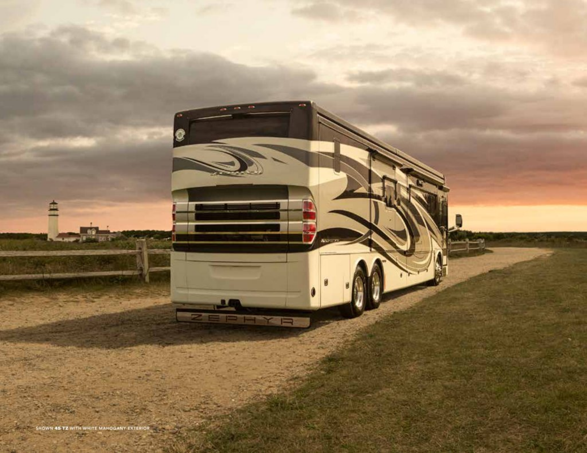
SHOWN 45 TZ WITH WHITE MAHOGANY EXTERIOR