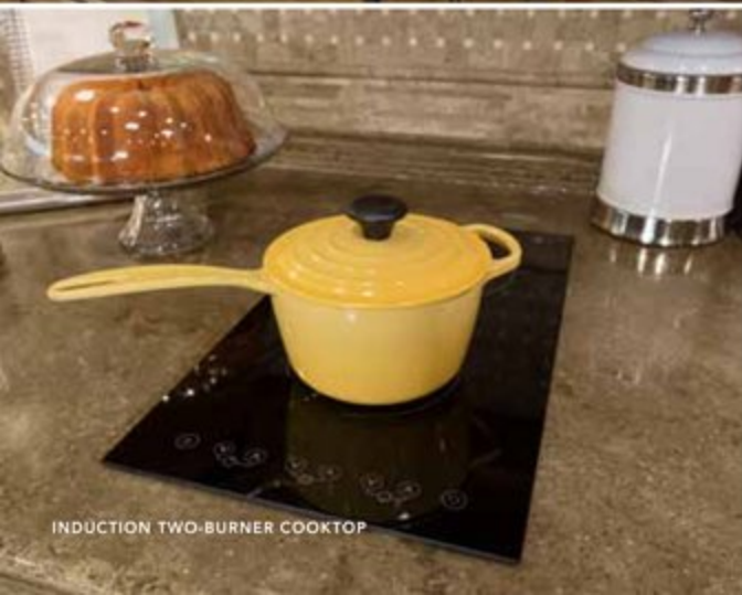
INDUCTION TWO-BURNER COOKTOP