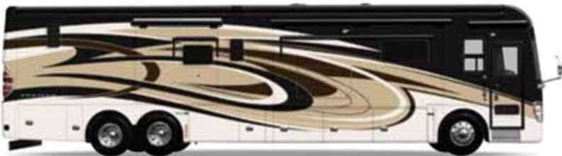
ROCKY MOUNTAIN BROWN