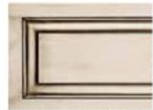
WHITE CHOCOLATE (BATH)*