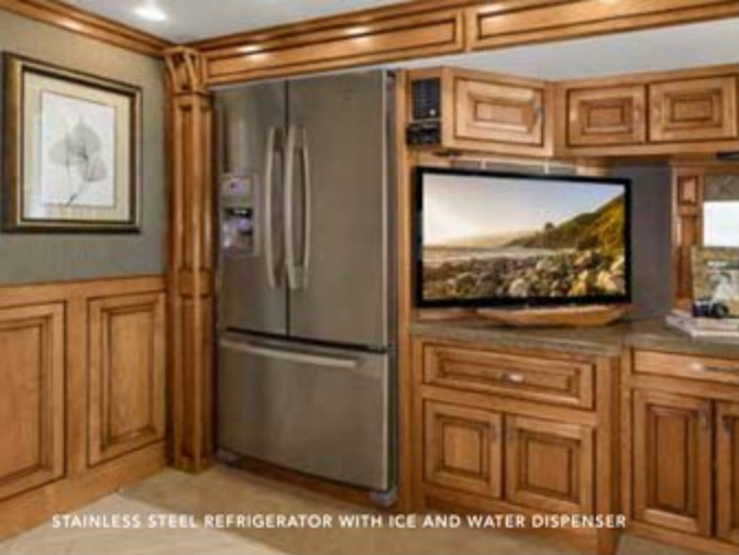
STAINLESS STEEL REFRIGERATOR WITH ICE AND WATER DISPENSER