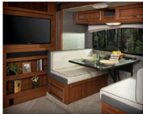
BOUNDER CLASSIC 36H SHOWN IN WINTER HAVEN DECOR WITH SPICE WOOD CABINETRY