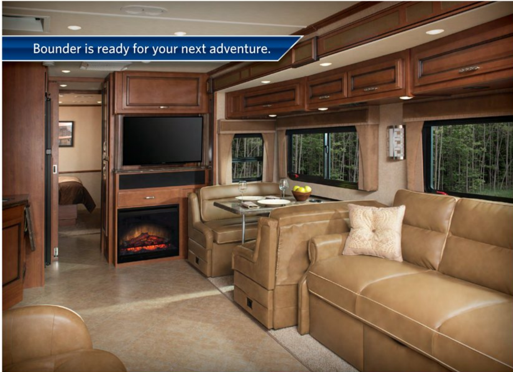
BOUNDER 34T SHOWN IN CARAMEL KISS DÉCOR WITH SPICE WOOD CABINETRY

Bounder is ready for your next adventure.