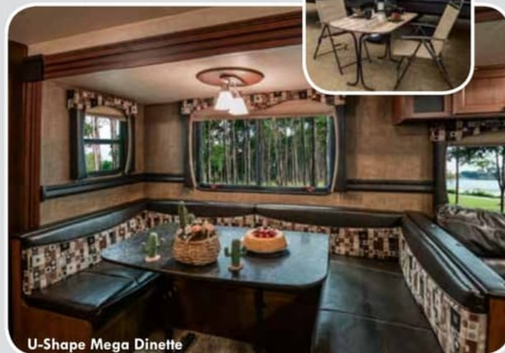
U-Shape Mega Dinette