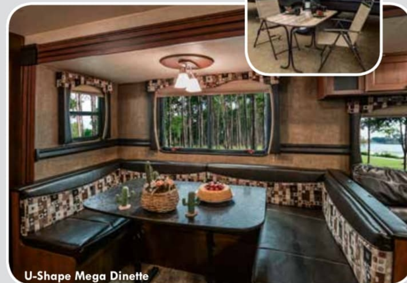
U-Shape Mega Dinette