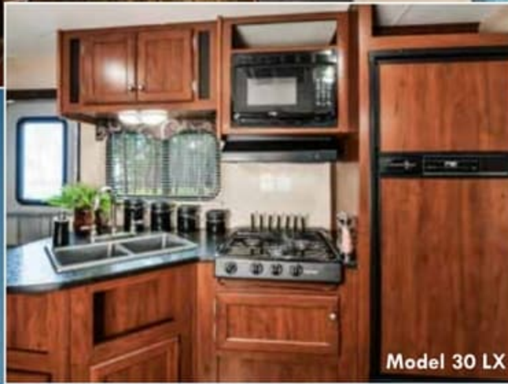
Model 30 LX