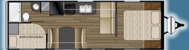
PROWLER LYNX 25 LX