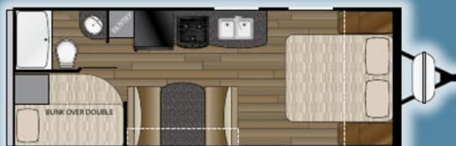
PROWLER LYNX 22 LX