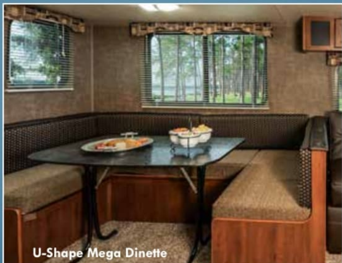
U-Shape Mega Dinette