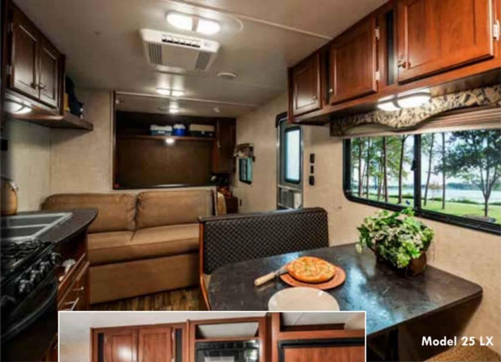
Model 25 LX