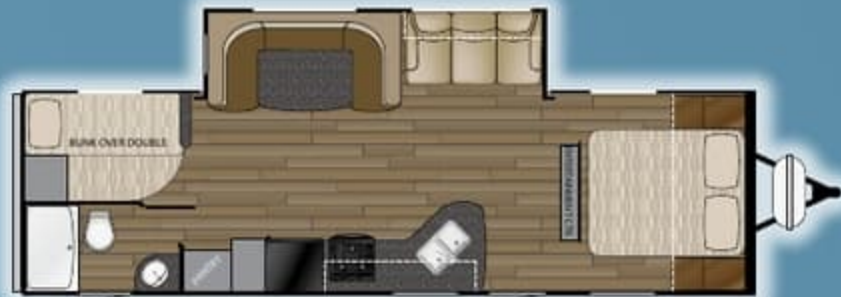
PROWLER LYNX 285 LX