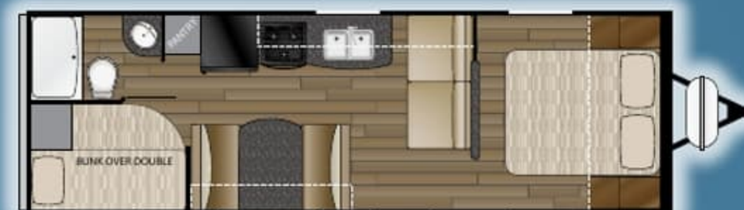
PROWLER LYNX 25 LX