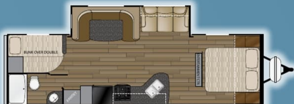
PROWLER LYNX 285 LX