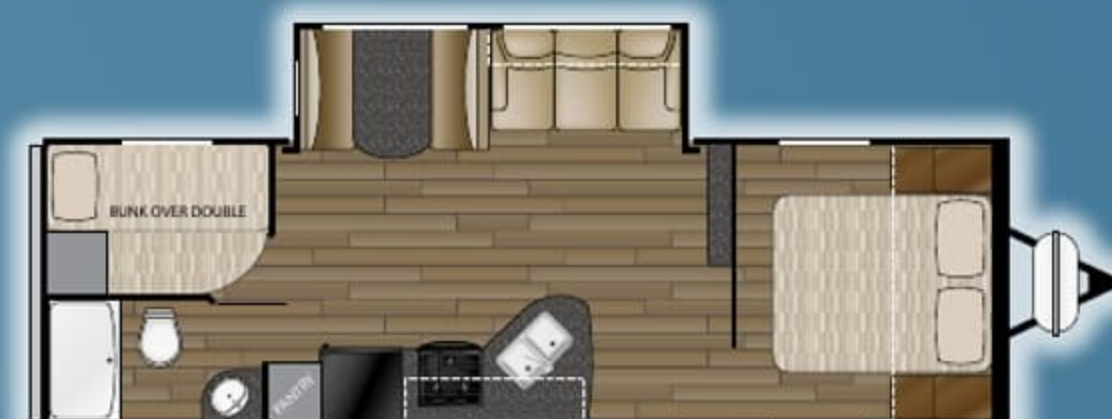
PROWLER LYNX 27 LX