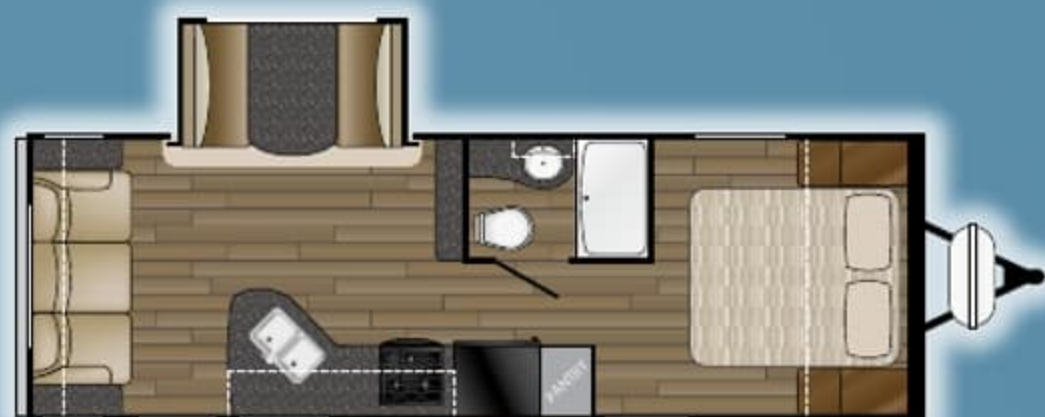
PROWLER LYNX 26 LX