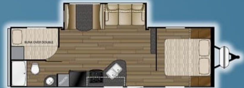
PROWLER LYNX 27 LX