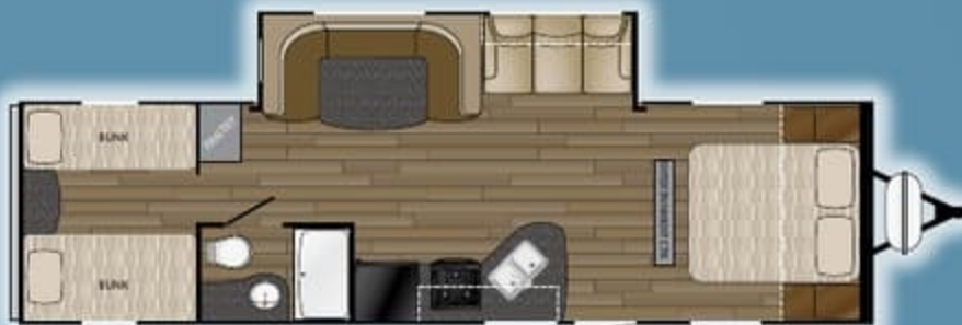
PROWLER LYNX 30 LX