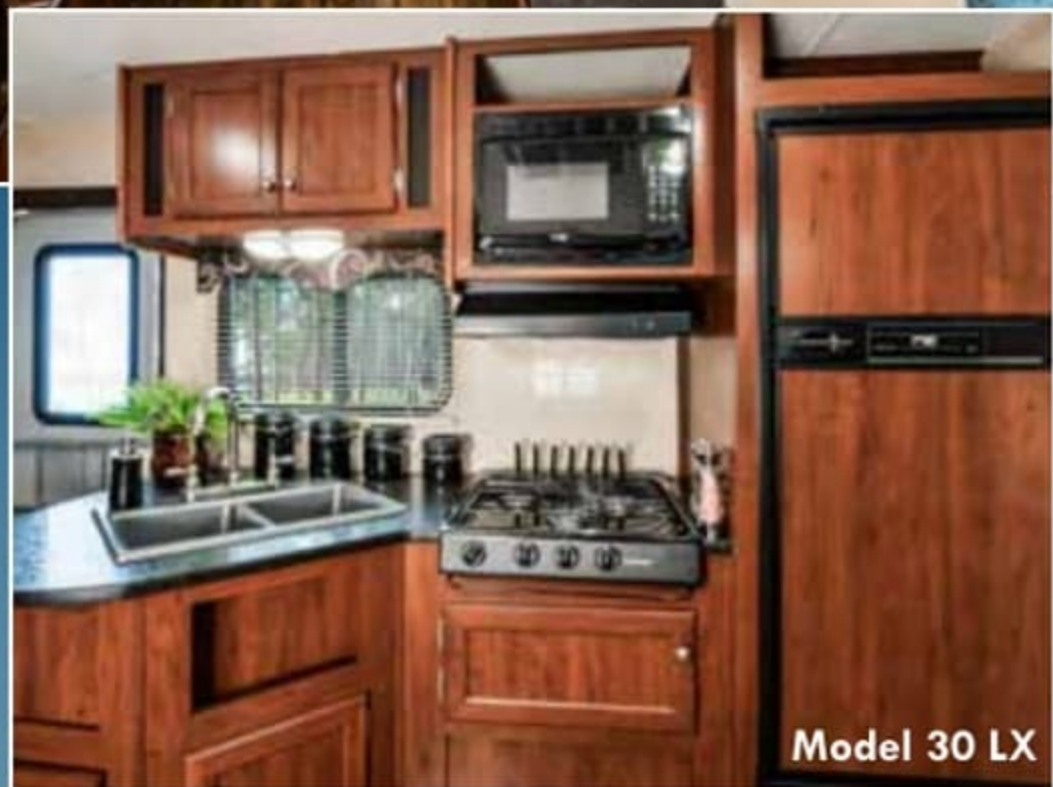
Model 30 LX