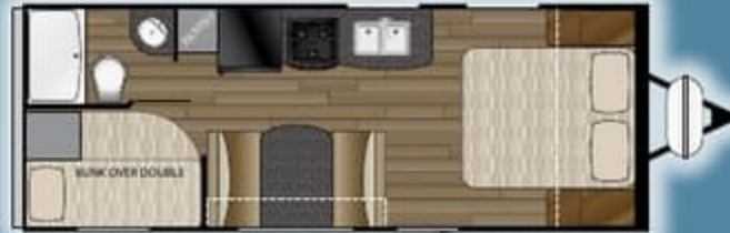
PROWLER LYNX 22 LX