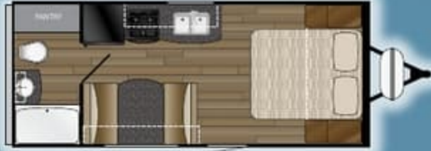
PROWLER LYNX 18 LX