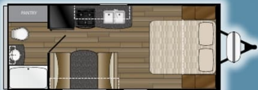
PROWLER LYNX 18 LX