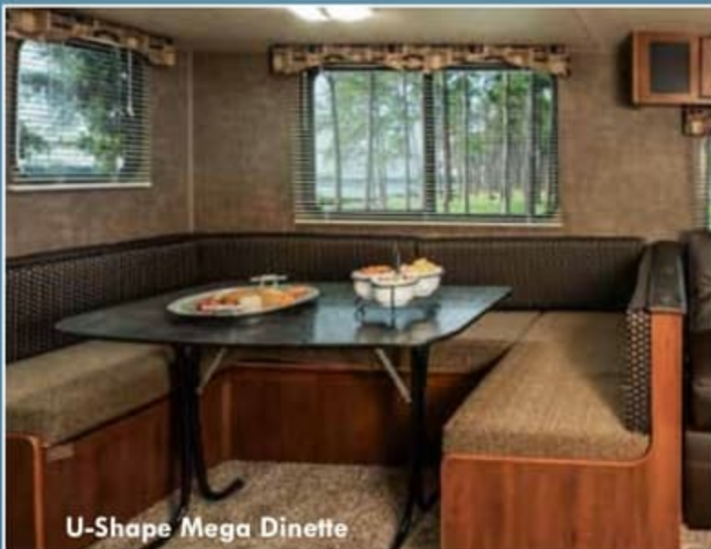
U-Shape Mega Dinette