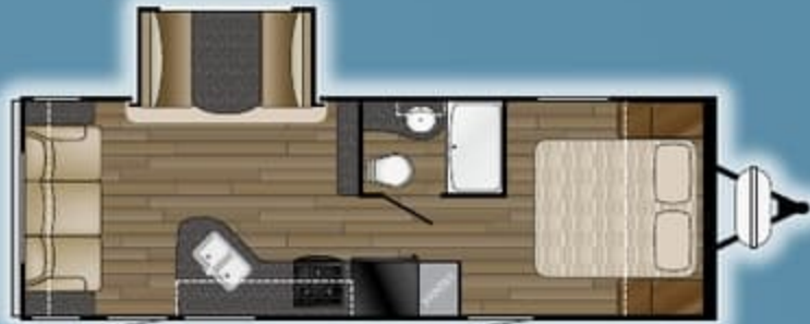
PROWLER LYNX 26 LX