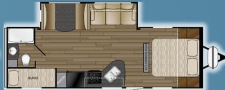
PROWLER LYNX 265 LX