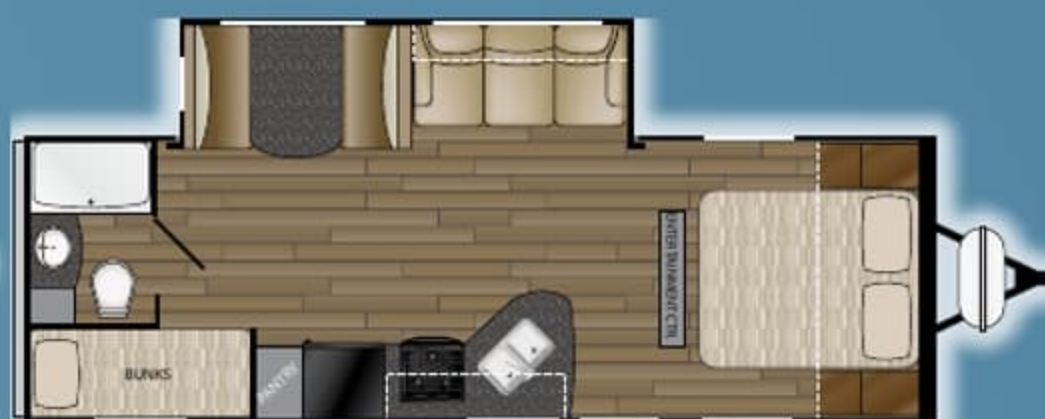
PROWLER LYNX 265 LX