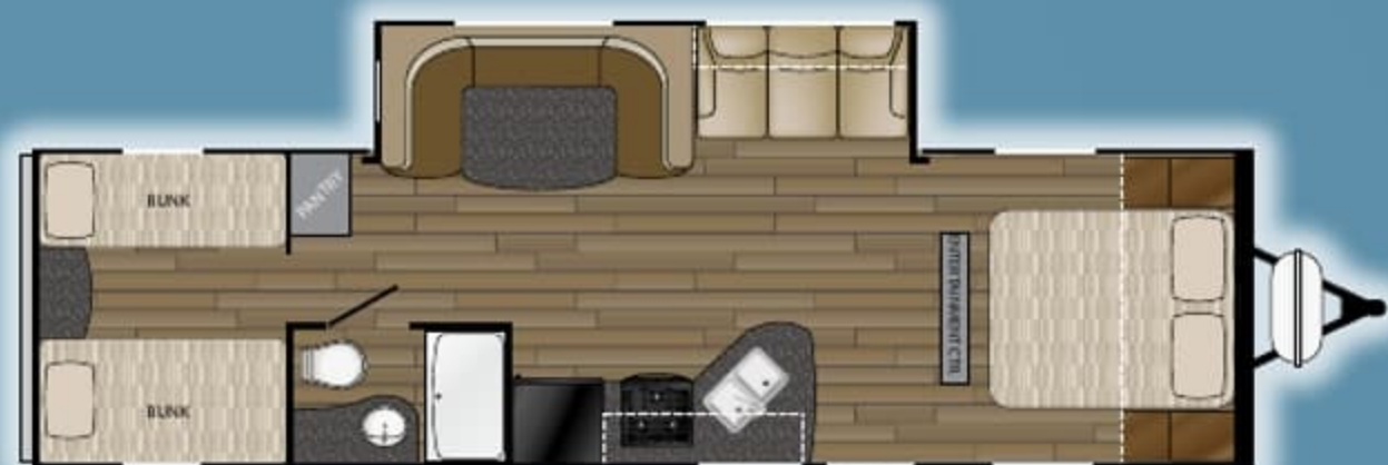
PROWLER LYNX 30 LX