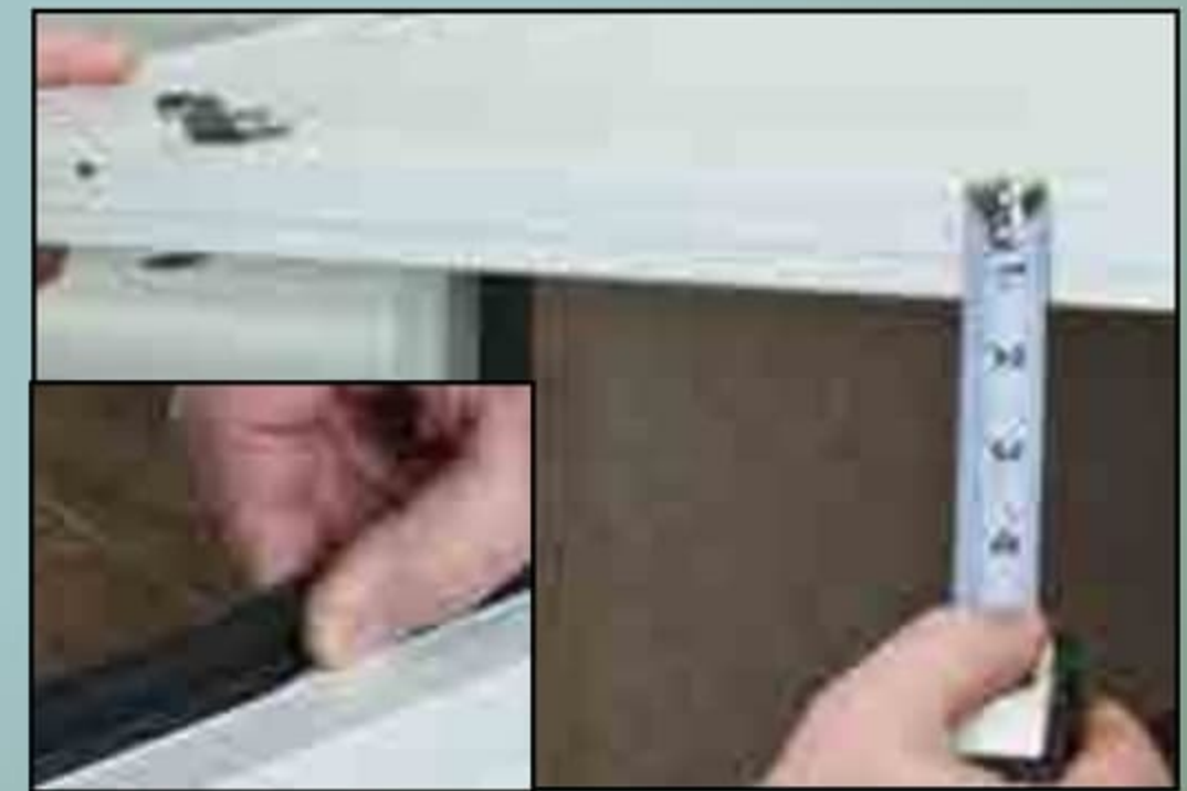
Thick insulated baggage doors with seamless aluminum door frame, no visible mounting screws and rubber seals protect your cargo.