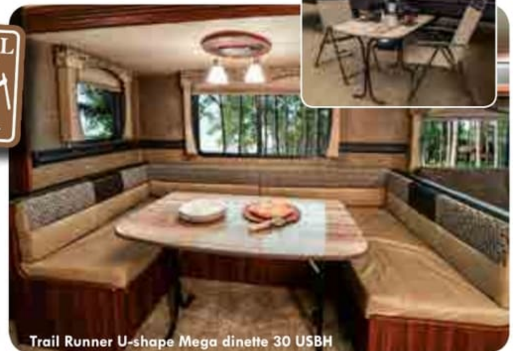
Trail Runner U-shape Mega dinette 30 USBH