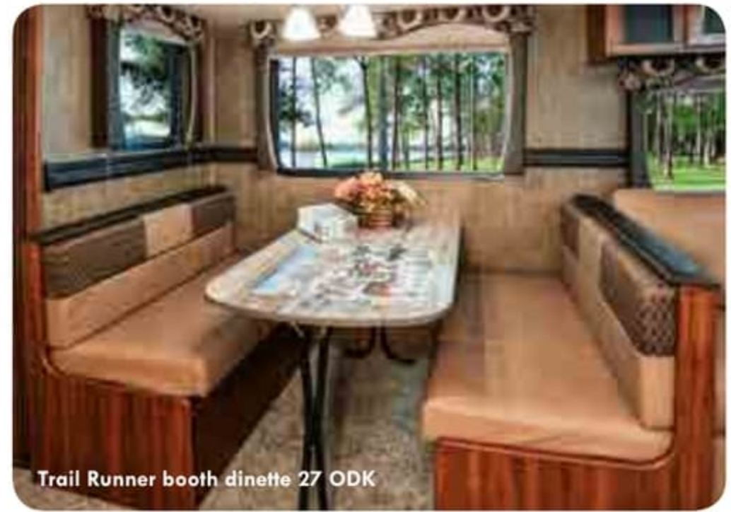
Trail Runner booth dinette 27 ODK