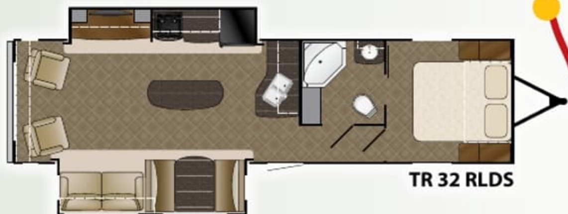
TR 32 RLDS