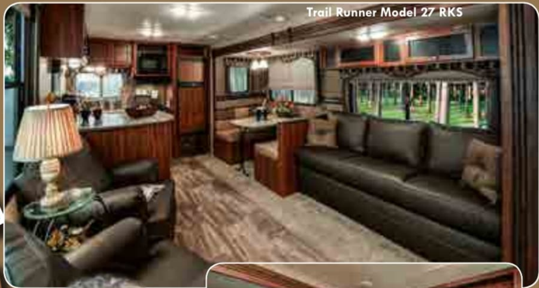
Trail Runner Model 27 RKS