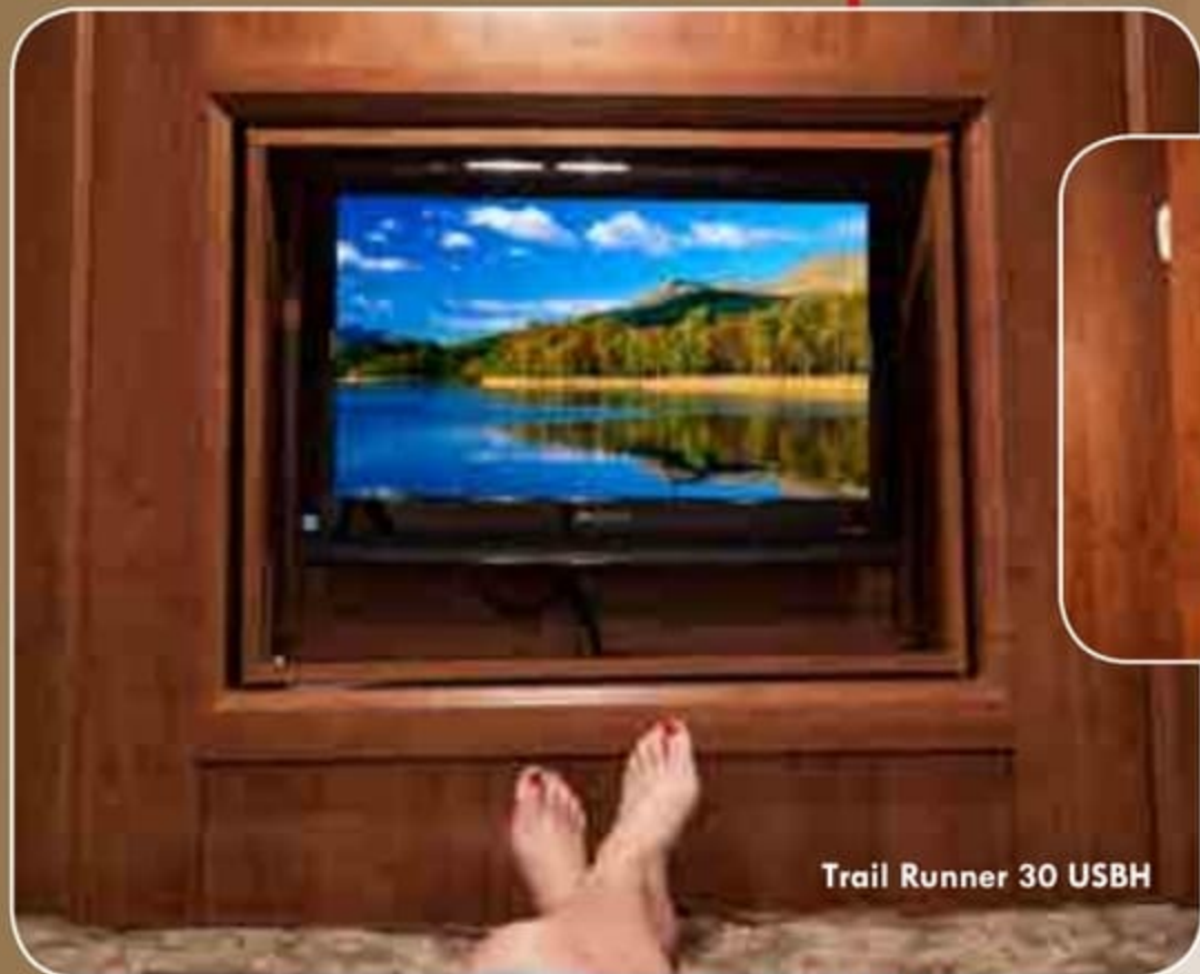
Trail Runner 30 USBH