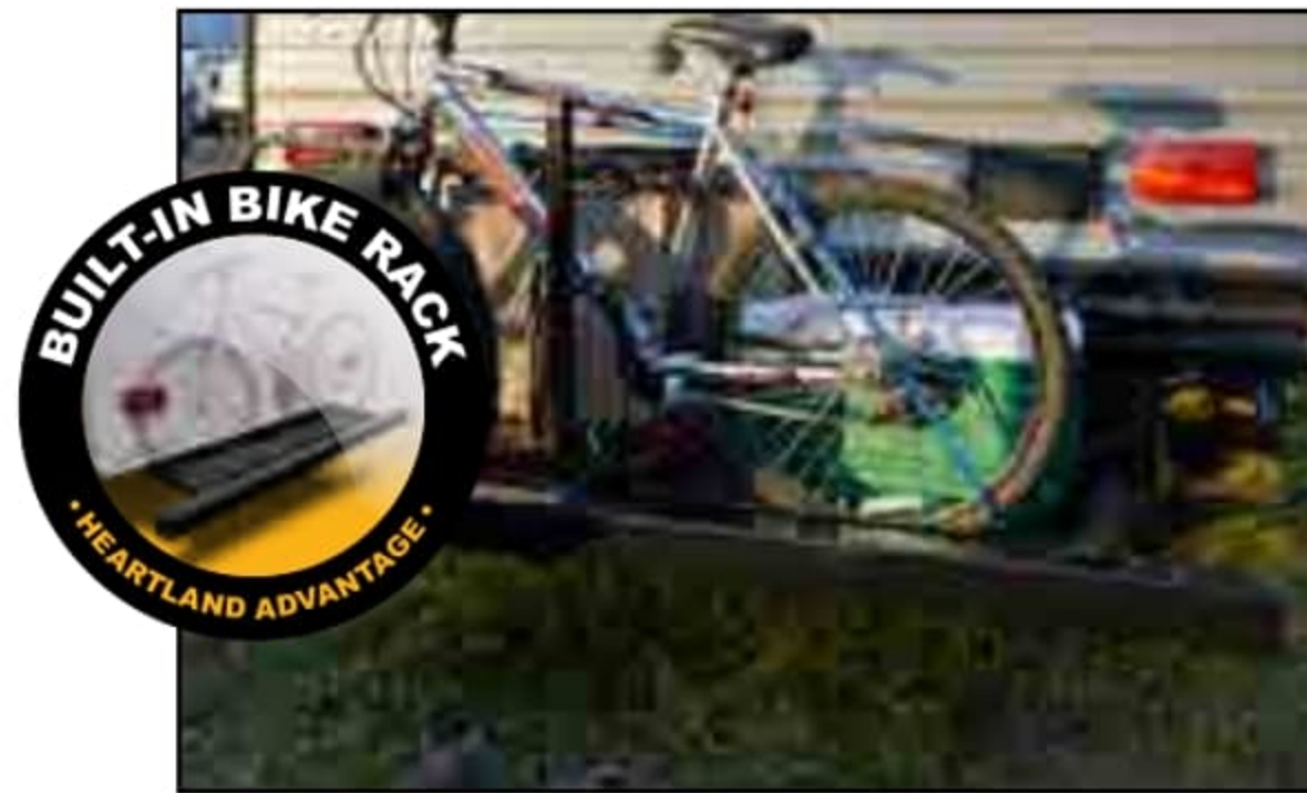
The optional bumper pull-out bike rack is great for bikes, chairs, coolers and any other bulky items you wish to take along on vacation.