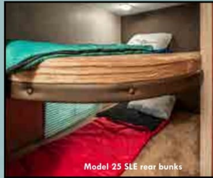
Model 25 SLE rear bunks

Trail Runner Super Lite Edition (SLE) raises the bar while lowering the weight. Always focused on livability and affordability Trail Runner now offers the Super Lite Edition focusing on lightweight towability. All the quality and features you expect from Trail Runner in a lighter weight package.