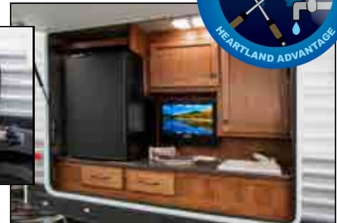
Outdoor kitchens are available on select models and feature a mini refrigerator, sink, gas grill, counter space and storage for all your patio dining needs.