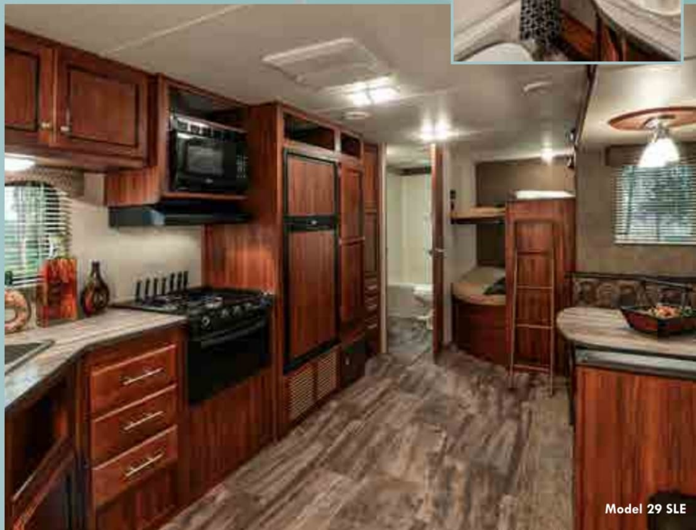
Model 29 SLE