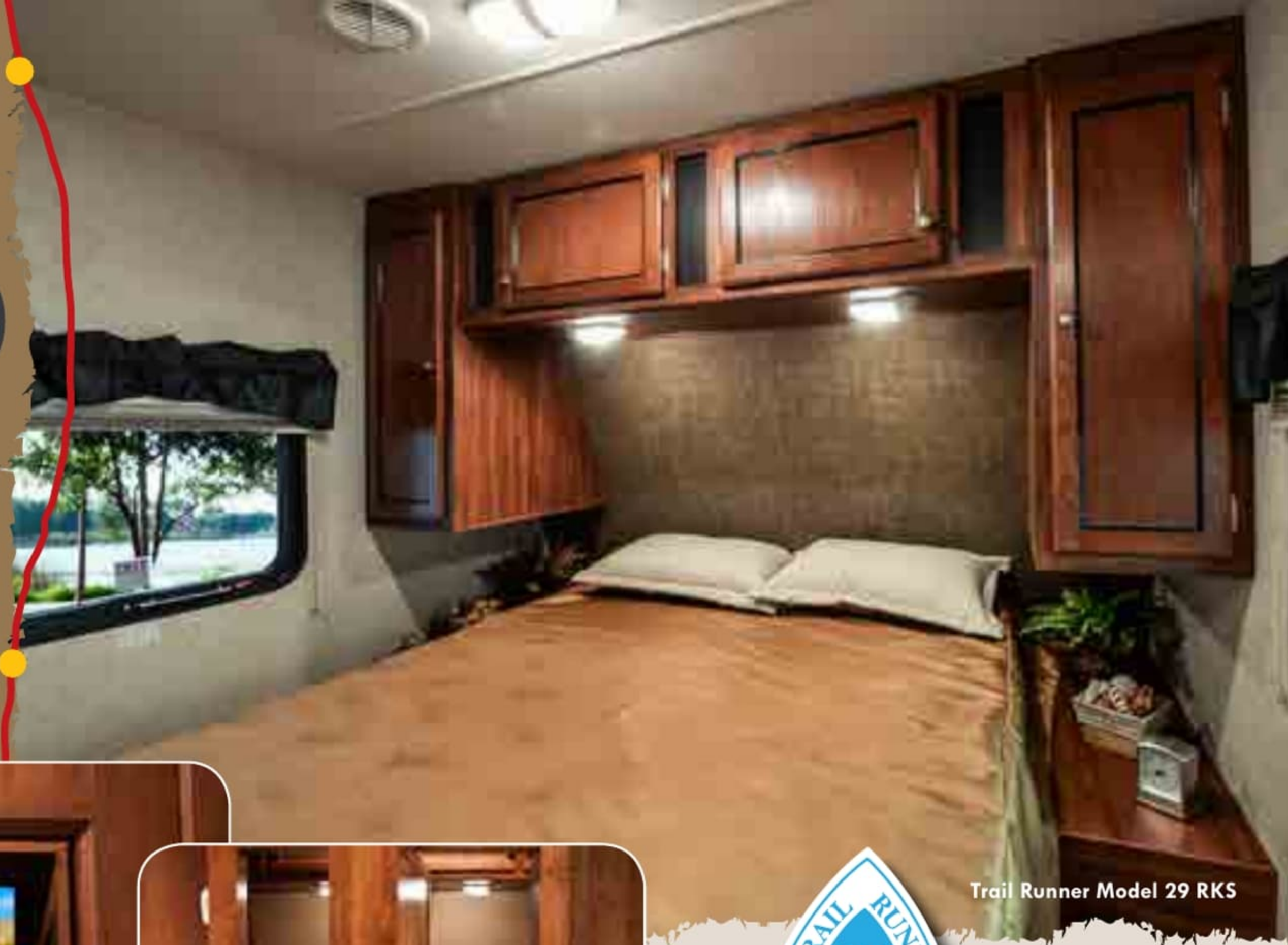
Trail Runner Model 29 RKS

ROOMY BEDROOMS and STORAGE GALORE Large beds and room to get around them make TRAIL RUNNER bedrooms comfortable and very livable. Nightstands, wardrobes, overhead cabinets and underbed compartment provides you with plenty of storage. Our rotating TV cabinet allows you to start your movie in the living room and finish it tucked in for bed.