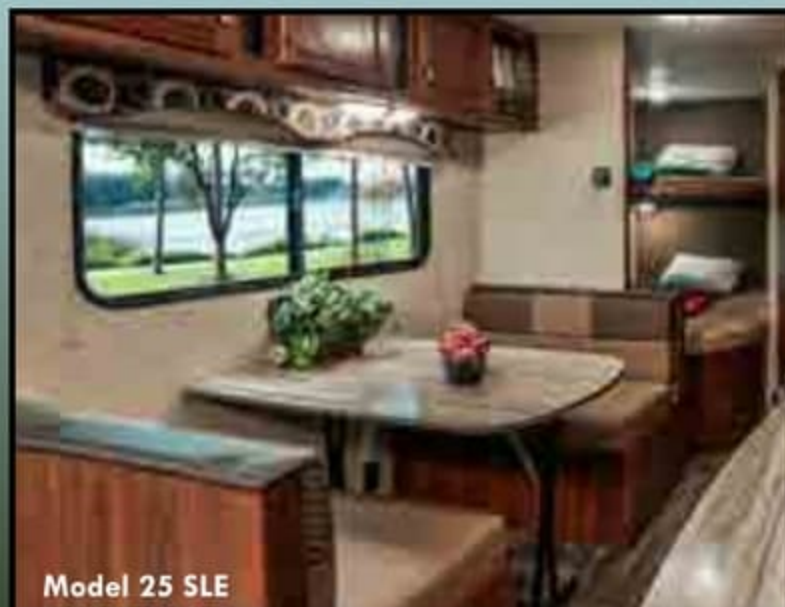
Model 25 SLE