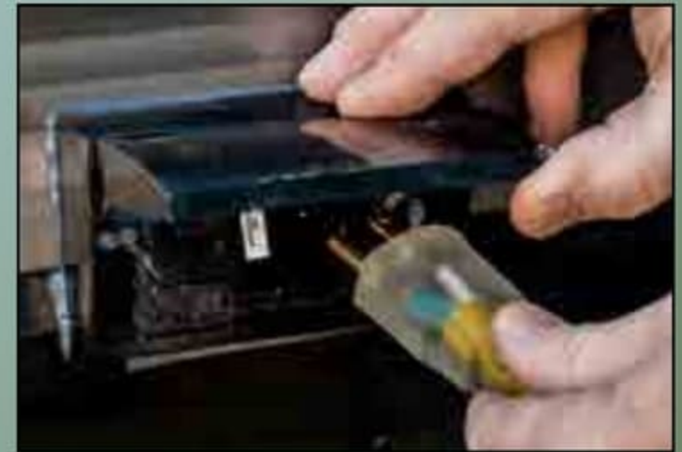
Convenient Outside GFCI Protected and Covered Outlet.