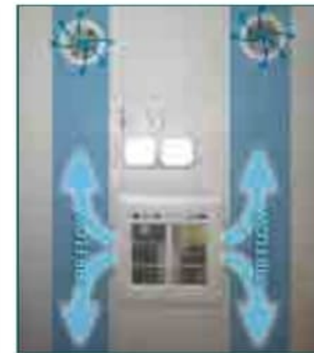
The H-ducted A/C distributes the cool air evenly throughout the travel trailer.