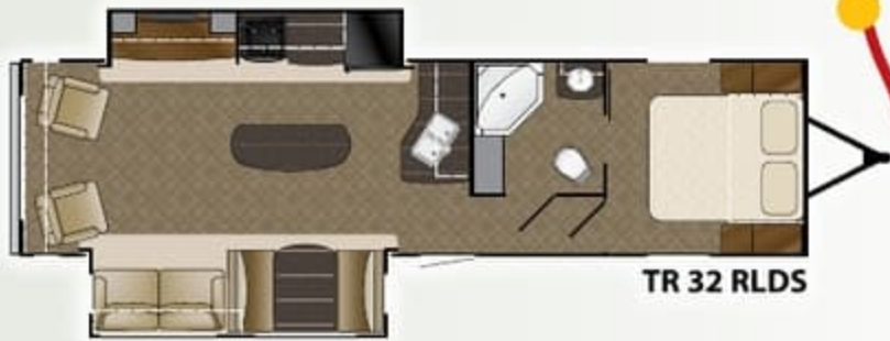
TR 32 RLDS