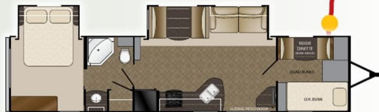
TR 39 QBBH