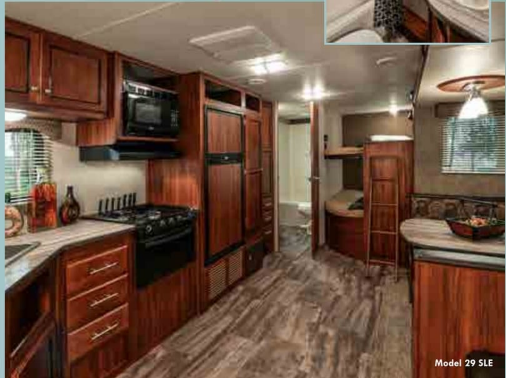
Model 29 SLE