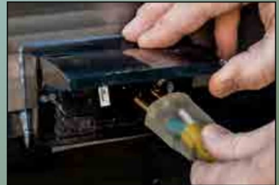
Convenient Outside GFCI Protected and Covered Outlet.

Preserving our environment is very important to HEARTLAND. We strive to reduce, reuse and recycle in every facet of the corporation. We are reducing paper waste with new electronic processing, our vendor partners reuse packaging and crating for many components and we recycle all aluminum scrap, wood cutoffs, skids, wire, cardboard and plastic containers. Heartland is doing our part to preserve the environment so you and your children's children can enjoy RVing for years to come.