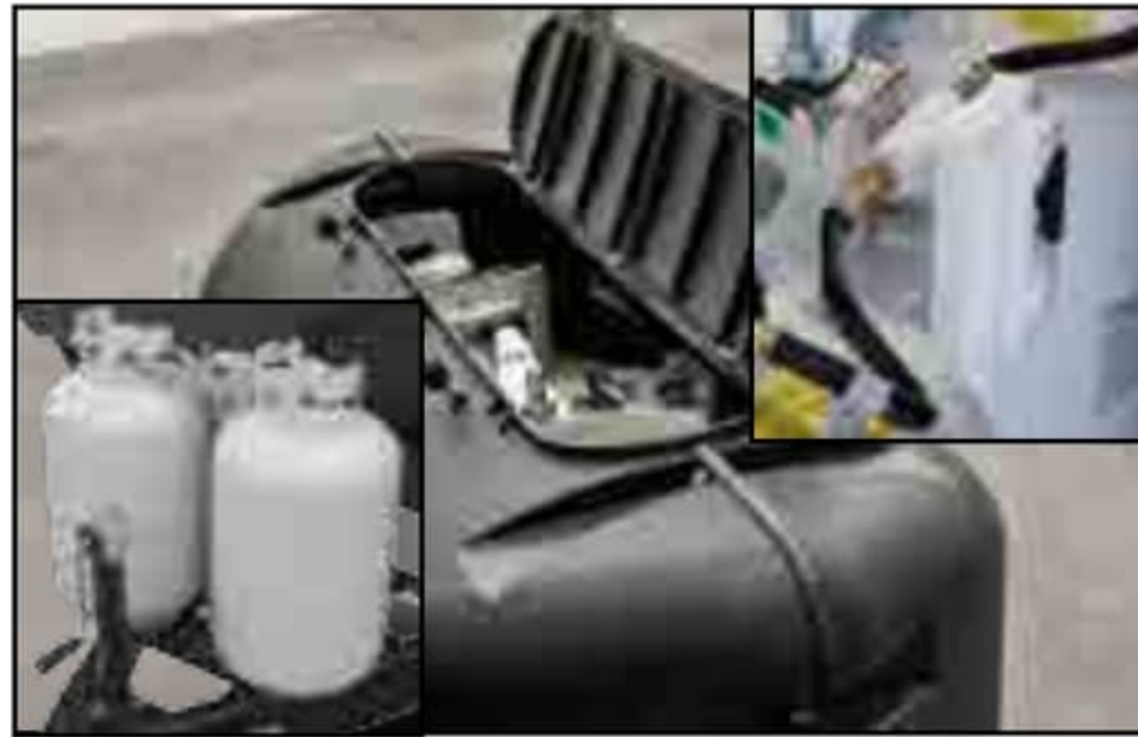
30# LP Bottles and cover with easy access to auto changeover valve.