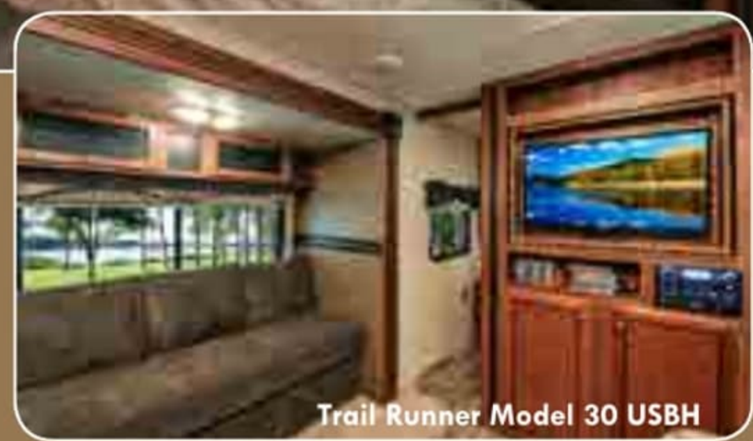
Trail Runner Model 30 USBH