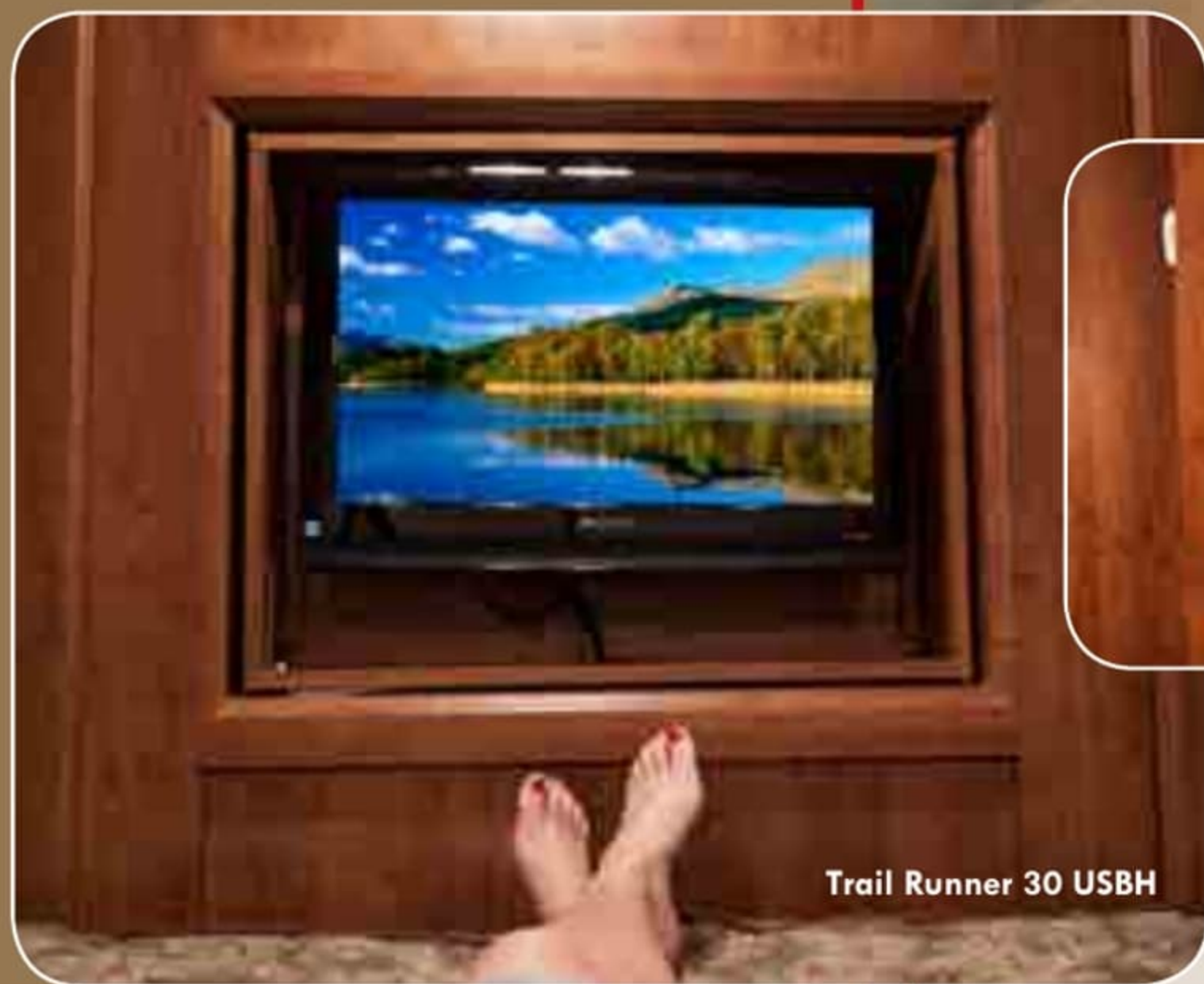
Trail Runner 30 USBH