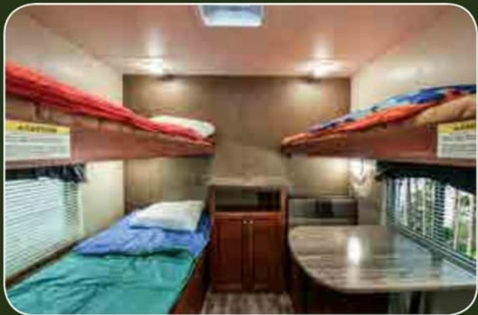
Trail Runner Model 30 USBH

floorplans are also offered in different configurations to conform to your specific wants and needs.