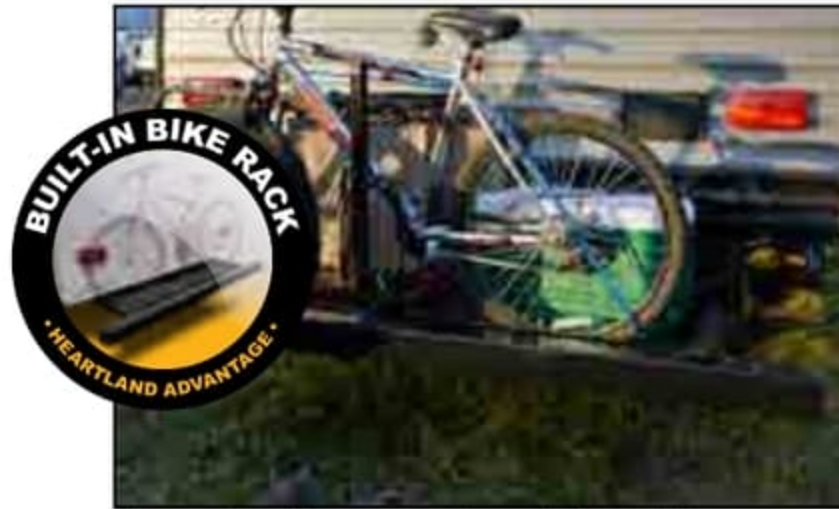
The optional bumper pull-out bike rack is great for bikes, chairs, coolers and any other bulky items you wish to take along on vacation.