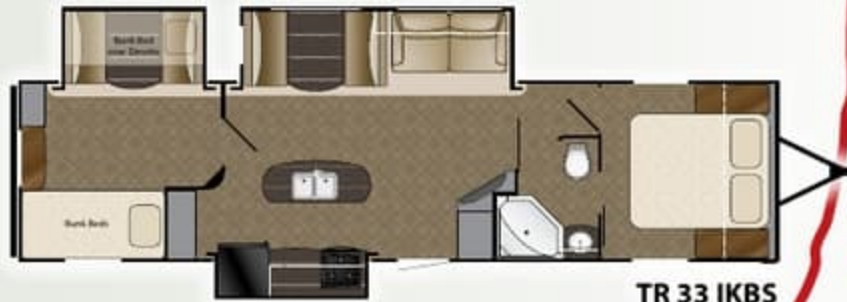
TR 33 IKBS