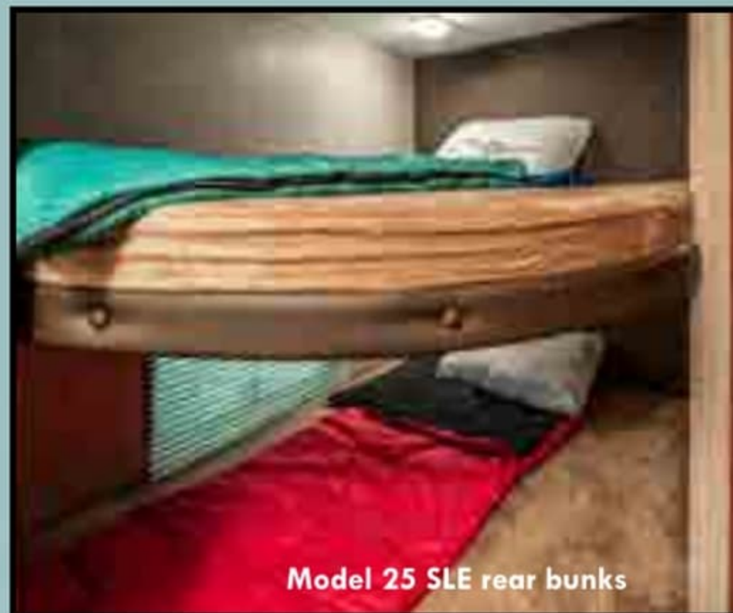
Model 25 SLE rear bunks

Trail Runner Super Lite Edition (SLE) raises the bar while lowering the weight. Always focused on livability and affordability Trail Runner now offers the Super Lite Edition focusing on lightweight towability. All the quality and features you expect from Trail Runner in a lighter weight package.