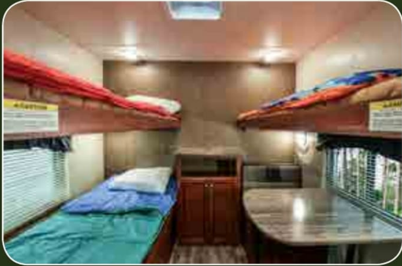
Trail Runner Model 30 USBH

floorplans are also offered in different configurations to conform to your specific wants and needs.