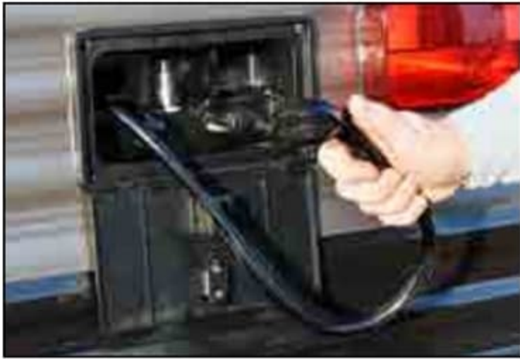
Outside Shower with hot and cold water.