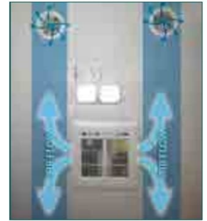
The H-ducted A/C distributes the cool air evenly throughout the travel trailer.