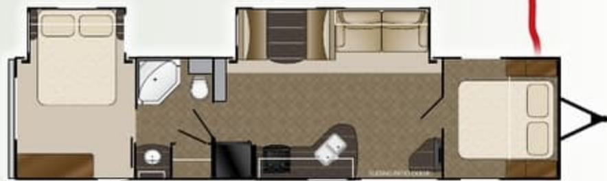
TR 39 FQBS