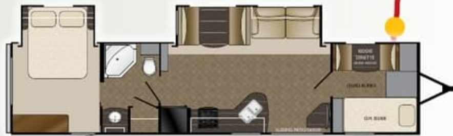
TR 39 QBBH