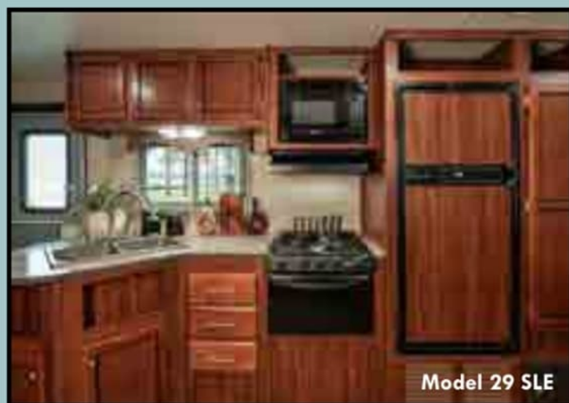
Model 29 SLE