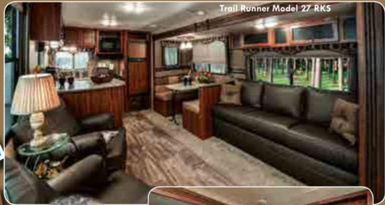
Trail Runner Model 27 RKS