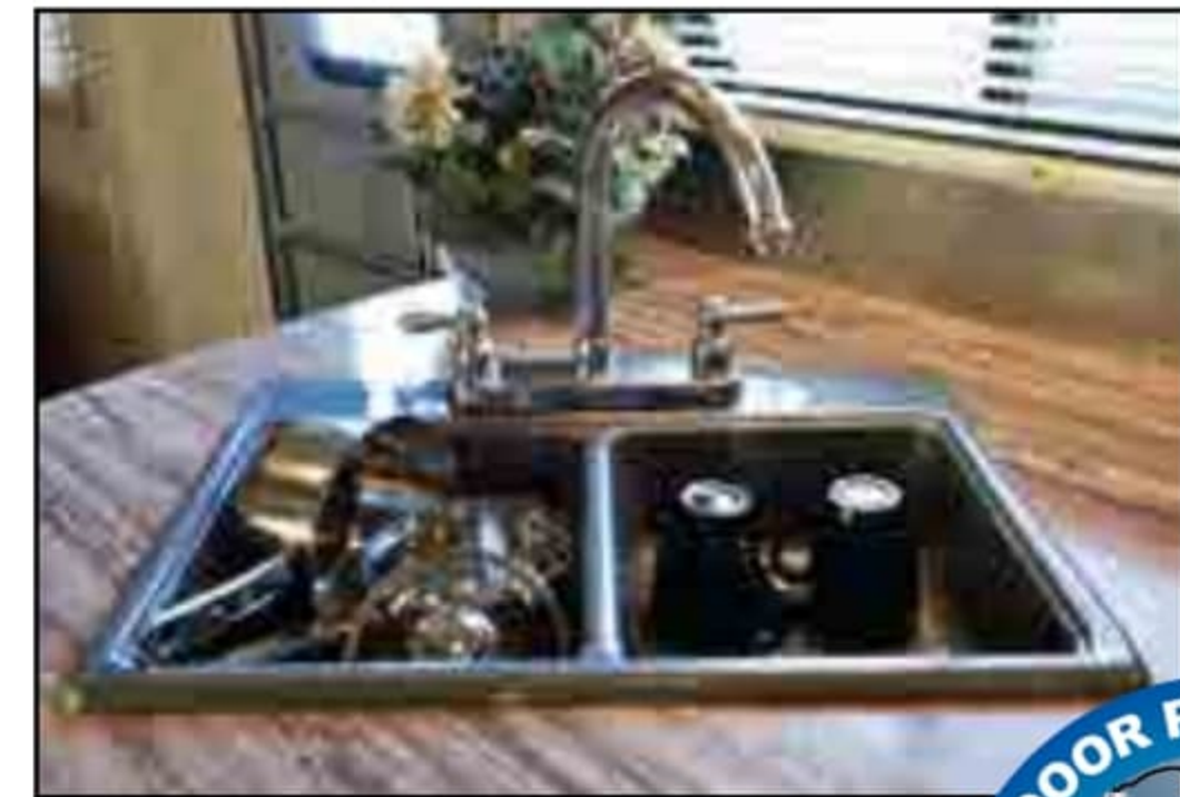
Deep 50/50 double sink with a high-rise faucet.