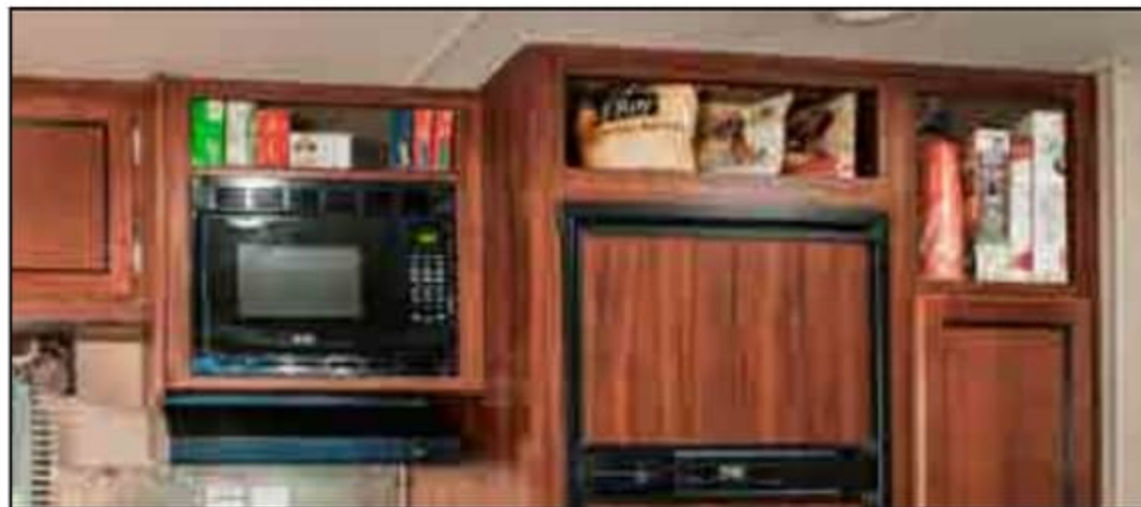
Trail Runner maximizes available space for storage....