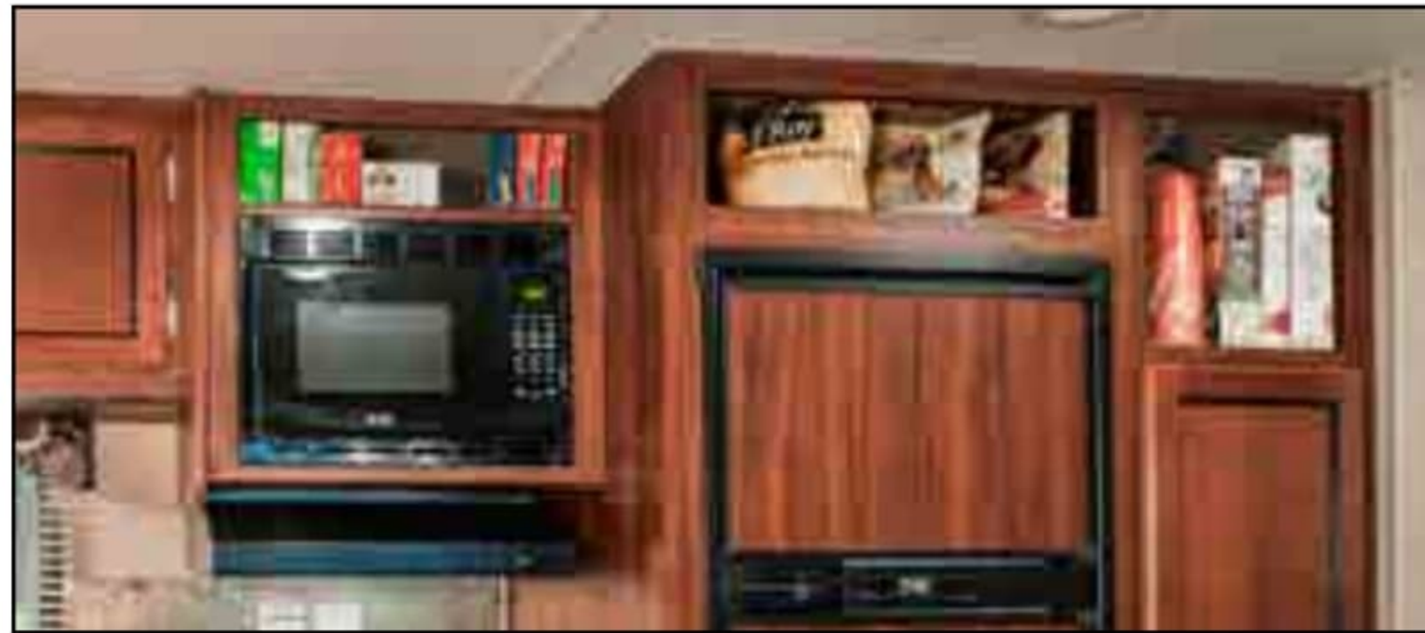
Trail Runner maximizes available space for storage....