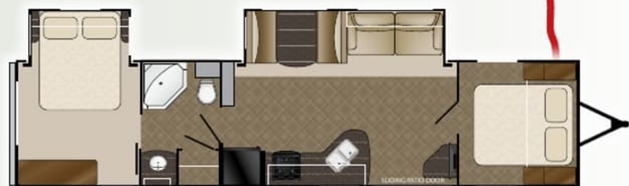
TR 39 FQBS