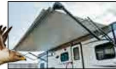
Large Awnings Enjoy your patio area rain or shine. Power awnings are also available as options.