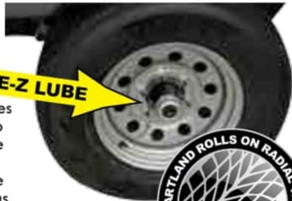
E-Z Lube Axles allow you to lubricate the Axle Hub, including the rear bearings without removing the tires.