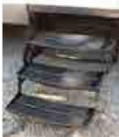
Radius entry steps give you larger step treads and fewer sharp corners