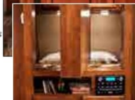
Trail Runner comes with a multi-media entertainment unit with AM/FM CD/DVD player and storage. Pictured is the rotating TV, (available in select units) which allows the single TV to be viewed in the bedroom as well as the living area.