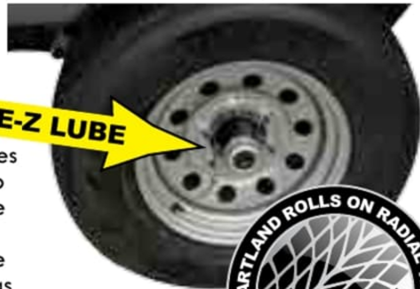
E-Z Lube Axles allow you to lubricate the Axle Hub, including the rear bearings without removing the tires.