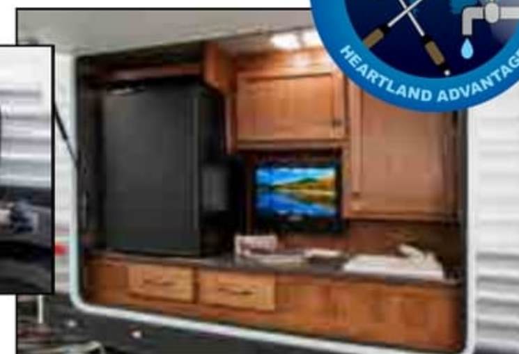
Outdoor kitchens are available on select models and feature a mini refrigerator, sink, gas grill, counter space and storage for all your patio dining needs.