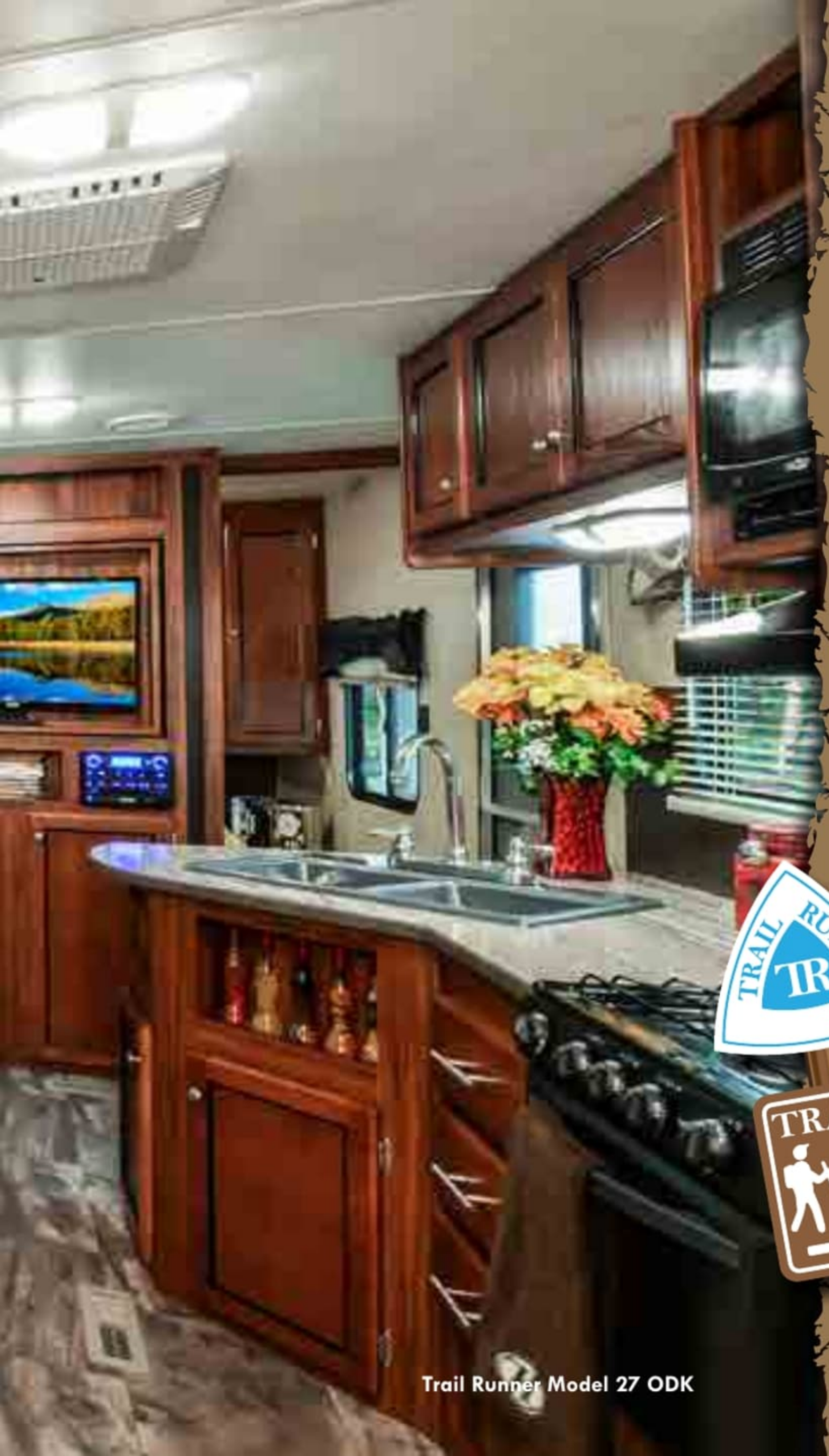
Trail Runner Model 27 ODK