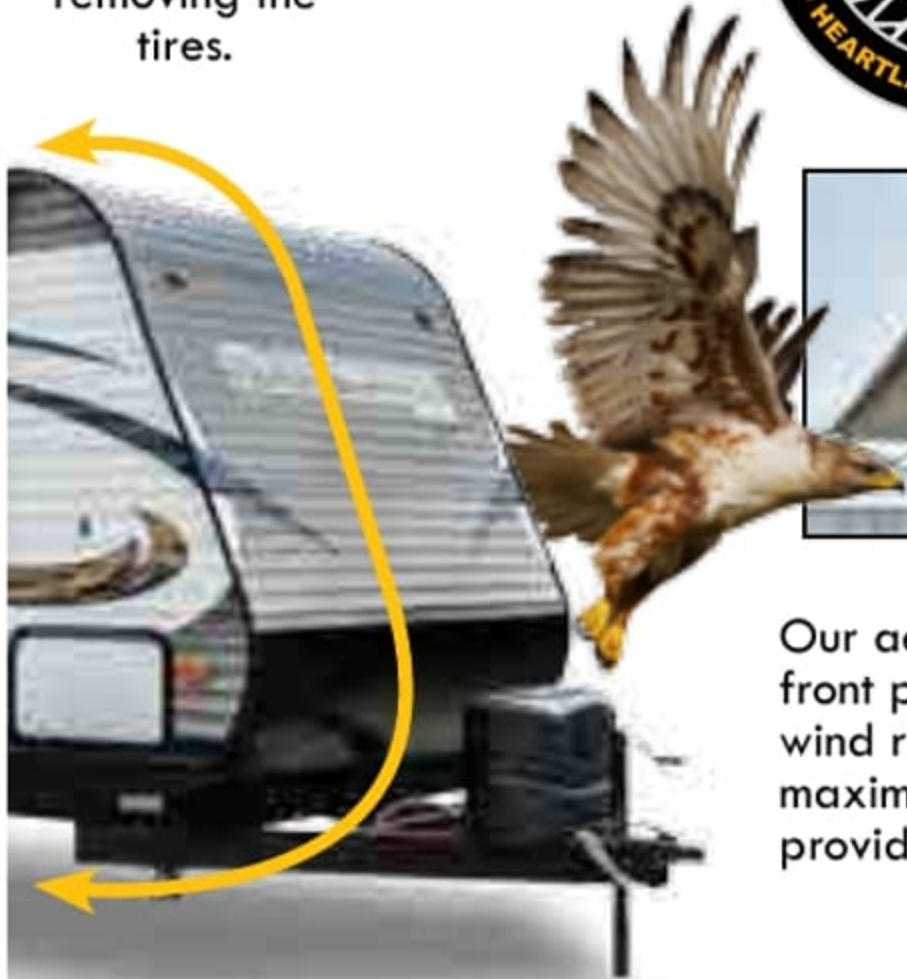
Our aerodynamic radius front profile decreases wind resistance, helping to maximize gas mileage while providing better handling.