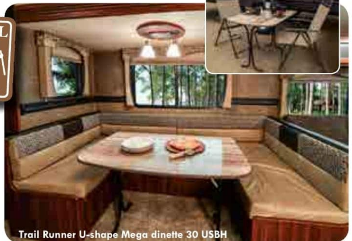
Trail Runner U-shape Mega dinette 30 USBH