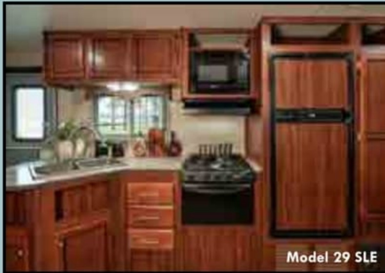
Model 29 SLE