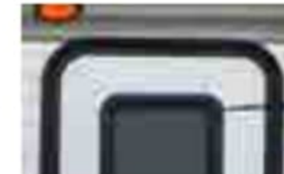
Large Awnings Enjoy your patio area rain or shine. Power awnings are also available as options.