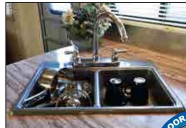
Deep 50/50 double sink with a high-rise faucet.