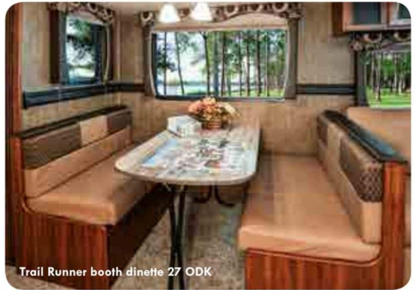
Trail Runner booth dinette 27 ODK