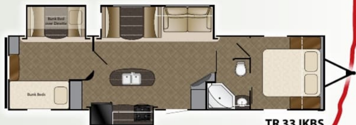
TR 33 IKBS