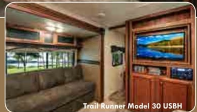
Trail Runner Model 30 USBH