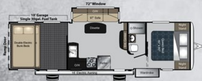
31 TRAVEL TRAILER SHIPPING WEIGHT: 8,804 LBS HITCH WEIGHT: 1,215 LBS LENGTH: 35' 6"