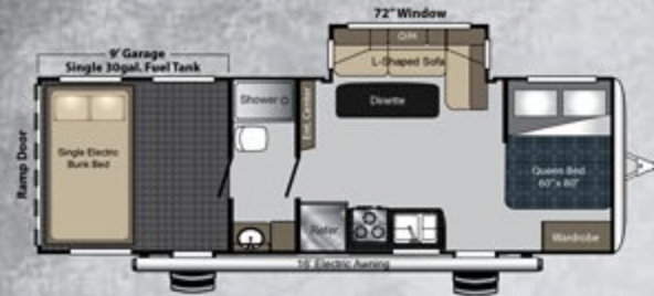
27 TRAVEL TRAILER SHIPPING WEIGHT: 6,885 LBS HITCH WEIGHT: 830 LBS LENGTH: 31'