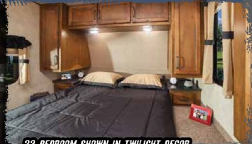
33 BEDROOM SHOWN IN TWILIGHT DECOR