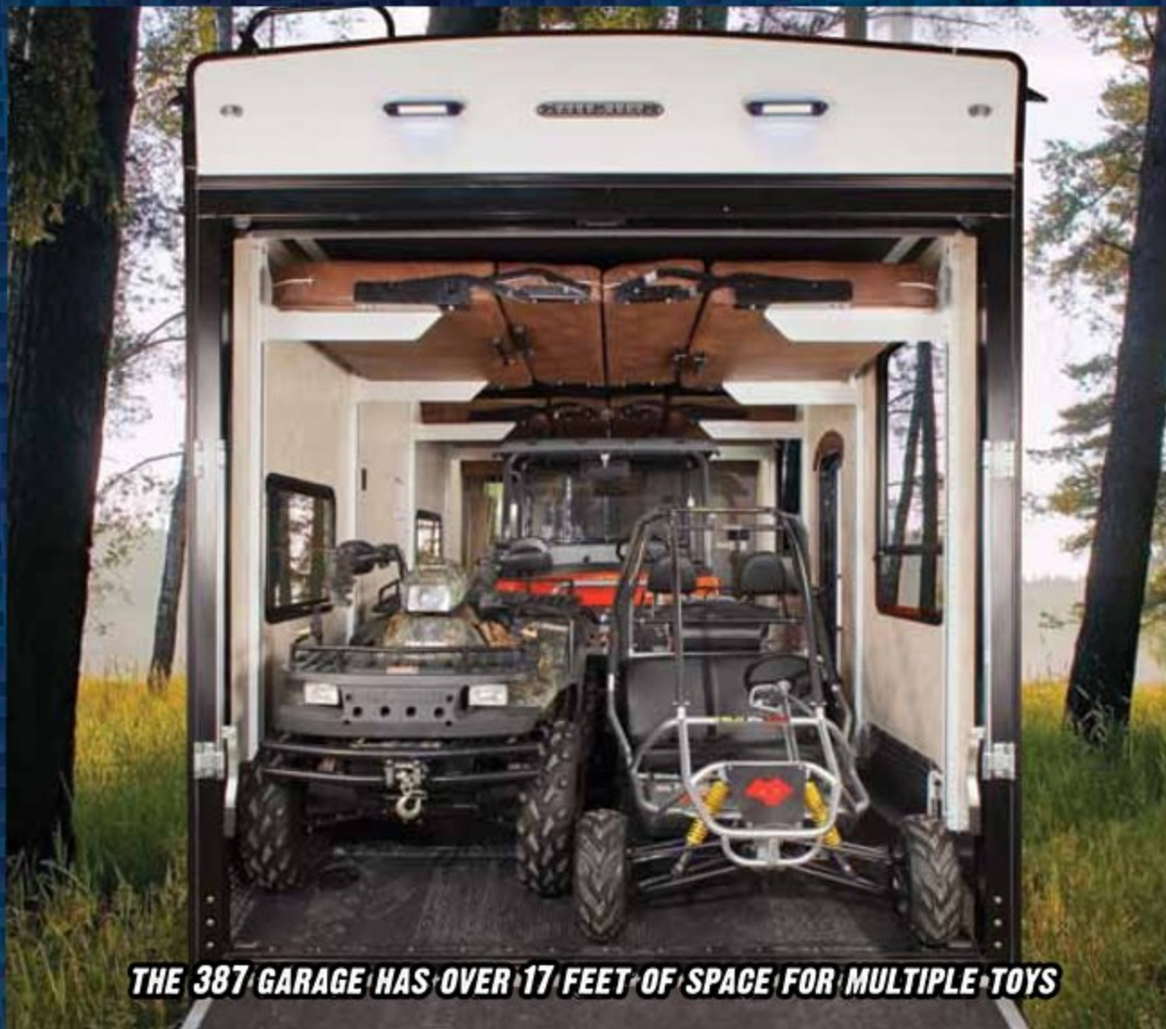
THE 387 GARAGE HAS OVER 17 FEET OF SPACE FOR MULTIPLE TOYS