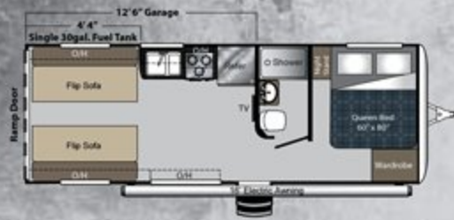
22 TRAVEL TRAILER SHIPPING WEIGHT: 5,420 LBS HITCH WEIGHT: 660 LBS LENGTH: 26' 2"