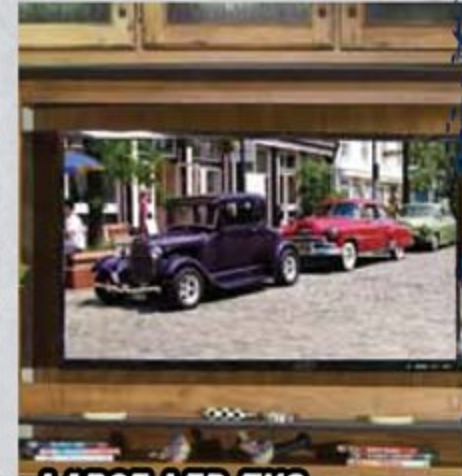
LARGE LED TVS

CARBON FIFTH WHEELS HAVE ALL OF THE FEATURES YOU NEED PLUS ARE LIGHT WEIGHT AND VALUE PRICED.