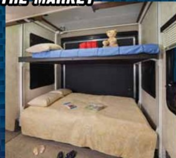
ELECTRIC BUNK BEDS IN GARAGE