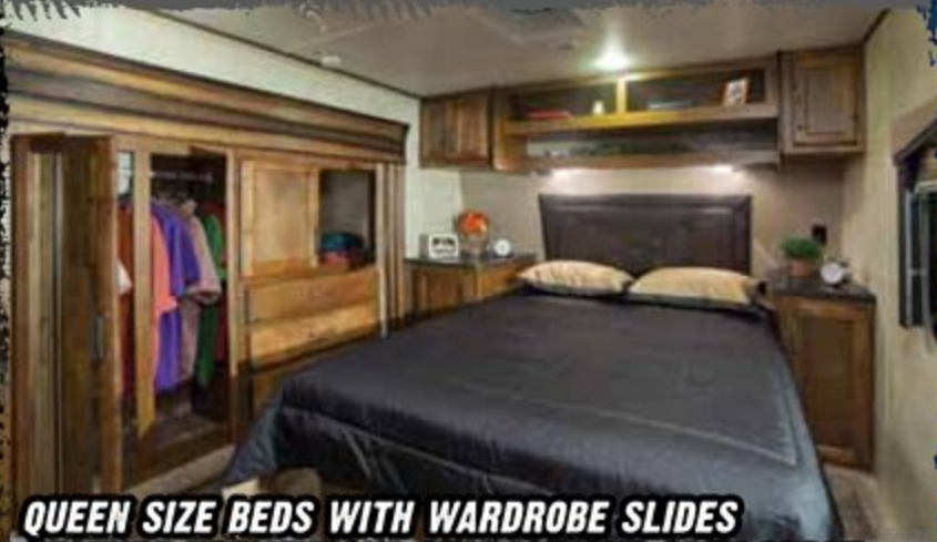
QUEEN SIZE BEDS WITH WARDROBE SLIDES FEATURE TREMENDOUS STORAGE AND OPEN SPACE