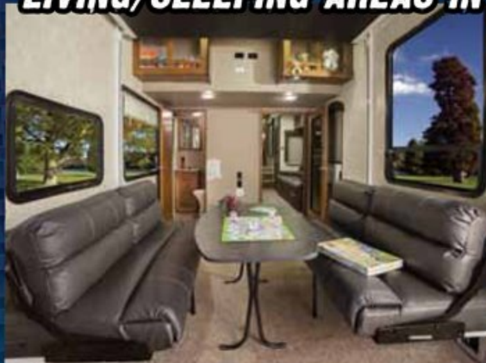
DUAL OPPOSING SOFAS WITH DINETTE TABLE

THE GARAGE EASILY TURNS INTO THE BEST LIVING/SLEEPING AREAS IN THE MARKET