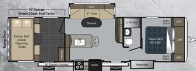
33 TRAVEL TRAILER SHIPPING WEIGHT: 8,940 LBS HITCH WEIGHT: 1,285 LBS LENGTH: 35' 5"