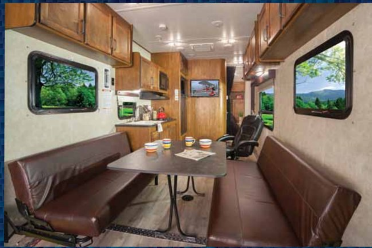
DUAL OPPOSING SOFAS IN CARBON 22 GARAGE AREA