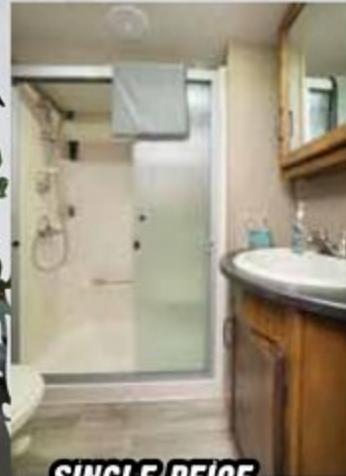
SINGLE PEICE LARGE SHOWERS