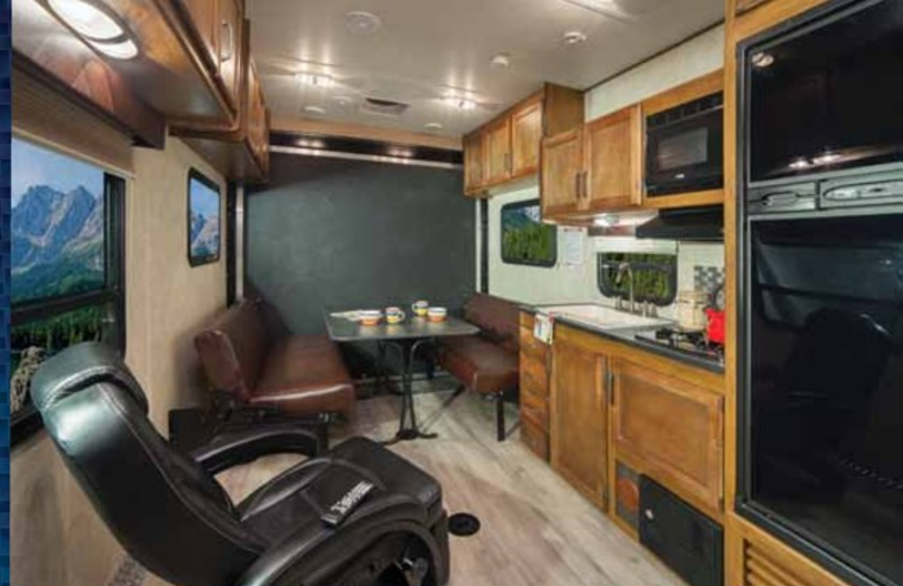
22 LIVING AREA SHOWN IN ECLIPSE DECOR

ALL CARBON MODELS FEATURE FRAME INTEGRATED WORRY-FREE D-RINGS