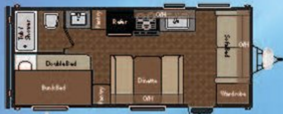
WEIGHT: 4107 LENGTH: 23' 7" ● 1890FL