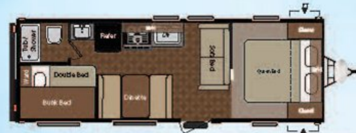
WEIGHT: 4786 LENGTH: 28' 10" ● 2600TB