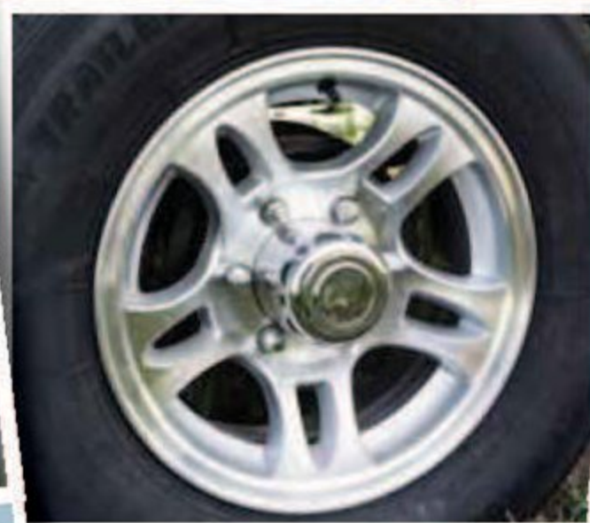
ALUMINUM RIMS A lighter rim with a sporty look without the rust