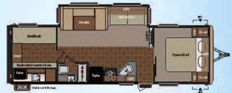
WEIGHT: 7052 LENGTH: 33' 5" ● 294BH