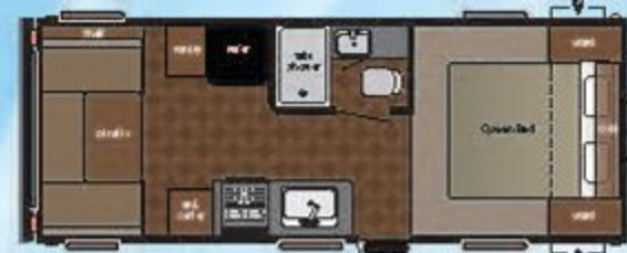
WEIGHT: 4287 LENGTH: 24' 10" ● 2020QB