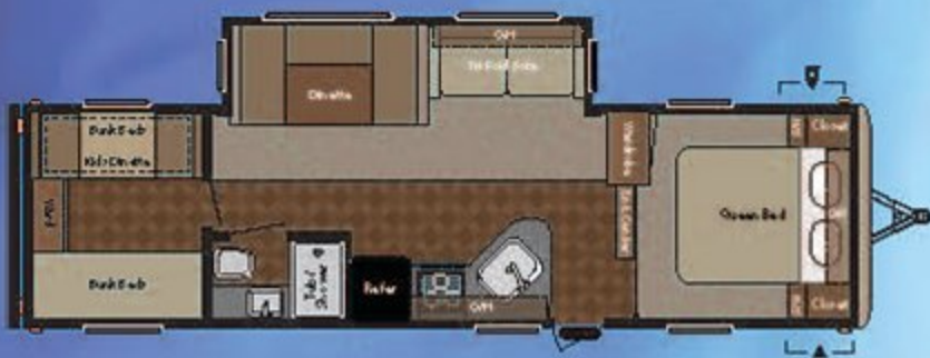
WEIGHT: 7081 LENGTH: 32' 0" ● 297BH