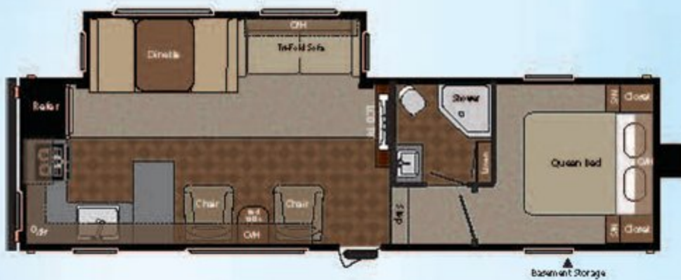
WEIGHT: 7291 LENGTH: 31' 11" Ⓞ 280FWRK