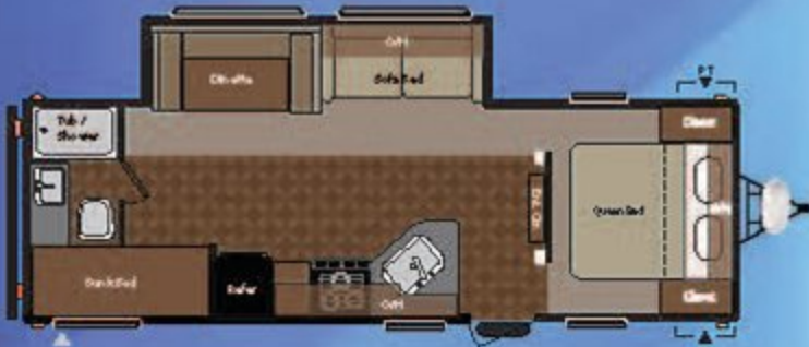
WEIGHT: 5783 LENGTH: 28' 11" ● 2670BHGS