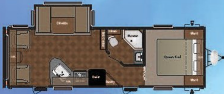
WEIGHT: 5843 LENGTH: 29' 8" ● 2570RL