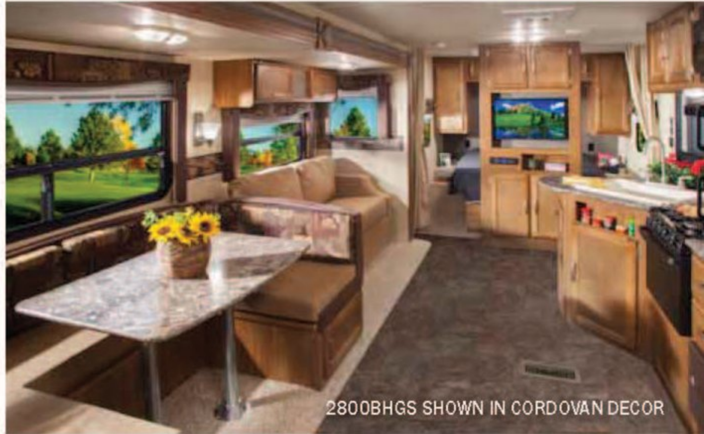
2800BHGS SHOWN IN CORDOVAN DECOR