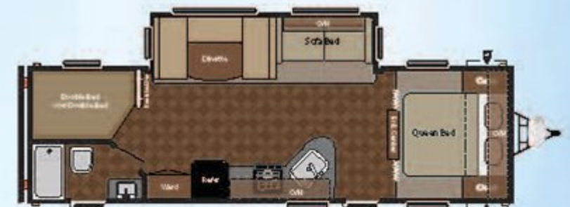
WEIGHT: 6439 LENGTH: 32' 1" ● 2820BHGS