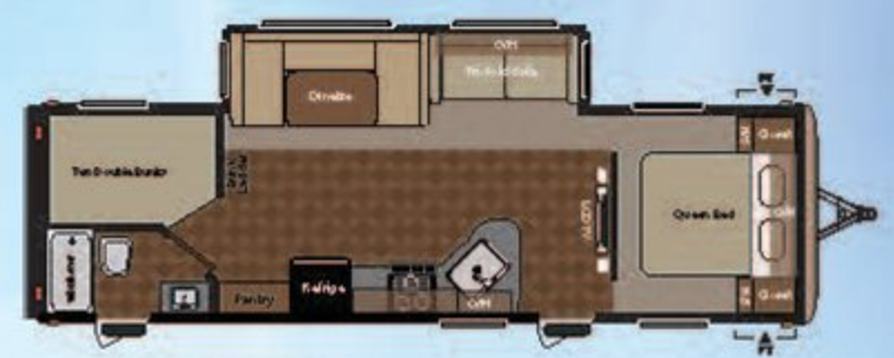
WEIGHT: 6858 LENGTH: 32' 1" ● 282BH