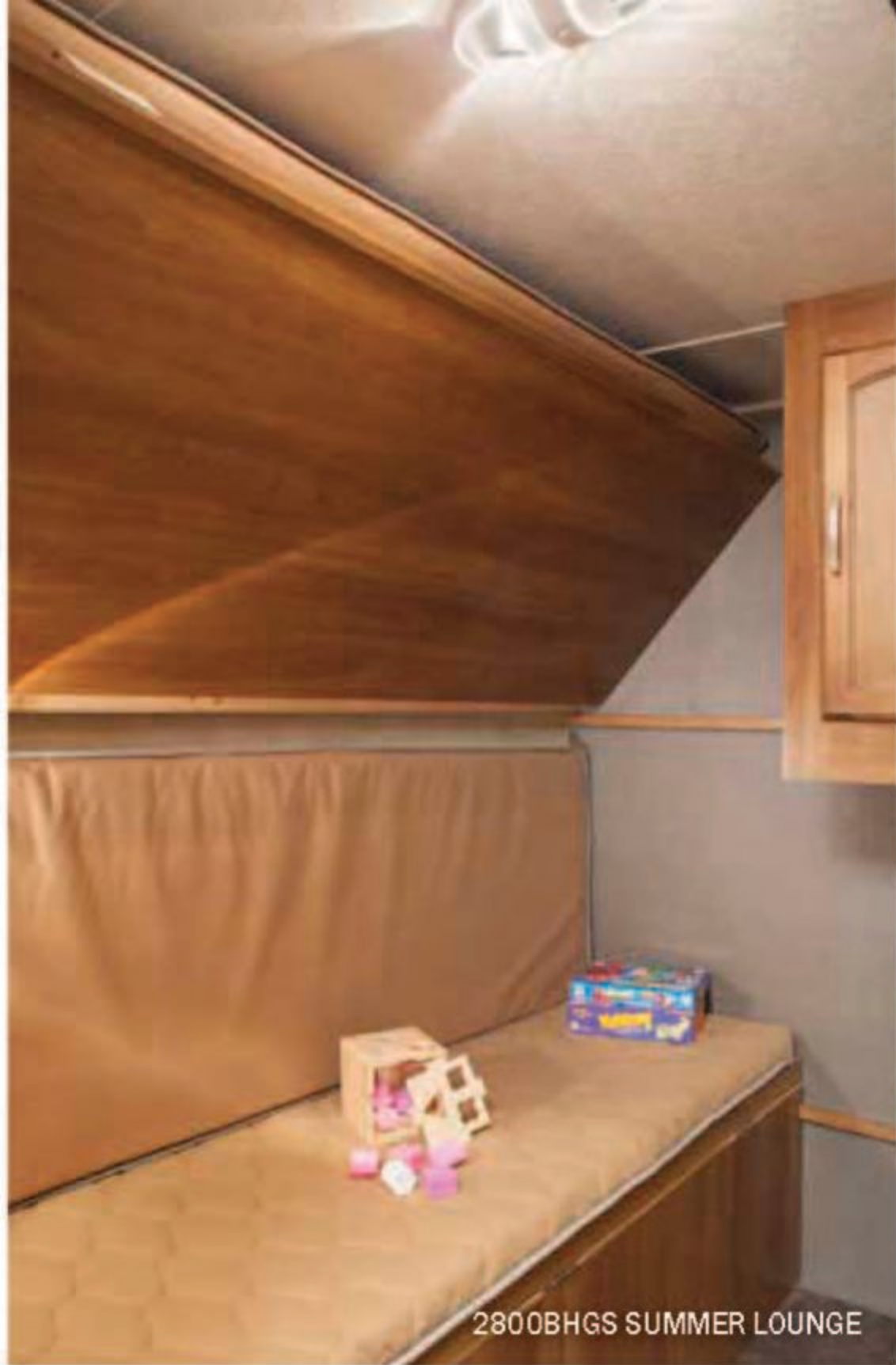
2800BHGS SUMMER LOUNGE