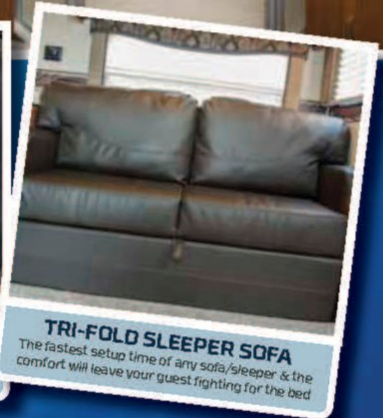
TRI-FOLD SLEEPER SOFA The fastest setup time of any sofa/sleeper & the comfort will leave your guest fighting for the bed