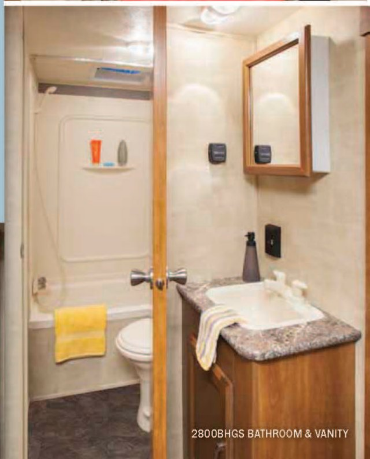
2800BHGS BATHROOM & VANITY