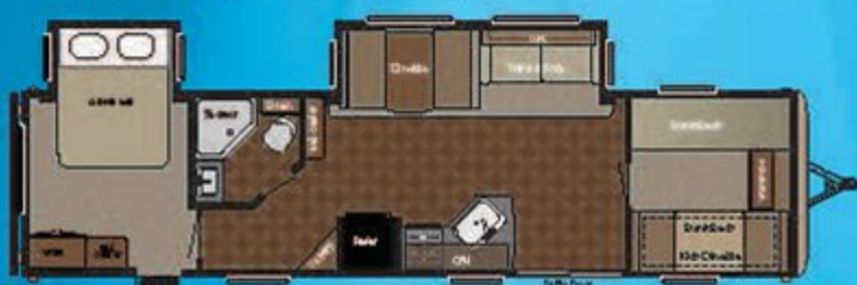
WEIGHT: 8685 LENGTH: 38' 11" ● 38BH