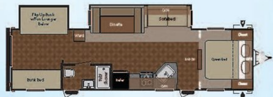
WEIGHT: 7313 LENGTH: 34' 11" ● 3030BHGS