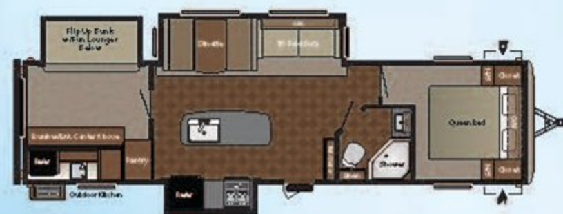
WEIGHT: 9065 LENGTH: 37' 0" ● 330KI