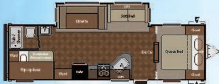
WEIGHT: 6345 LENGTH: 31' 9" ● 2800BHGS