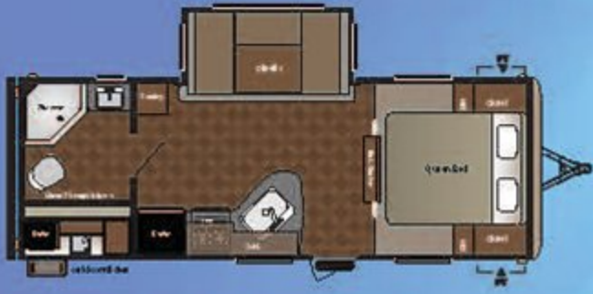
WEIGHT: 5852 LENGTH: 26' 3" ● 225RB