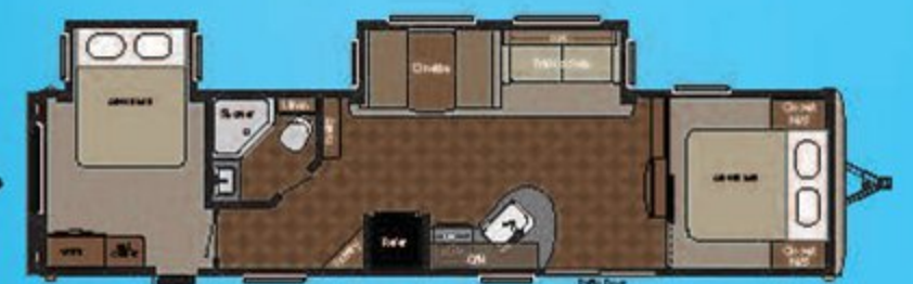
WEIGHT: TBD LENGTH: 38' 11" ● 38FQ