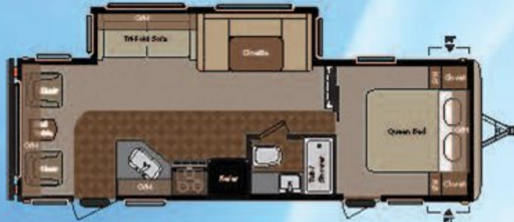
WEIGHT: 6349 LENGTH: 29' 6" ● 266RL