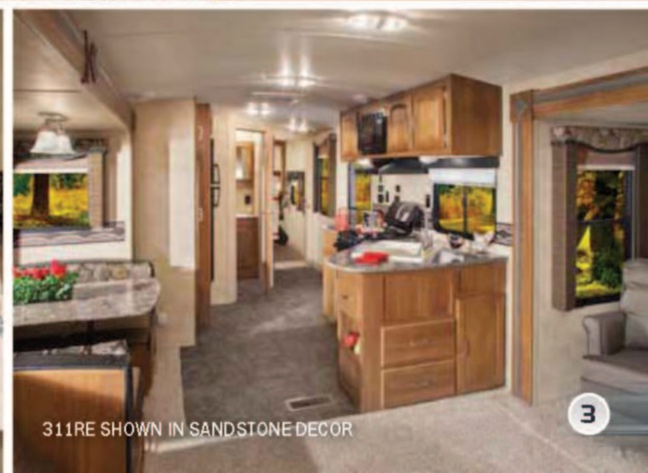
311RE SHOWN IN SANDSTONE DECOR