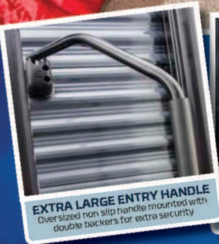
EXTRA LARGE ENTRY HANDLE Oversized non slip handle mounted with double backers for extra security