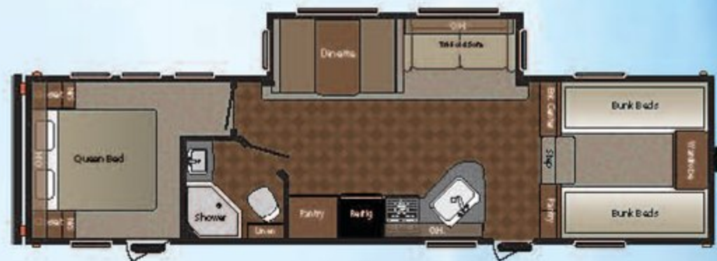
WEIGHT: 7842 LENGTH: 34' 5" Ⓞ 320FWFB