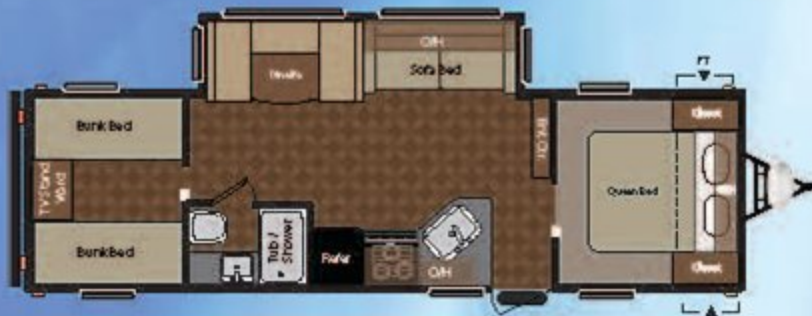
WEIGHT: 6342 LENGTH: 32' 7" ● 2980BHGS