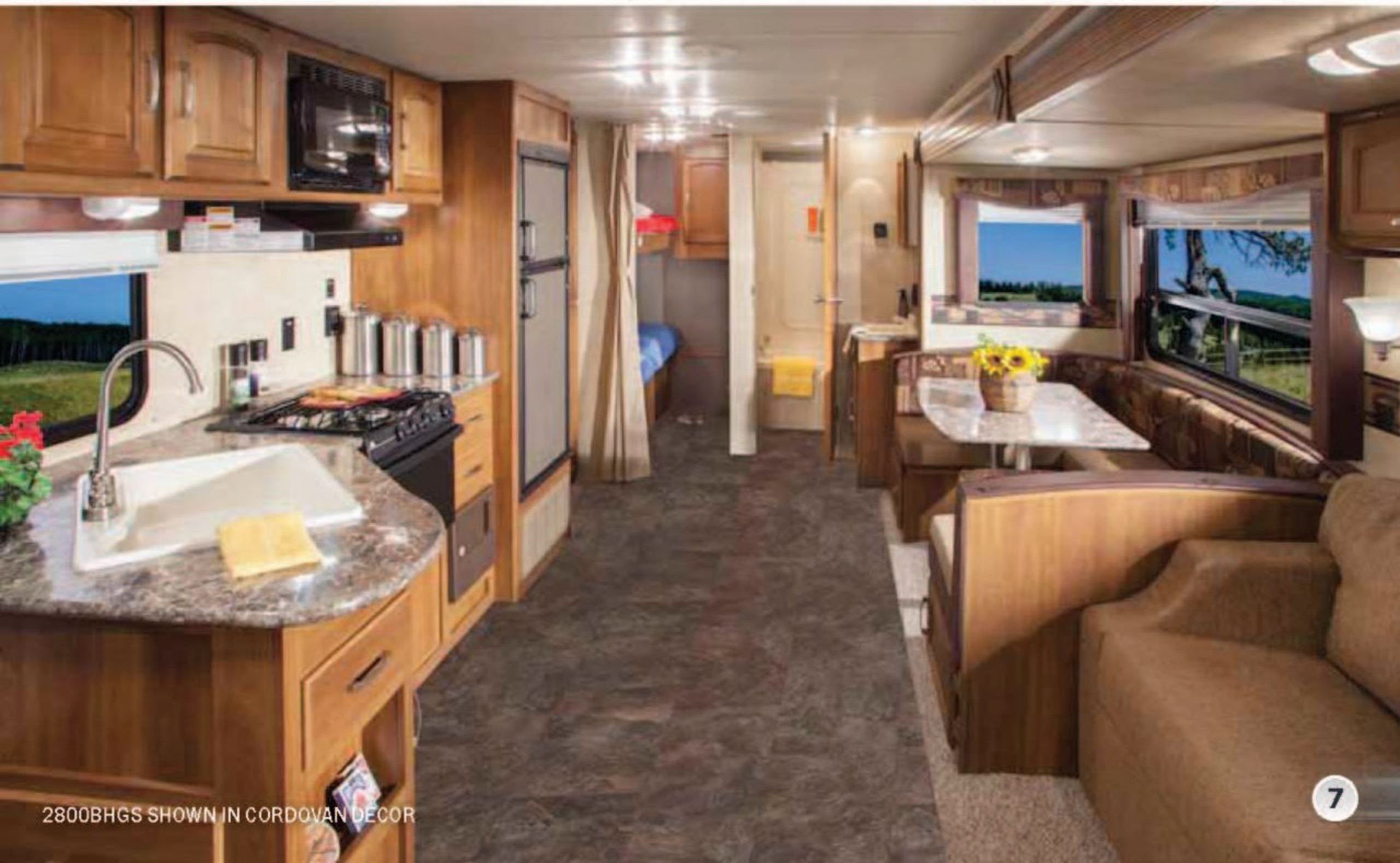
2800BHGS SHOWN IN CORDOVAN DECOR