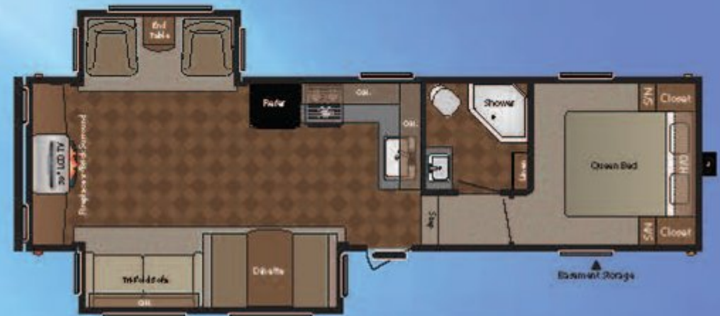
WEIGHT: 8065 LENGTH: 31' 11" Ⓞ 253FWRE