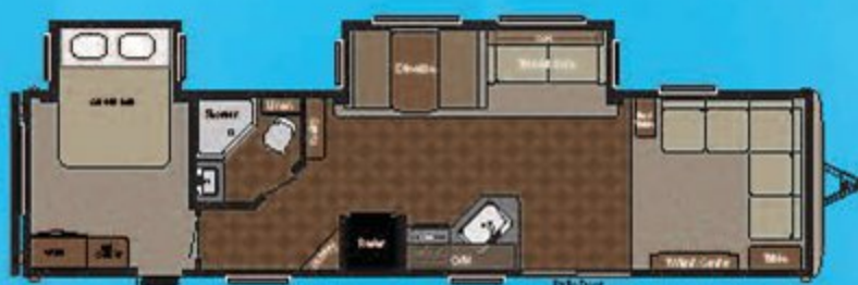
WEIGHT: 8615 LENGTH: 38' 11" ● 38FL