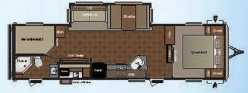
WEIGHT: 7940 LENGTH: 35' 11" ● 310BH