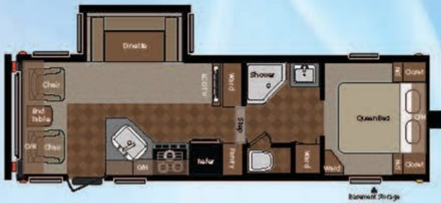
WEIGHT: 6439 LENGTH: 27' 8" Ⓞ 247FWRL