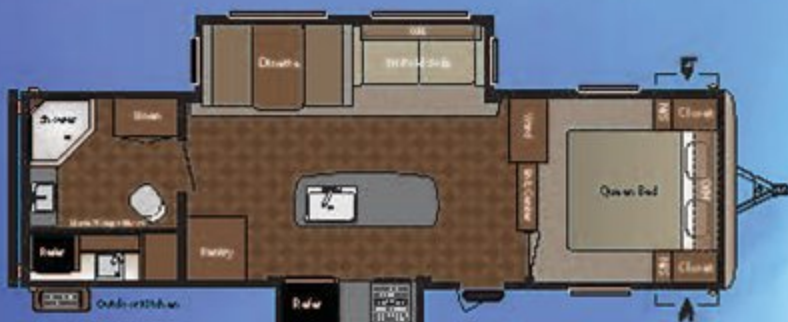
WEIGHT: 7985 LENGTH: 32' 8" ● 287RB