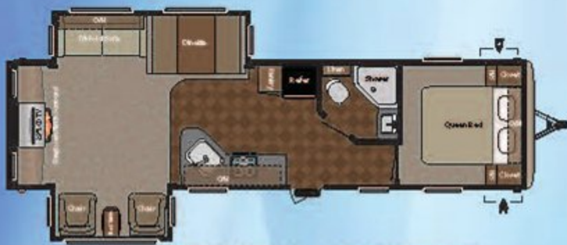
WEIGHT: 8238 LENGTH: 35' 7" ● 311RE