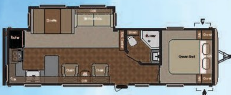
WEIGHT: 6978 LENGTH: 33' 3" ● 293RK