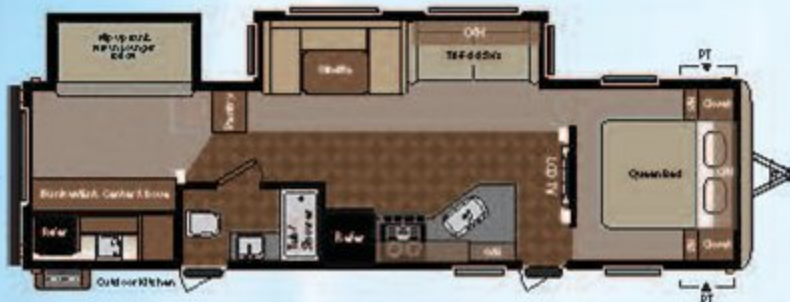
WEIGHT: 7948 LENGTH: 35' 0" ● 303BH