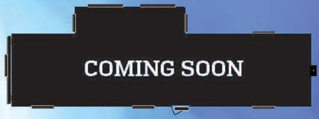
WEIGHT: TBD LENGTH: TBD Ⓞ TBD