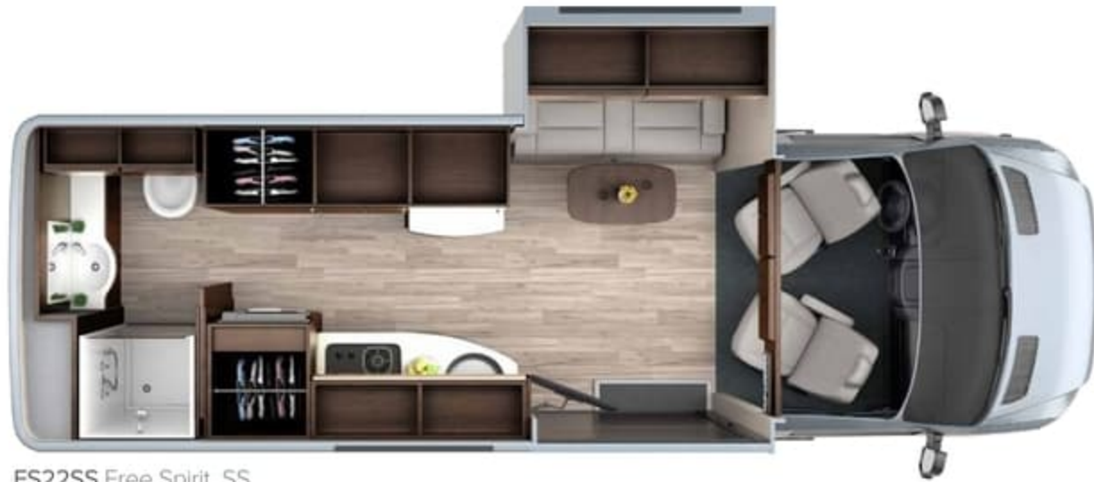
FS22SS Free Spirit SS