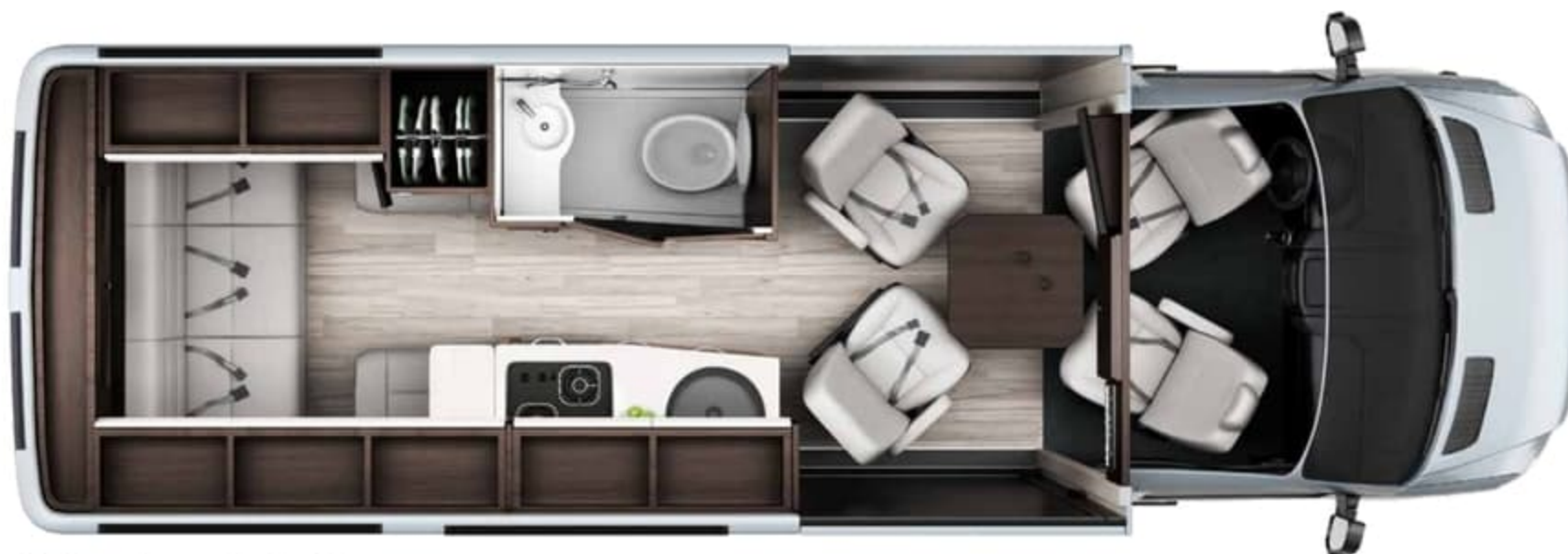
FS22TE Free Spirit TE