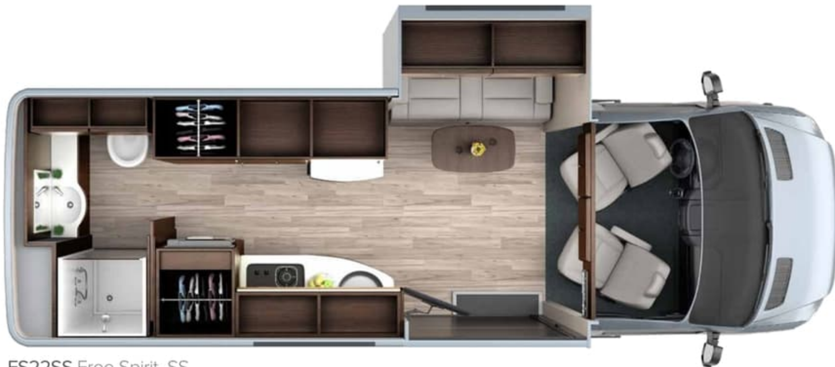
FS22SS Free Spirit SS