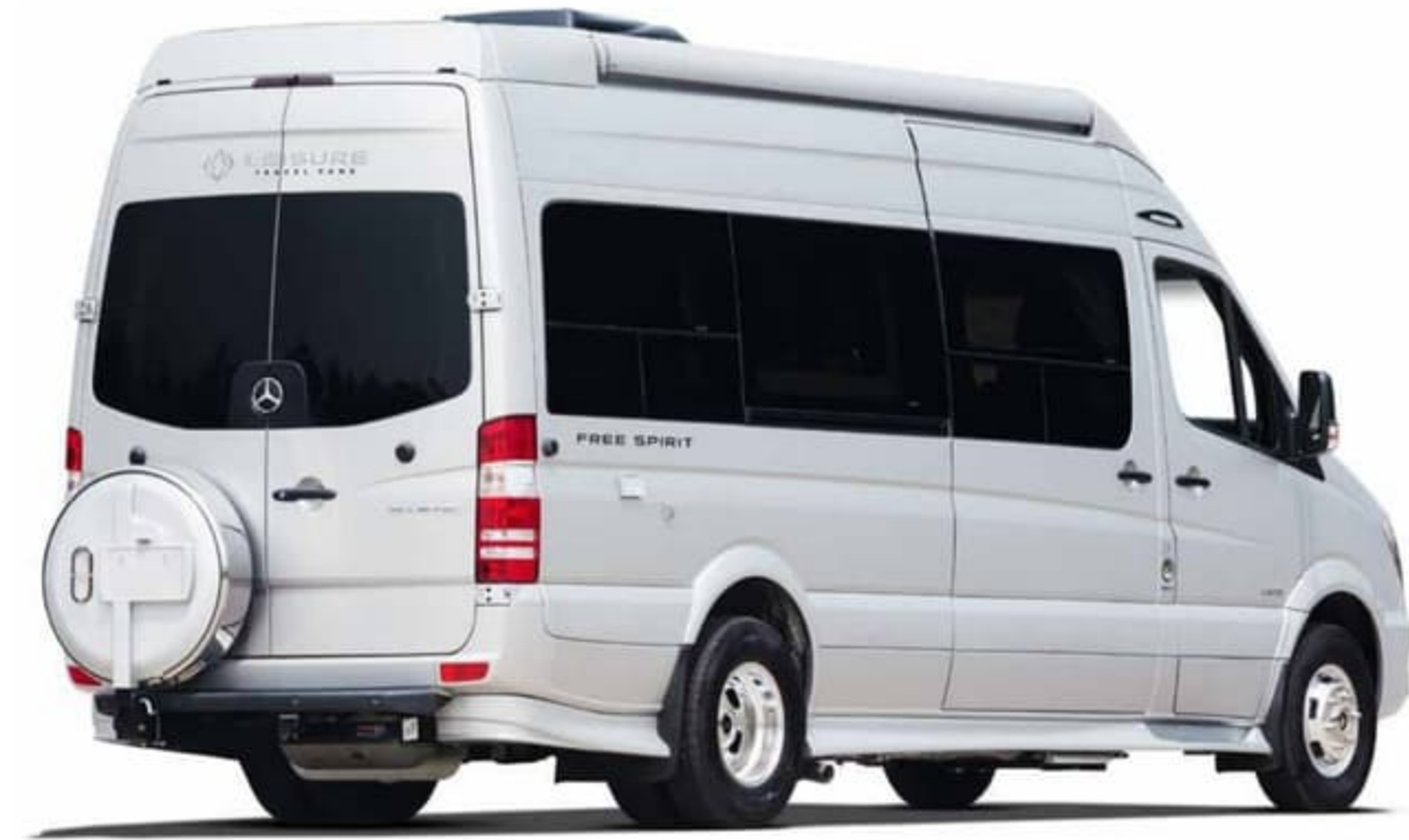
Shown with Optional Roof Trim Kit with Integrated Awning