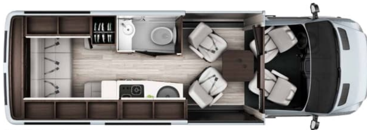
FS22TE Free Spirit TE