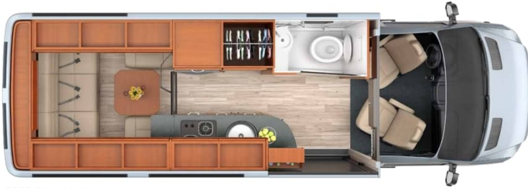
FS22 Free Spirit