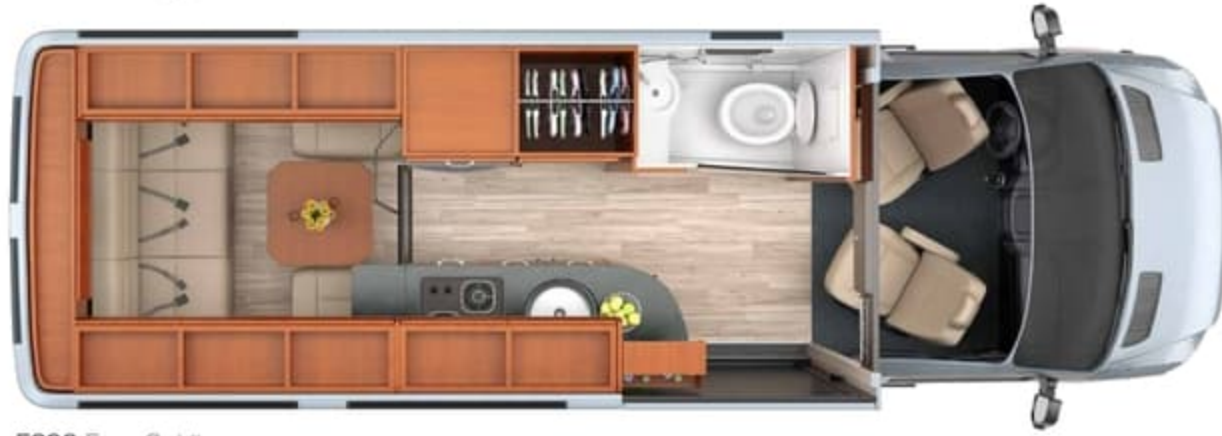
FS22 Free Spirit