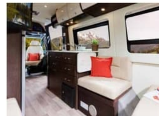
Espresso Brown 50th Anniversary Décor Package