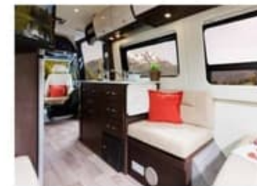
Espresso Brown 50th Anniversary Décor Package