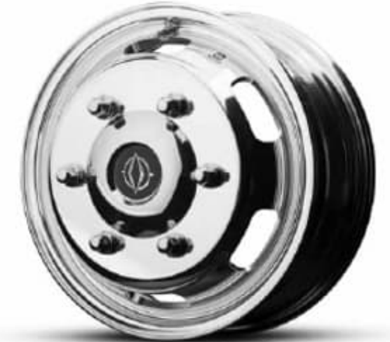
Alcoa Dura-Bright® Aluminum Wheels Optional - All 6 Wheels