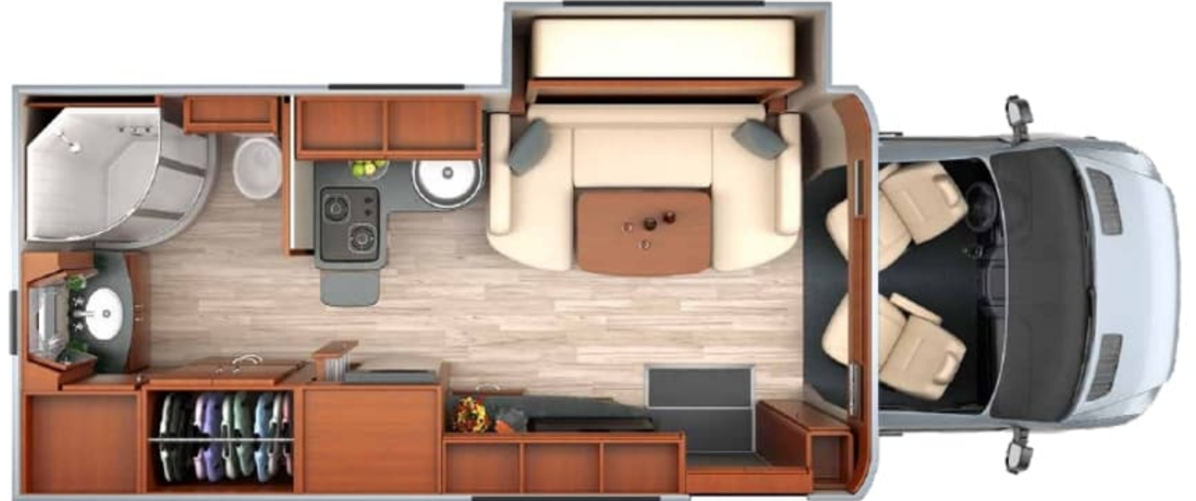
U24MB Murphy Bed (Shown with optional U-Lounge)