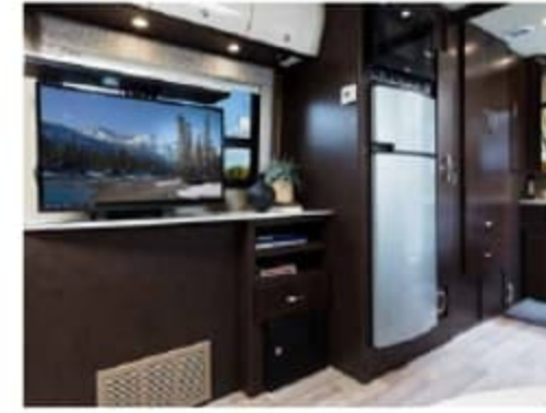
Espresso Brown 50th Anniversary Décor Package