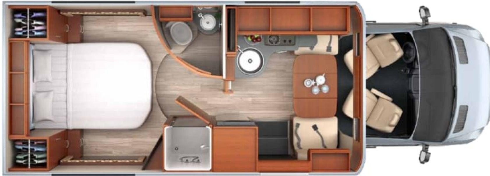
U24IB Island Bed