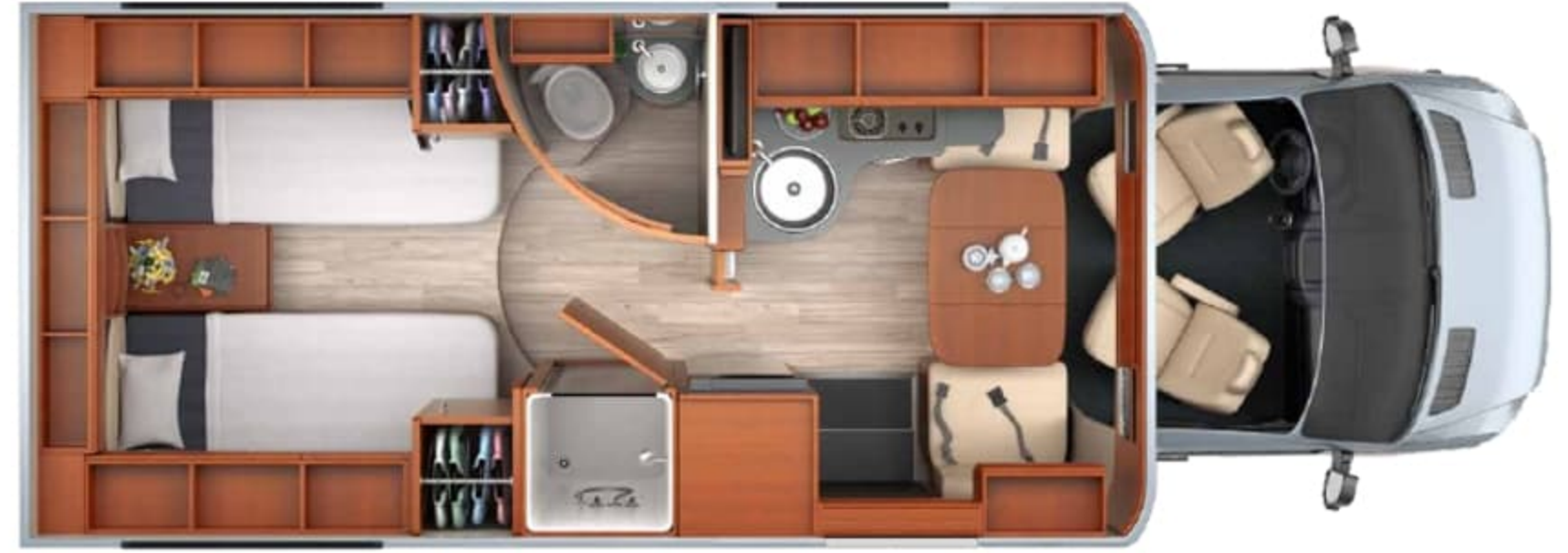
U24TB Twin Bed