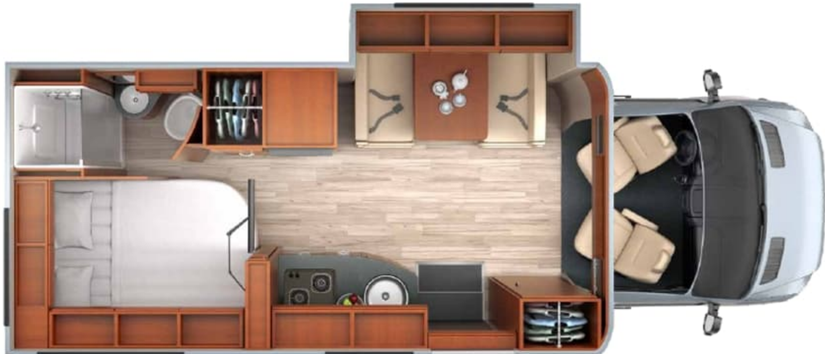
U24CB Corner Bed (Shown with standard Booth Dinette)