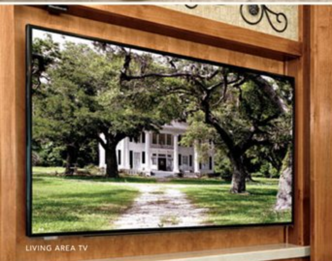
LIVING AREA TV