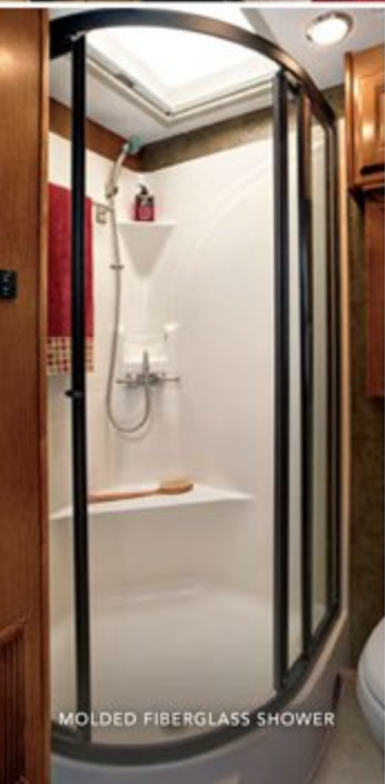
MOLDED FIBERGLASS SHOWER