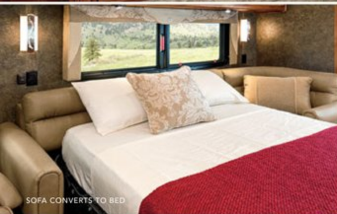
SOFA CONVERTS TO BED