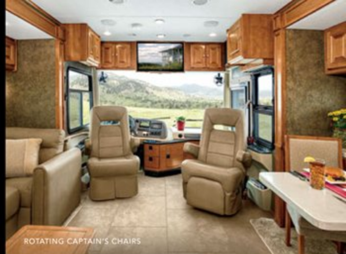
ROTATING CAPTAIN'S CHAIRS

SHOWN 33 AA FLOOR PLAN WITH ENGLISH CHESTNUT CABINETS AND LINEN INTERIOR