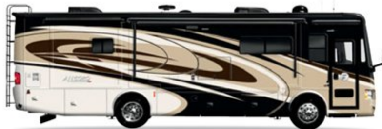
ROCKY MOUNTAIN BROWN