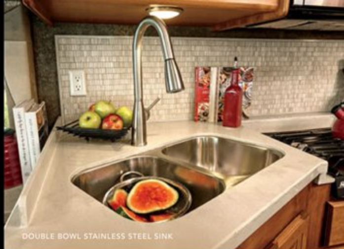
DOUBLE BOWL STAINLESS STEEL SINK

SHOWN 33 AA FLOOR PLAN WITH ENGLISH CHESTNUT CABINETS AND COUNTERTOP BACKSPASH UPGRADE