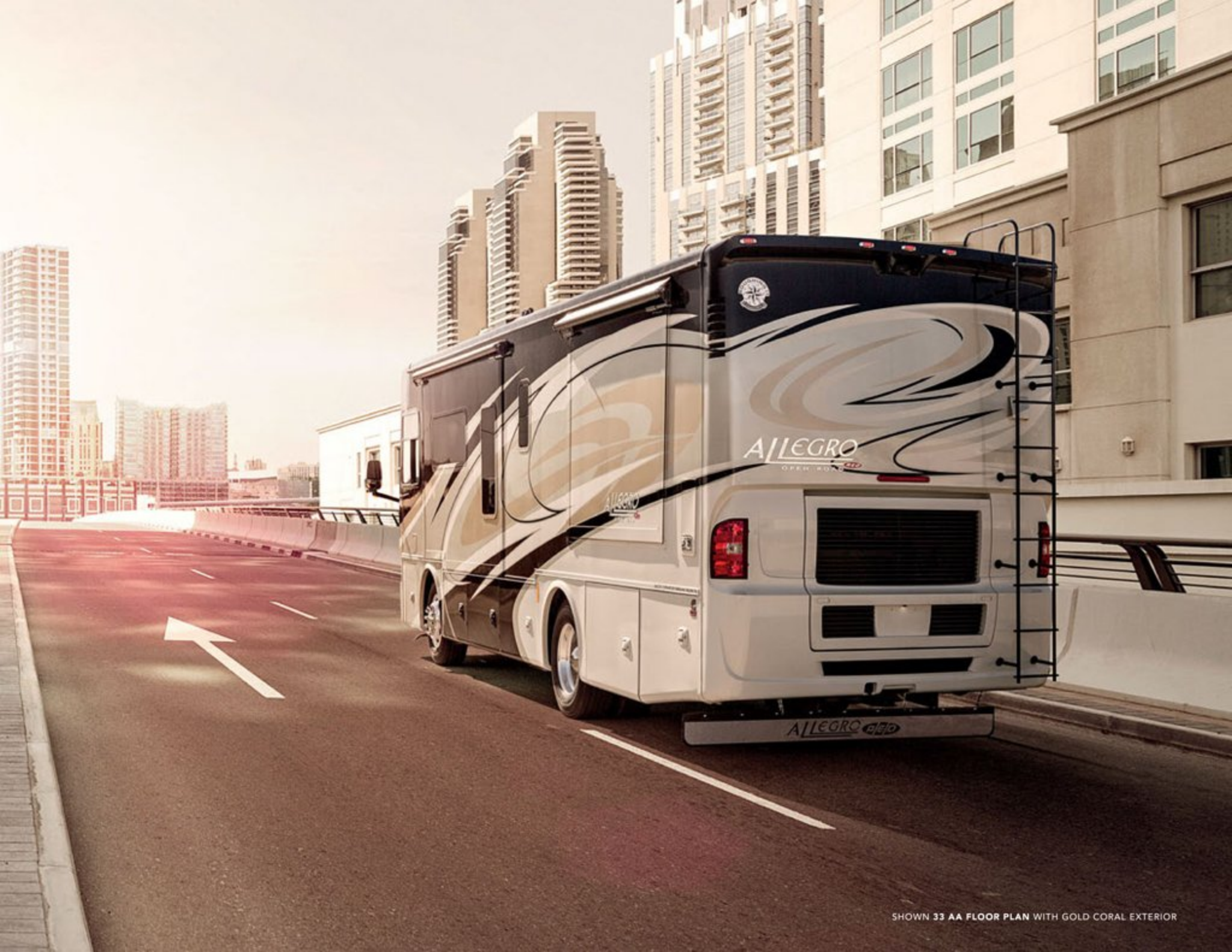
SHOWN 33 AA FLOOR PLAN WITH GOLD CORAL EXTERIOR