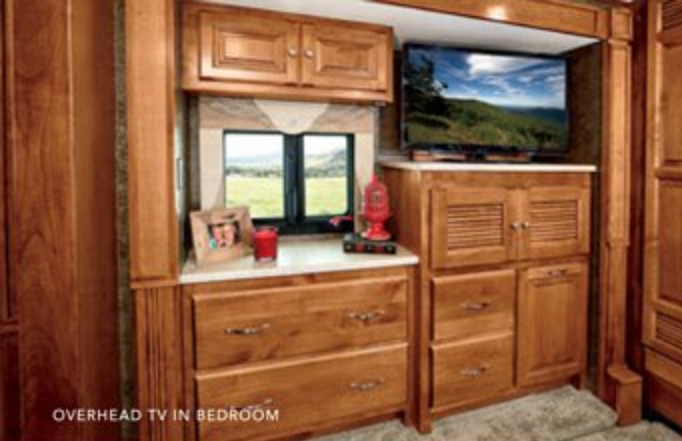
OVERHEAD TV IN BEDROOM