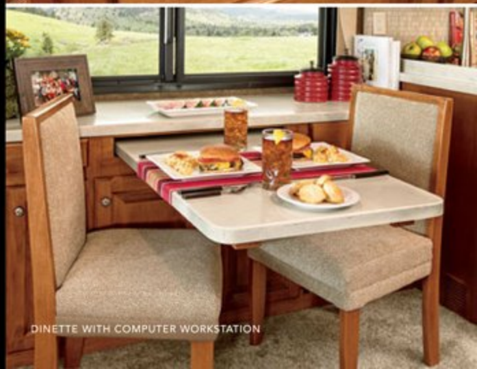
DINETTE WITH COMPUTER WORKSTATION