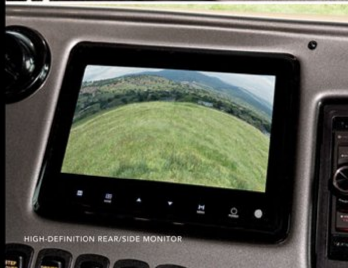
HIGH-DEFINITION REAR/SIDE MONITOR