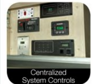
Centralized System Controls