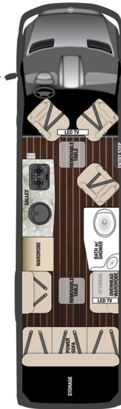
EXT Lounge Wardrobe Seats: 7 (8 with option) Sleeps: 2