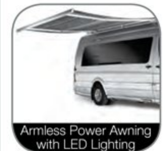
Armless Power Awning with LED Lighting