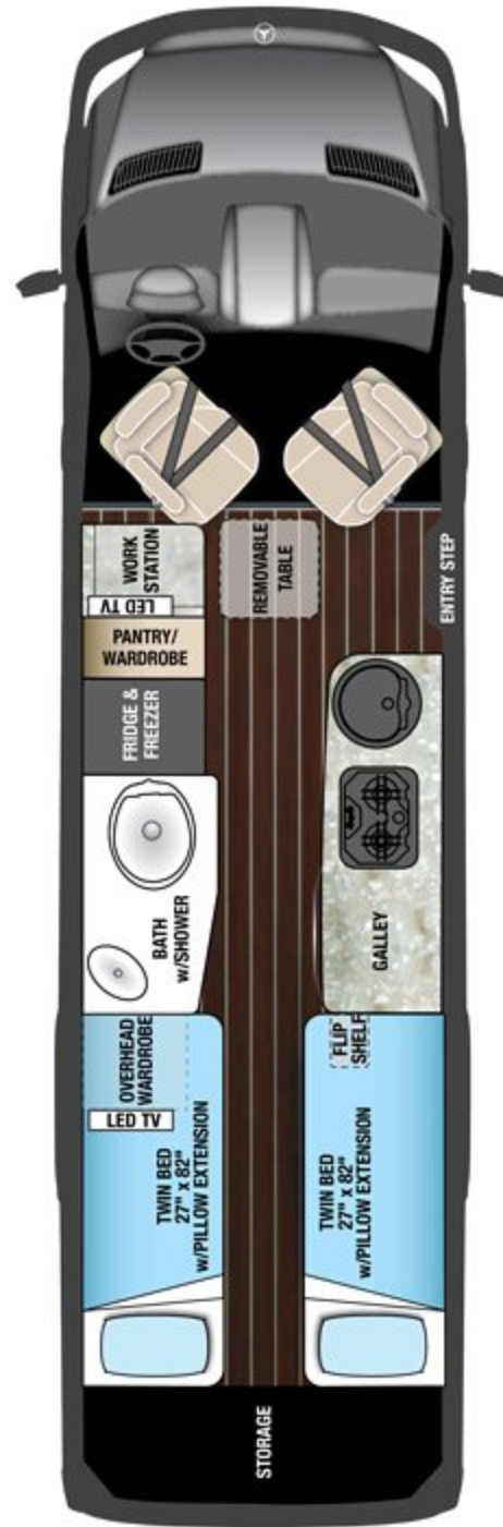
EXT Grand Tour Twin Seats: 2 Sleeps: 2