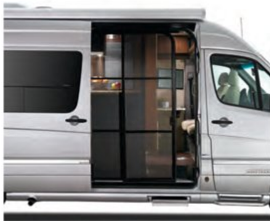
Side Screen Door (Option)