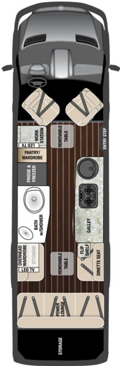
EXT Grand Tour Seats: 6 (7 with option) Sleeps: 2