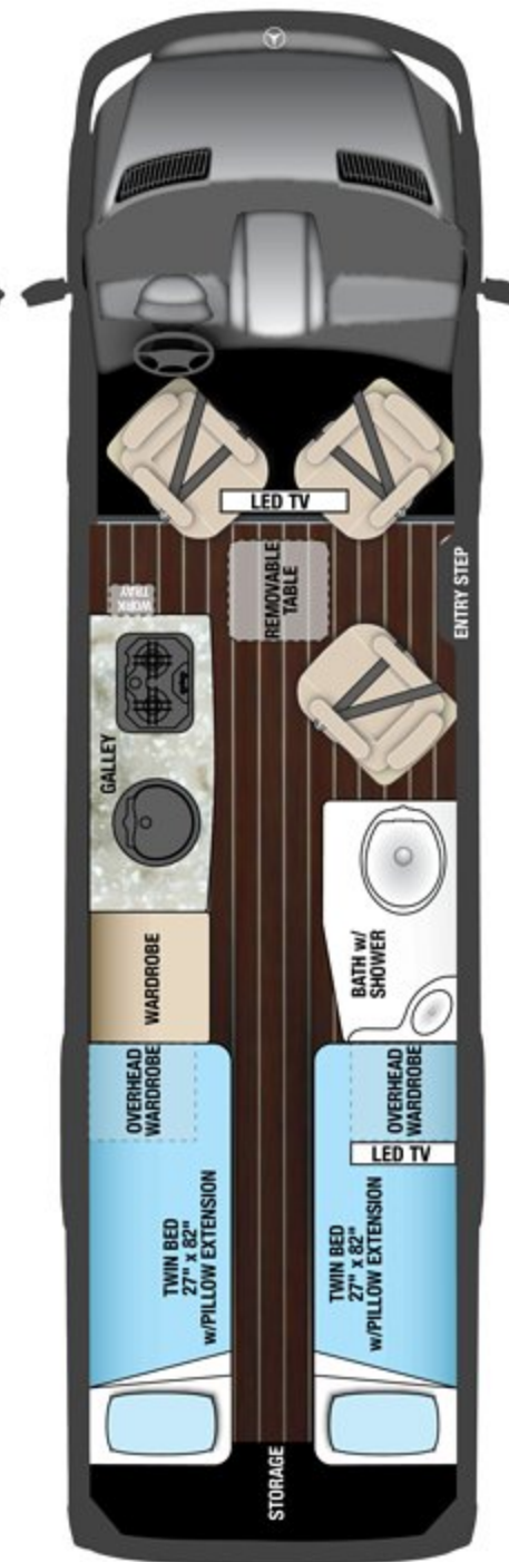
EXT Lounge Twin Wardrobe Seats: 3 Sleeps: 2