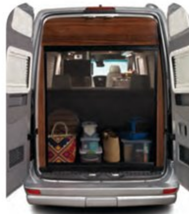
Rear Power Screen Door (Option)