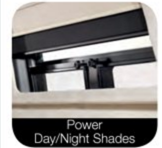
Power Day/Night Shades