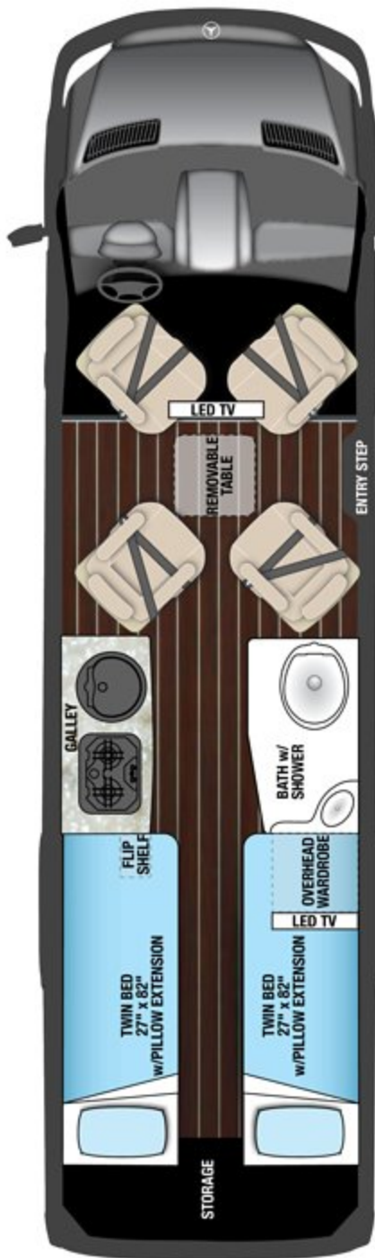
EXT Lounge Twin Seats: 4 Sleeps: 2