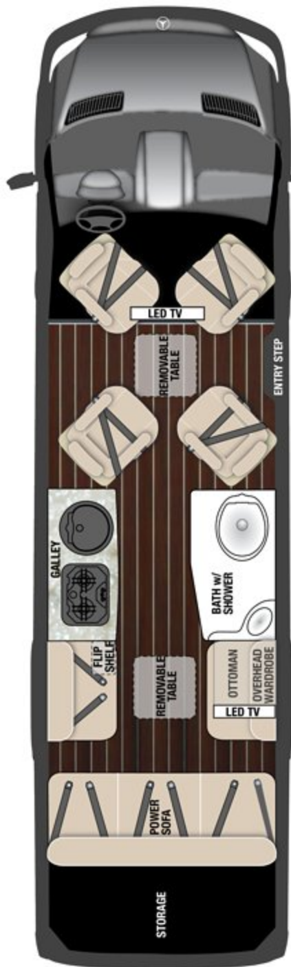
EXT Lounge Seats: 8 (9 with option) Sleeps: 2