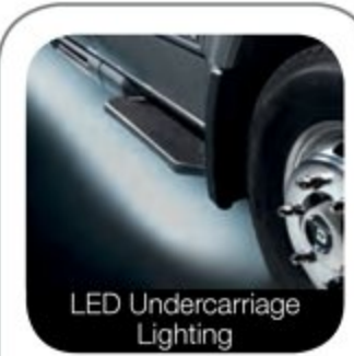
LED Undercarriage Lighting