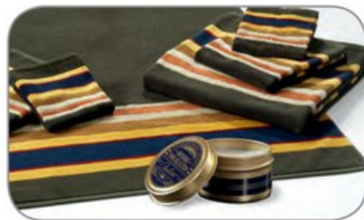
Bath - bath towels, hand towels, wash cloths, National Park candle