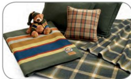
Bedroom - Pendleton Eco-Wise Wool® blanket, National Park bear, National Park blanket, Eco-wise shams, ranger plaid toss pillow