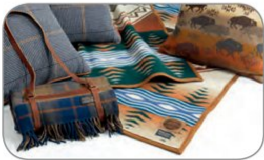
Living Area - Thomas Kay lambswool throw, blanket robe, buffalo pillow, log cabin pillow