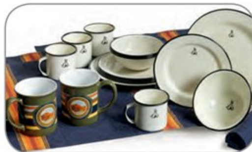
Galley - 2 park mugs, Grand Canyon napkins, enamel dinner set