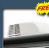
13.5K BTU Air Conditioning Unit