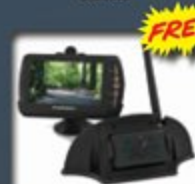
Backup Camera System Prep (Camera not Included)