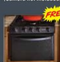
Range with Oven IPO 3 Burner Cooktop