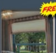
Pleated Night Shades In Living Room