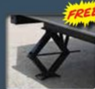
Four (4) Stabilizer Jacks