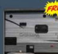
2 Marine Grade Exterior Speakers