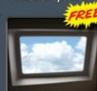
Skylight above Tub/Shower