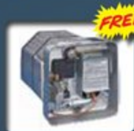
6 Gallon Gas/Electric DSI Water Heater