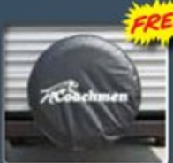
Spare Tire with Cover