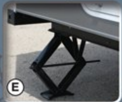
E Four (4) stabilizer jacks Standard on all models (Most competitors offer this as an option not a standard)