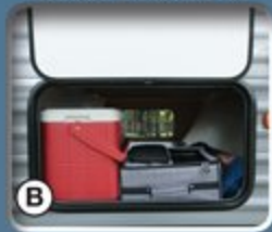
B Oversized exterior baggage door