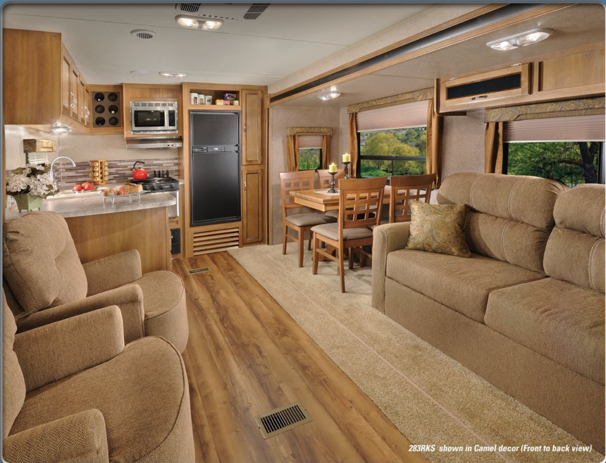
283RKS shown in Camel decor (Front to back view)