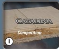
I 5/8" Tongue in groove plywood decking glued and stapled to the floor studs-not OSB