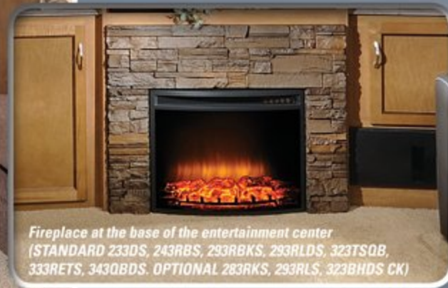
Fireplace at the base of the entertainment center (STANDARD 233DS, 243RBS, 293RBKS, 293RLDS, 323TSQB, 333RETS, 343QBDS. OPTIONAL 283RKS, 293RLS, 323BHDS CK)