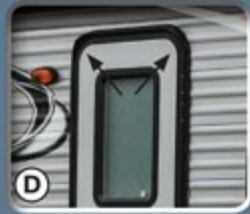
D Smooth fiberglass radius entry door with painted finish