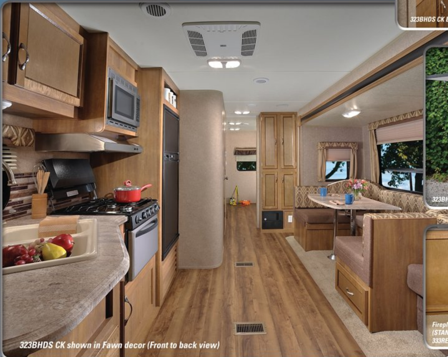
323BHDS CK shown in Fawn decor (Front to back view)