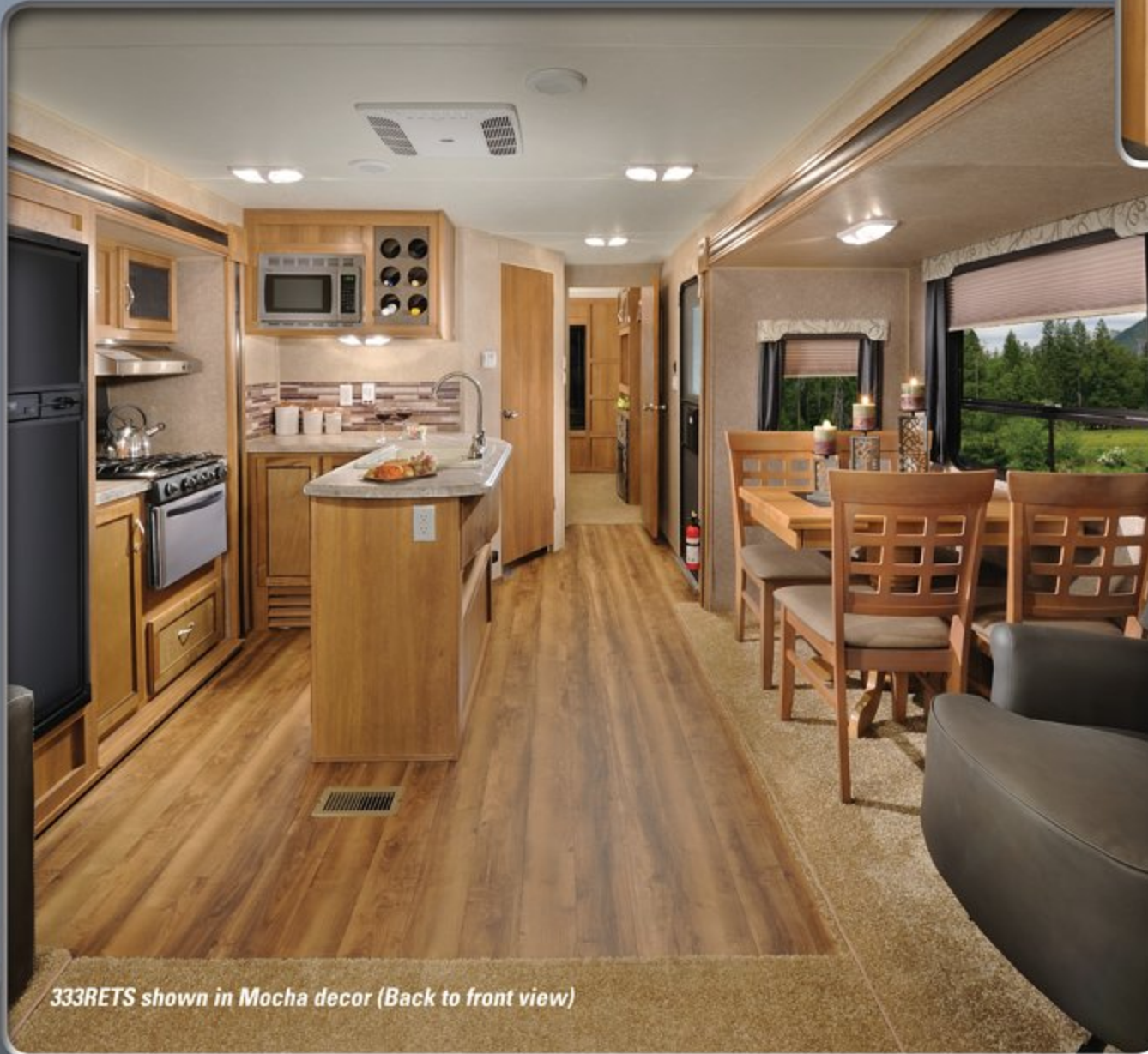
333RETS shown in Mocha decor (Back to front view)

333RETS Bedroom with quilted comforter, mirrored wardrobe, overhead cabinets two night stands and fireplace.