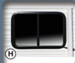
H G20 rated tinted black framed windows with safety glass