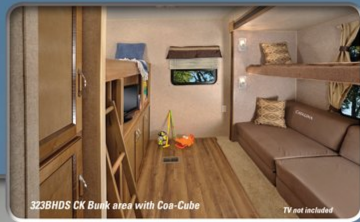
323BHDS CK Bunk area with Coa-Cube

The Catalina 323BHDS CK is one of our top selling family floorplans. This slideout travel trailer floorplan sleeps 9-10 comfortably. Have a big family? This is the floorplan for you, the 323BHDS CK has a STANDARD full size camp kitchen that includes a refrigerator, camp stove, overhead cabinets, silverware and utility drawers, and the hot and cold water at the sink drains into it's own 30 gallon holding tank. This is a great way to feed the hungry troops while keeping the mess outside.