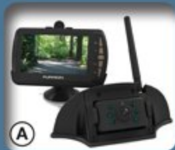
A Wireless Rear vision camera prep (Camera not included)