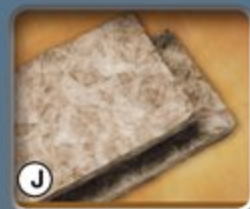
J Full 6 sided R-7 eco-batt insulation. This is a new and sustainable technology