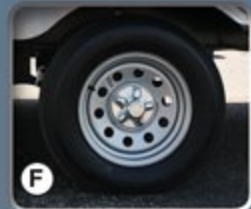
F Catalina's exclusive tire and rim package includes: radial tires, polished aluminum fender skirts and e-coat maintenance free rims