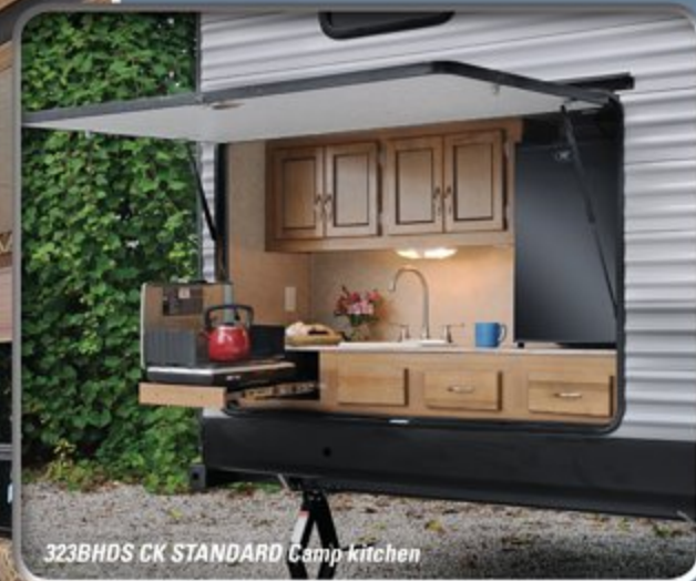
323BHDS CK STANDARD Camp Kitchen