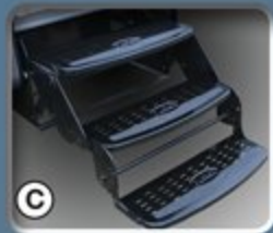
C Radius triple entry step (Double non slide models)