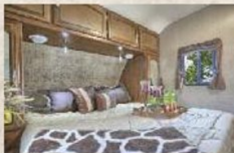
271 BL has a private a 60" x 80" walk around bed in the private Master bedroom and plenty of storage.