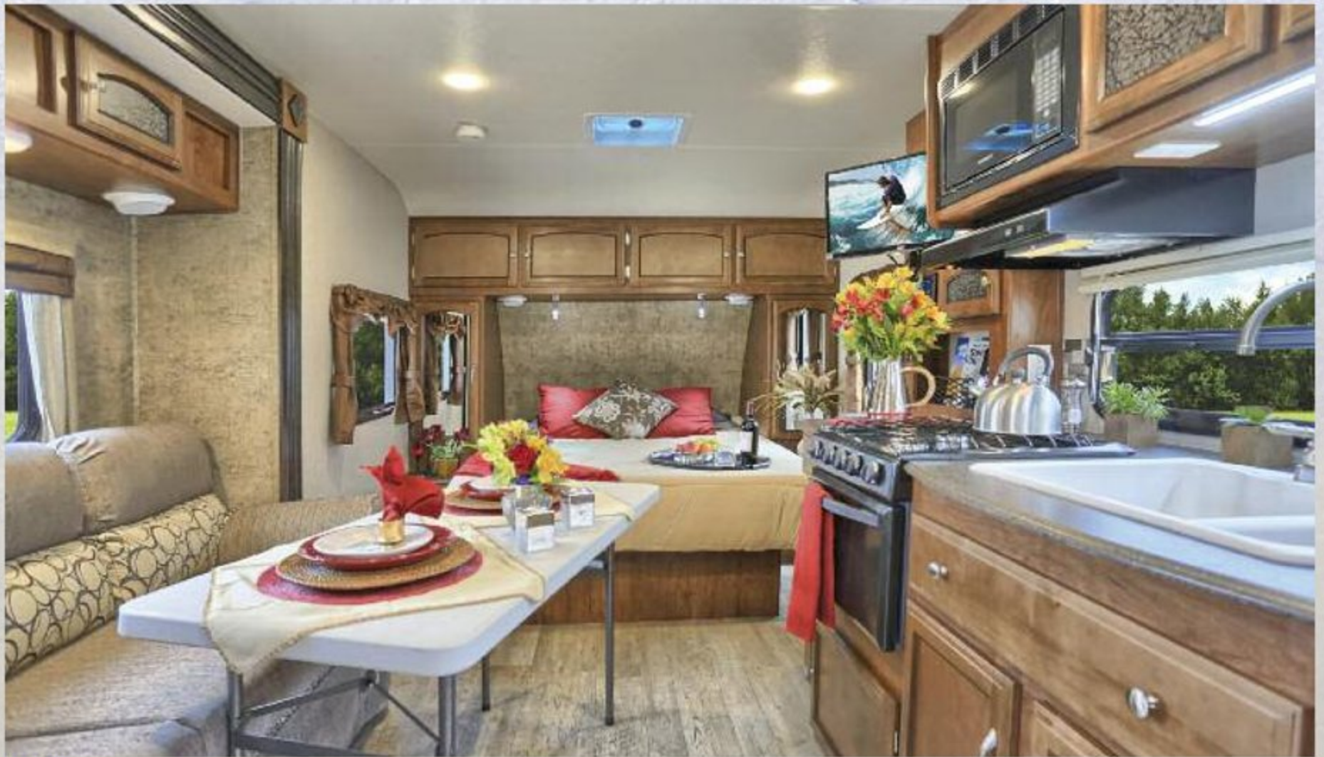
192 RBS This very lightweight, open floorplan can easily be towed by smaller SUVs and is big on comfort with contemporary appliances and convenient amenities for enjoyable weekends. This model is equipped with two tables, one indoor/outdoor table from the entertainment package (above) and a seamless countertop table that is stored under the bed for easy access. Shown in Cashmere decor.