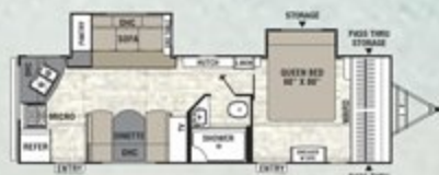
276 RKDSLE ♦ Exterior Length 31' 6"