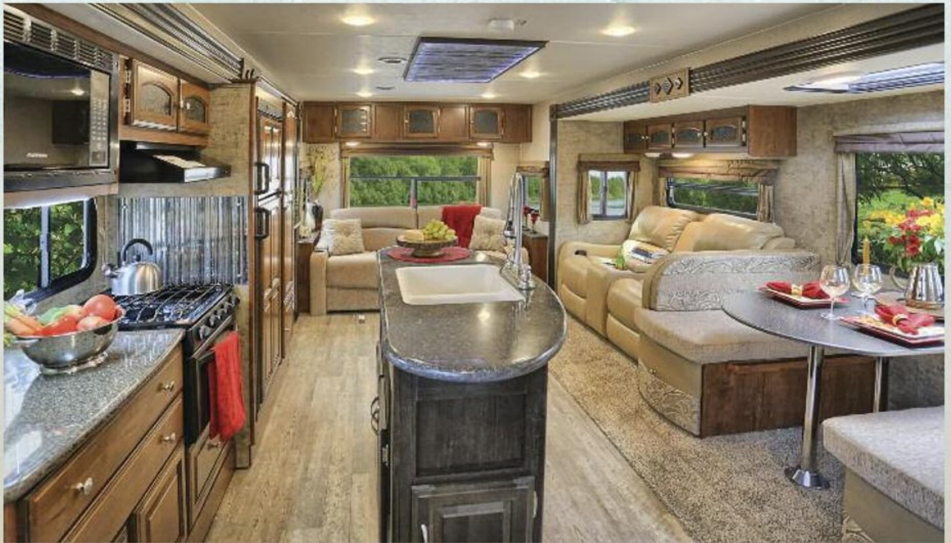
322 RLDS The Liberty Edition (Maple Leaf Edition in Canada) includes high end amenities usually reserved for travel trailers and fifth wheels costing thousands of dollars more. Family and friends will appreciate the extra amenities offered in this luxury upgrade including: LG solid surface counters, residential glass backsplash - even plush theater seating for kicking back on a rainy day, plus much more! Shown in Sunset decor.