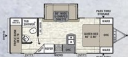
229 TBS ♦ Exterior Length 26' 9"