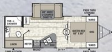
231 RBDS ♦ Exterior Length 26' 10"