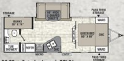
23 SE ♦ Exterior Length 27' 3"