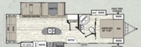
322 RLDLSLE ♦ Exterior Length 35' 11"