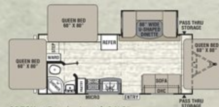
23 TOX ♦ Exterior Length 24' 3"

23 TOX Sleep up to 10 people with plenty of storage to hold everyone's camping supplies. This spacious expandable has a large living area and kitchen along with a fully enclosed bathroom and three 60" x 80" queen beds. Shown in Sandstone decor.