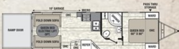
271 BL ♦ Exterior Length 30' 11"

Whether you're hauling mini-bikes or motocross, four wheelers or Fat Boys, there's a Freedom Express Toy Hauler for you. The 271BL has a front walk-around queen bed, large bathroom with abundant storage and a 10' open garage to haul all of your toys. The Deep Slide 301BLDS has a 10' enclosed garage with a slider patio door. Both models have raised roof lines and a beavertail ramp transition.