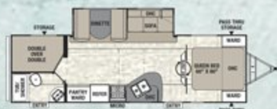
282 BHDLSLE ♦ Exterior Length 31' 11"