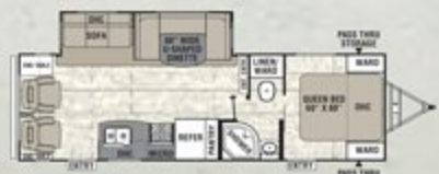
281 RLDLSLE ♦ Exterior Length 31' 8"