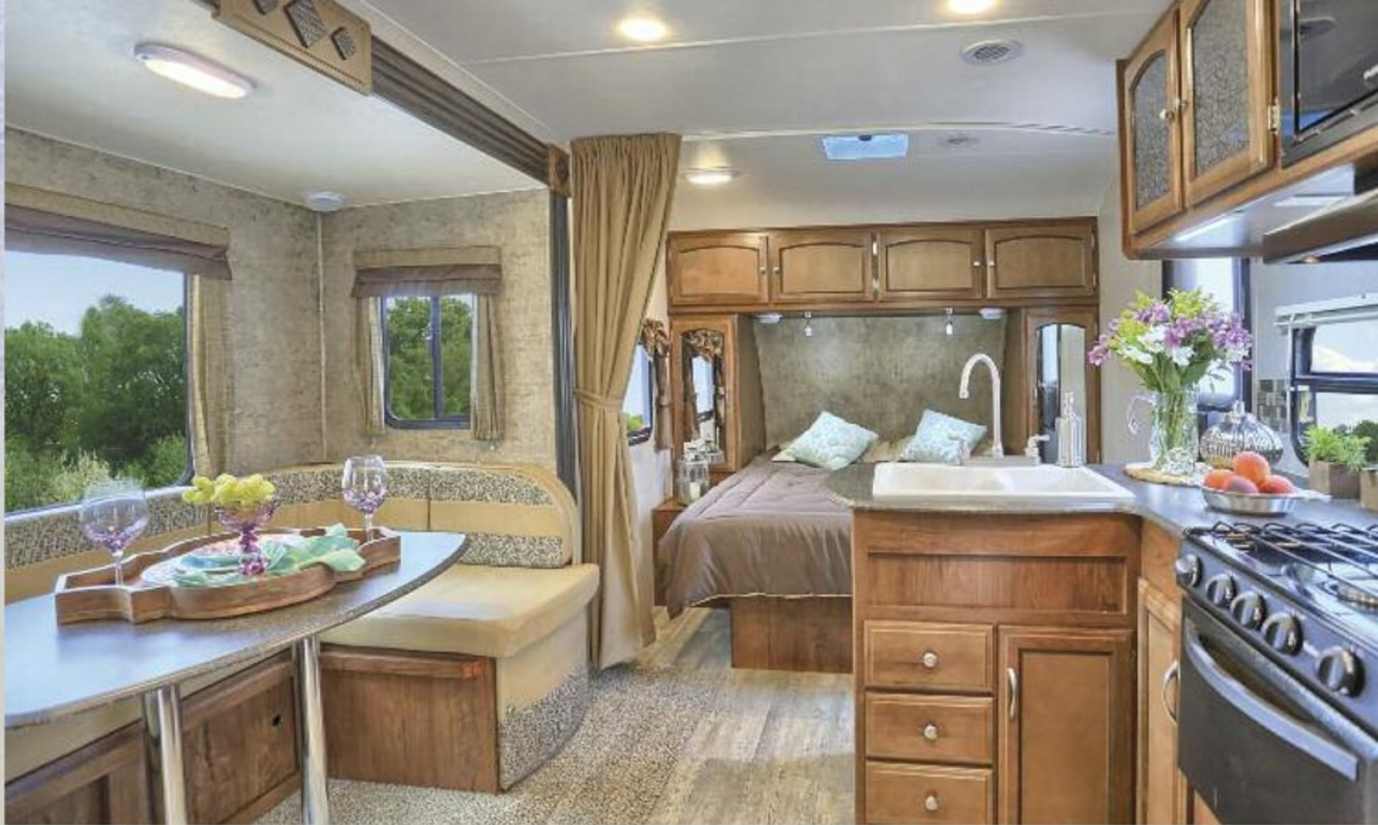
229 TBS features a 60" x 80" full walk around queen bed, impressive master bedroom storage, spacious counters and a second entry door for convenience. Shown in Sandstone decor.