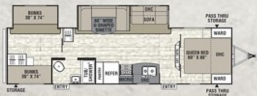
31 SE ♦ Exterior Length 35' 7"