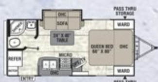
192 RBS ♦ Exterior Length 22' 6"