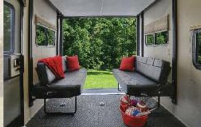
301 BLDS Find your Freedom! This large capacity, open garage is an outdoor enthusiast's home base. Shown in Chestnut decor.