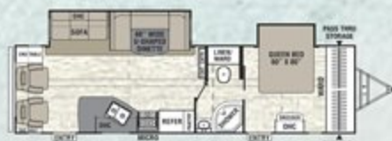
297 RLDLSLE ♦ Exterior Length 35' 2"