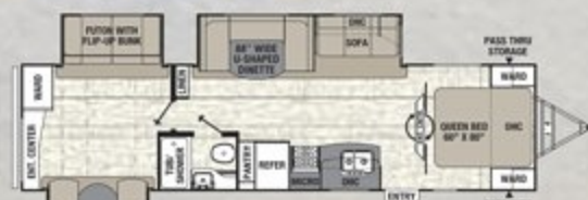
312 BHDS ♦ Exterior Length 36' 9"