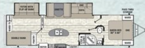
320 BHDLSLE ♦ Exterior Length 36' 11"