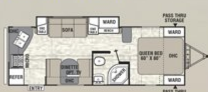
246 RKS ♦ Exterior Length 28' 3"