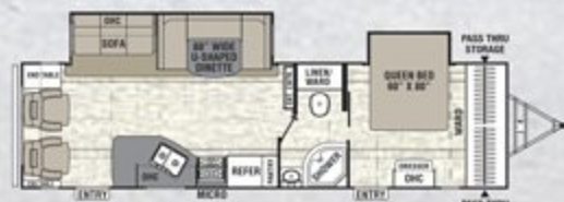
297 RLDS ♦ Exterior Length 35' 2"