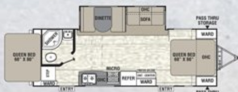
254 DSX ♦ Exterior Length 29' 7"