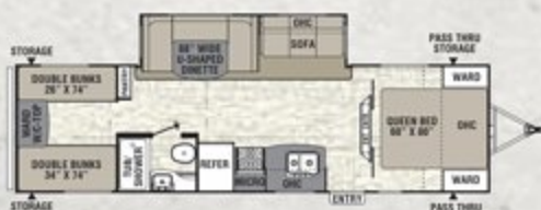
29 SE ♦ Exterior Length 33' 5"