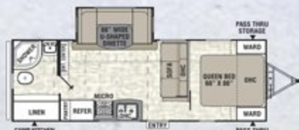
248 RBS ♦ Exterior Length 28' 11"