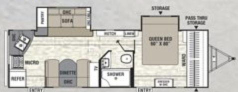
276 RKDS ♦ Exterior Length 31' 6"