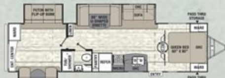
312 BHDLSLE ♦ Exterior Length 36' 9"