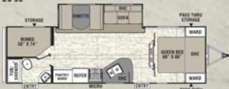
28 SE ♦ Exterior Length 31' 11"