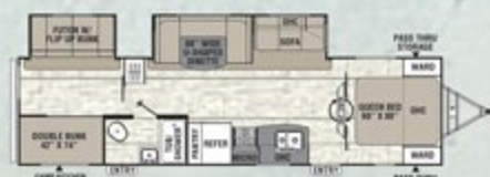
310 BHDLSLE ♦ Exterior Length 35' 7"