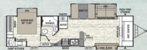
321 FEDSLE ♦ Exterior Length 36' 11"