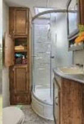
271 BL has a glass shower, linen storage and an extended counter.

*Unloaded vehicle weights do not include options. Please refer to back cover for definitions of chart descriptions.