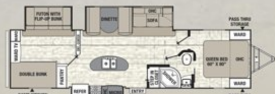
320 BHDS ♦ Exterior Length 36' 11"