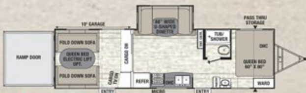
301 BLDS ♦ Exterior Length 33' 7"