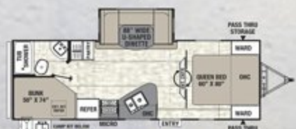
257 BHS ♦ Exterior Length 28' 7"