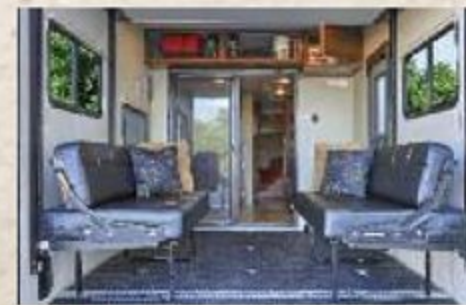
301 BLDS This versatile, lightweight 10' open garage model has a sliding glass door for two separate living areas and is perfect for taking your show on the road.