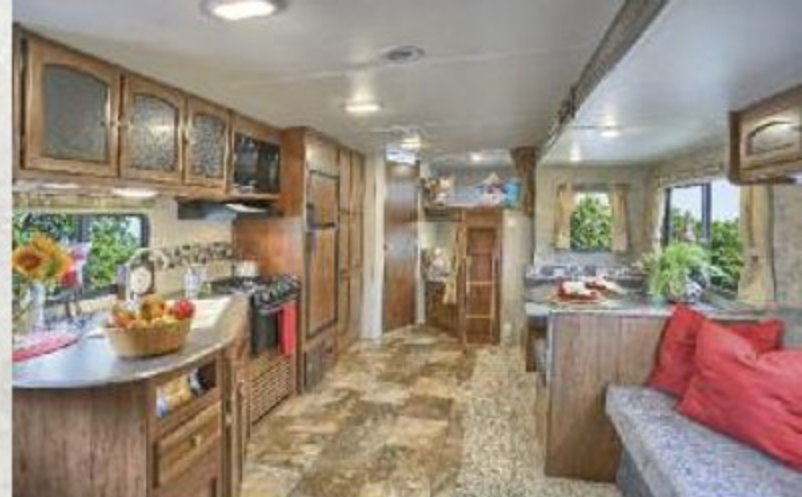
28 SE This family-friendly model includes easy access, double-over-double bunks, plenty of counter space, solid master bedroom doors for privacy, and two convenient entrances. Shown in Platinum decor.