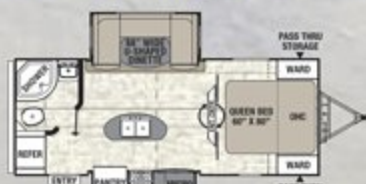
233 RBS ♦ Exterior Length 24' 11"