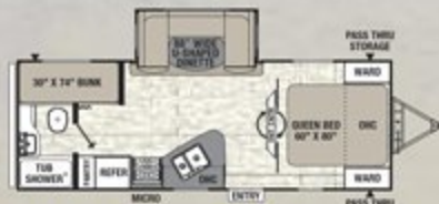
236 BHS ♦ Exterior Length 27' 3"