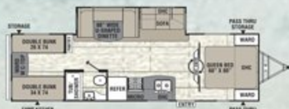
292 BHDLSLE ♦ Exterior Length 33' 5"