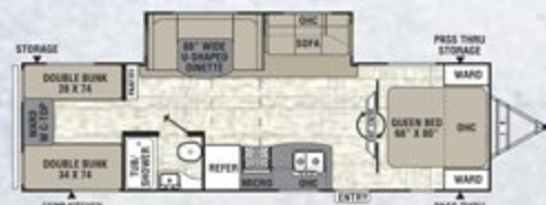
292 BHDS ♦ Exterior Length 33' 5"