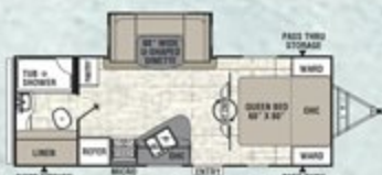
231 RBDLSLE ♦ Exterior Length 26' 10"