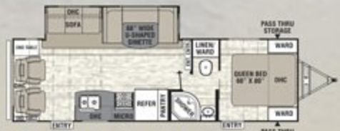
281 RLDS ♦ Exterior Length 31' 8"