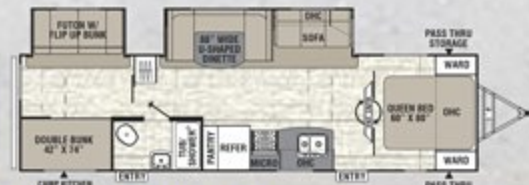
310 BHDS ♦ Exterior Length 35' 7"