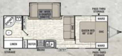
24 SE ♦ Exterior Length 28' 11"