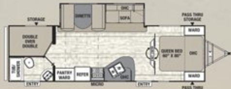
282 BHDS ♦ Exterior Length 31' 11"