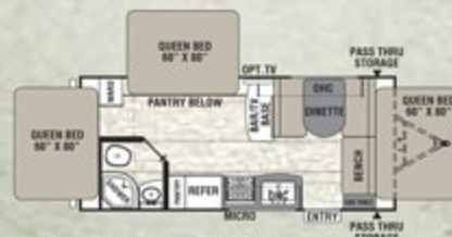
21 TOX ♦ Exterior Length 22' 7"