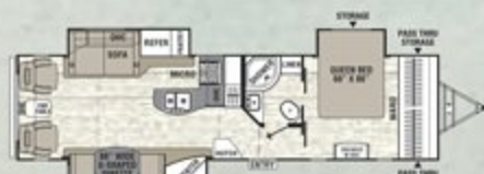
293 RLDLSLE ♦ Exterior Length 35' 11"