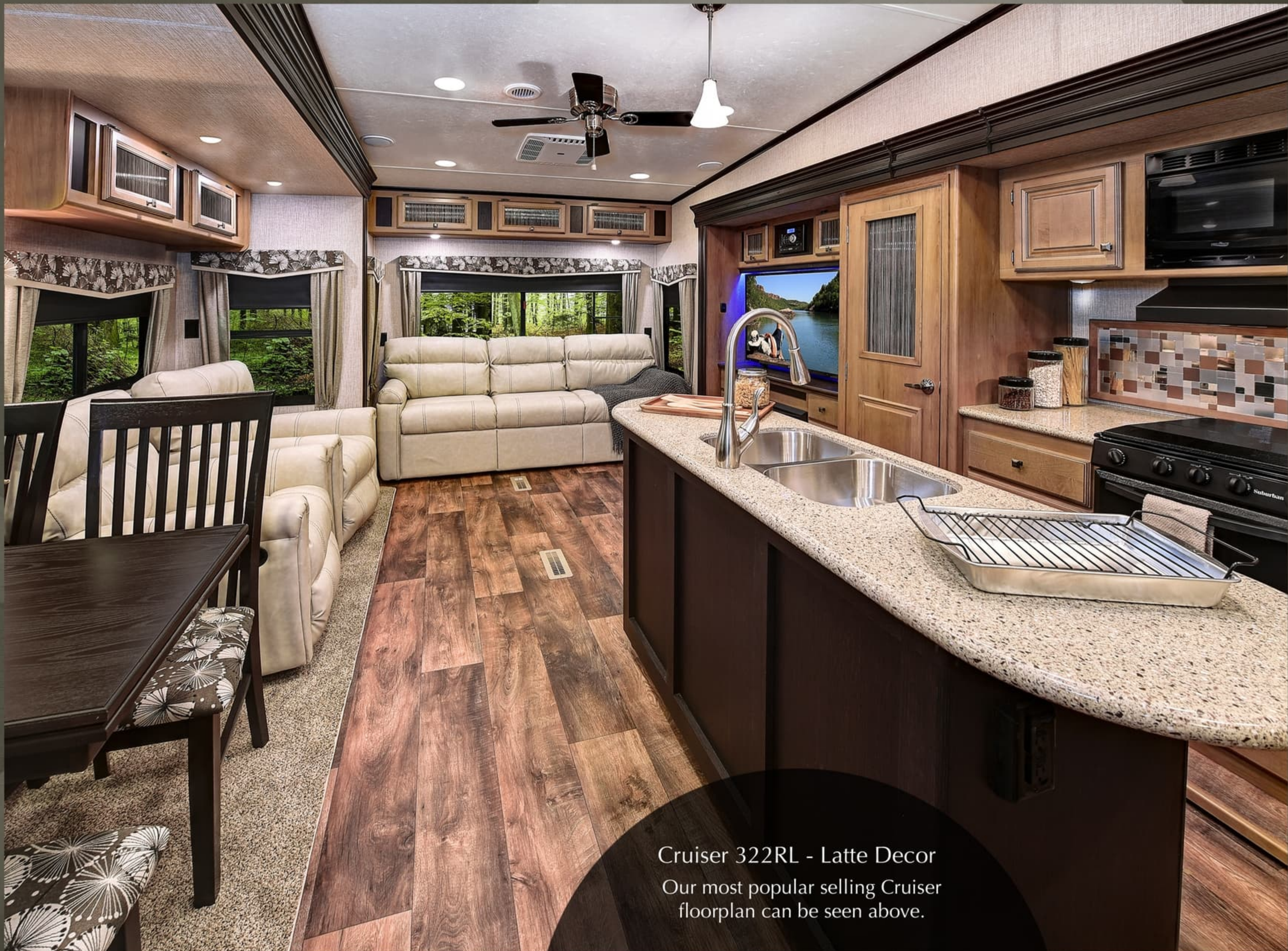
Cruiser 322RL - Latte Decor Our most popular selling Cruiser floorplan can be seen above.