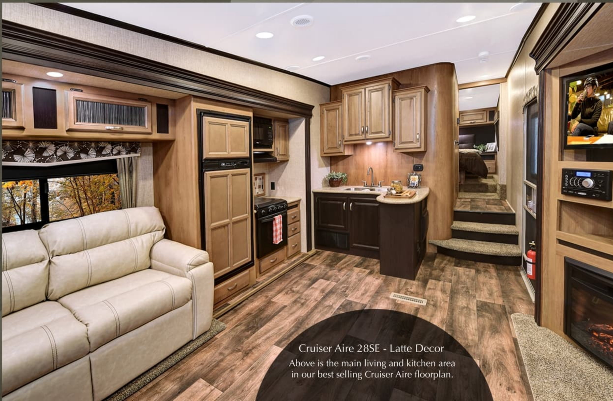
Cruiser Aire 28SE - Latte Decor Above is the main living and kitchen area in our best selling Cruiser Aire floorplan.