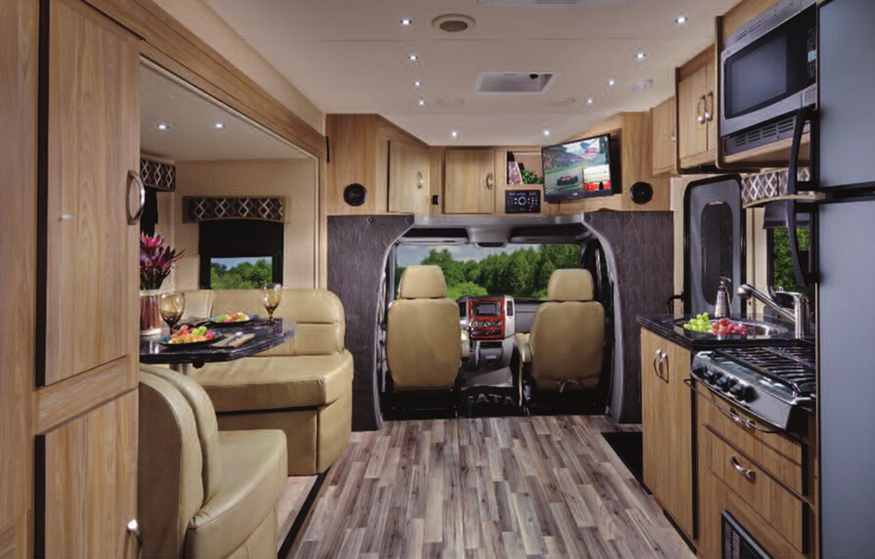
24FW shown with Pebble Décor and Delta Dust Cabinets.

At Dynamax, reaching a higher standard is not an option, it's a tradition.