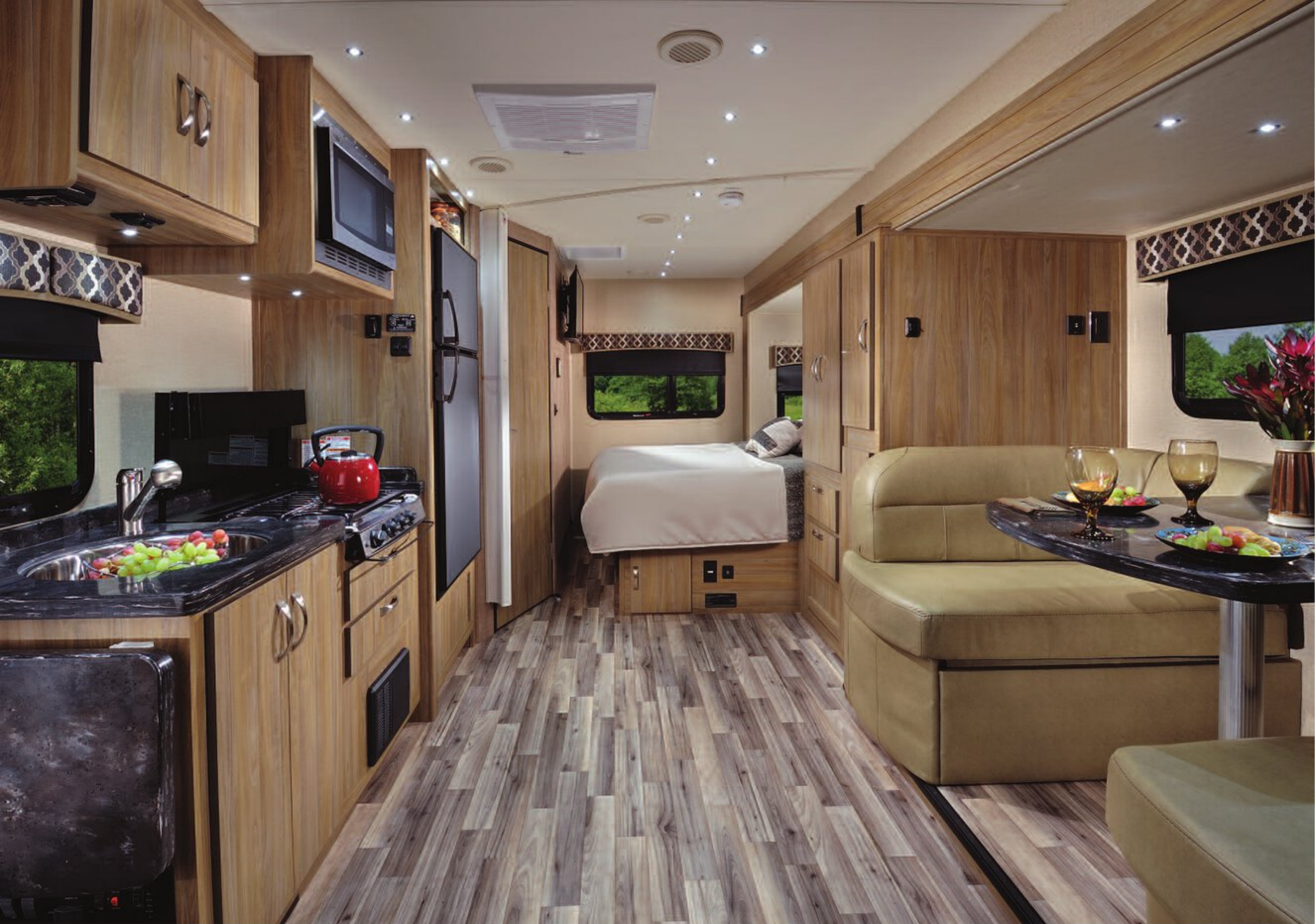
Built on the nimble Mercedes Sprinter, the Isata 3 drives small but lives large. 24FW shown above with Pebble Décor and Delta Dust cabinets.