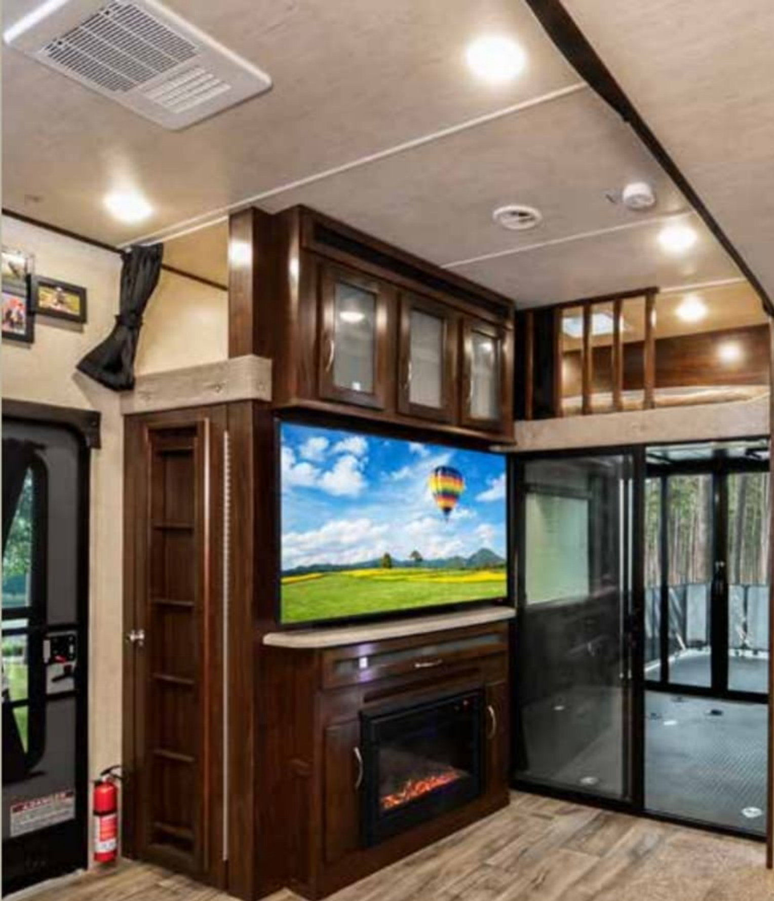
Model CY 3611 JS