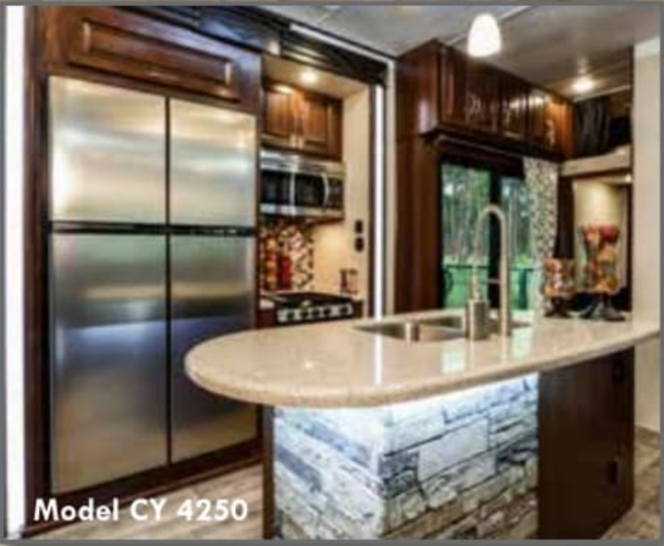
Model CY 4250