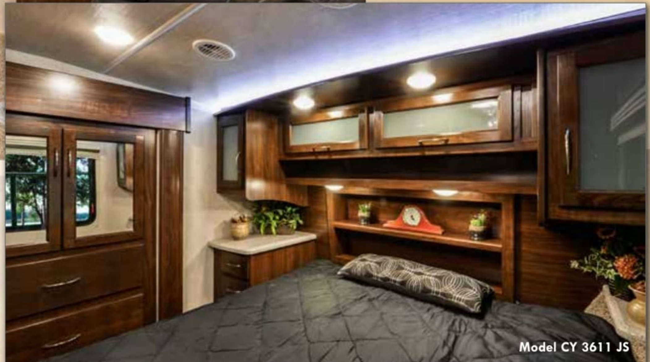
Model CY 3611 JS