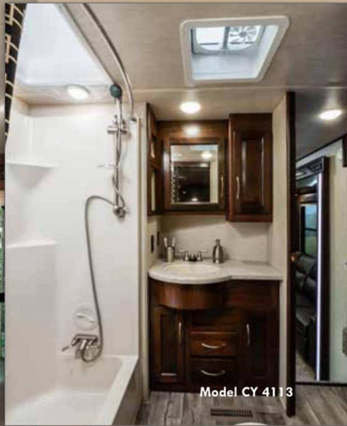
Model CY 4113