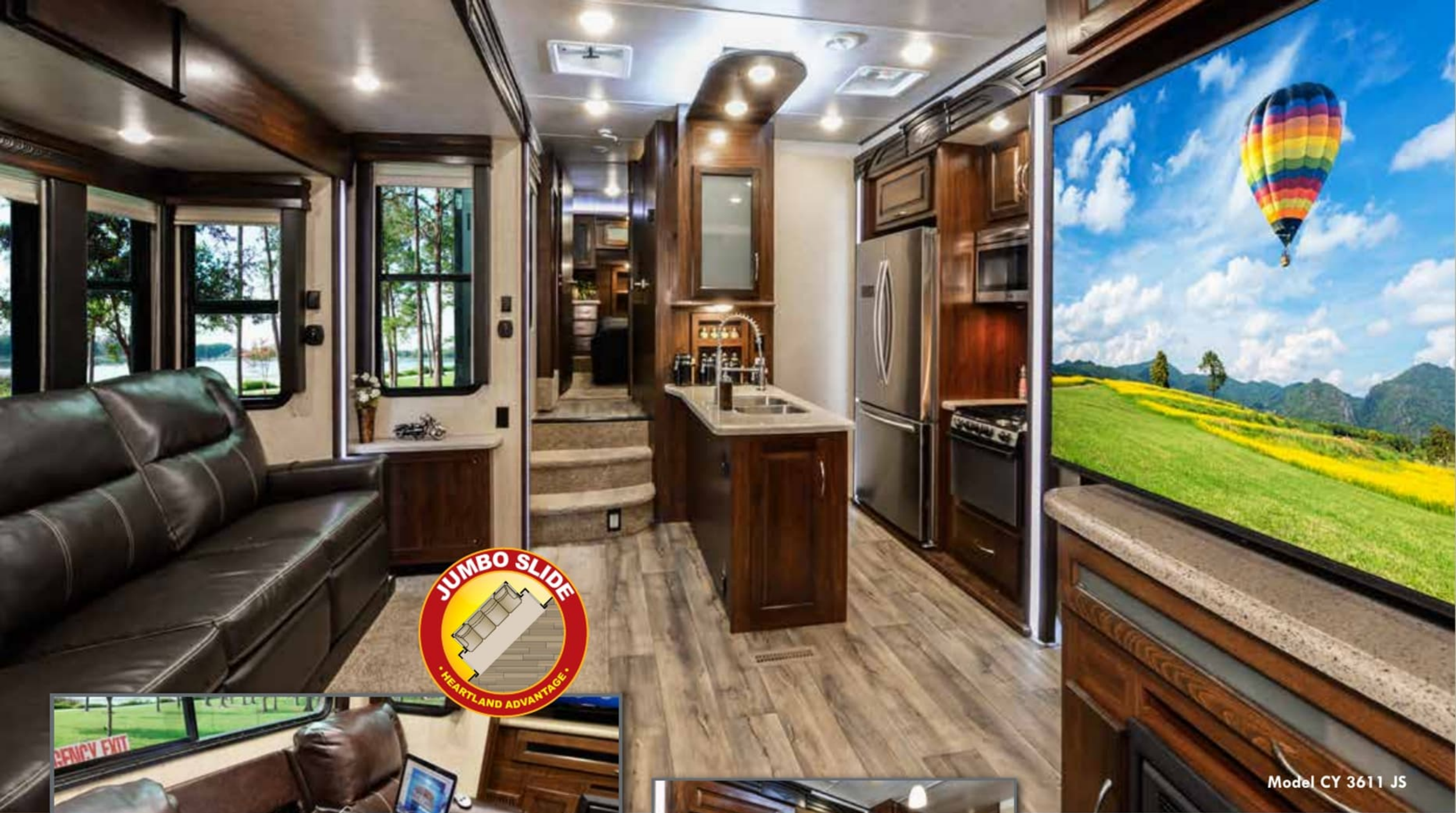
Model CY 3611 JS