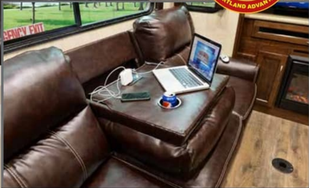
Reclining Couch with Massage and fold-down backs complete with cup holders, USB and 110 volt outlets (HD Edition only)