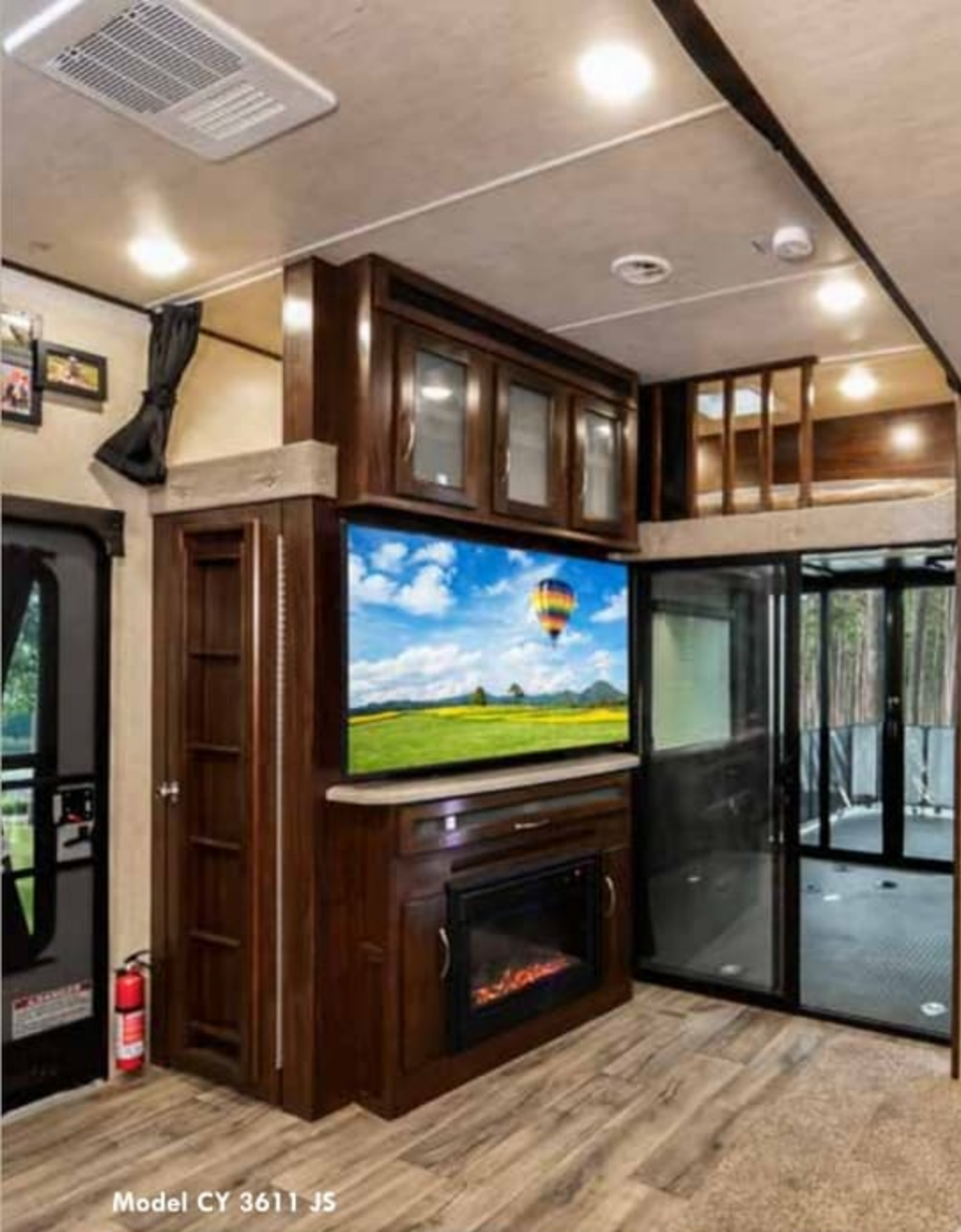
Model CY 3611 JS