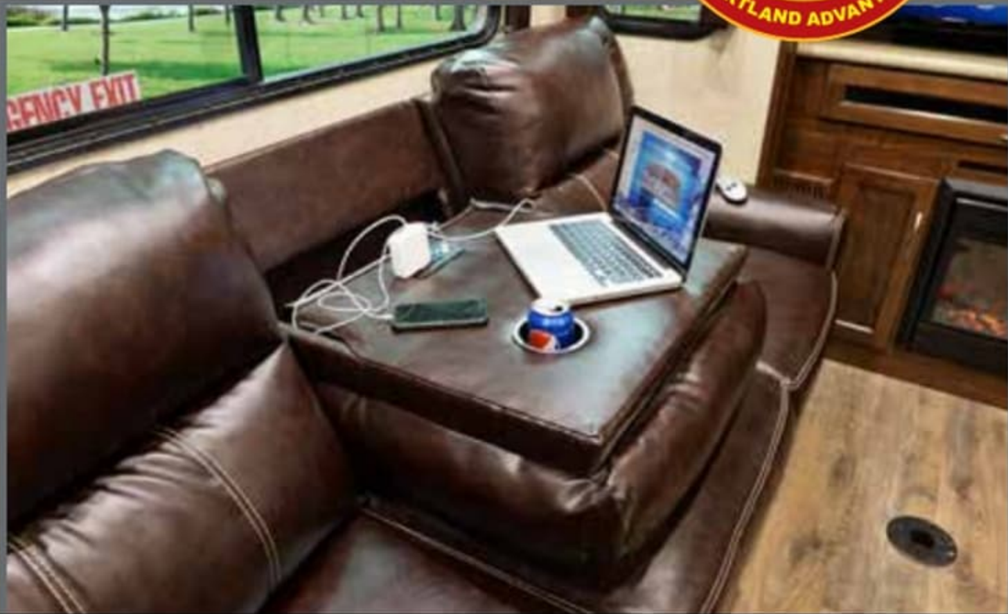
Reclining Couch with Massage and fold-down backs complete with cup holders, USB and 110 volt outlets (HD Edition only)