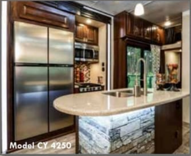
Model CY 4250