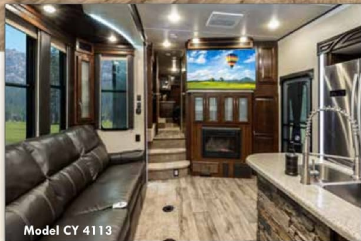
Model CY 4113