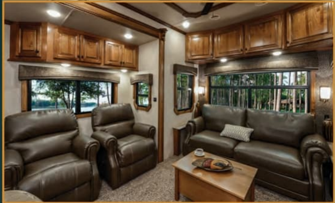
English Slate Decor