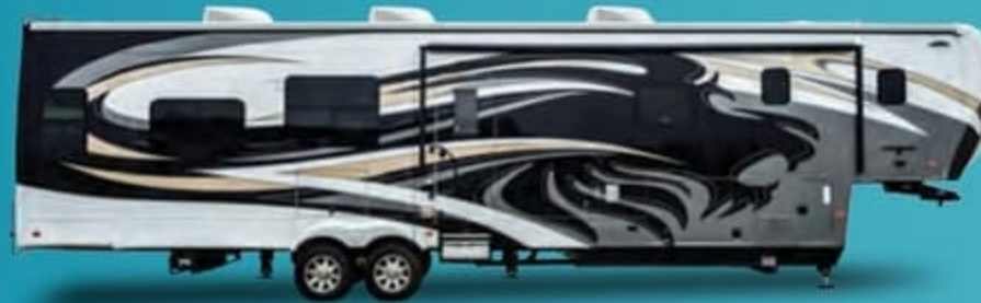
Flyin' Lion Full Body Paint