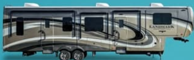
Dark Tan Full Body Paint