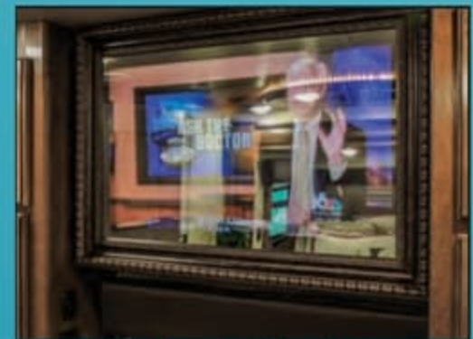
Bedroom TV mirror