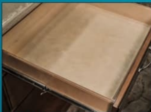
Solid maple drawer boxes