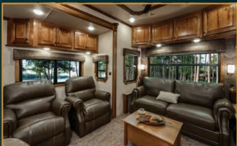
English Slate Decor