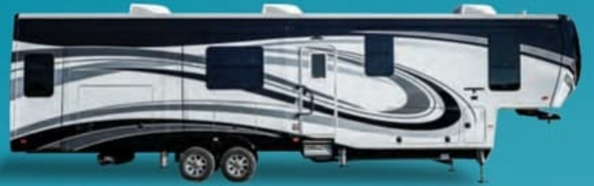
Black and Silver Partial Paint