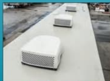
45,000 BTU cooling