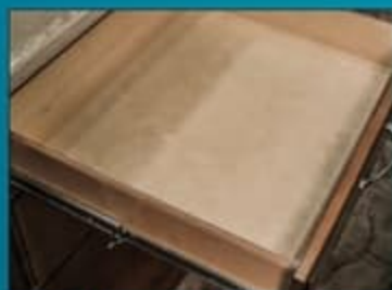
Solid maple drawer boxes