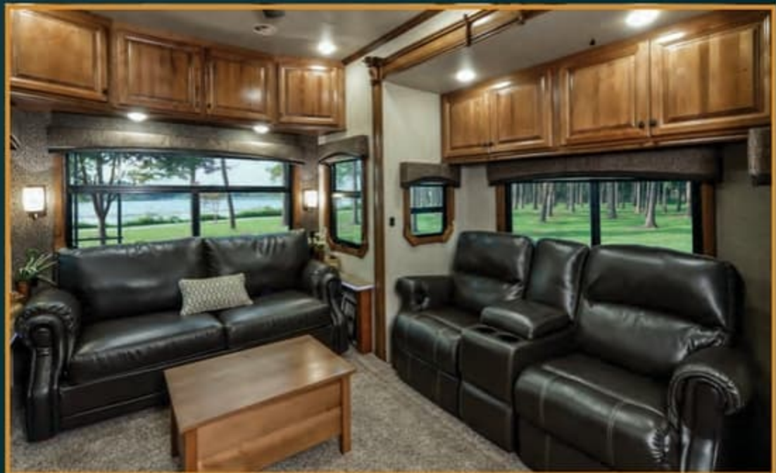
Belgian Coco Decor