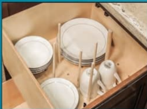
Peg storage drawer