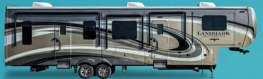
Dark Tan Full Body Paint