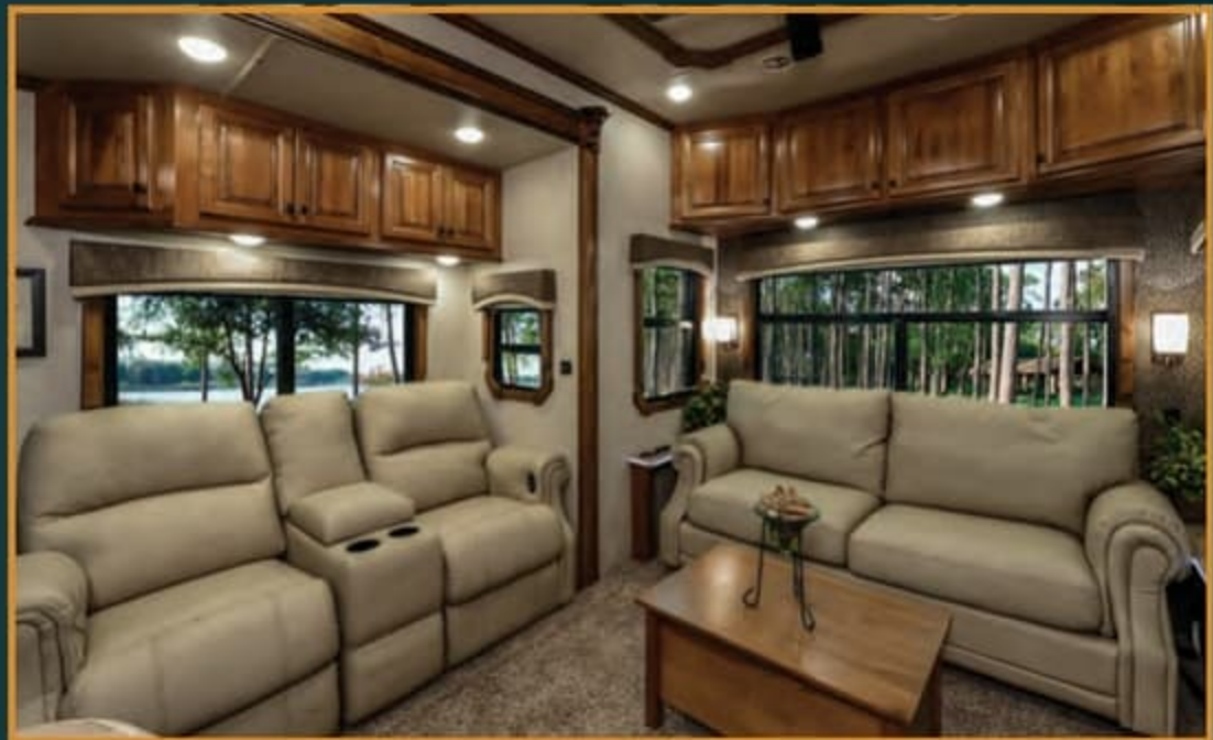
Moroccan Sand Decor