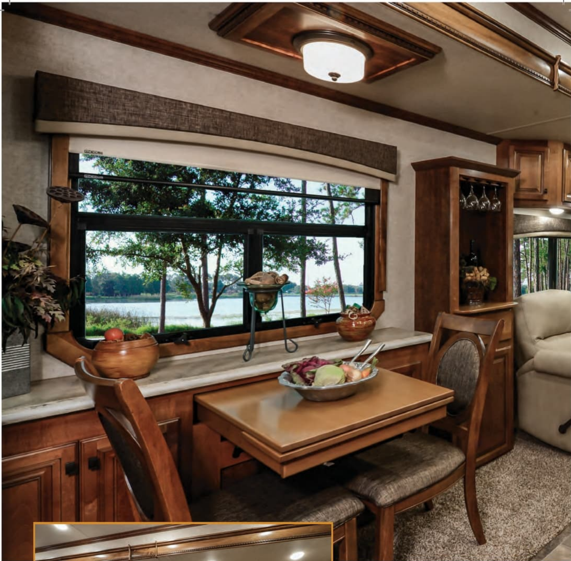
The Orlando shown in Moroccan Sand Decor.