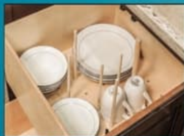
Peg storage drawer