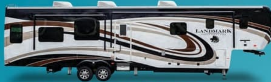
Black and Tan Partial Paint