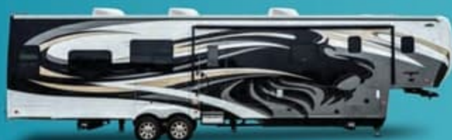
Flyin' Lion Full Body Paint