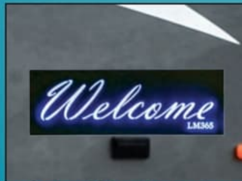
Custom LED welcome sign