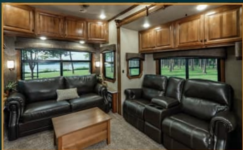
Belgian Coco Decor