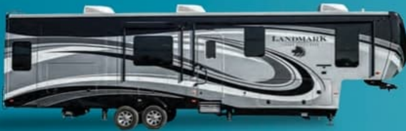
Dark Silver Full Body Paint