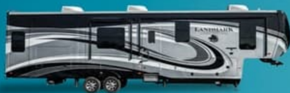
Dark Silver Full Body Paint