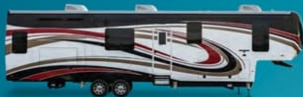
Black and Red Partial Paint