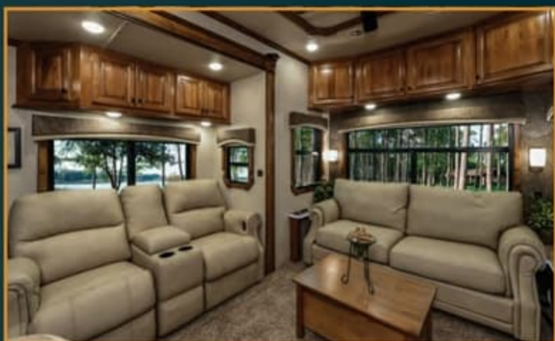
Moroccan Sand Decor