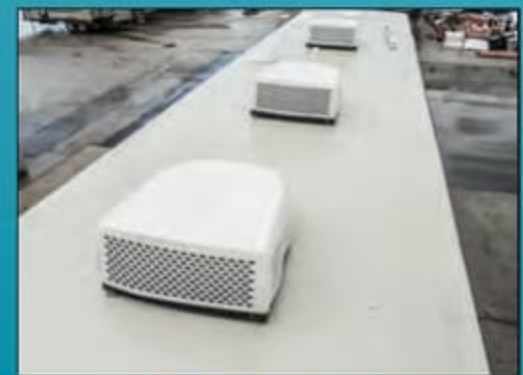
45,000 BTU cooling