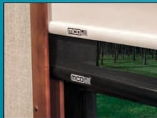
Privacy trim on windows