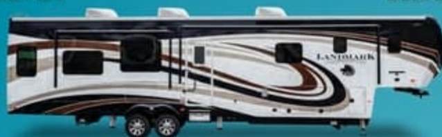
Black and Tan Partial Paint