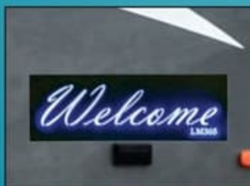
Custom LED welcome sign