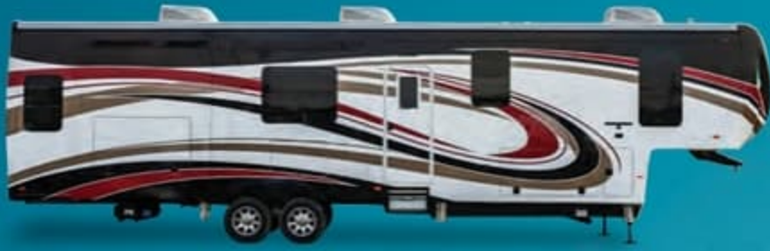
Black and Red Partial Paint