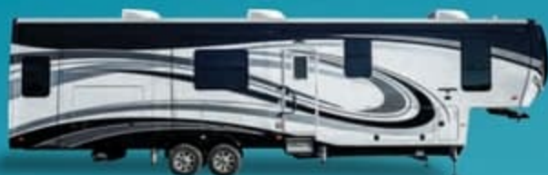
Black and Silver Partial Paint