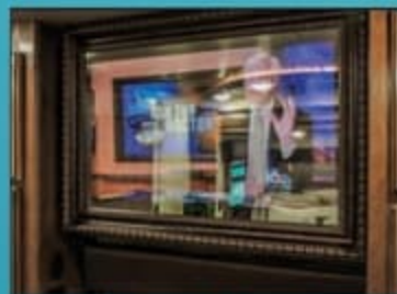
Bedroom TV mirror