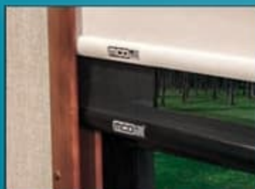
Privacy trim on windows