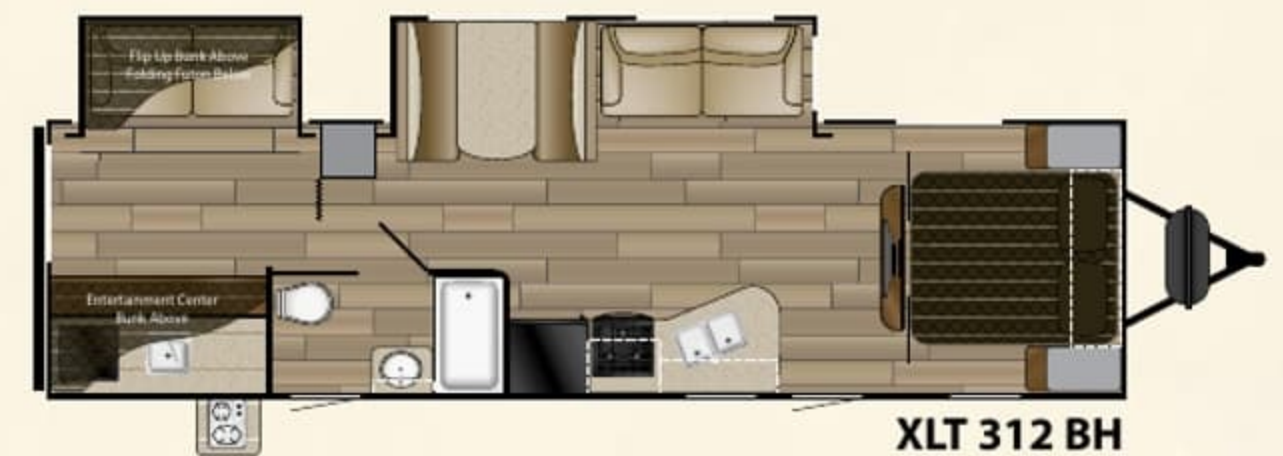
XLT 312 BH