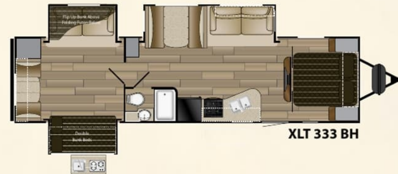
XLT 333 BH