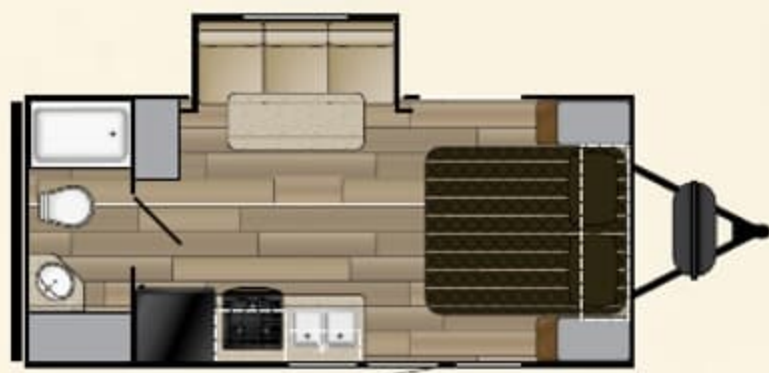
XLT 191 WB