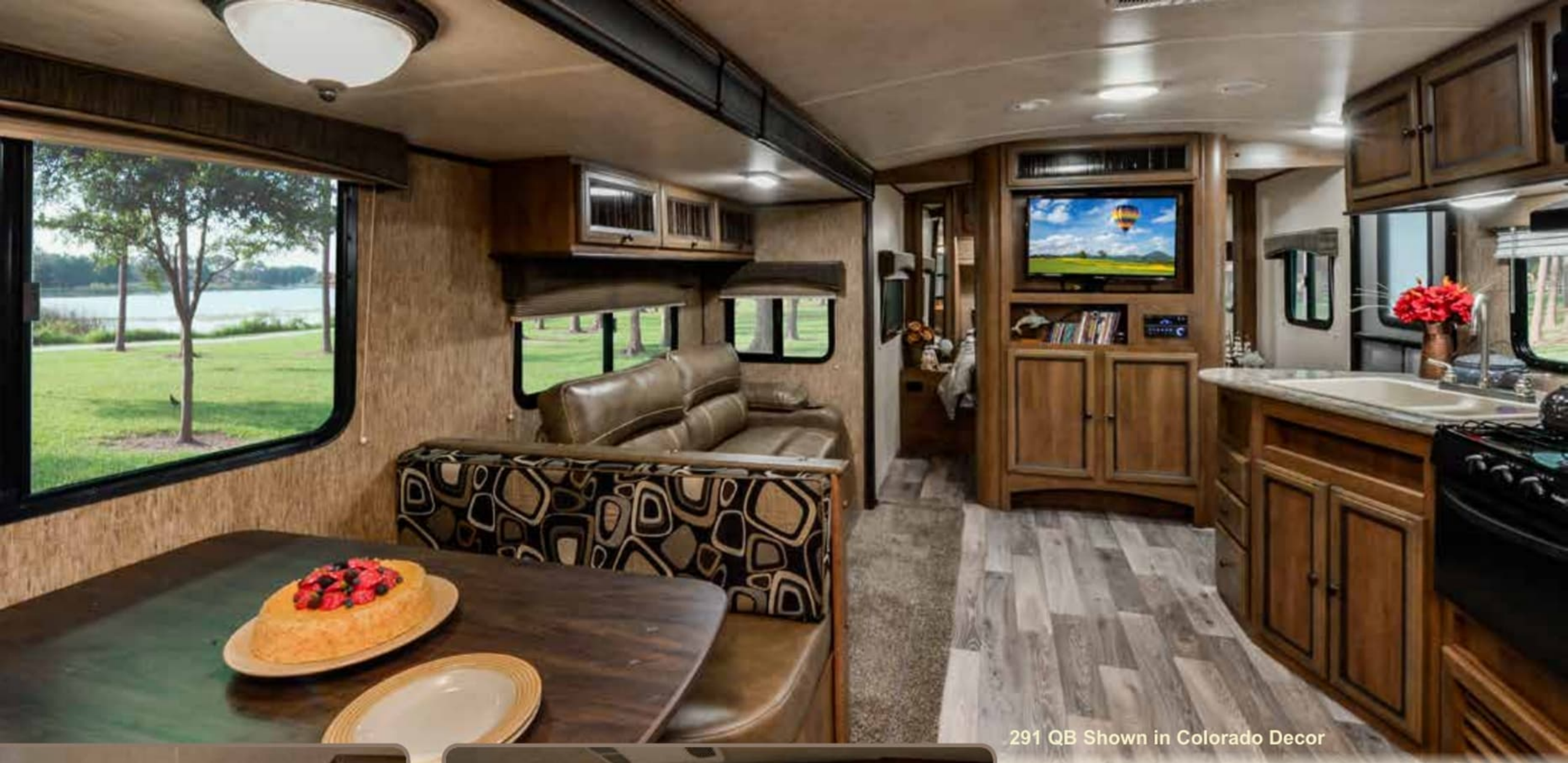
291 QB Shown in Colorado Decor