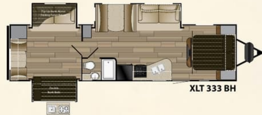
XLT 333 BH