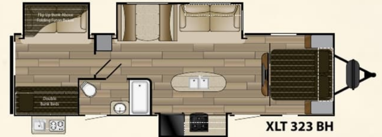
XLT 323 BH