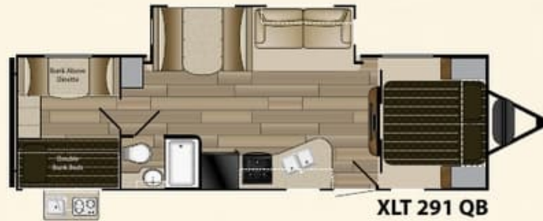
XLT 291 QB