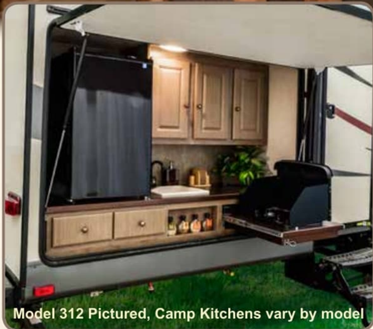
Model 312 Pictured, Camp Kitchens vary by model