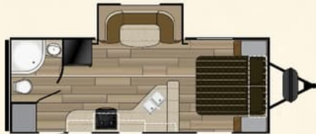
XLT 221 RB