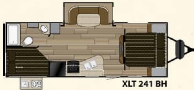
XLT 241 BH