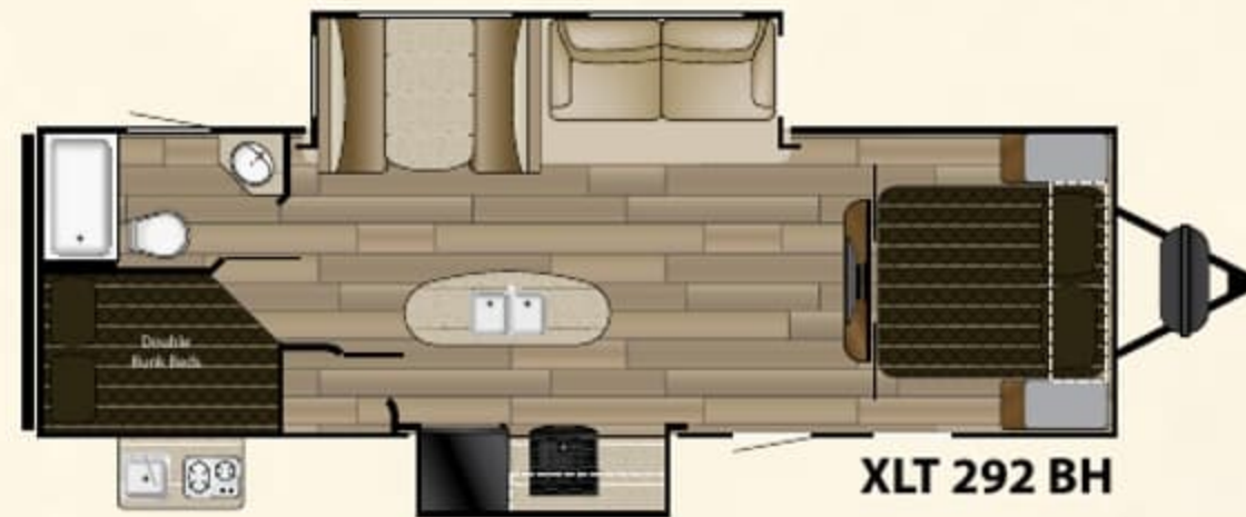
XLT 292 BH