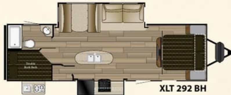
XLT 292 BH