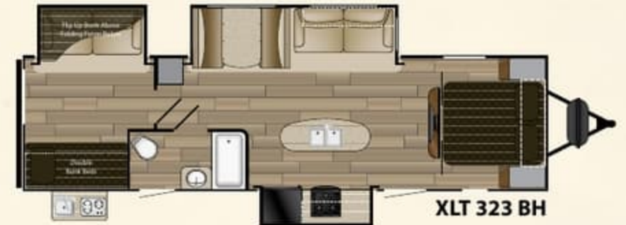
XLT 323 BH