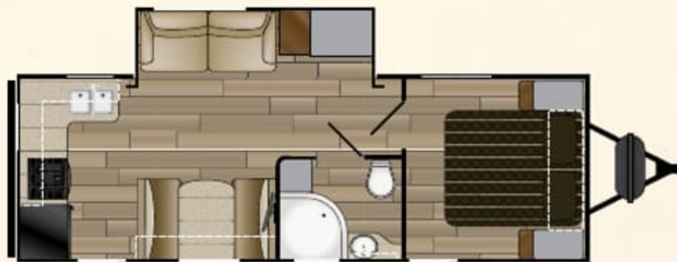
XLT 261 RK