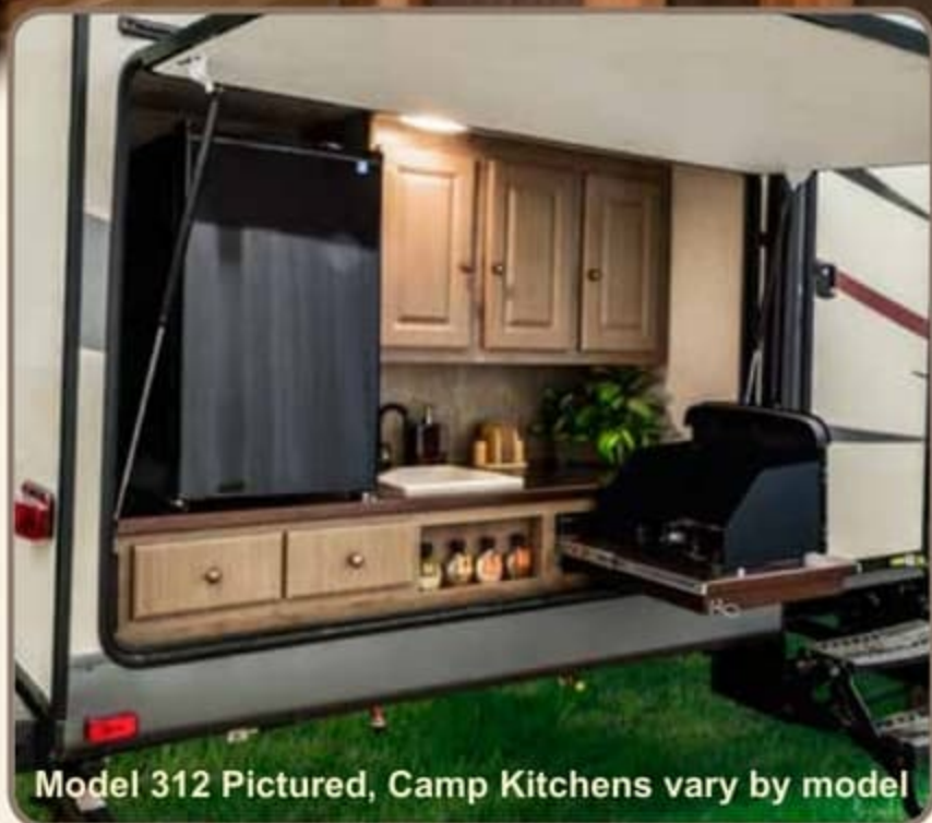
Model 312 Pictured, Camp Kitchens vary by model