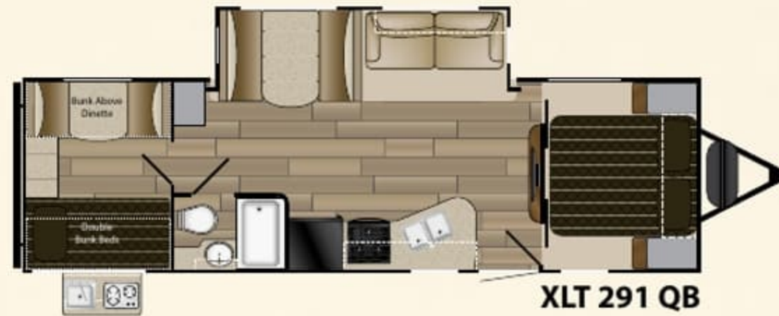
XLT 291 QB