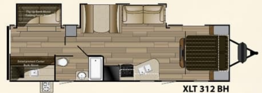
XLT 312 BH