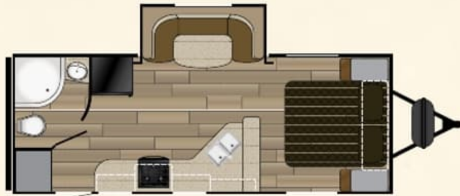
XLT 221 RB