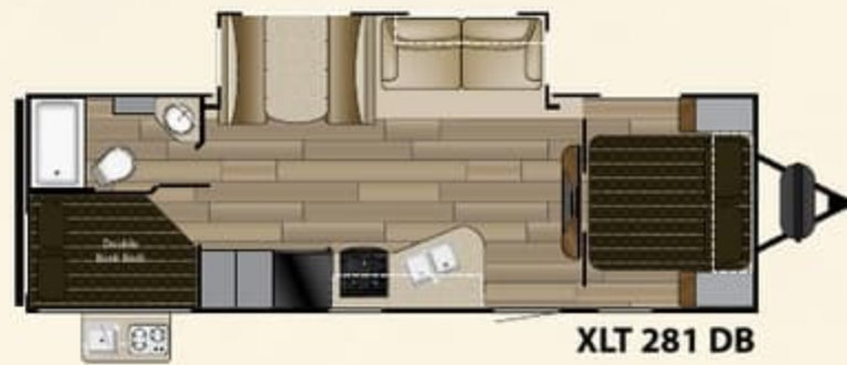
XLT 281 DB