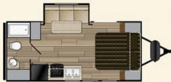
XLT 191 WB