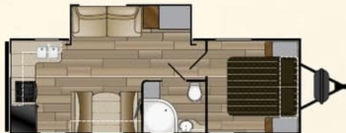
XLT 261 RK