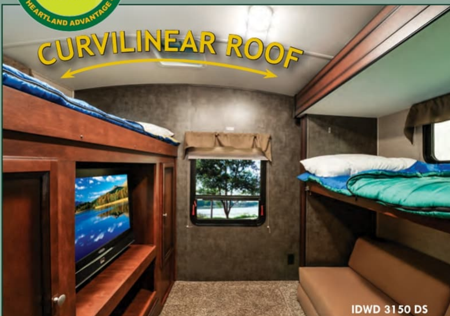
IDWD 3150 DS