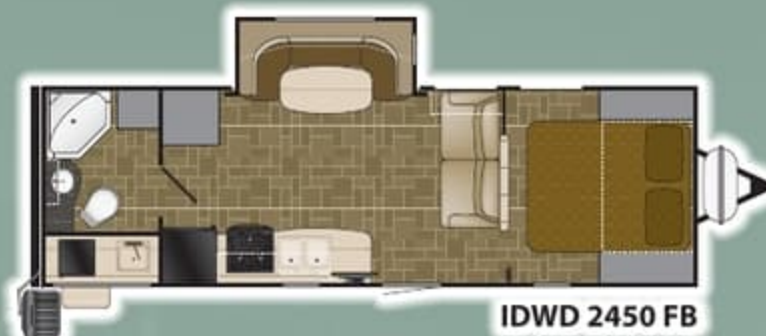
IDWD 2450 FB