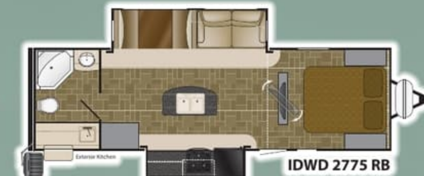
IDWD 2775 RB