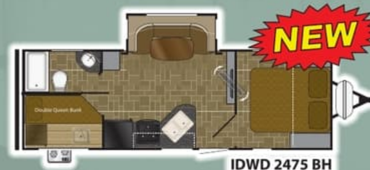
IDWD 2475 BH