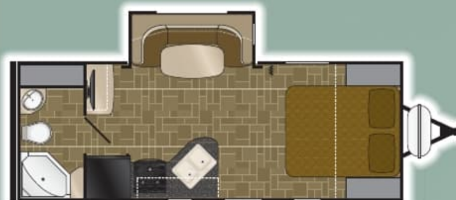
IDWD 2175 RB