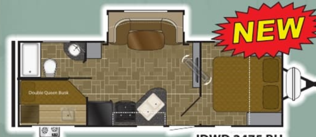
IDWD 2475 BH