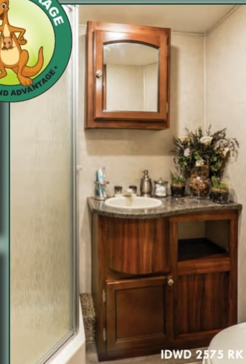
IDWD 2575 RK