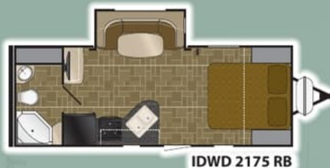
IDWD 2175 RB