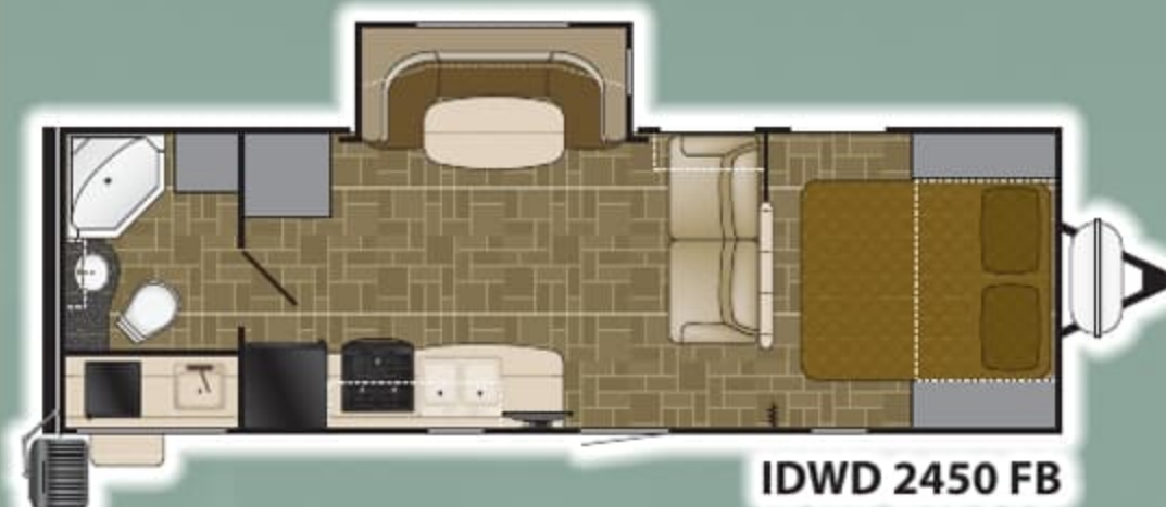
IDWD 2450 FB