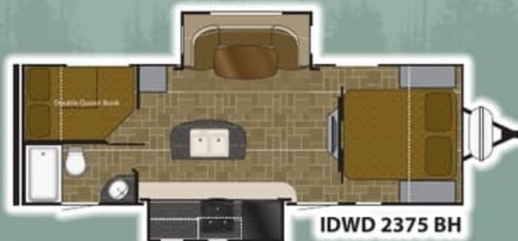
IDWD 2375 BH