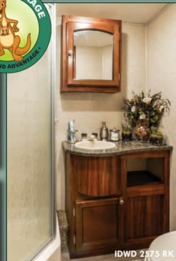
IDWD 2575 RK