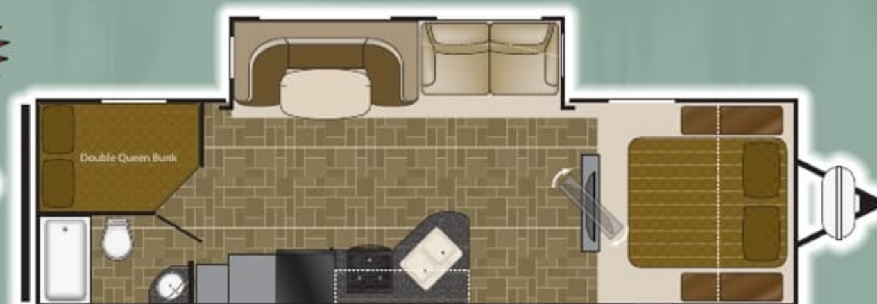
IDWD 2850 BH