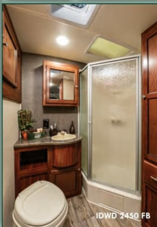
IDWD 2450 FB