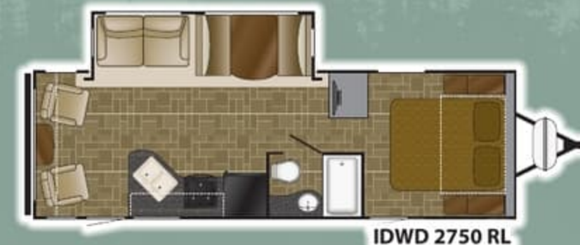
IDWD 2750 RL