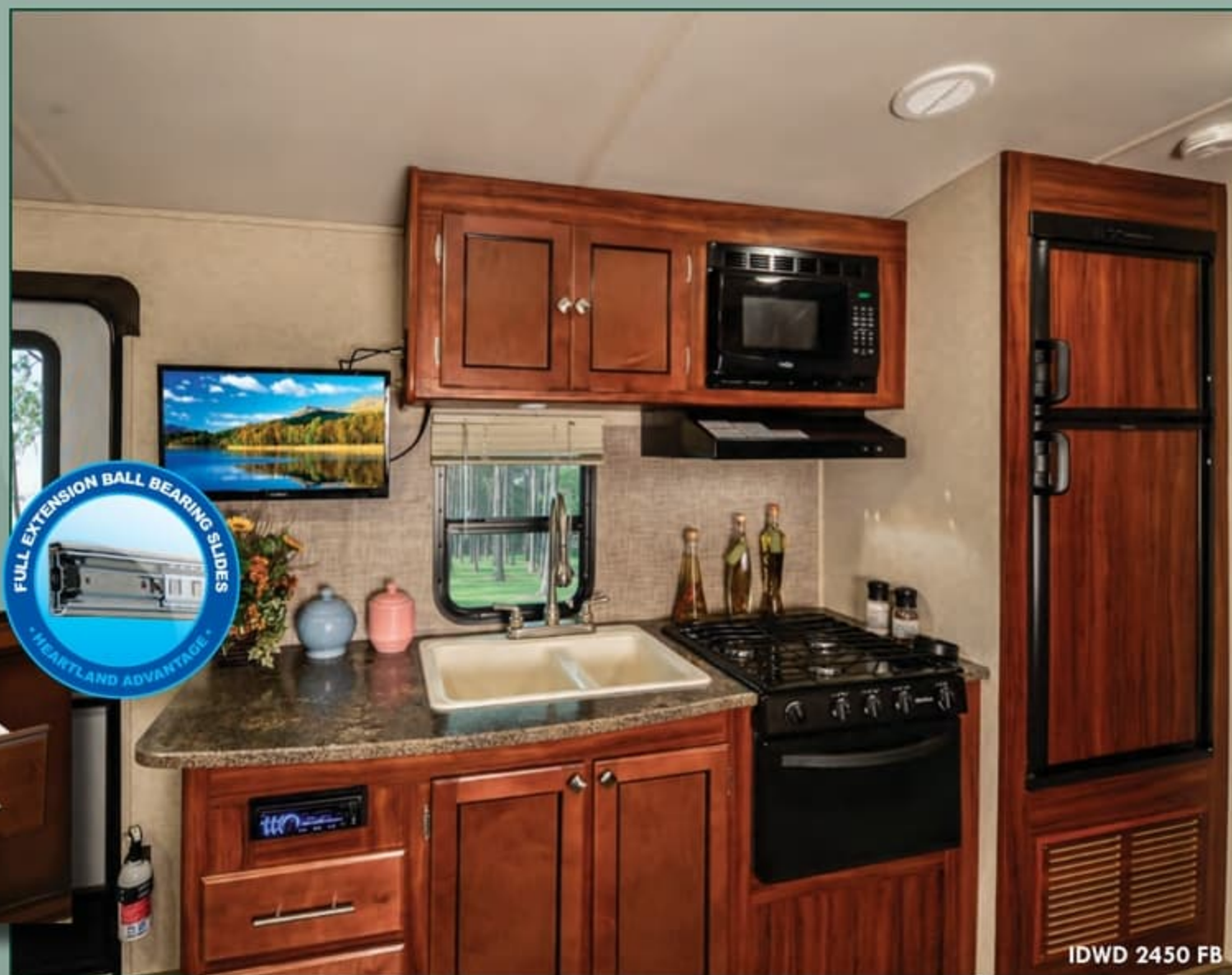
IDWD 2450 FB