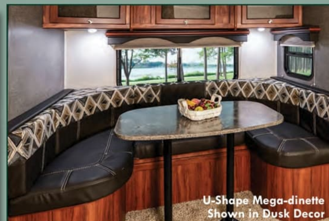
U-Shape Mega-dinette Shown in Dusk Decor