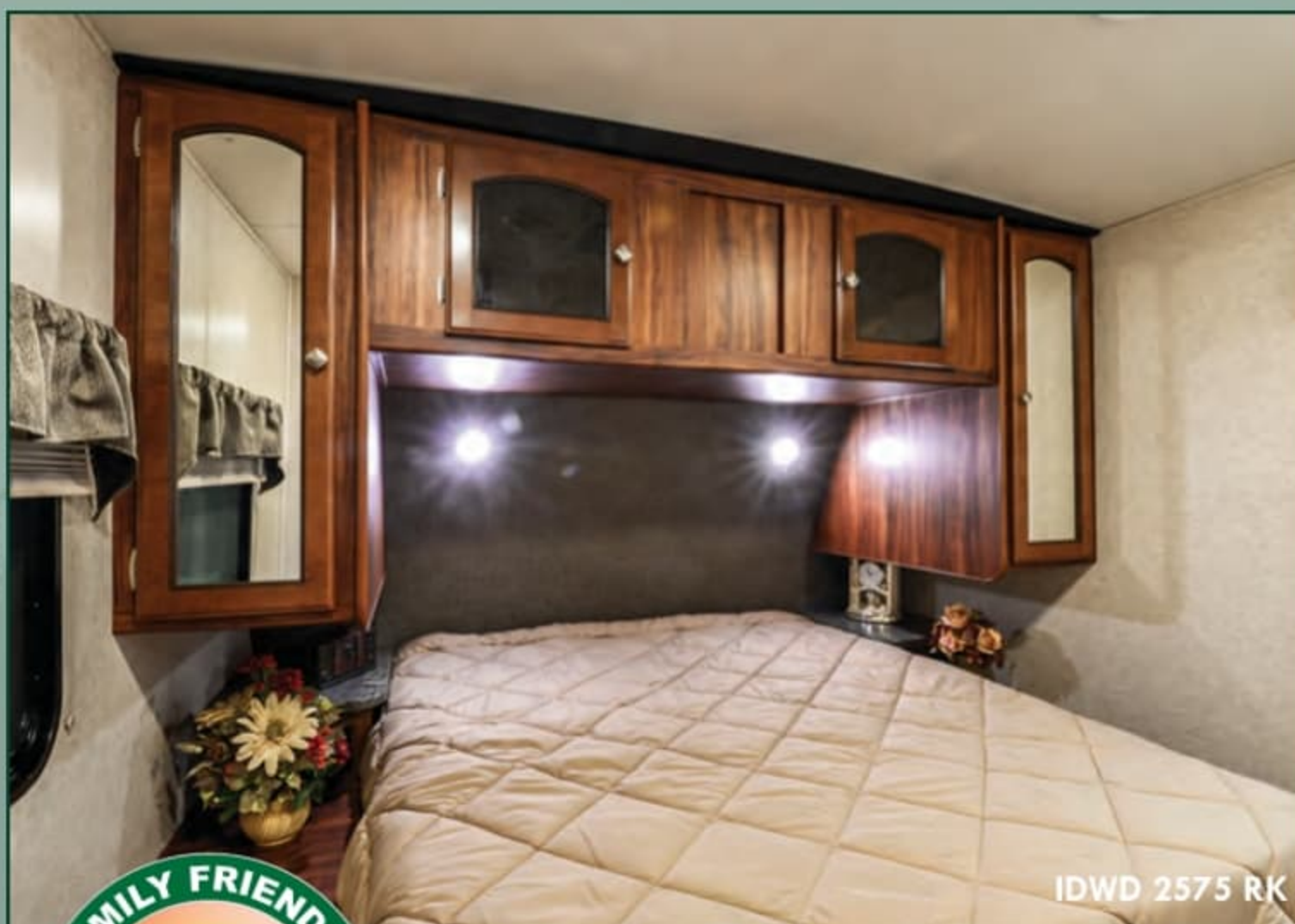
IDWD 2575 RK