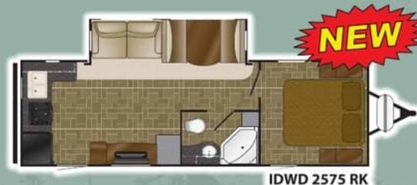
IDWD 2575 RK