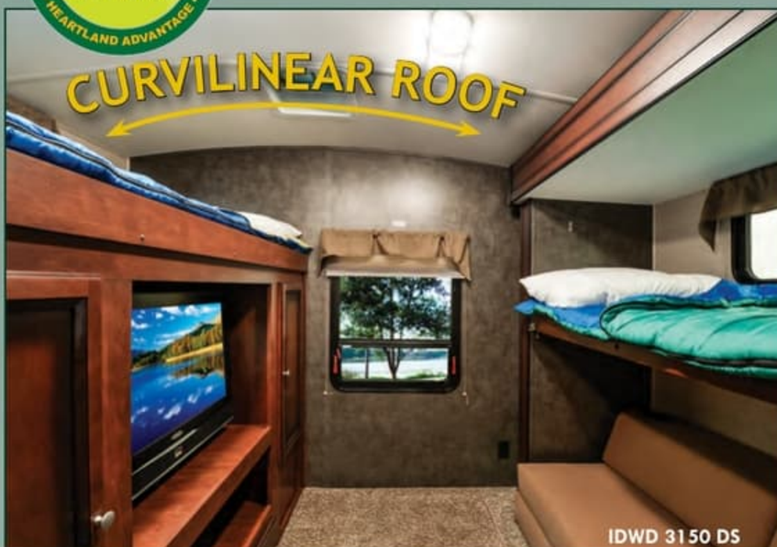
IDWD 3150 DS