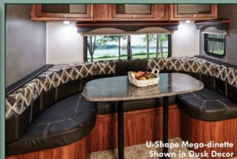
U-Shape Mega-dinette Shown in Dusk Decor