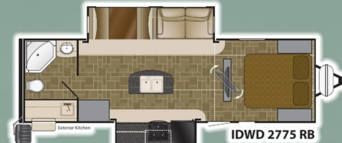
IDWD 2775 RB