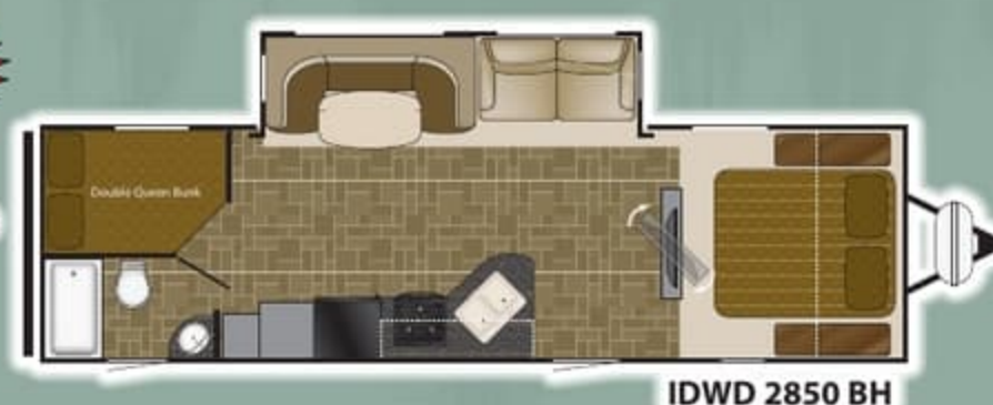
IDWD 2850 BH