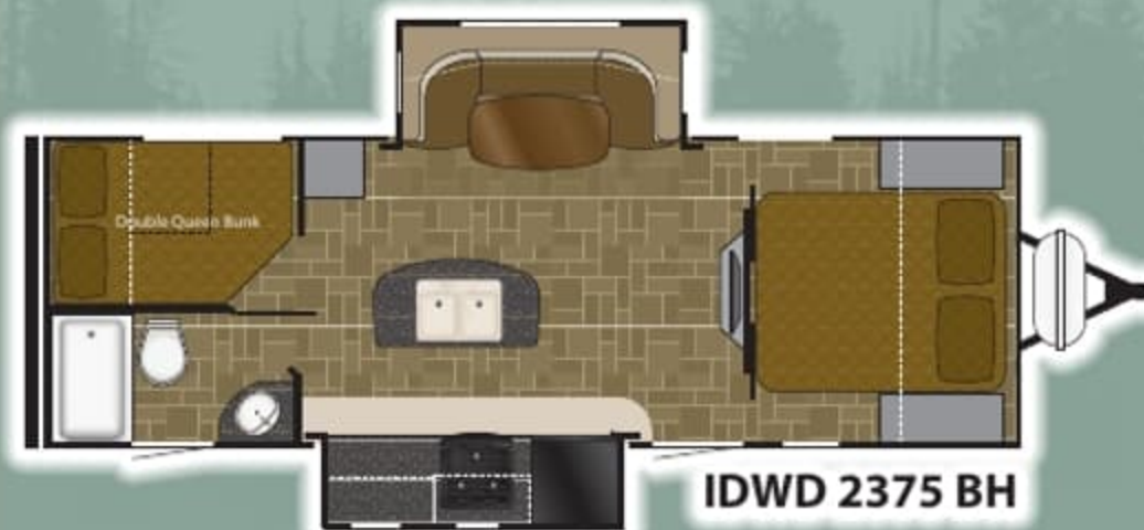
IDWD 2375 BH