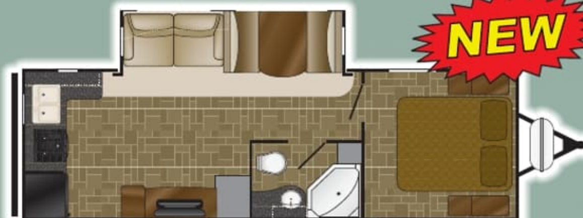
IDWD 2575 RK