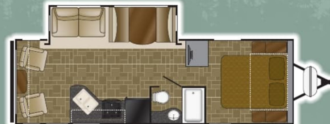
IDWD 2750 RL