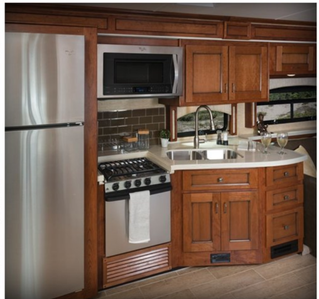
ENDEAVOR 40FX SHOWN IN CITY LOFT DÉCOR WITH HILLSIDE CHERRY WOOD CABINETRY