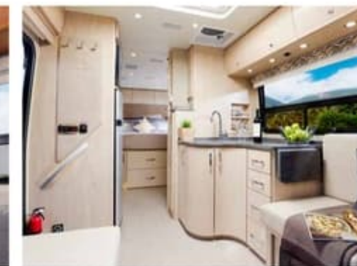
Sierra Maple Available w/ Glamour Package