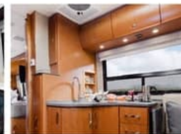
Chestnut Cherry Available w/ Glamour Package