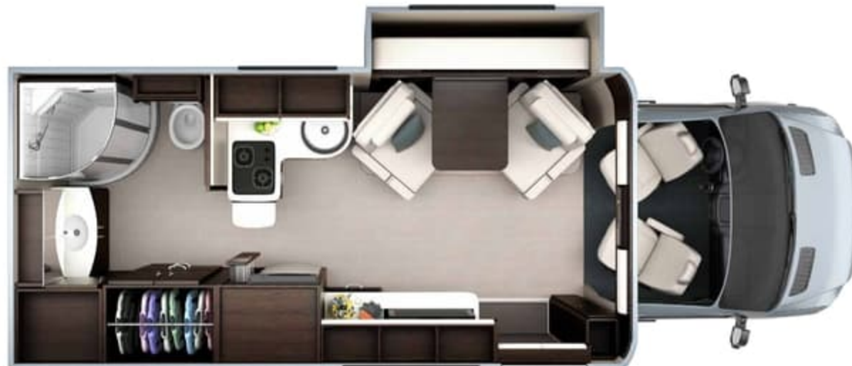
U24MB Murphy Bed (Shown with all-new optional Leisure Lounge Plus)