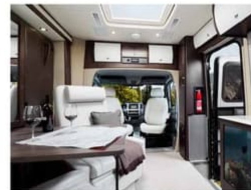
Espresso Brown Glamour Décor Package shown