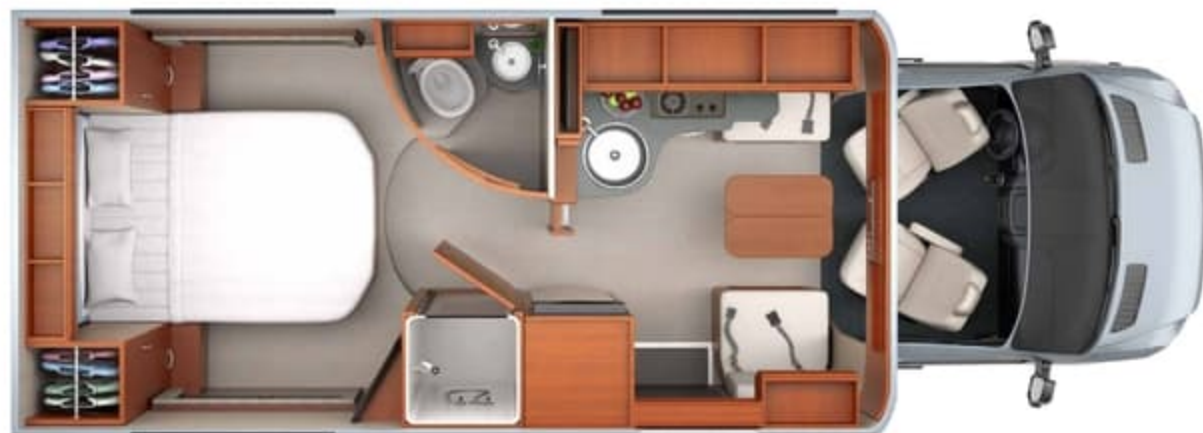
U24IB Island Bed