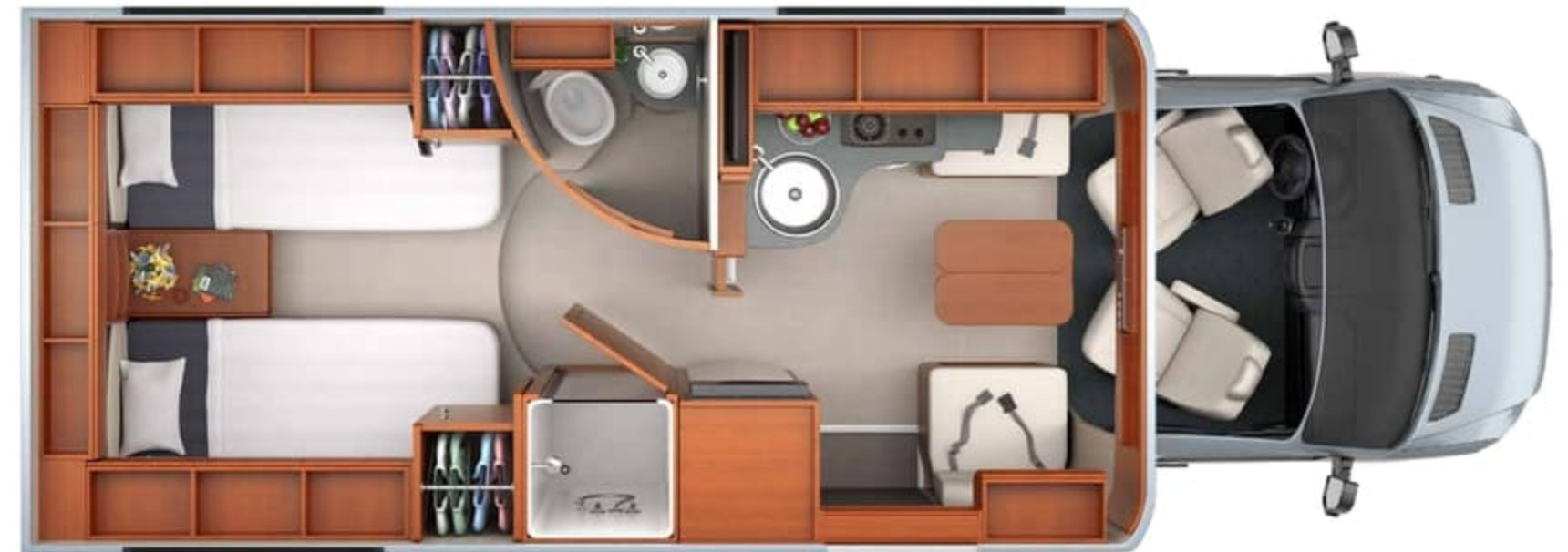
U24TB Twin Bed