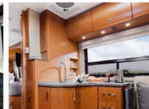
Chestnut Cherry Available w/ Glamour Package