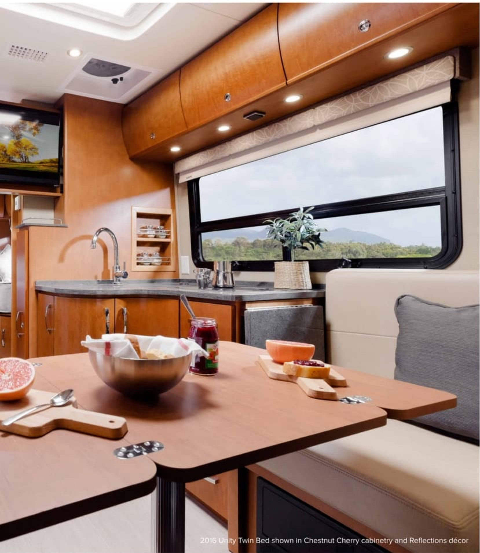
2016 Unity Twin Bed shown in Chestnut Cherry cabinetry and Reflections décor