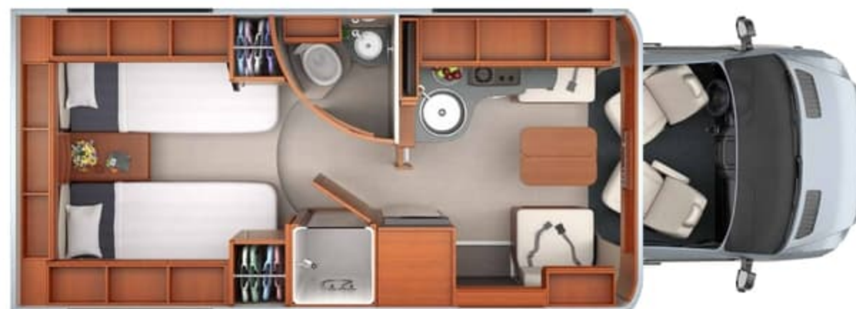
U24TB Twin Bed