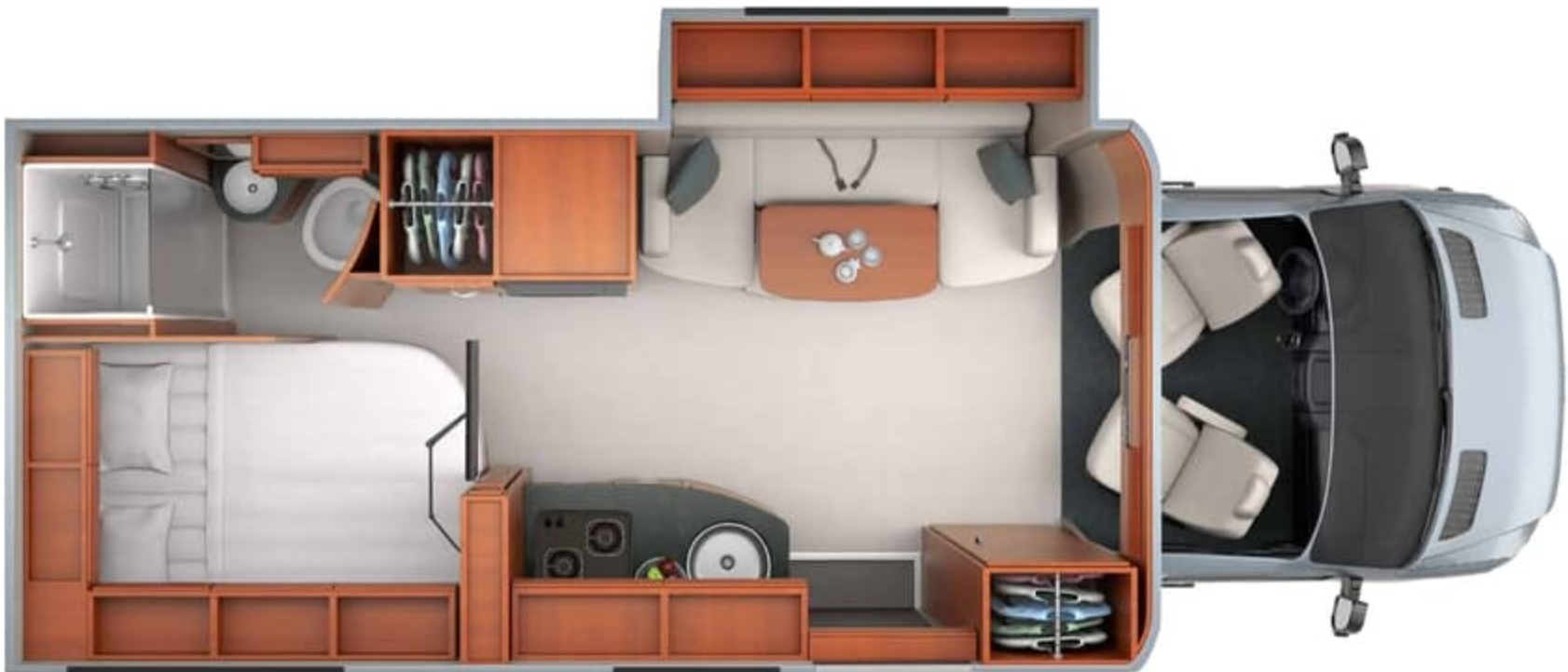
U24CB Corner Bed (Shown with optional U-Lounge Dinette)