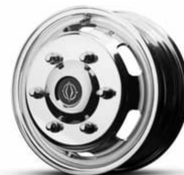
Alcoa Dura-Bright® Aluminum Wheels Optional - All 6 Wheels