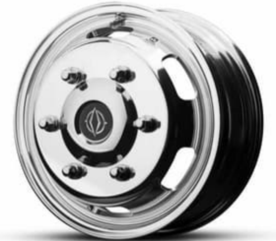
Alcoa Dura-Bright® Aluminum Wheels Optional - All 6 Wheels