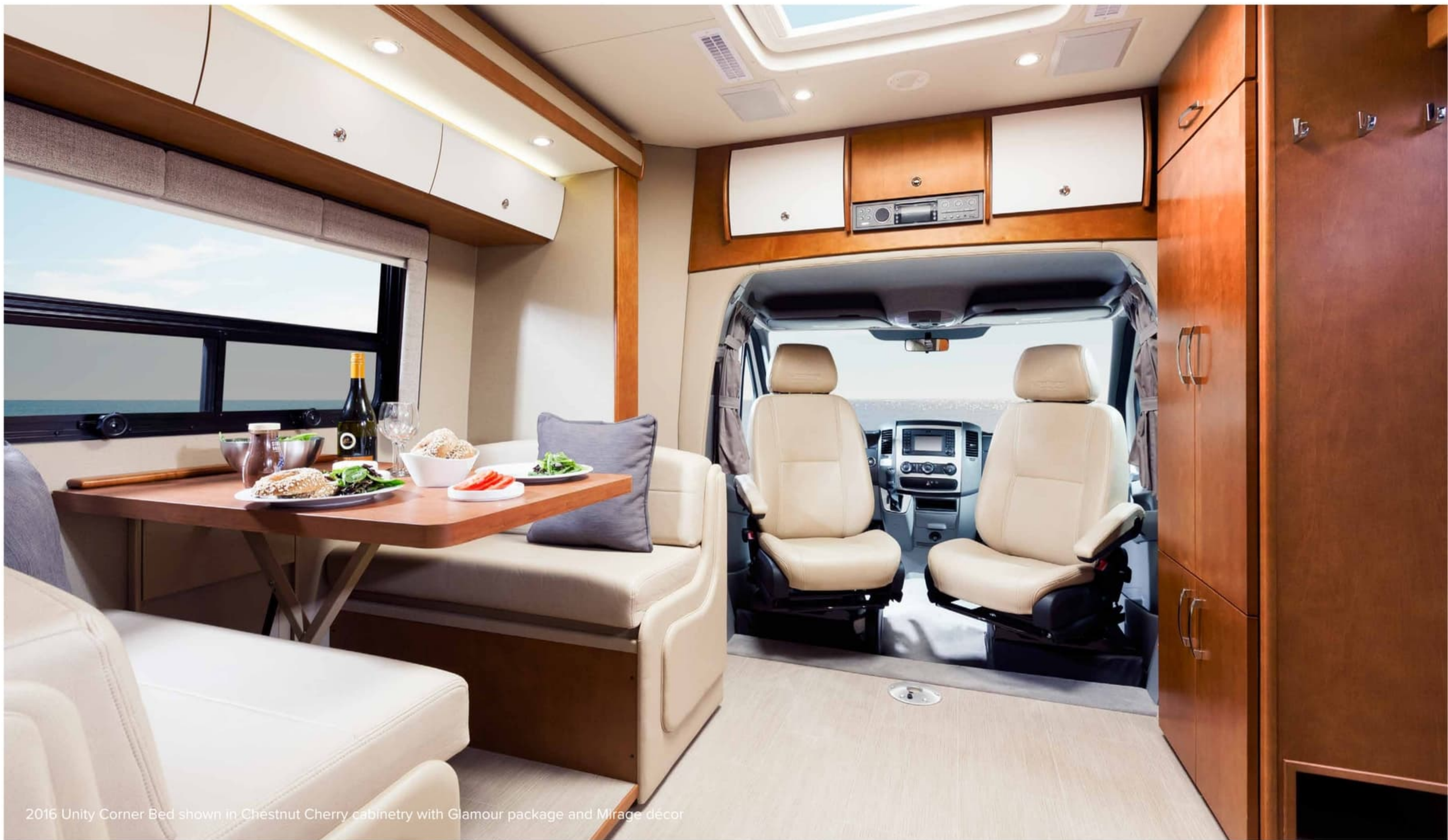
2016 Unity Corner Bed shown in Chestnut Cherry cabinetry with Glamour package and Mirage décor