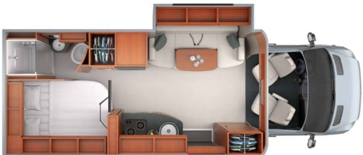
U24CB Corner Bed (Shown with optional U-Lounge Dinette)