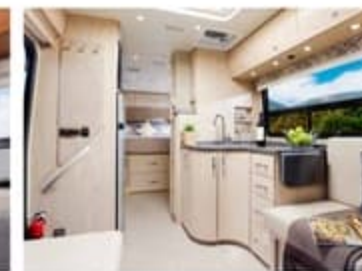
Sierra Maple Available w/ Glamour Package