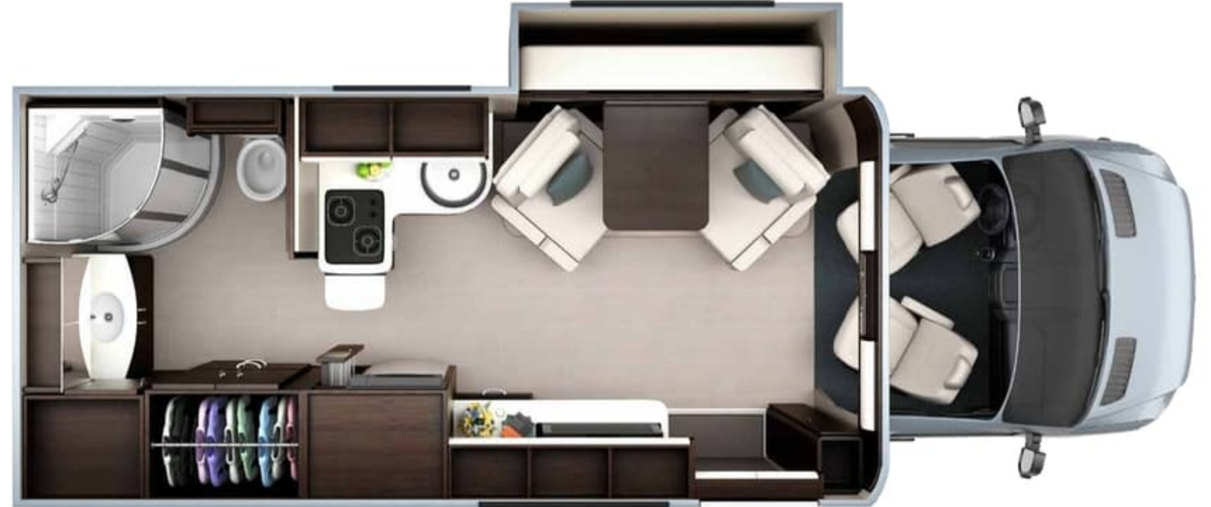
U24MB Murphy Bed (Shown with all-new optional Leisure Lounge Plus)