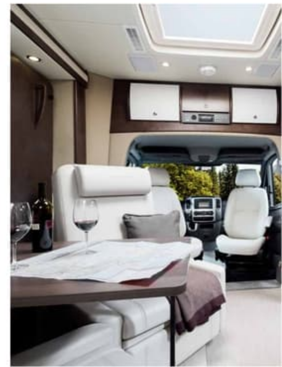
2016 Unity Murphy Bed shown with optional Leisure Lounge Plus in Espresso Brown cabinetry with Glamour package and Mirage décor