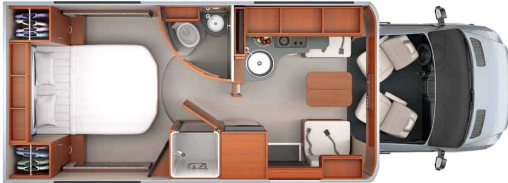
U24IB Island Bed