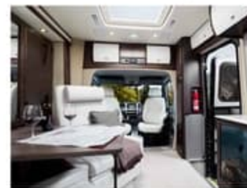
Espresso Brown Glamour Décor Package shown