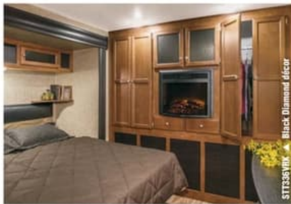
STT336VRK ▲ Black Diamond décor