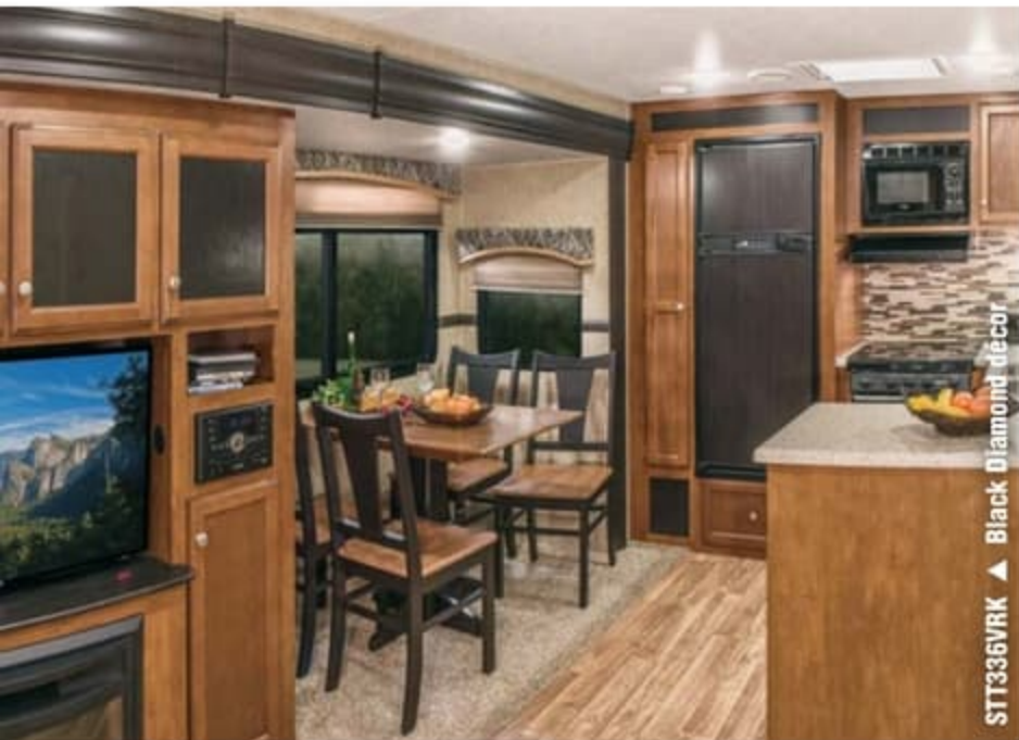
STT336VRK ▲ Black Diamond décor

The 336VRK bath offers a foot-flush toilet, radius shower with glass doors, skylight and a mirrored medicine cabinet.