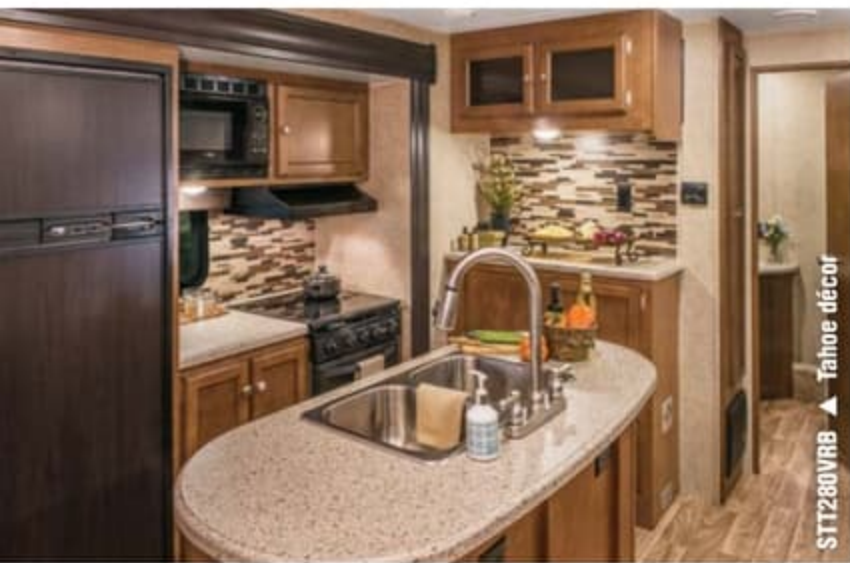
STT280VRB ▲ Tahoe décor

All SportTrek Touring Edition floorplans include an entertainment center with built-in fireplace, Bluetooth DVD/CD/MP3/AM/FM stereo with four flush-mount interior speakers, panoramic slideout windows, and storage galore.