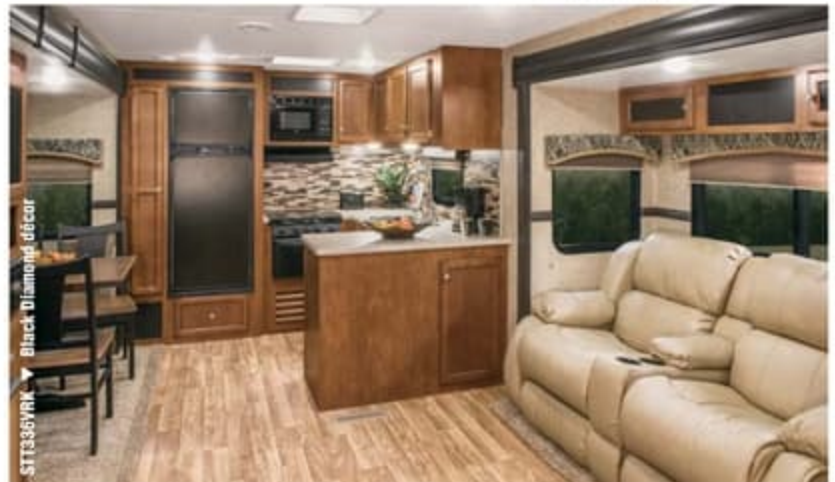
STT336VRK ▲ Black Diamond décor

SportTrek Touring Edition kitchens are thoughtfully designed, and the dining areas are extremely comfortable.