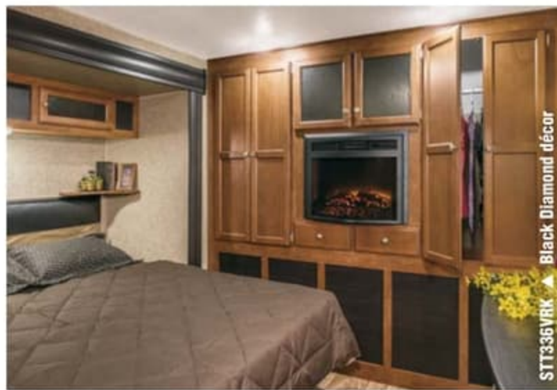
STT336VRK ▲ Black Diamond décor

Bedrooms include a fireplace, Sleep Tight® memory foam mattress, reversible residential quilted comforter, pillow shams, overhead cabinets, under-bed storage, and shirt closet.