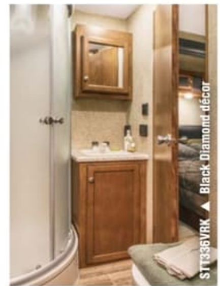
STT336VRK ▲ Black Diamond décor

Bedrooms include a fireplace, Sleep Tight® memory foam mattress, reversible residential quilted comforter, pillow shams, overhead cabinets, under-bed storage, and shirt closet.