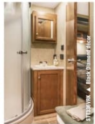
STT336VRK ▲ Black Diamond décor

Kitchens come in a variety of layouts, and include a full complement of appliances, and deep-bowl stainless steel sink with pullout faucet. Many floorplans even include an island kitchen with increased storage and flexibility.