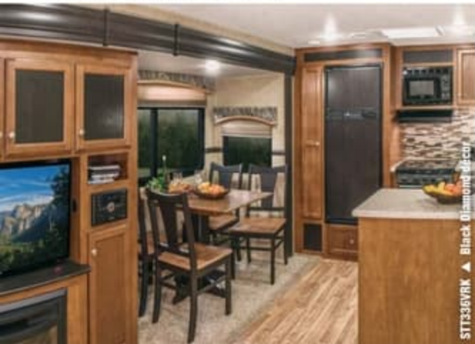
STT336VRK ▲ Black Diamond décor

The 336VRK bath offers a foot-flush toilet, radius shower with glass doors, skylight and a mirrored medicine cabinet.