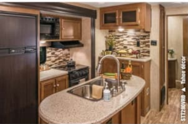
STT280VRB ▲ Tahoe décor

All SportTrek Touring Edition floorplans include an entertainment center with built-in fireplace, Bluetooth DVD/CD/MP3/AM/FM stereo with four flush-mount interior speakers, panoramic slideout windows, and storage galore.