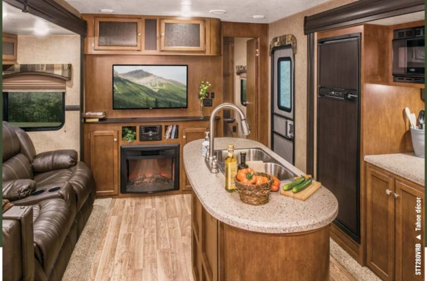
STT280VRB ▲ Tahoe décor

Venture's brand new SportTrek Touring Edition line of travel trailers has been designed as an ultra-high-end lightweight offering features virtually no other manufacturer provides. Standards such as a painted fiberglass front cap, upgraded residential furniture and 2 fireplaces in every floorplan are just some of the many upgrades.