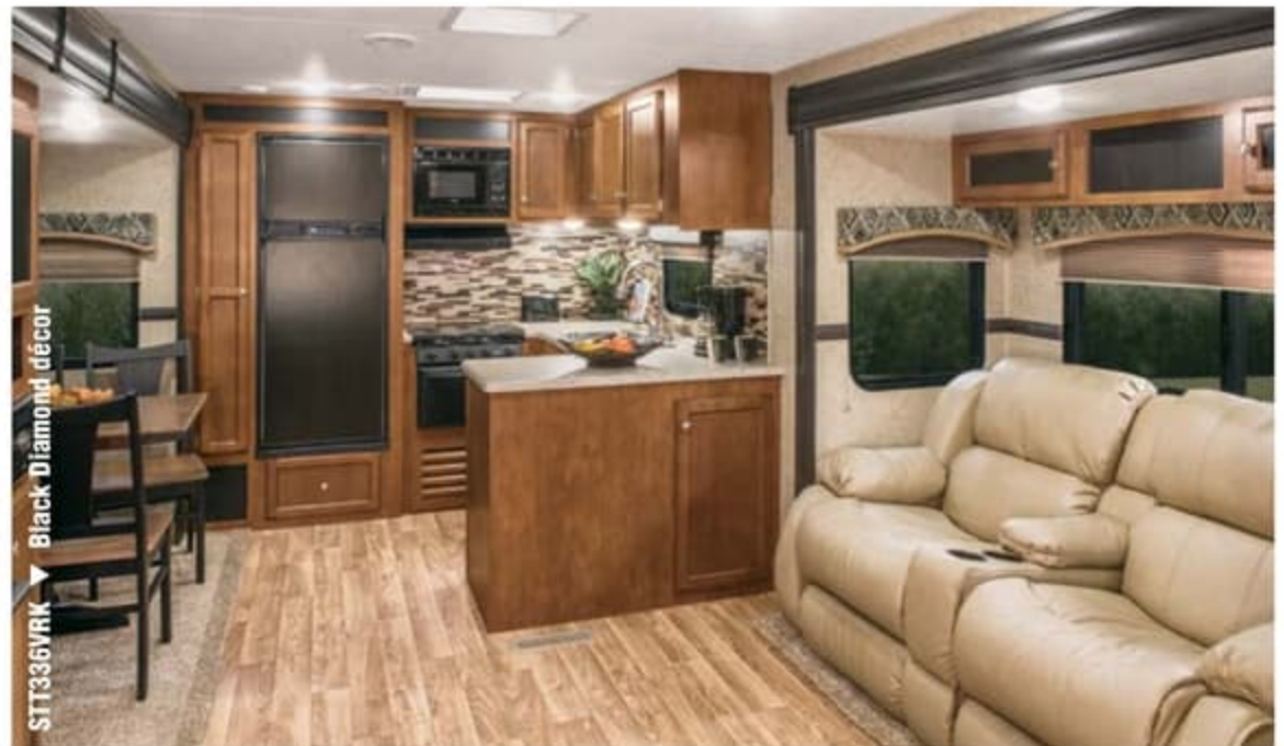
STT336VRK ▲ Black Diamond décor

SportTrek Touring Edition kitchens are thoughtfully designed, and the dining areas are extremely comfortable.