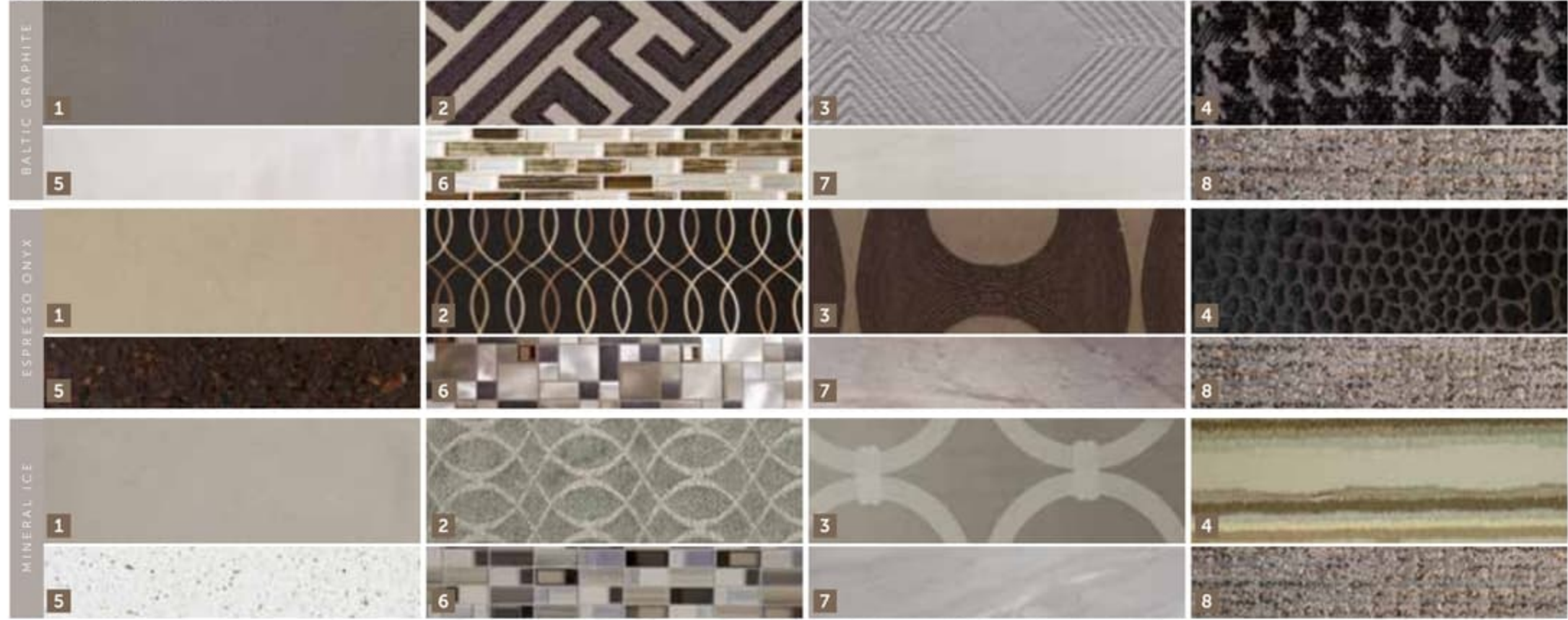
1 SOFA 2 LIVING ACCENT 3 BEDSPREAD 4 BED ACCENT 5 COUNTERTOP 6 BACKSPLASH 7 TILE 8 RESIDENTIAL CARPET