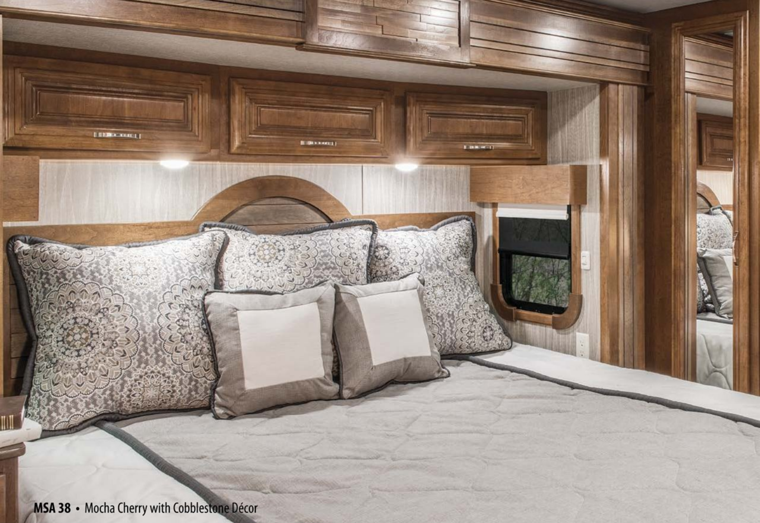
MSA 38 • Mocha Cherry with Cobblestone Décor

Due to the wide body design all Mobile Suite Aire floor plans come standard with our vanity slide increasing the walk way in front of the bed. We bring our hand laid vinyl tile up through the bedroom which eliminates the chance of carpet staining or aging. Inside each bathroom you will find a recessed shower allowing for up to 6' 9" of headroom to the skylight for our taller customer. Each bathroom also features a built-in linen closet, his & her solid surface molded sinks and tons of storage. Every room of our Mobile Suite Aire floor plans offer full function and storage our DRV customers have come to expect from our company.