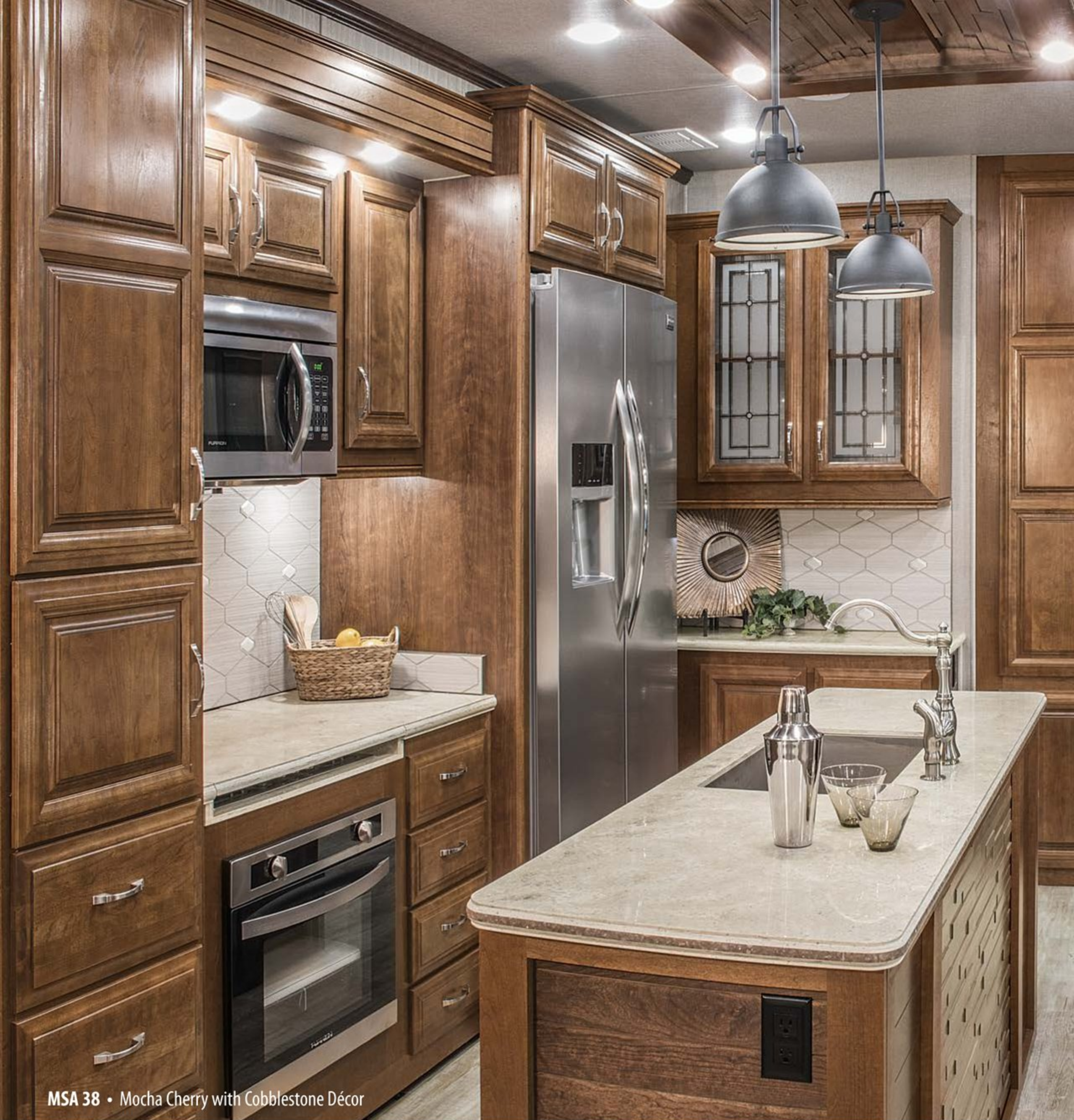
MSA 38 • Mocha Cherry with Cobblestone Décor

The Aire was designed as a 101" wide body with a straight roof line. This allows for 8' tall lower level slide outs with extended cabinetry, and more interior living space due to the extra width. Inside is surrounded with hardwood cherry cabinetry, hand-laid vinyl tile flooring, residential appliances, and soft-close drawer guides. For the full-time customer the Mobile Suite Aire provides custom painted exteriors, dual pane windows, our copper water-manifold, and automotive disc brakes. Its just as important to provide the best exterior features in order to protect the comfort of the home inside.