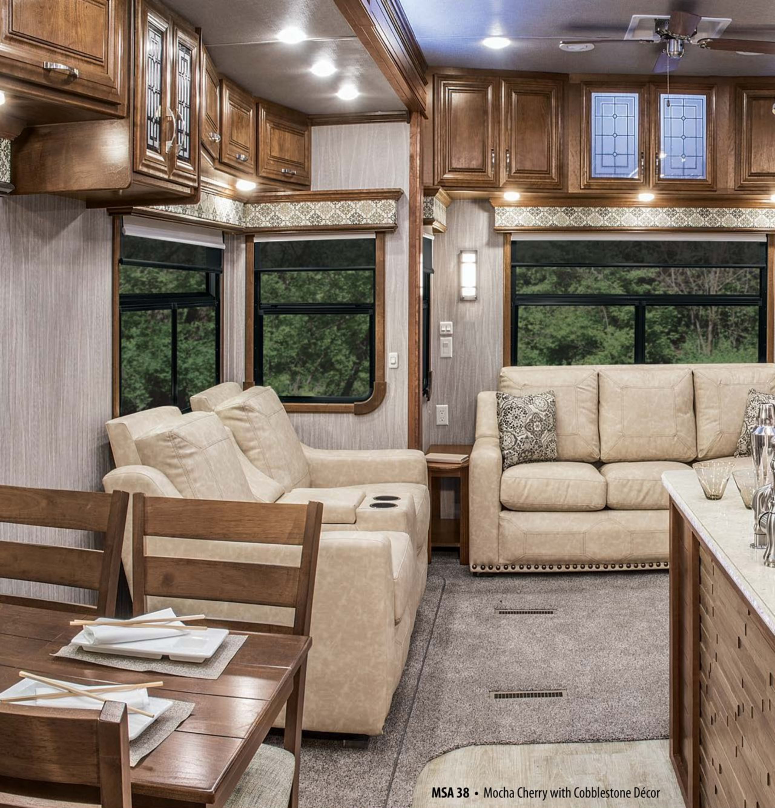
MSA 38 • Mocha Cherry with Cobblestone Décor

The new Mobile Suites Aire features tons of interior and exterior amenities geared toward the extended stay or full-time RV'er. This new product line was designed to bring the quality look and feel of our Mobile Suites into a lighter weight class. Inside and out you will find the features that made DRV Luxury Suites the leader in the luxury 5th wheel market.