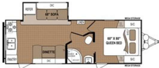
ASPEN TRAIL | 2390RKS Ext. Length: 27' 2" Ext. Height: 11' 4" Average Shipping Weight: 5,544 Sleeps: 3-4