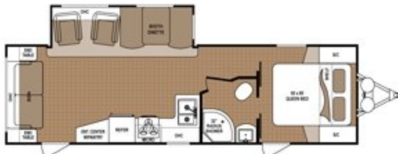
ASPEN TRAIL | 2860RLS Ext. Length: 32' 6" Ext. Height: 11' 3" Average Shipping Weight: 6,421 Sleeps: 4-5