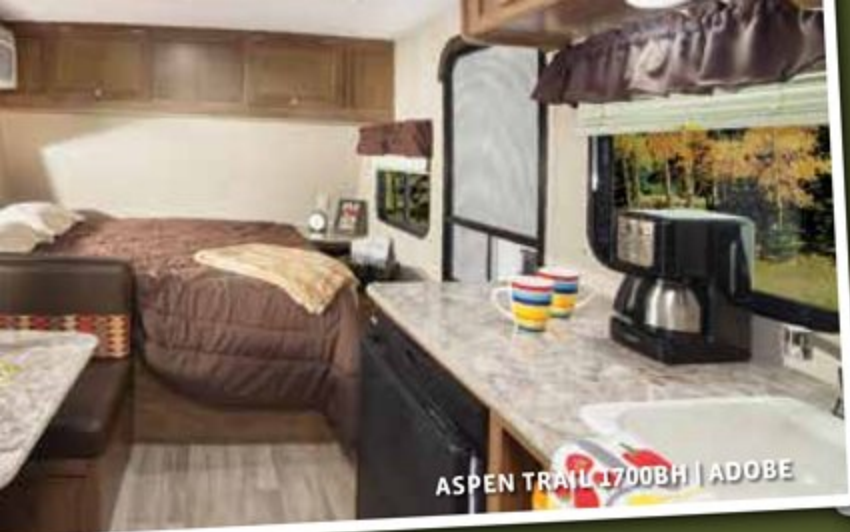
ASPEN TRAIL 1700BH | ADOBE