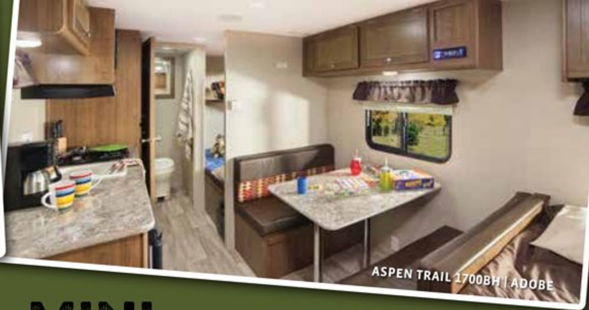
ASPEN TRAIL 1700BH | ADOBE