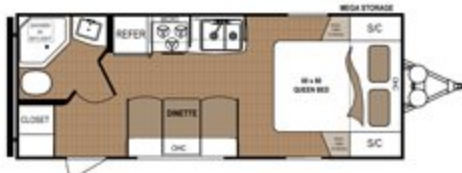
ASPEN TRAIL | 1900RB Ext. Length: 24' 8" Ext. Height: 10' 8" Average Shipping Weight: 4,107 Sleeps: 2-3