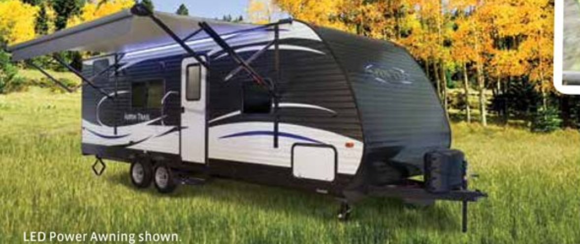
LED Power Awning shown.

More conveniences and more standard features mean more trailblazing value. When it comes to more bang for the buck, Aspen Trail wrote the book.