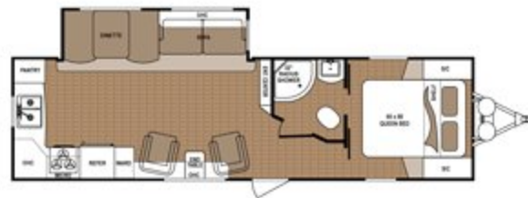
ASPEN TRAIL | 2870RKS Ext. Length: 32' 7" Ext. Height: 11' 3" Average Shipping Weight: 6,501 Sleeps: 4-5