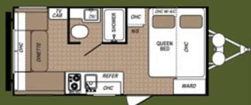
ASPEN TRAIL | 1750RD Ext. Length: 21' 5" Ext. Height: 8' 10" Average Shipping Weight: 3,169 Sleeps: 2-4

Aspen Trail Mini standards and options can be found at www.dutchmen.com