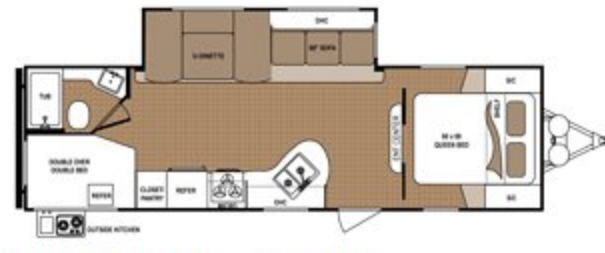
ASPEN TRAIL | 2750BHS Ext. Length: 31' 4" Ext. Height: 11' 3" Average Shipping Weight: 6,288 Sleeps: 6-8