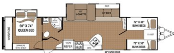
ASPEN TRAIL | 3600QBDS Ext. Length: 39' 9" Ext. Height: 11' 5" Average Shipping Weight: 8,010 Sleeps: 8-10