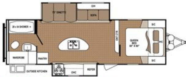
ASPEN TRAIL | 2730RBS Ext. Length: 31' Ext. Height: 11' 6" Average Shipping Weight: 6,824 Sleeps: 3-4