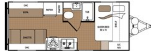
ASPEN TRAIL | 1930RDWE* Ext. Length: 22' 11" Ext. Height: 10' 8" Average Shipping Weight: 4,170 Sleeps: 3-4