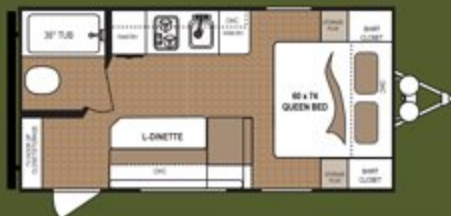
ASPEN TRAIL | 1600RB Ext. Length: 21' 5" Ext. Height: 8' 11" Average Shipping Weight: 3,142 Sleeps: 2-4

Even our "mini" floor plans are feature-rich, offering the ultimate in convenience, comfort and value