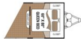
Optional Queen Bed IPO Bunks