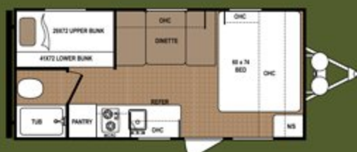
ASPEN TRAIL | 1700BH Ext. Length: 21' 5" Ext. Height: 8' 8" Average Shipping Weight: 3,322 Sleeps: 4-5