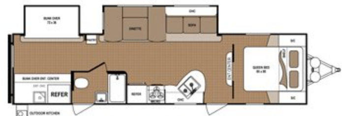
ASPEN TRAIL | 3010BHDS Ext. Length: 35' 9" Ext. Height: 11' 7" Average Shipping Weight: 7,588 Sleeps: 6-8