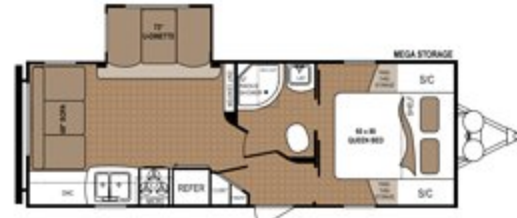
ASPEN TRAIL | 2460RLS Ext. Length: 28' 3" Ext. Height: 11' 4" Average Shipping Weight: 5,514 Sleeps: 3-5