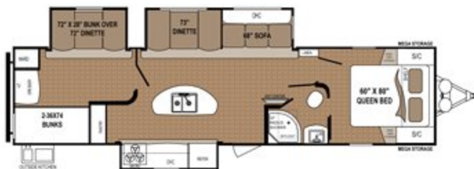
ASPEN TRAIL | 3100BHS Ext. Length: 37' 6" Ext. Height: 11' 8" Average Shipping Weight: 8,562 Sleeps: 8