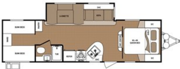
ASPEN TRAIL | 2890BHS Ext. Length: 32' 11" Ext. Height: 11' 2" Average Shipping Weight: 6,482 Sleeps: 6-8