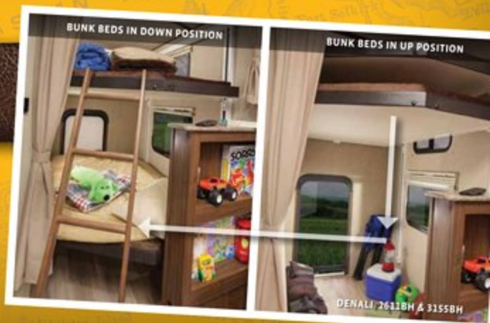
DENALI 2611BH & 3155BH

Our multi-purpose sleeping room has two retractable—height-adjustable bunks, a play space and extra storage.