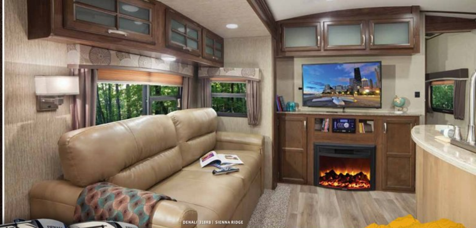
DENALI 318RB | SIENNA RIDGE