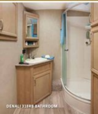
DENALI 318RB BATHROOM