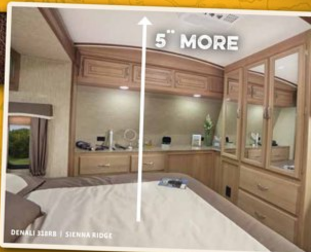
DENALI 318RB | SIENNA RIDGE

With a flush-floor master bedroom and an extra five inches of height, Denali adds more comfort to your fifth wheel space than ever before.