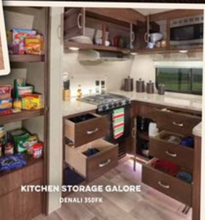
KITCHEN STORAGE GALORE DENALI 350FK