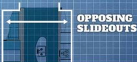
DENALI 316RES | TIMBERLAND