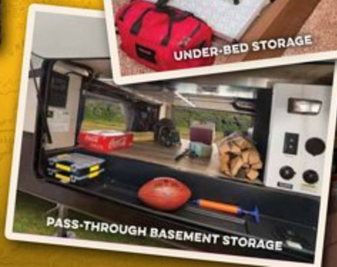
PASS-THROUGH BASEMENT STORAGE