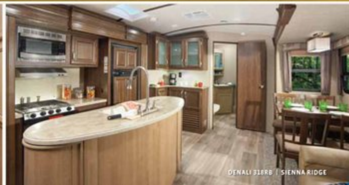
DENALI 318RB | SIENNA RIDGE