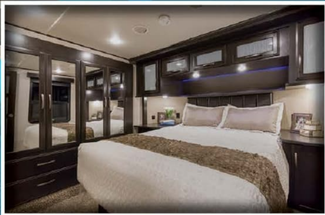
Rest well in the spacious master suite with your choice of a king or queen size bed (most models) and plenty of storage space. (349M shown)