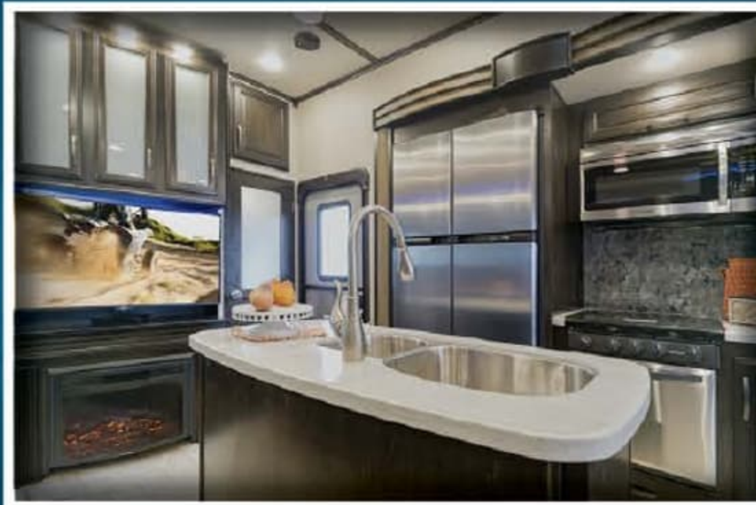
Indulge yourself with stainless steel appliances, solid surface countertops, and hardwood cabinetry. (399TH shown)