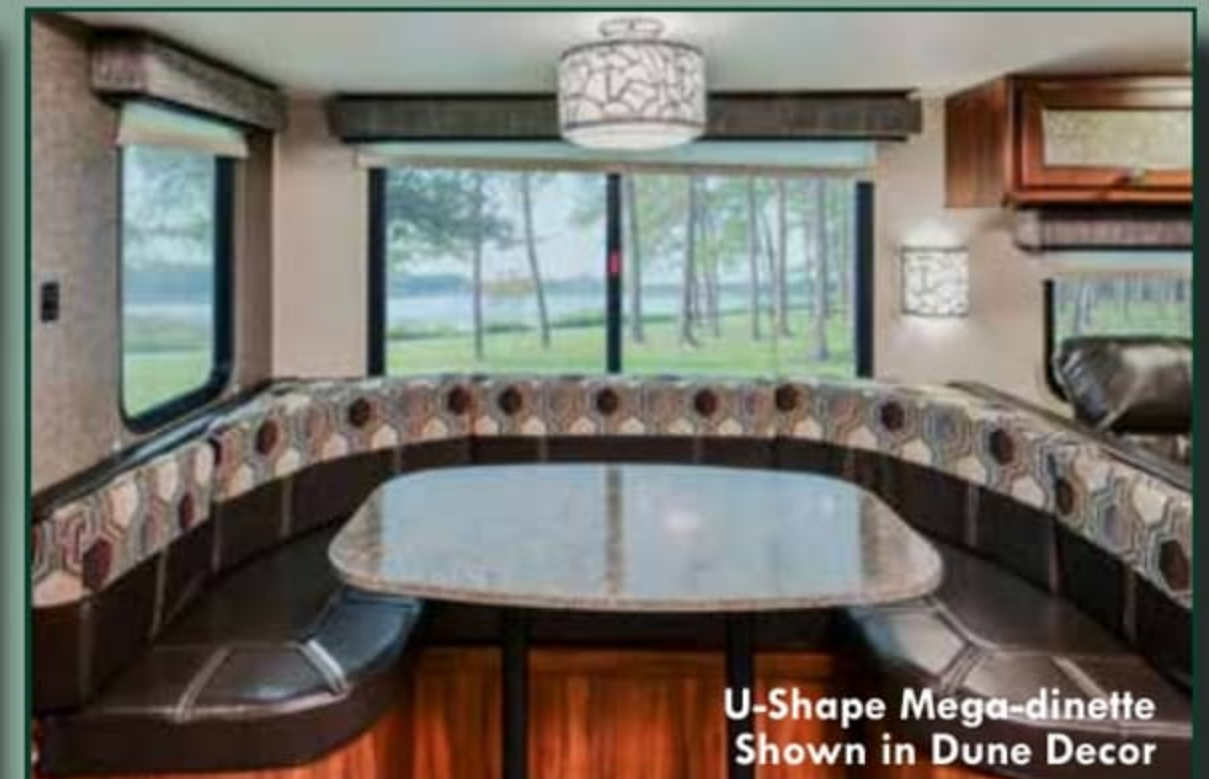
U-Shape Mega-dinette Shown in Dune Decor