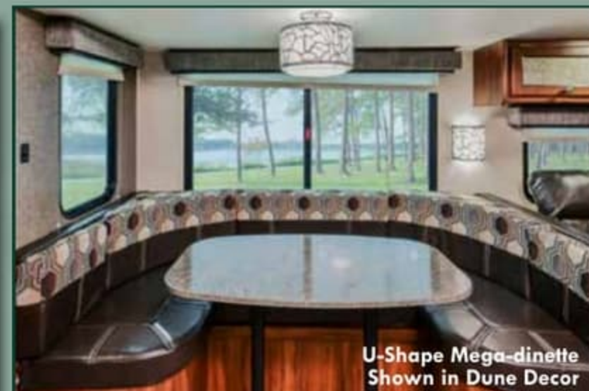
U-Shape Mega-dinette Shown in Dune Decor