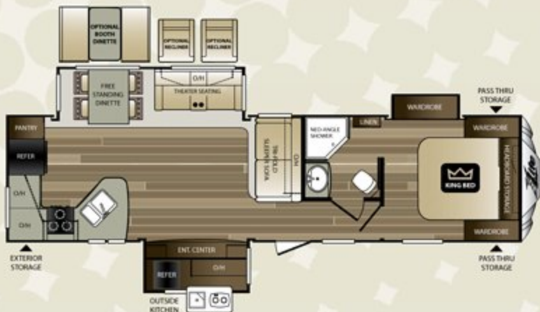
33MLS LENGTH: 36' 2" WEIGHT: 7,675

Ground Control TT Ground Control TT Equipped