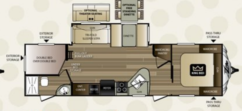
29BHS NEW LENGTH: 34' 11" WEIGHT: 6,760

Ground Control TT Ground Control TT Equipped