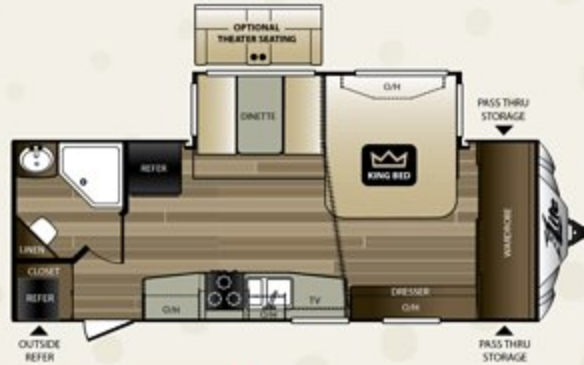
24RBS NEW LENGTH: 29' 6" WEIGHT: 5,475