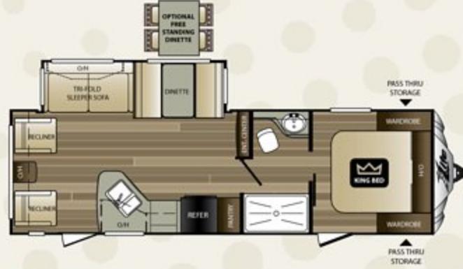
28RLS LENGTH: 31' WEIGHT: 6,150