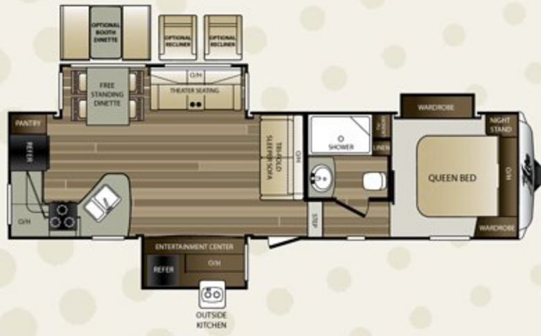
28RKS LENGTH: 32' 11" WEIGHT: 8,170