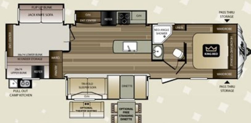
34TSB LENGTH: 37' 5" WEIGHT: 8,075

Ground Control TT Ground Control TT Equipped