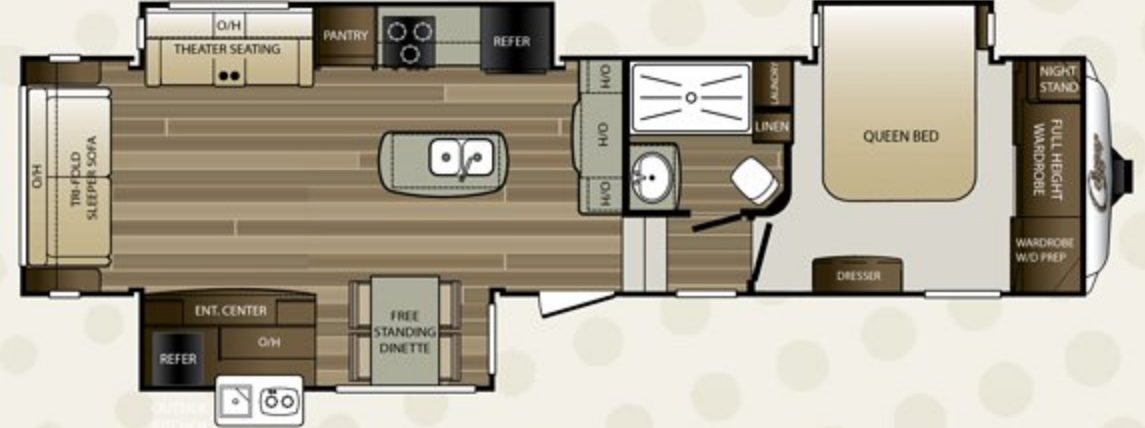
327RLK NEW LENGTH: 37' 2" WEIGHT: 10,315