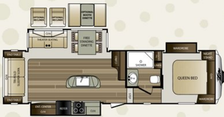
29RLI LENGTH: 32' 7" WEIGHT: 7,814