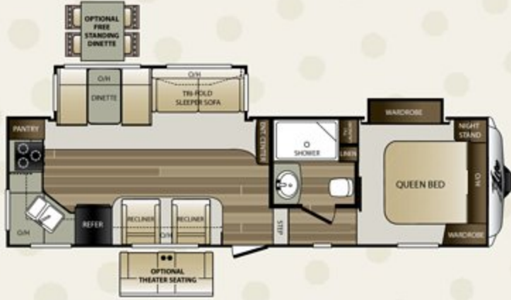
27RKS LENGTH: 30' 5" WEIGHT: 7,150