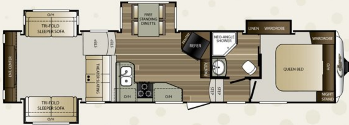
326RDS LENGTH: 38' 1" WEIGHT: 10,462