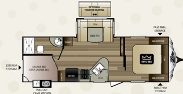
25RDB LENGTH: 29' 6" WEIGHT: 5,755