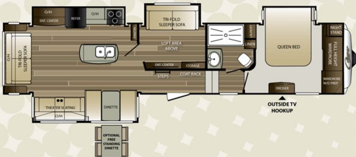
359MBI NEW LENGTH: 40' 1" WEIGHT: 11,245