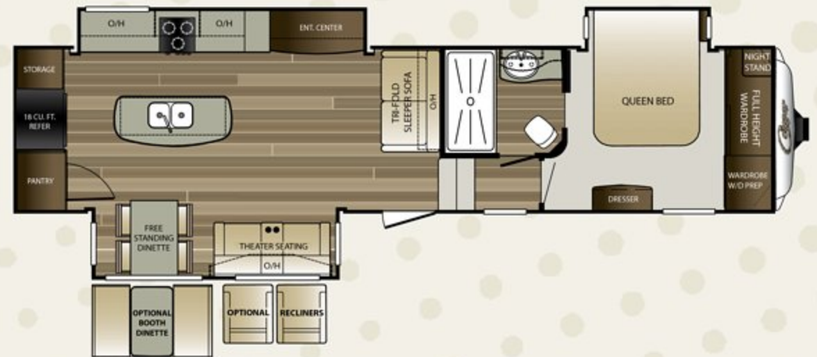
341RKI LENGTH: 38' 1" WEIGHT: 10,375