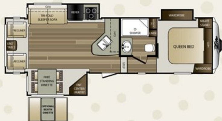
28SGS LENGTH: 30' 10" WEIGHT: 7,756