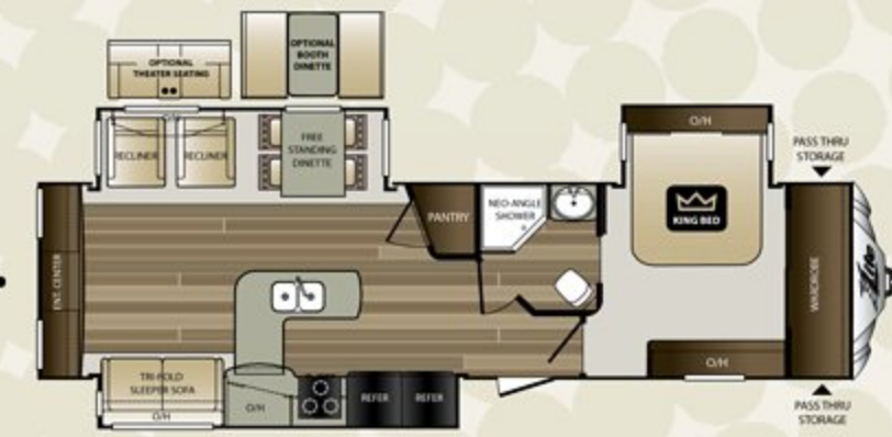
33SAB LENGTH: 36' 10" WEIGHT: 8,390

Ground Control TT Ground Control TT Equipped