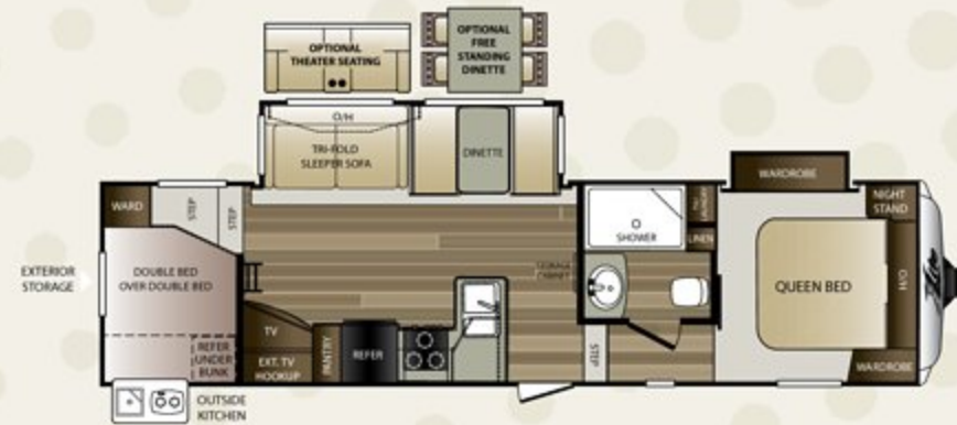
28RDB LENGTH: 32' 11" WEIGHT: 7,648