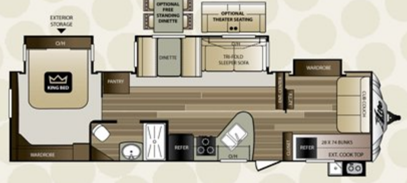
32FBS LENGTH: 35' 10" WEIGHT: 7,400

Ground Control TT Ground Control TT Equipped