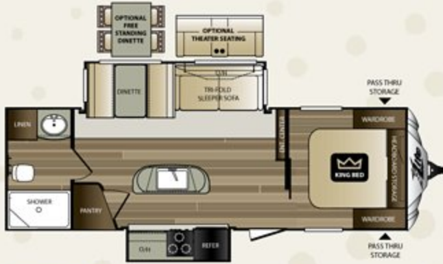
26RBI LENGTH: 30' 2" WEIGHT: 6,100