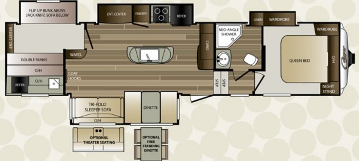
336BHS LENGTH: 38' WEIGHT: 10,325