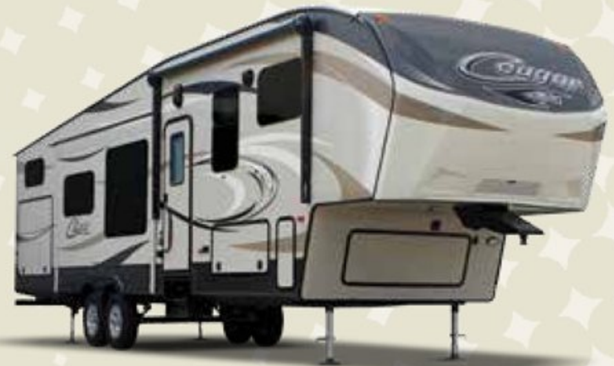
MID-PROFILE FIFTH WHEELS