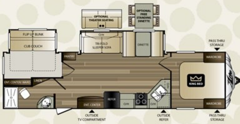
32FKB NEW LENGTH: 35' 10" WEIGHT: 7,145

Ground Control TT Ground Control TT Equipped