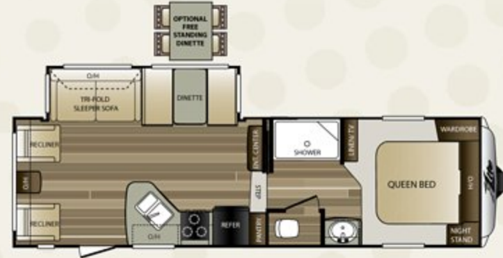
26RLS LENGTH: 29' 4" WEIGHT: 6,770