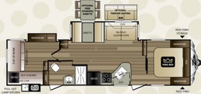
31SQB LENGTH: 35' 11" WEIGHT: 7,115

Ground Control TT Ground Control TT Equipped