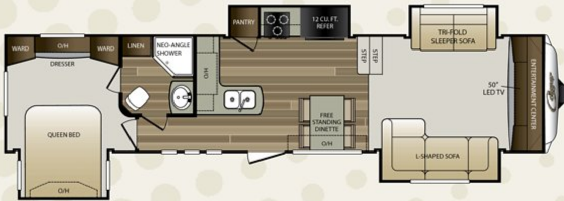
337FLS LENGTH: 38' 1" WEIGHT: 9,998