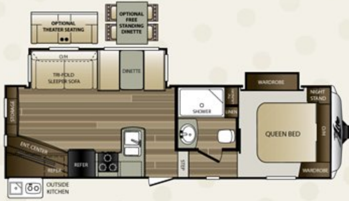
25RES LENGTH: 28' 11" WEIGHT: 7,035