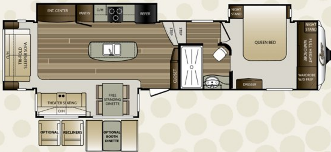
333MKS LENGTH: 38' 1" WEIGHT: 10,315