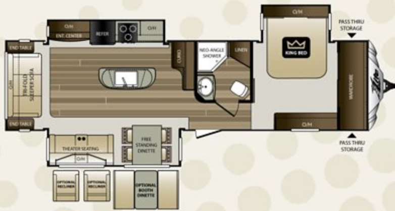
30RLI LENGTH: 36' WEIGHT: 7,704

Ground Control TT Ground Control TT Equipped