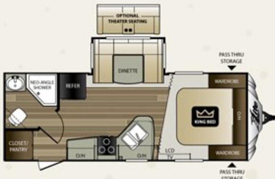
21RBS LENGTH: 25' 9" WEIGHT: 5,201