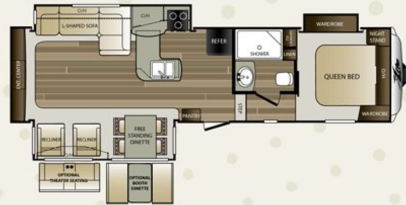
29RES LENGTH: 32' 11" WEIGHT: 8,020

Cougar by Keystone Lite www.keystonevancougar-lite