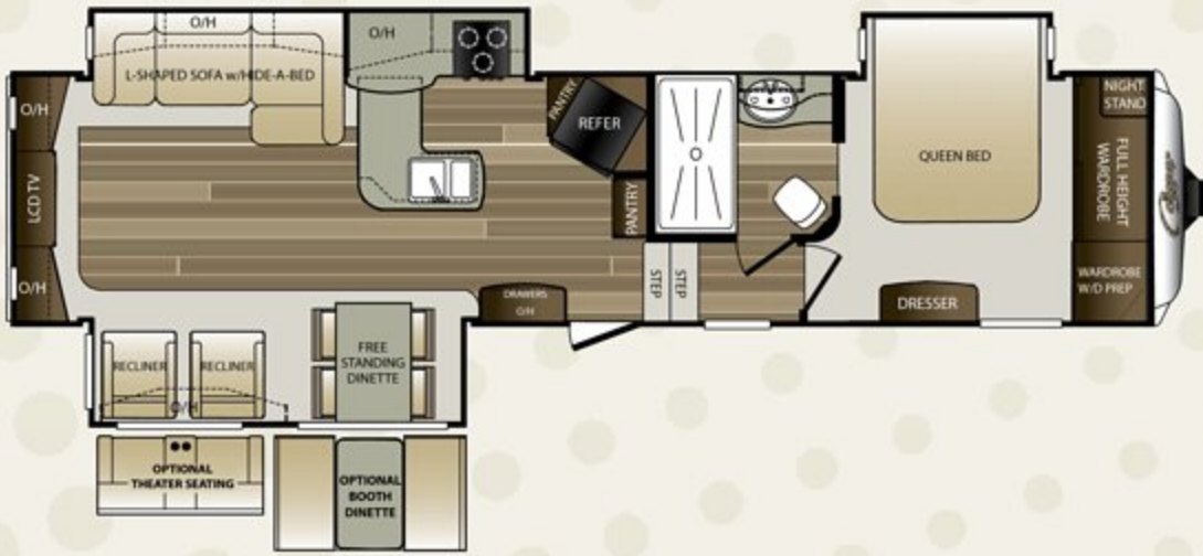
327RES LENGTH: 37' 9" WEIGHT: 10,495