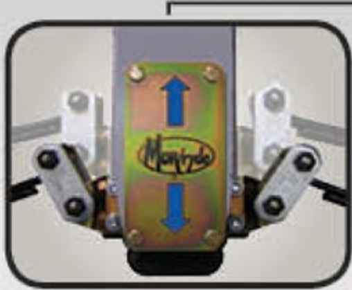
EXCLUSIVE MOR/RyDE 4100 SUSPENSION SYSTEM W/ WET BOLTS