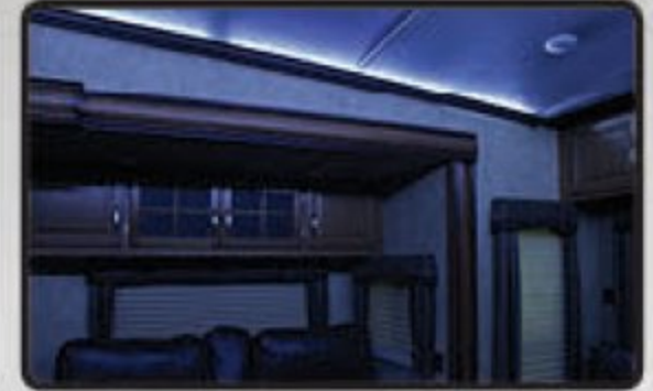
BACK-LIT CROWN MOLDING AMBIENT CEILING LIGHT