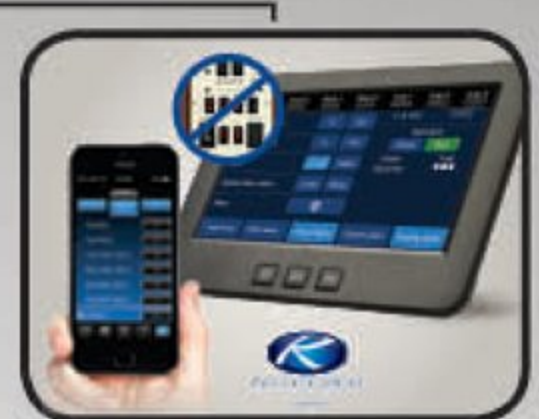
IN-COMMAND CONTROL SYSTEMS