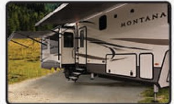
2ND PATIO AWNING W/LED LIGHT STRIP (SELECT MODELS)