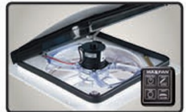
KITCHEN POWER RAIN SENSOR VENT FAN W/MULTI-SPEED WALL CONTROL