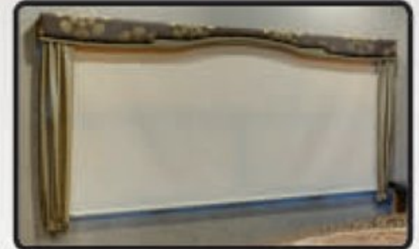
UPGRADE BLACKOUT ROLLER SHADES THROUGHOUT