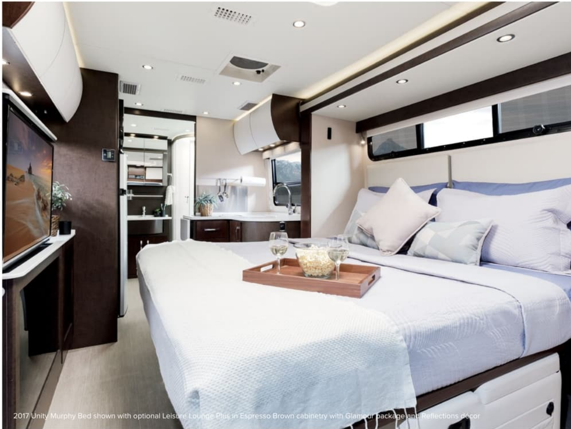
2017 Unity Murphy Bed shown with optional Leisure Lounge Plus in Espresso Brown cabinetry with Glamour package and Reflections décor