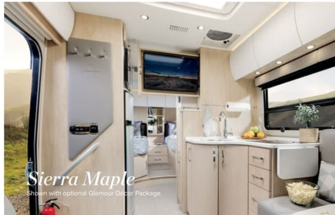
Sierra Maple Shown with optional Glamour Décor Package