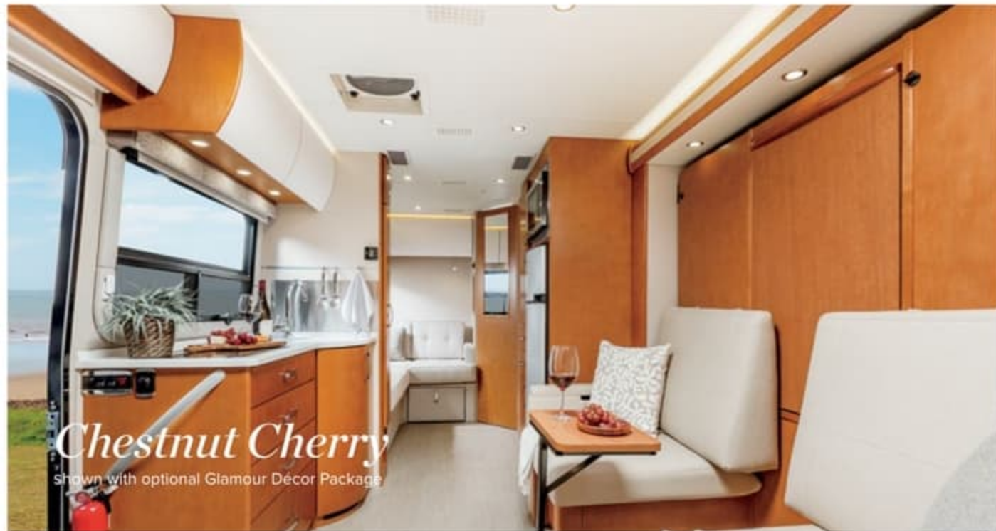
Chestnut Cherry Shown with optional Glamour Décor Package