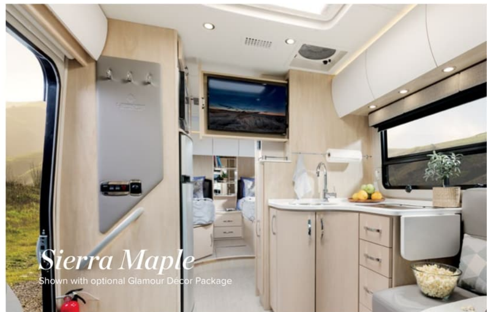
Sierra Maple Shown with optional Glamour Décor Package