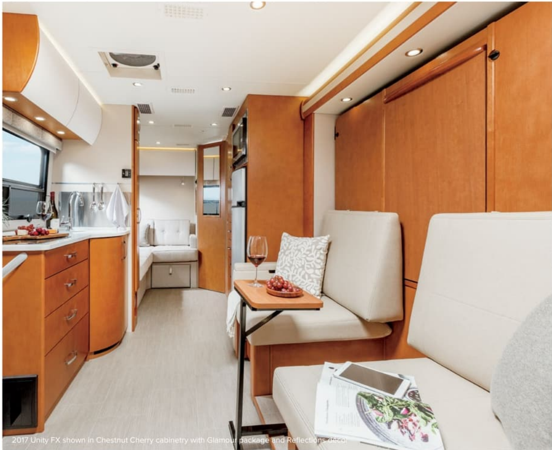
2017 Unity FX shown in Chestnut Cherry cabinetry with Glamour package and Reflections décor