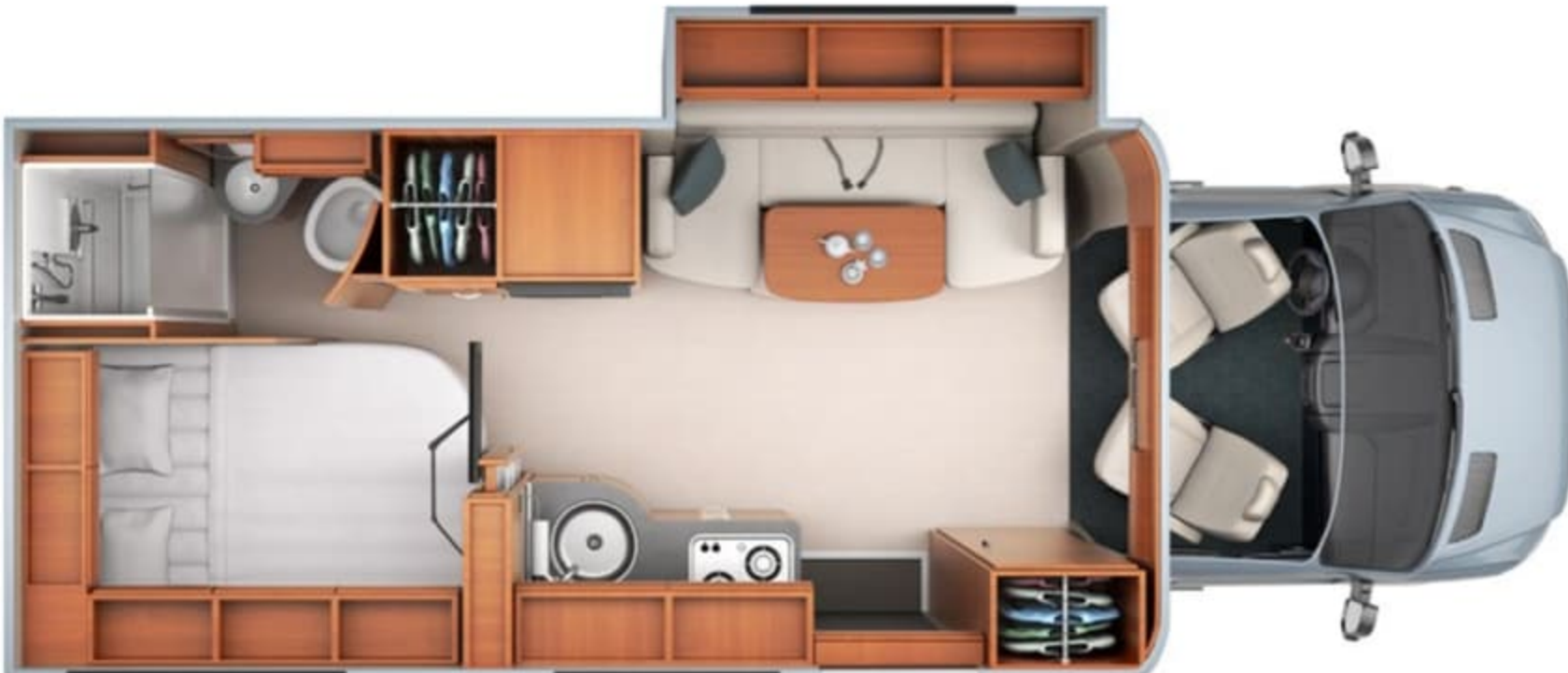
U24CB Corner Bed (Shown with optional U-Lounge Dinette)