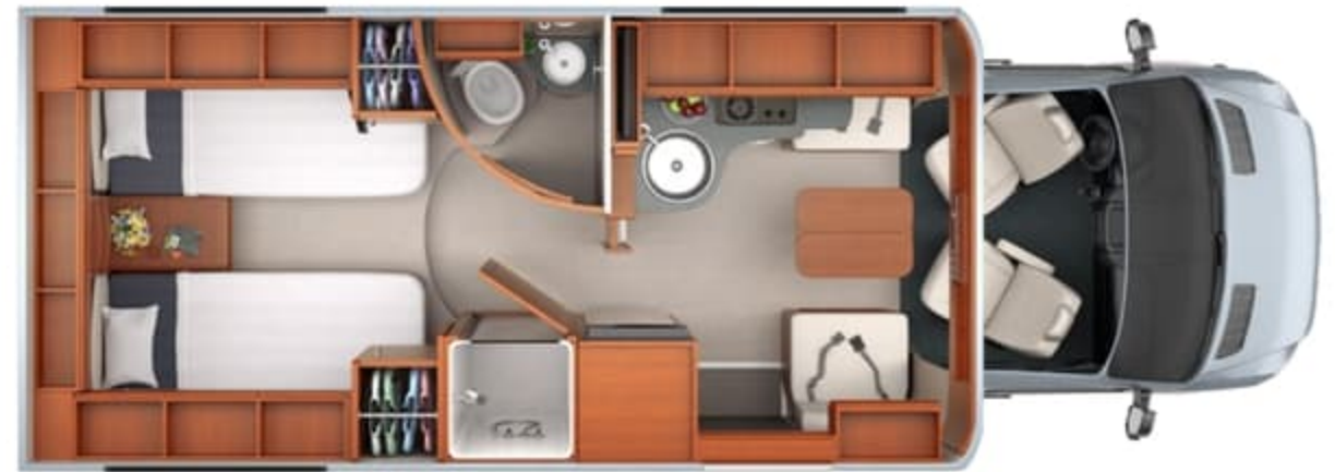
U24TB Twin Bed