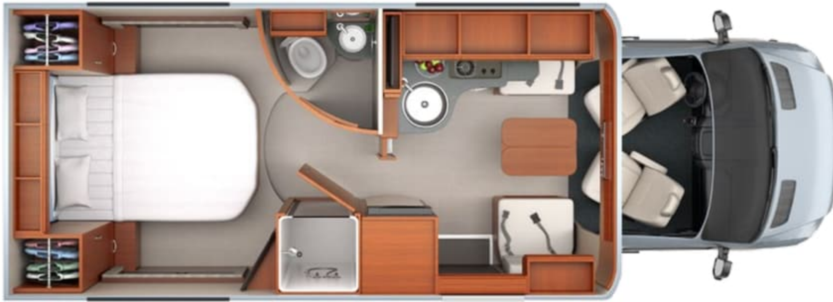
U24IB Island Bed