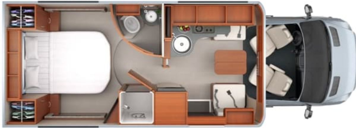
U241B Island Bed