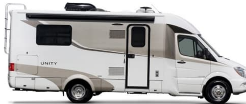
White Suede Shown With Optional Exterior Ladder