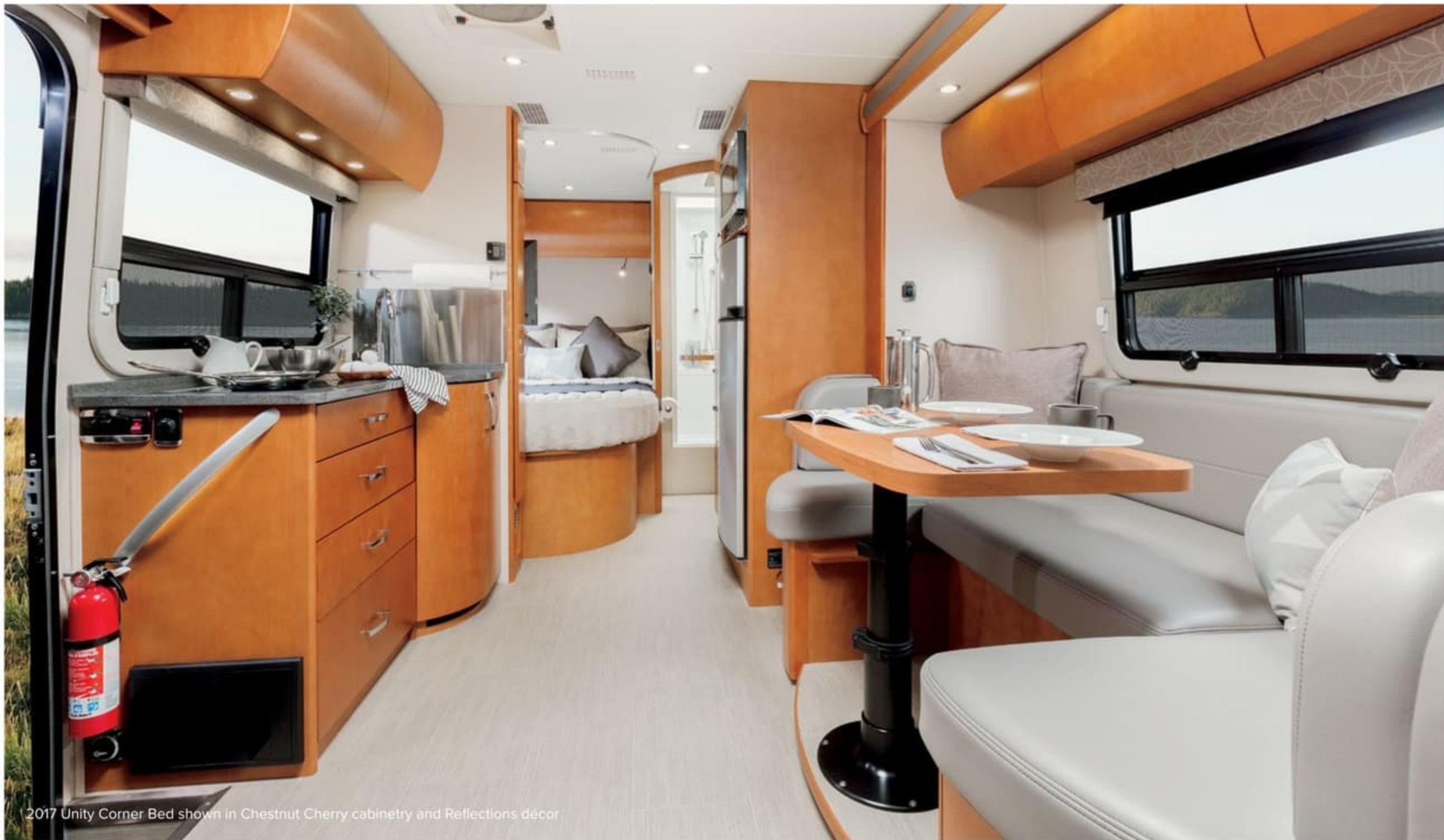
2017 Unity Corner Bed shown in Chestnut Cherry cabinetry and Reflections décor