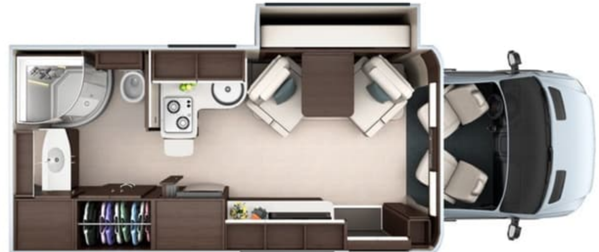
U24MB Murphy Bed (Shown with optional Leisure Lounge Plus)