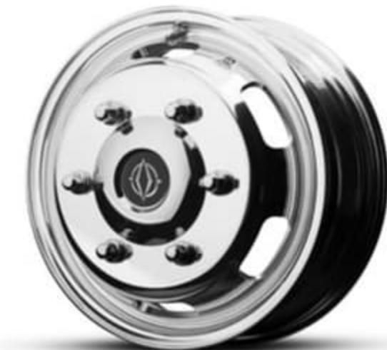
Alcoa Dura-Bright® Aluminum Wheels Optional - All 6 Wheels