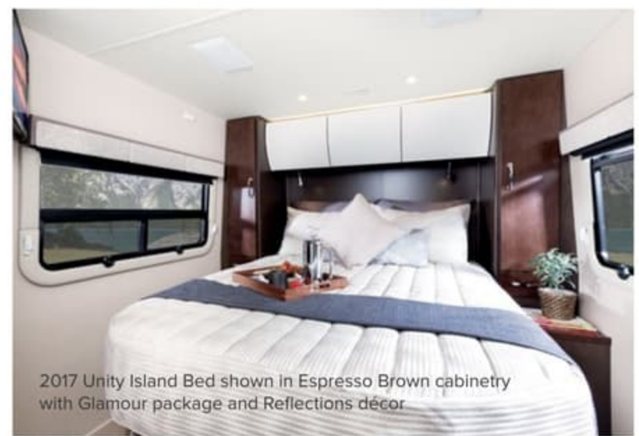
2017 Unity Island Bed shown in Espresso Brown cabinetry with Glamour package and Reflections décor