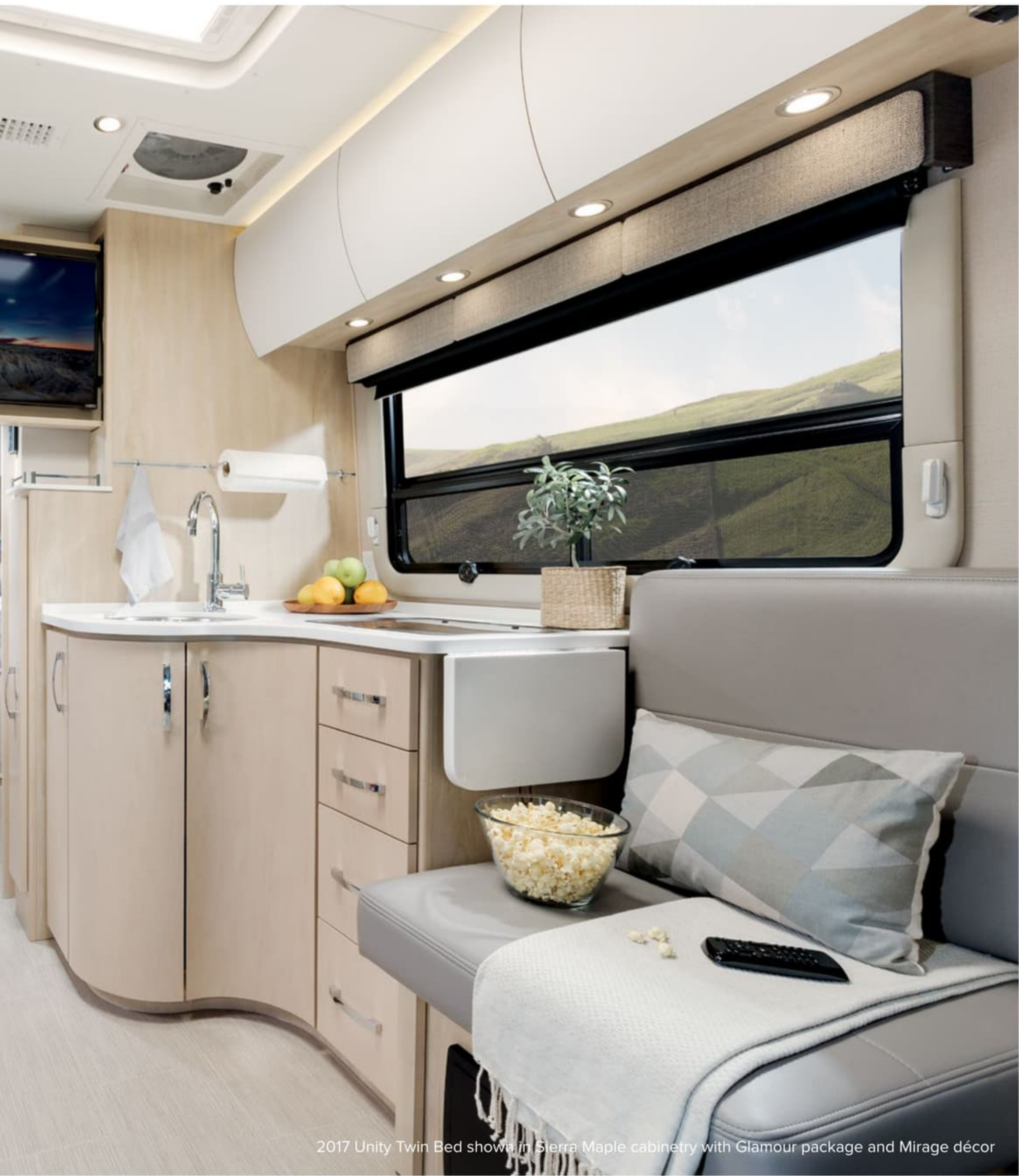
2017 Unity Twin Bed shown in Sierra Maple cabinetry with Glamour package and Mirage décor