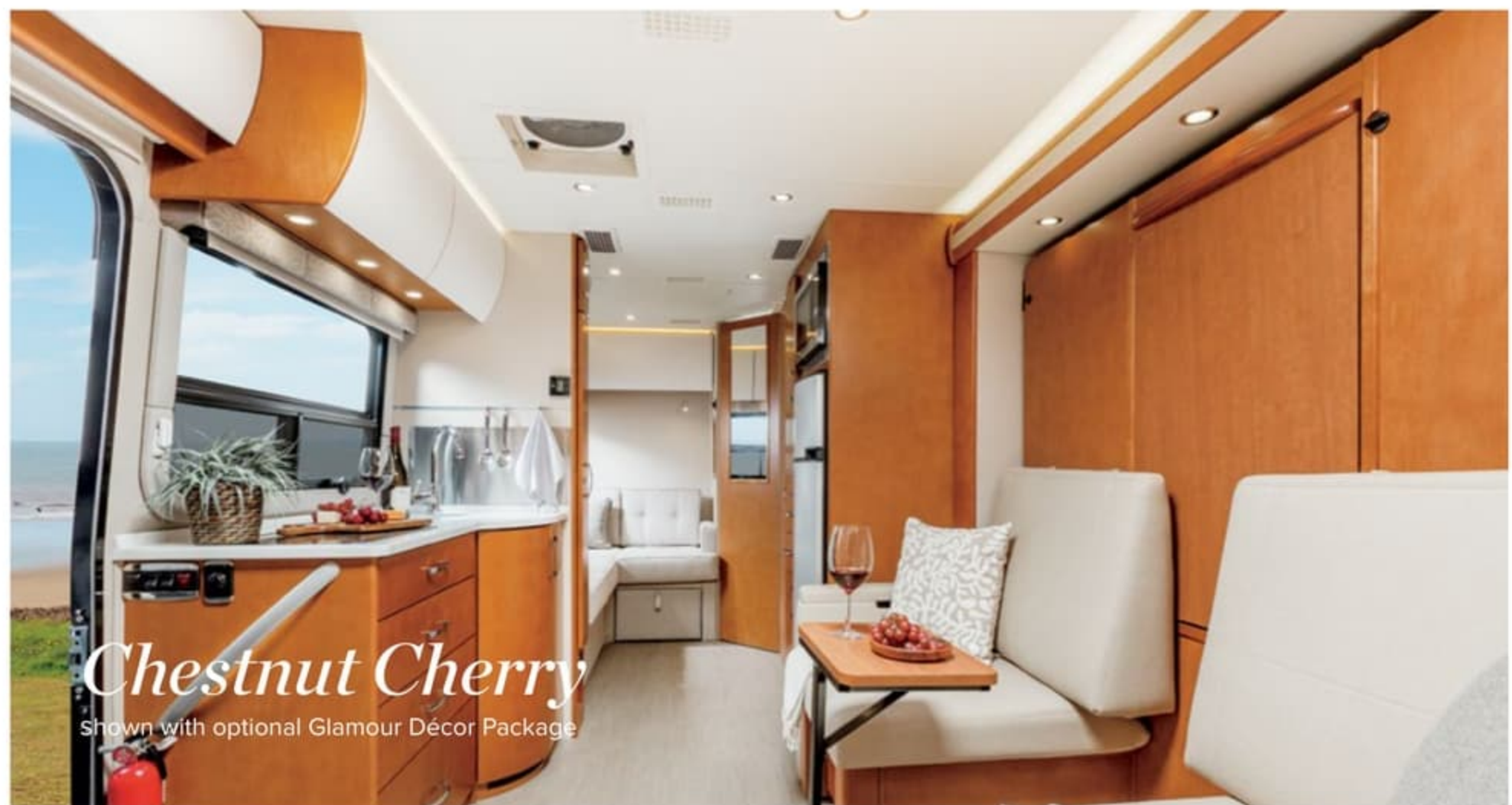
Chestnut Cherry Shown with optional Glamour Décor Package