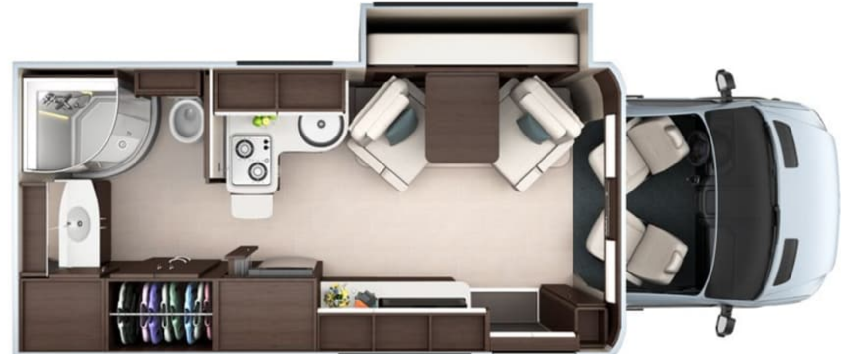
U24MB Murphy Bed (Shown with optional Leisure Lounge Plus)