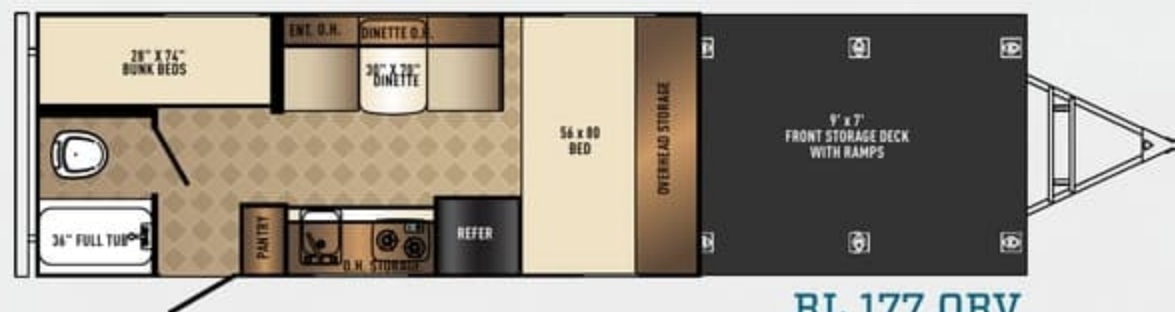
RL 177 ORV