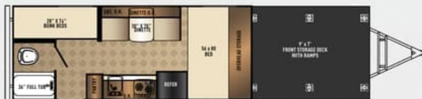
RL 177 ORV