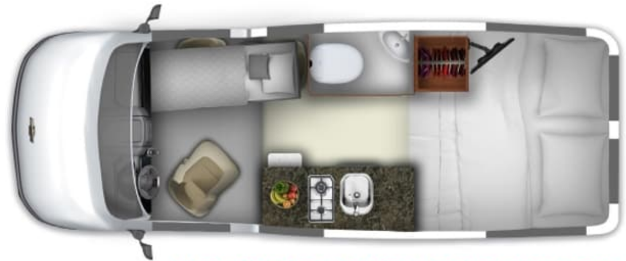
Interior floorplan of 210 Popular during the evening