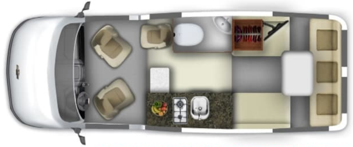
Interior floorplan of 210 Popular during the daytime

Take a step into your beautiful new 210 Popular by Roadtrek. As you turn from your driver's seat, you'll find a slide-out table to enjoy a card game or a nice meal. Looking ahead to your kitchen, you'll be able to prepare a delicious meal on your 2-burner propane stove, and keep your groceries fresh in your 5 cu. ft. refrigerator. As you make your way through the galley, you'll find a comfortable and spacious permanent bathroom with stand-up shower, and finally arrive to your power leather sofa that converts into a king bed or two twin beds. End your day relaxed; watching your favorite movie on the 24" flat screen television.