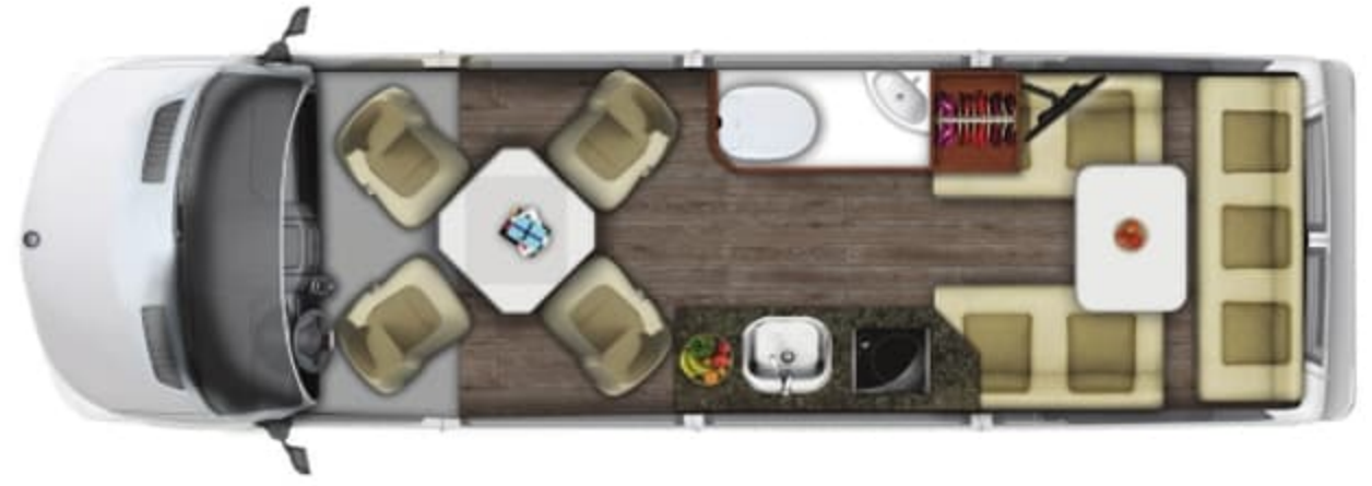
Interior floorplan of E-Trek during the daytime

Take a step into your environmentally friendly E-trek by Roadtrek, giving you the option to be off the grid! As you turn from your driver's seat, you'll find a pop-in table to enjoy a card game or a nice meal. Looking ahead to your kitchen, you'll be able to prepare a delicious meal on your inductive cooktop, and keep your groceries fresh in your 3.1 cu. ft. refrigerator. As you make your way through the galley, you'll find an enclosed permanent bathroom with stand-up shower, and finally arrive to your power composite leather sofa that converts into one king or two twin beds. End your day watching a movie on the 24" flat screen HD television.