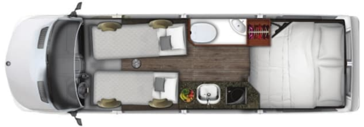
Interior floorplan of E-Trek during the evening