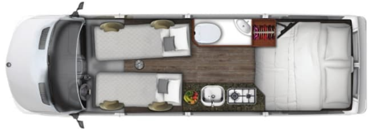
Interior floorplan of RS Adventurous during the evening