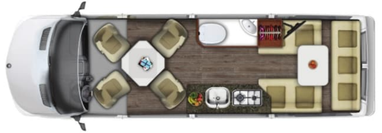
Interior floorplan of RS Adventurous during the daytime

Take a step into your beautiful new RS Adventurous by Roadtrek. As you turn from your driver's seat, you'll find a pop-in table and second row seats where you'll be able to enjoy a card game or a nice meal. Looking ahead to your kitchen, prepare a delicious meal on your 2-burner propane stove, and keep your groceries fresh in your 3.6 cu. ft refrigerator. As you make your way through the galley, you'll find a comfortable and spacious permanent bathroom with stand-up shower. End your day on your power leather sofa that easily converts into a king size bed, and watch your favorite movie on the 24" flat screen TV and entertainment center.