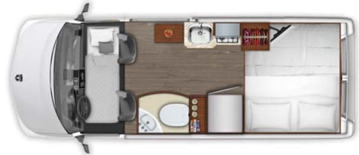
Interior floorplan of Simplicity SRT during the evening