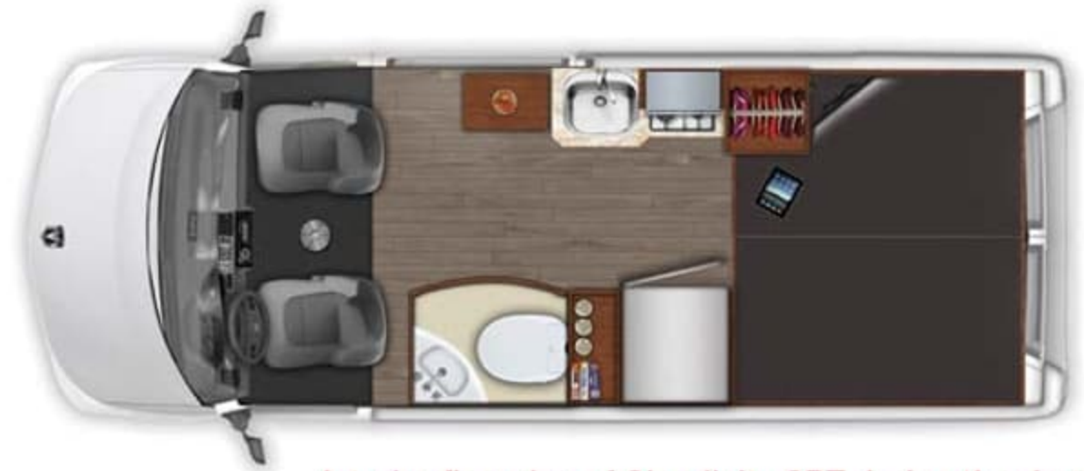
Interior floorplan of Simplicity SRT during the daytime

Take a step into your beautiful new Simplicity SRT by Roadtrek. As you turn from your driver's seat, you'll find a pop-in table to enjoy a card game or a nice meal. Looking ahead to your kitchen, you'll be able to prepare a delicious meal on your 2-burner propane stove, and keep your groceries fresh in your 5 cu. ft. refrigerator. You'll have ample storage space in the kitchen including a pull-out pantry and a deep pot drawer. As you make your way through the galley, you'll find a comfortable and spacious permanent bathroom with stand-up shower, and finally arrive to your fixed queen bed with additional storage underneath. End your day relaxed; watching your favorite movie on the optional 24" flat screen television.