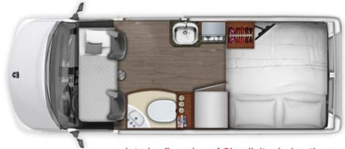
Interior floorplan of Simplicity during the evening