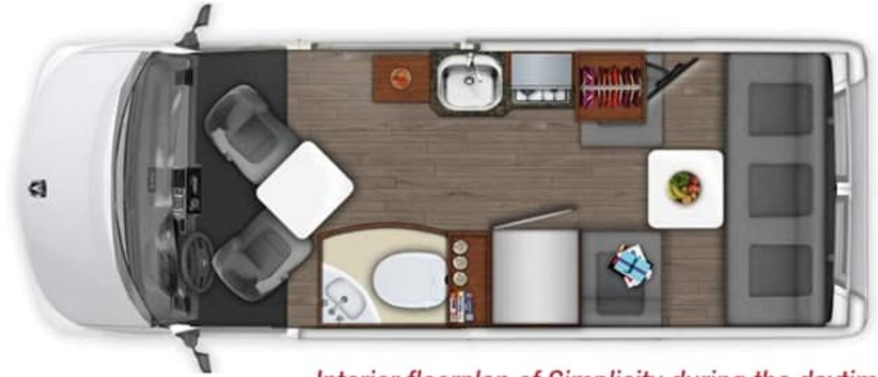
Interior floorplan of Simplicity during the daytime

Take a step into your beautiful new Simplicity by Roadtrek. As you turn from your driver's seat, you'll find a pop-in table to enjoy a card game or a nice meal. Looking ahead to your kitchen, you'll be able to prepare a delicious meal on your 2-burner propane stove, and keep your groceries fresh in your 5 cu. ft. refrigerator. You'll have ample storage space in the kitchen including a pull-out pantry and a deep pot drawer. As you make your way through the galley, you'll find a comfortable and spacious permanent bathroom with stand-up shower, and finally arrive to your sofa that converts into a queen bed. End your day relaxed; watching your favorite movie on the optional 24" flat screen television.