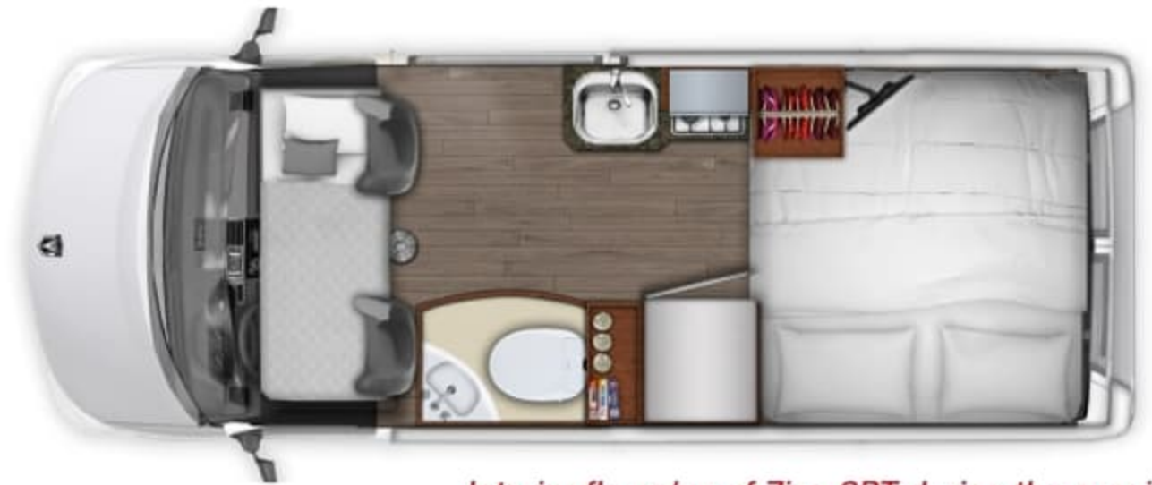
Interior floorplan of Zion SRT during the evening