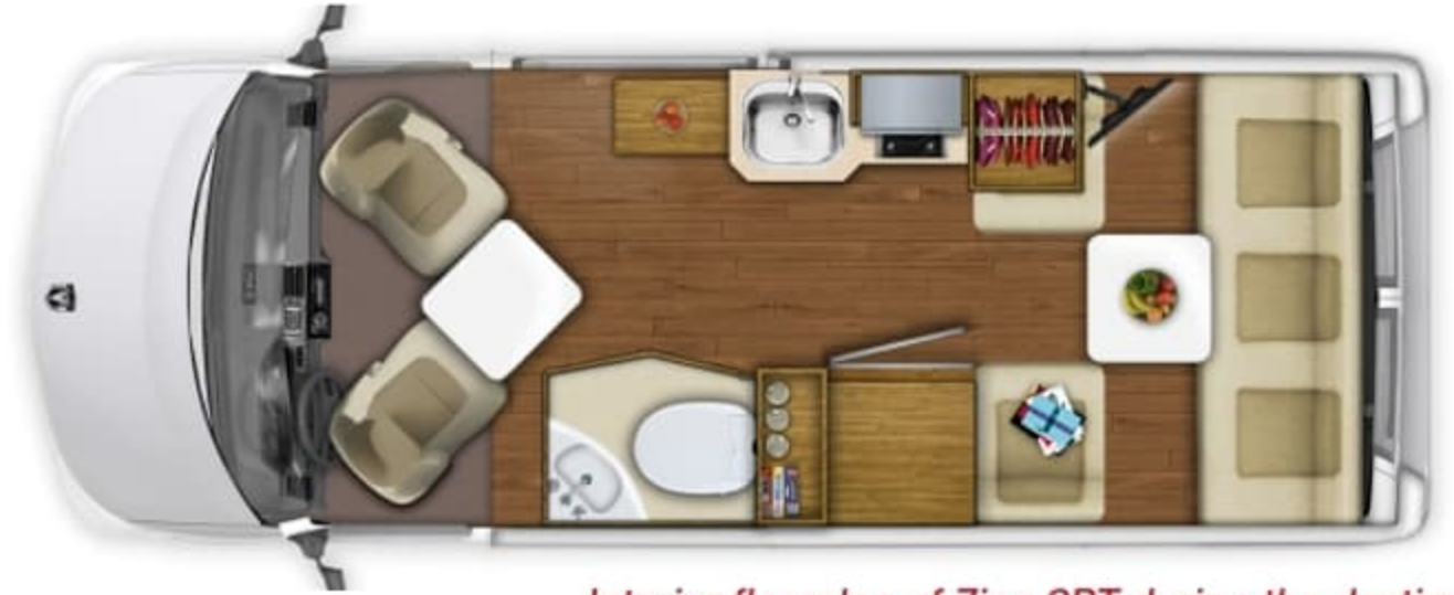
Interior floorplan of Zion SRT during the daytime

Take a step into your beautiful new Zion SRT by Roadtrek. As you turn from your driver's seat, you'll find a pop-in table to enjoy a card game or a nice meal. Looking ahead to your kitchen, you'll be able to prepare a delicious meal on your 2-burner propane stove, and keep your groceries fresh in your 5 cu. ft. refrigerator. You'll have ample storage space in the kitchen including a pull-out pantry and a deep pot drawer. As you make your way through the galley, you'll find a comfortable and spacious permanent bathroom with stand-up shower, and finally arrive to your power composite leather sofa that converts into a queen or two twin bed(s). End your day relaxed; watching your favorite movie on the 24" flat screen television.