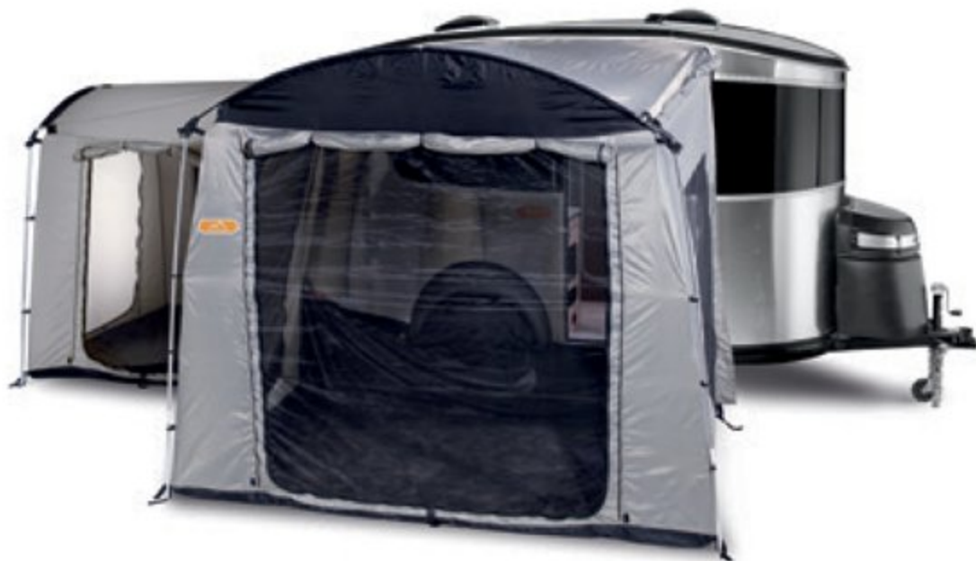
Keep the bugs out and the gear close with optional patio and rear tents.