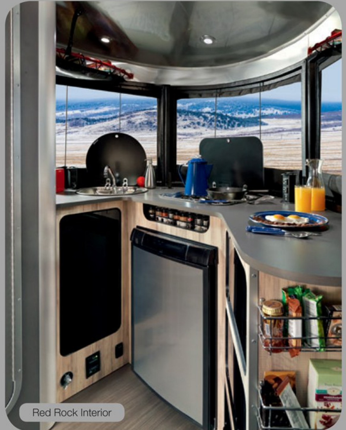
Red Rock Interior

The 2018 Airstream Basecamp is a sturdy, hypnotically beautiful escape pod packed with everything you need to live in complete comfort – whether you're off the grid, at a family campground or in a friend's backyard.