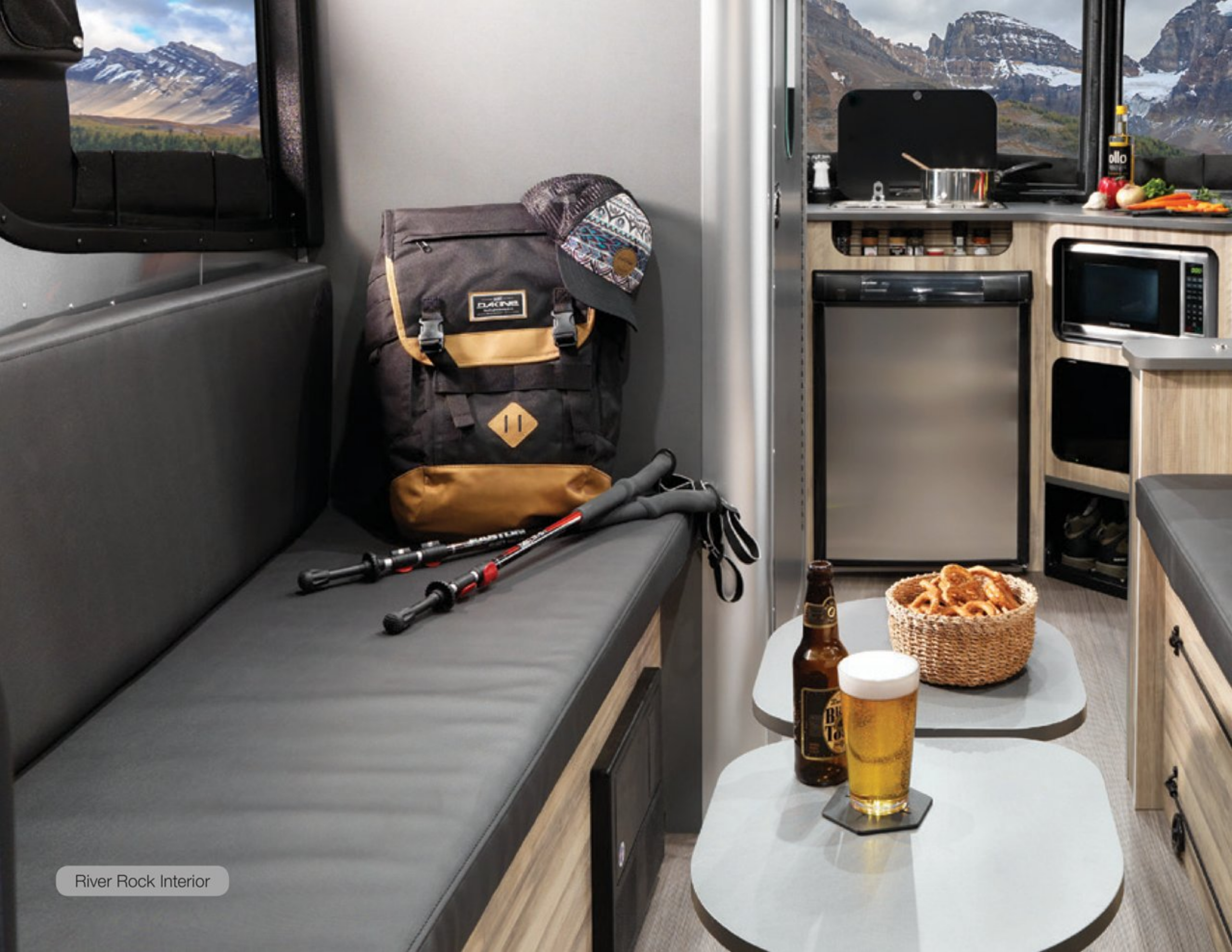
River Rock Interior