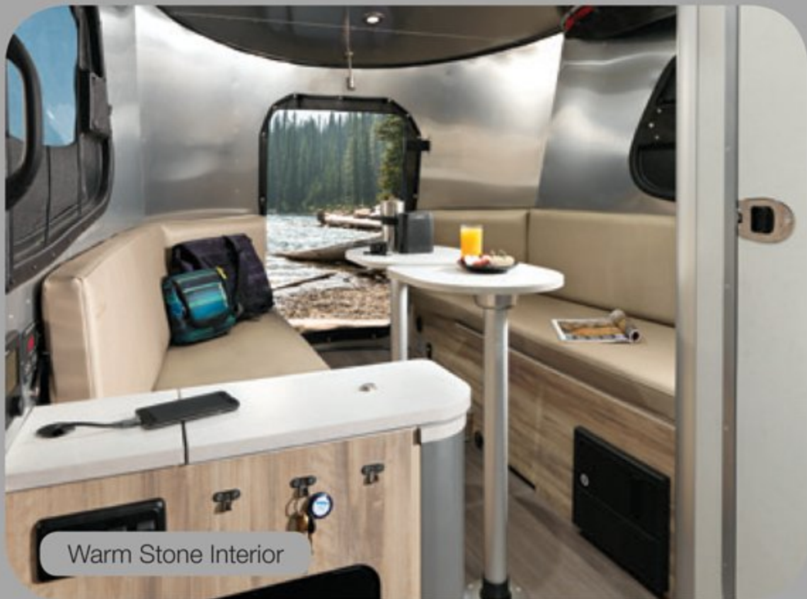
Warm Stone Interior