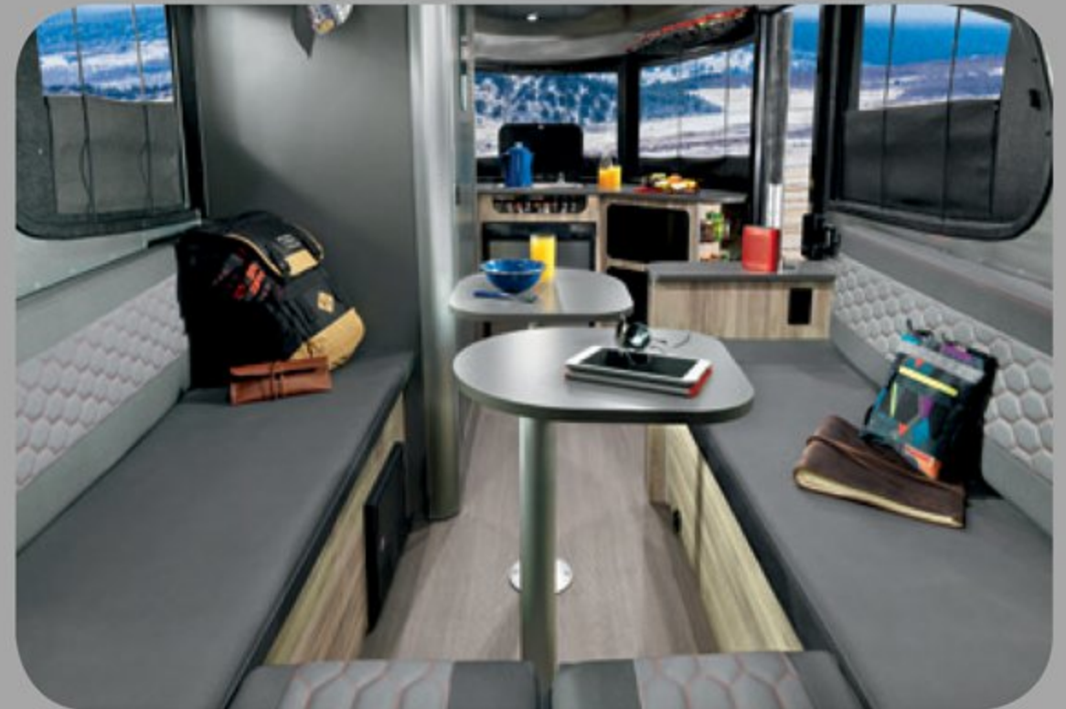
Group seating option – U-lounge seating for 5