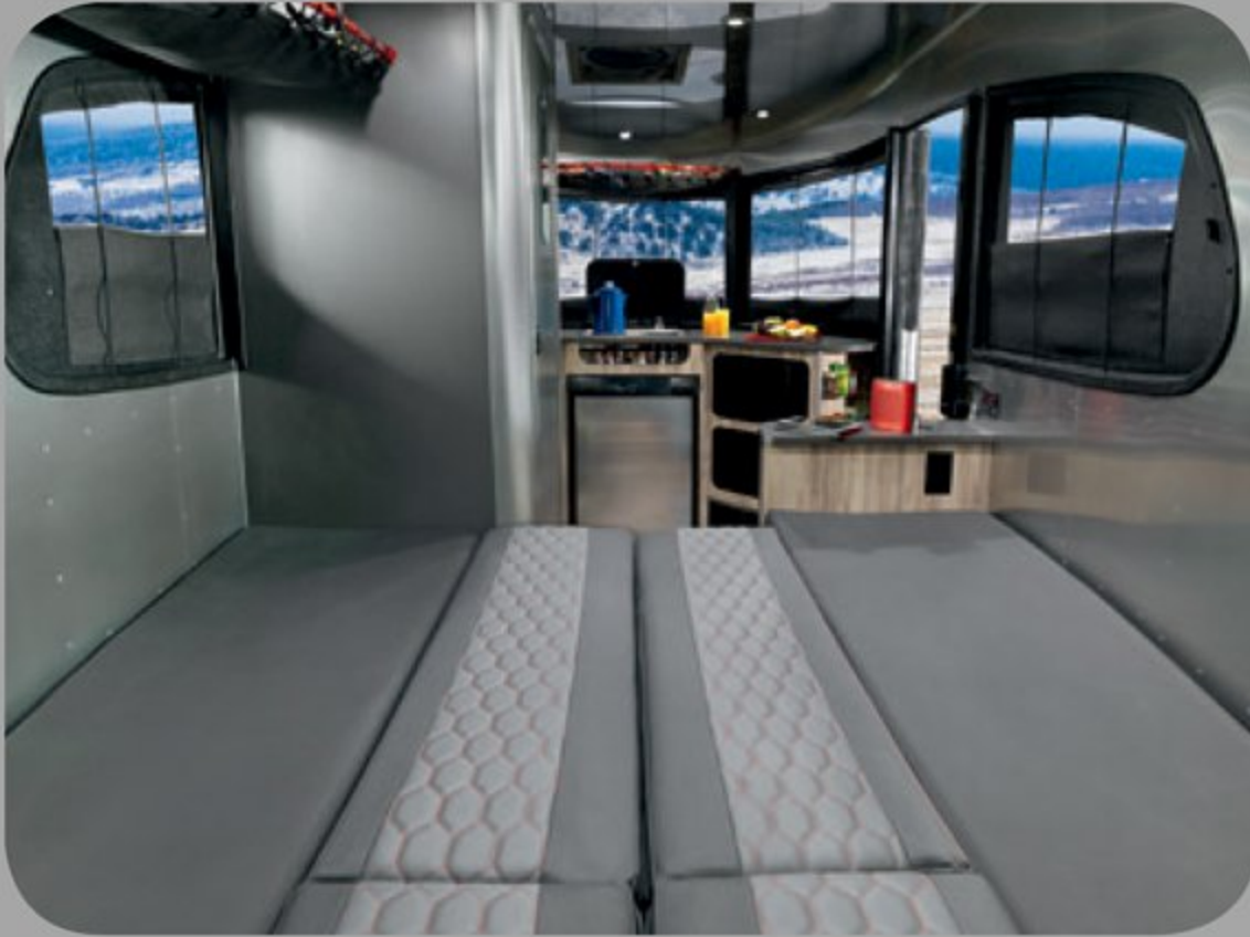
Full bed sleeping option – 76 in. x 76 in.