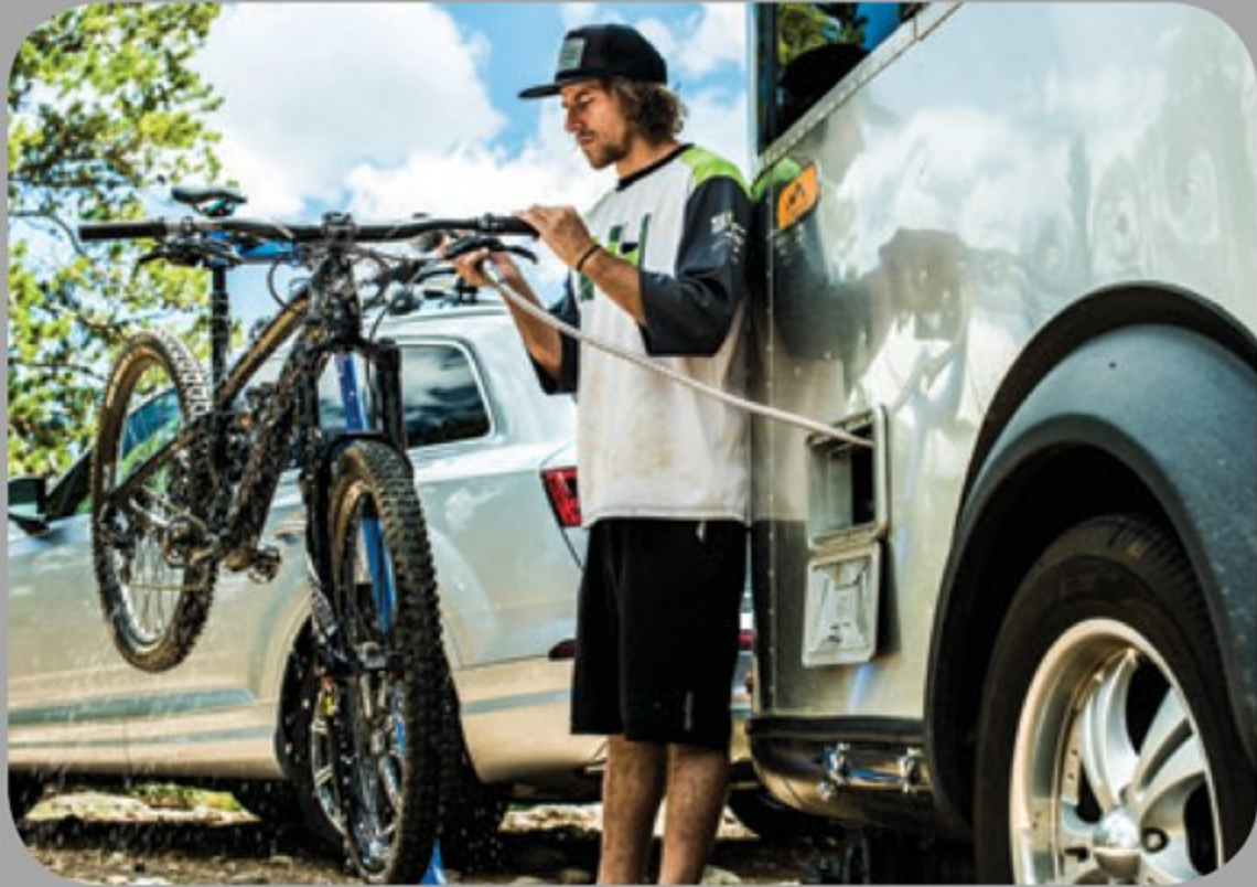
The pass through water access makes a handy unisex/unisport outdoor shower.