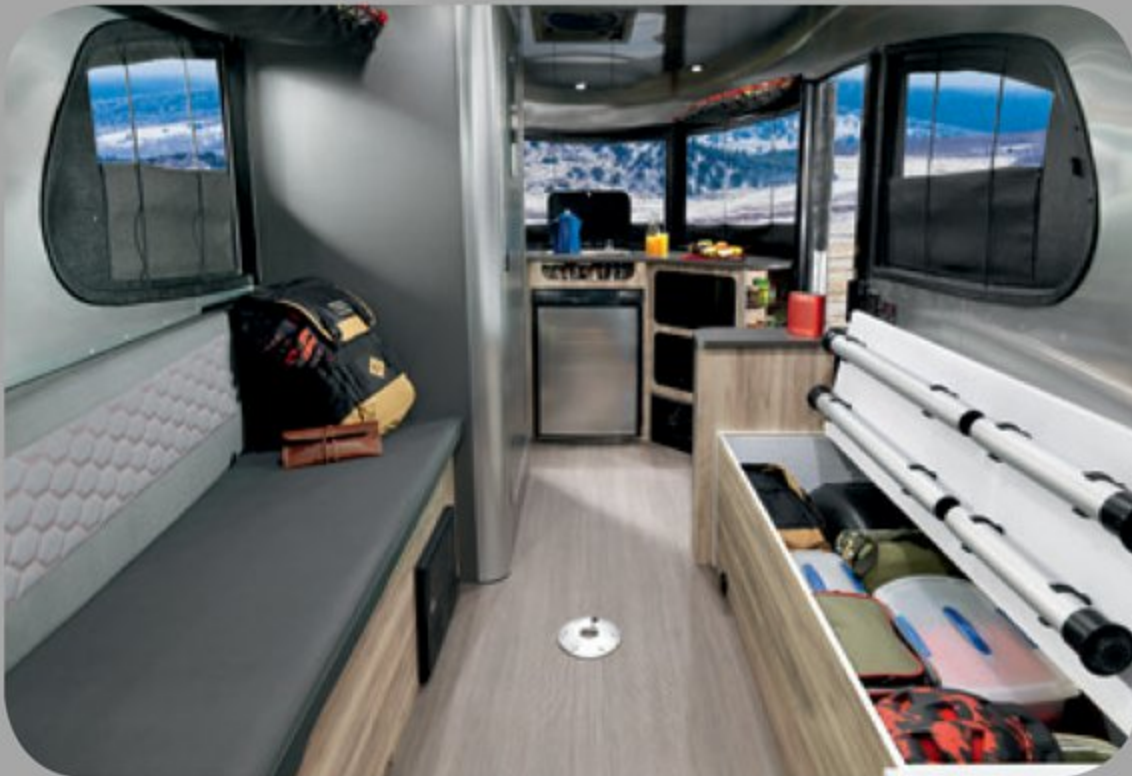
Bench storage – 11.5 cubic feet