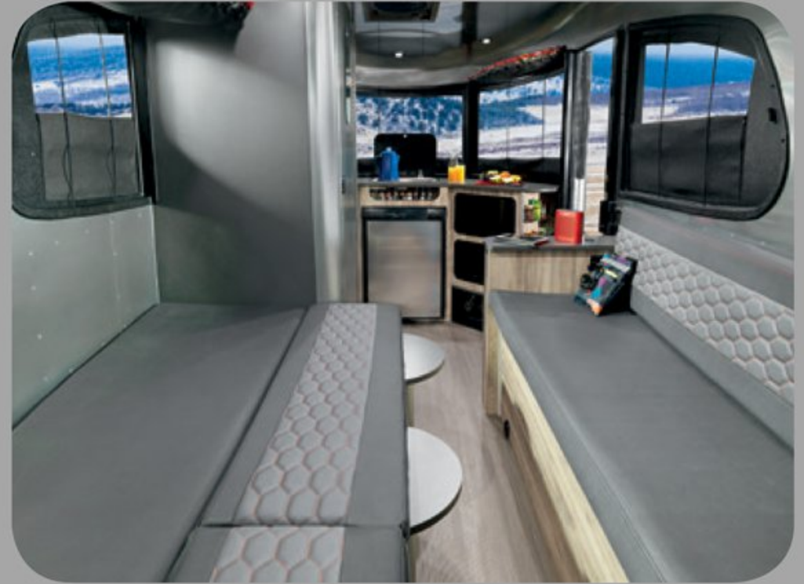
Half bed sleeping option – 38 in. x 76 in.