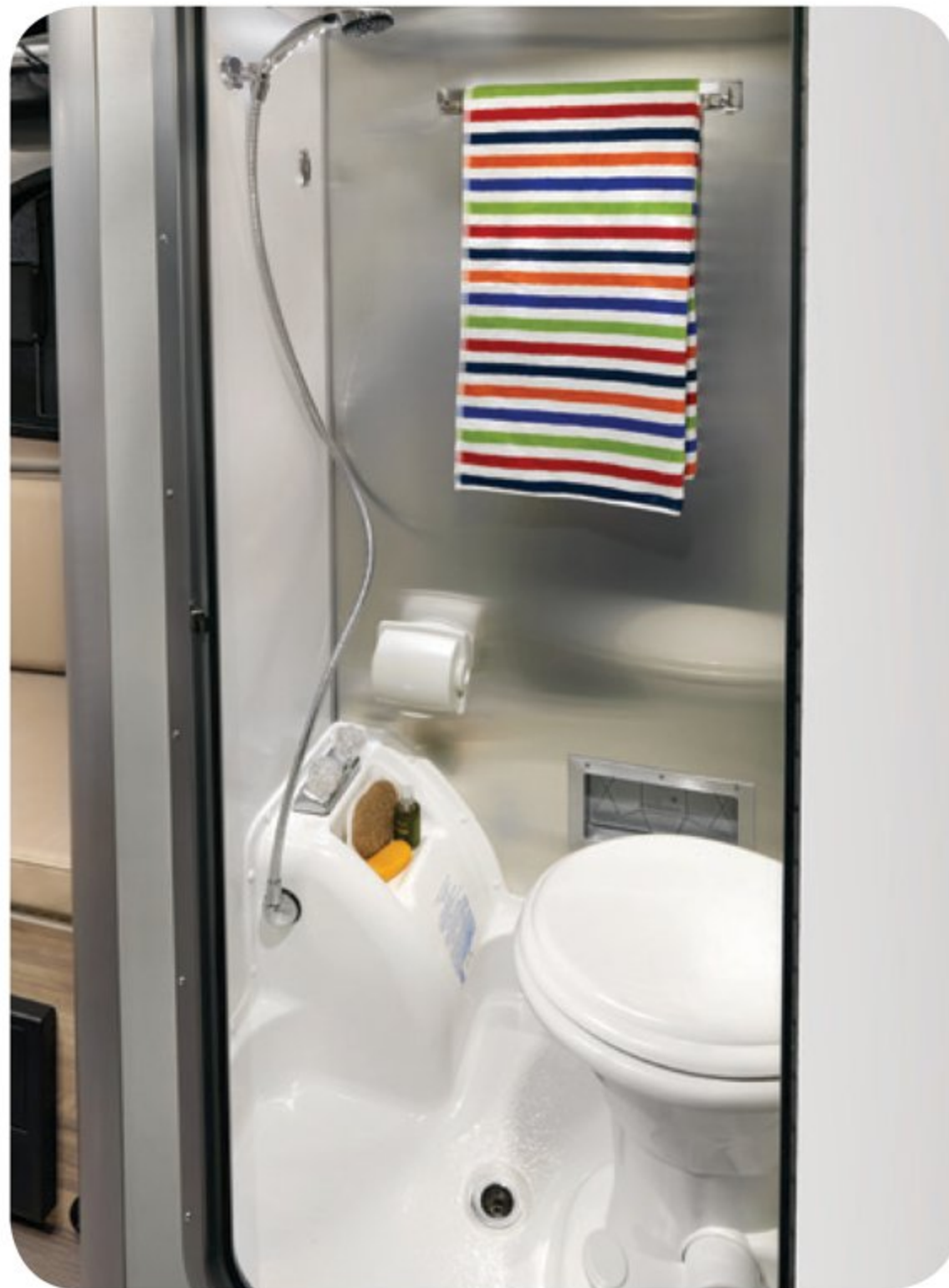
The full wet bath takes the sting (and stink) out of remote adventures.