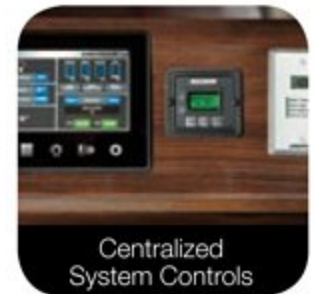
Centralized System Controls