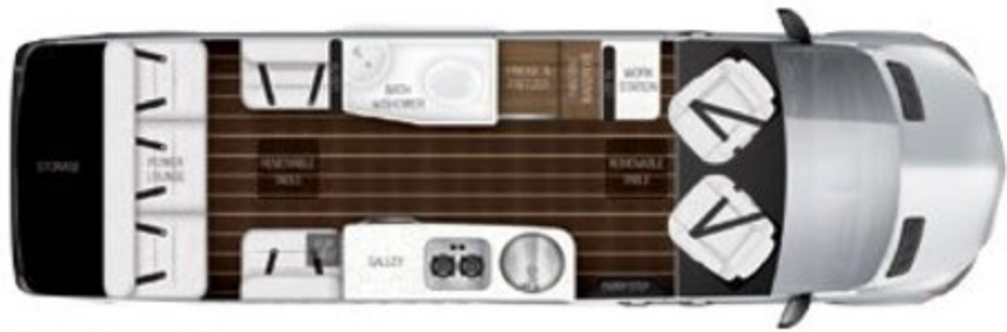
Grand Tour EXT