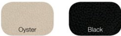
Ultraleather® Seating Choice