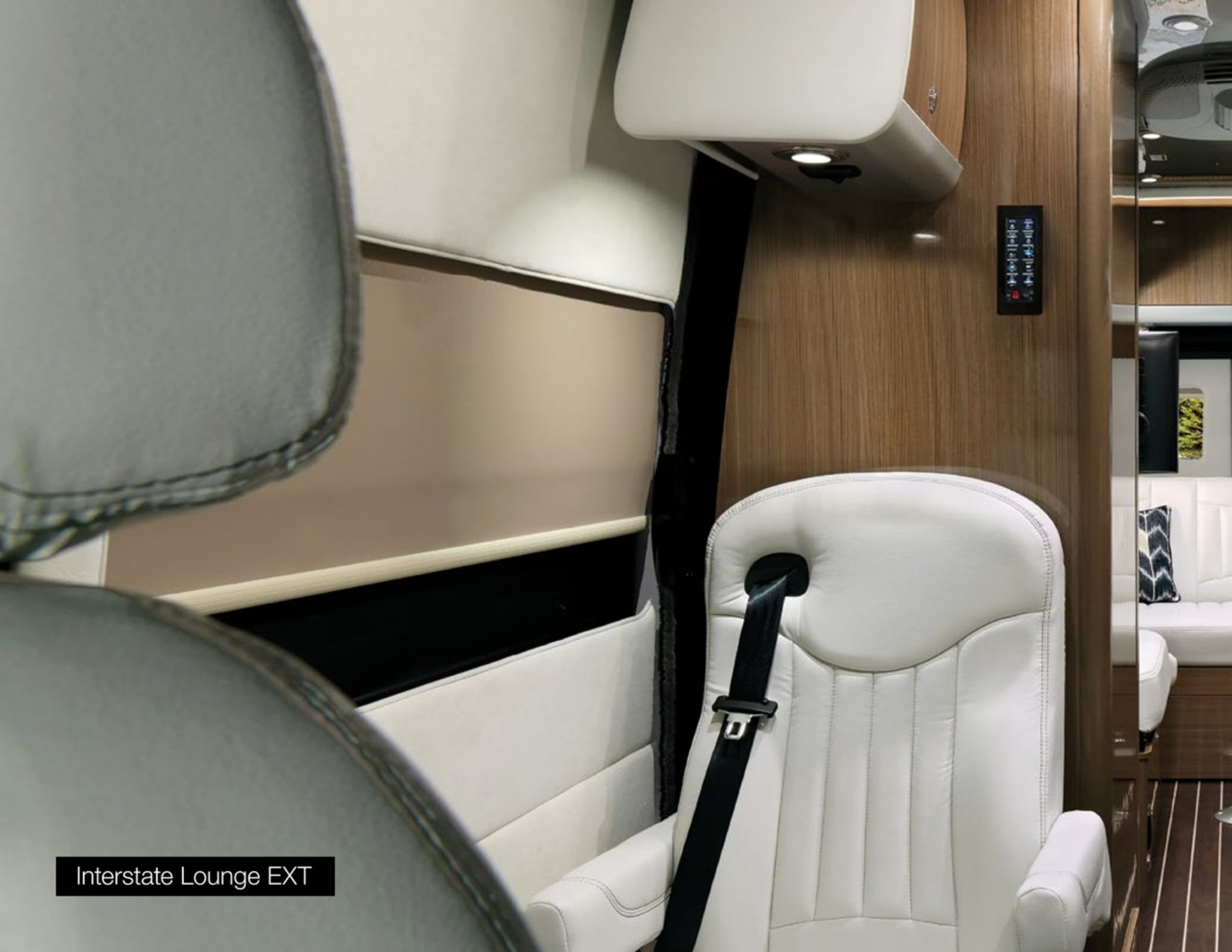
Interstate Lounge EXT