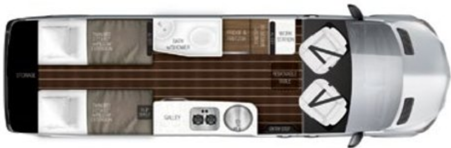
Grand Tour EXT Twin