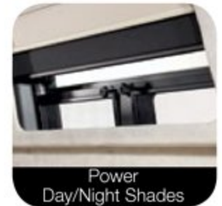
Power Day/Night Shades