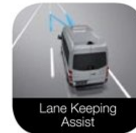
Lane Keeping Assist