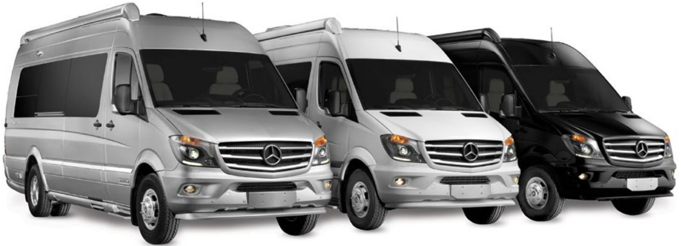
Available in three exterior colors: Brilliant Silver Metallic, Arctic White, or Jet Black.