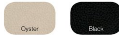
Ultraleather® Seating Choice