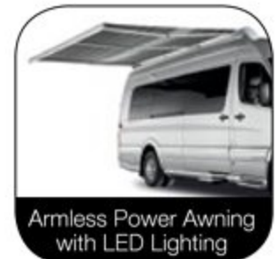
Armless Power Awning with LED Lighting