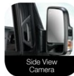
Side View Camera