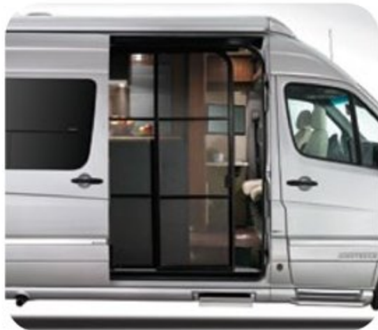
Grand Tour Side Screen Door