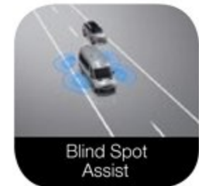
Blind Spot Assist