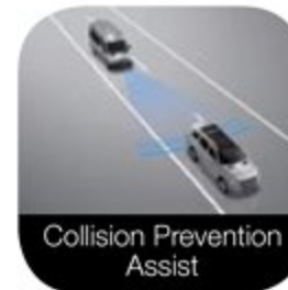
Collision Prevention Assist