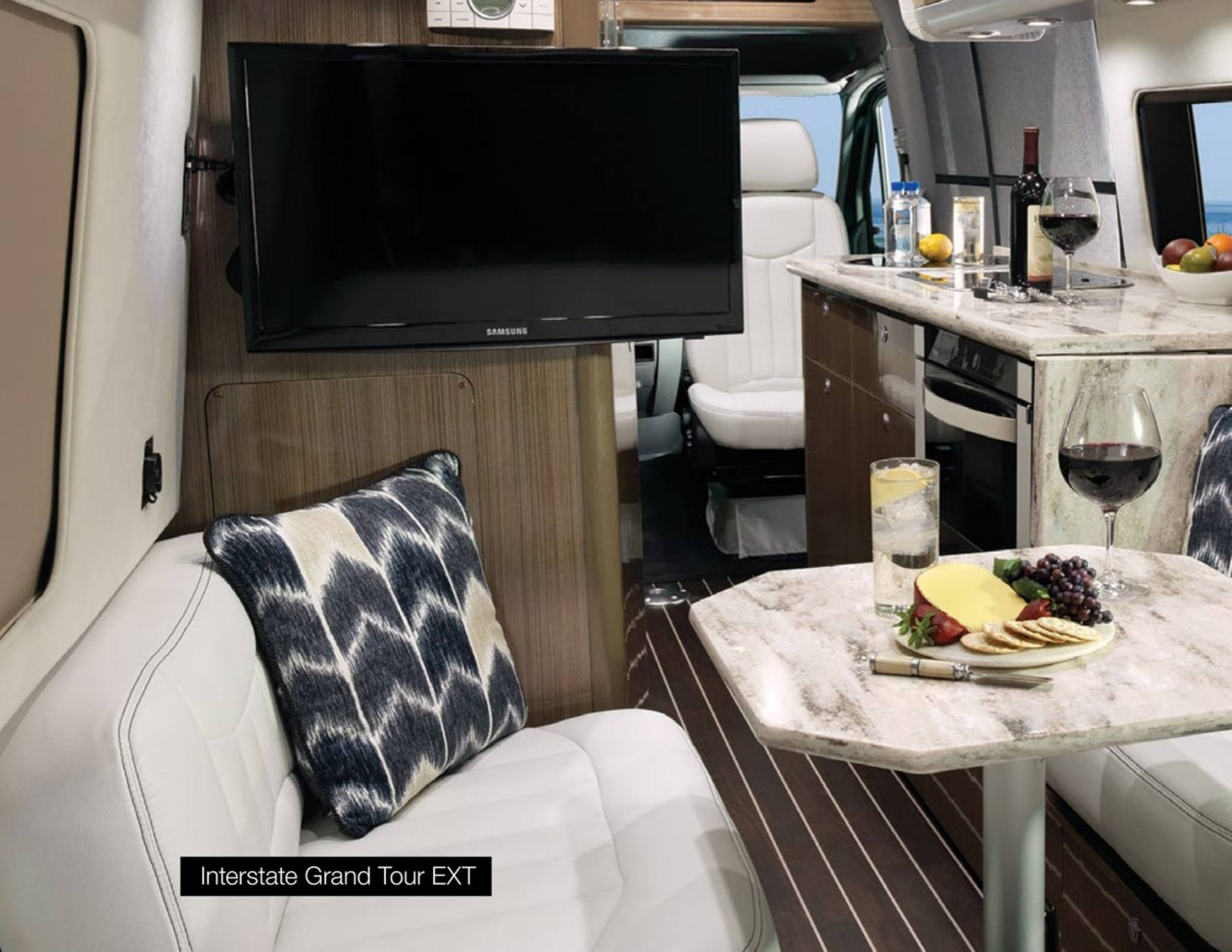
Interstate Grand Tour EXT