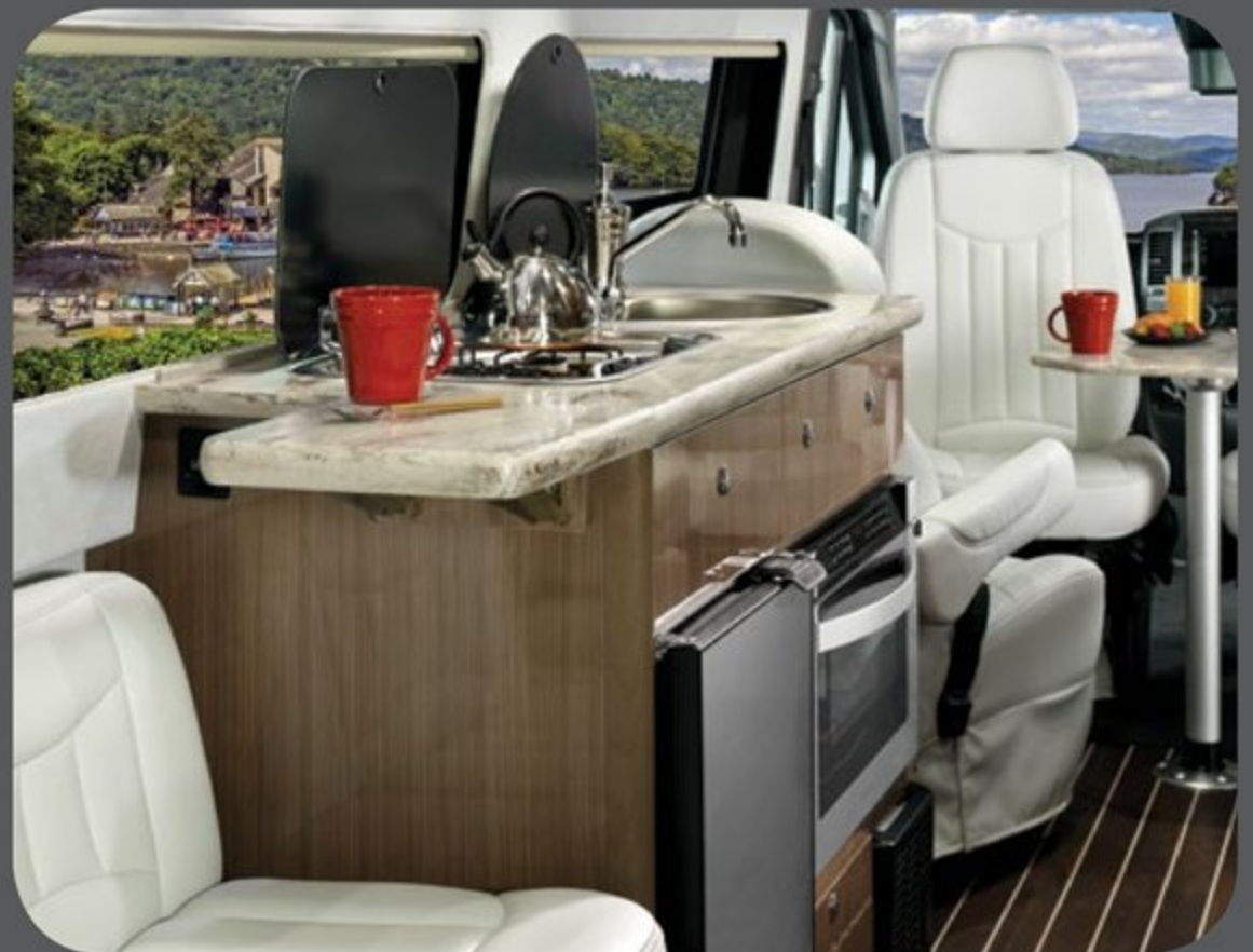
Plenty of galley for everything from breakfast to cocktail hour.