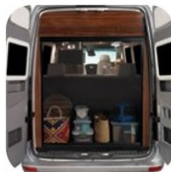
Rear Power Screen Door