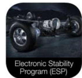
Electronic Stability Program (ESP)