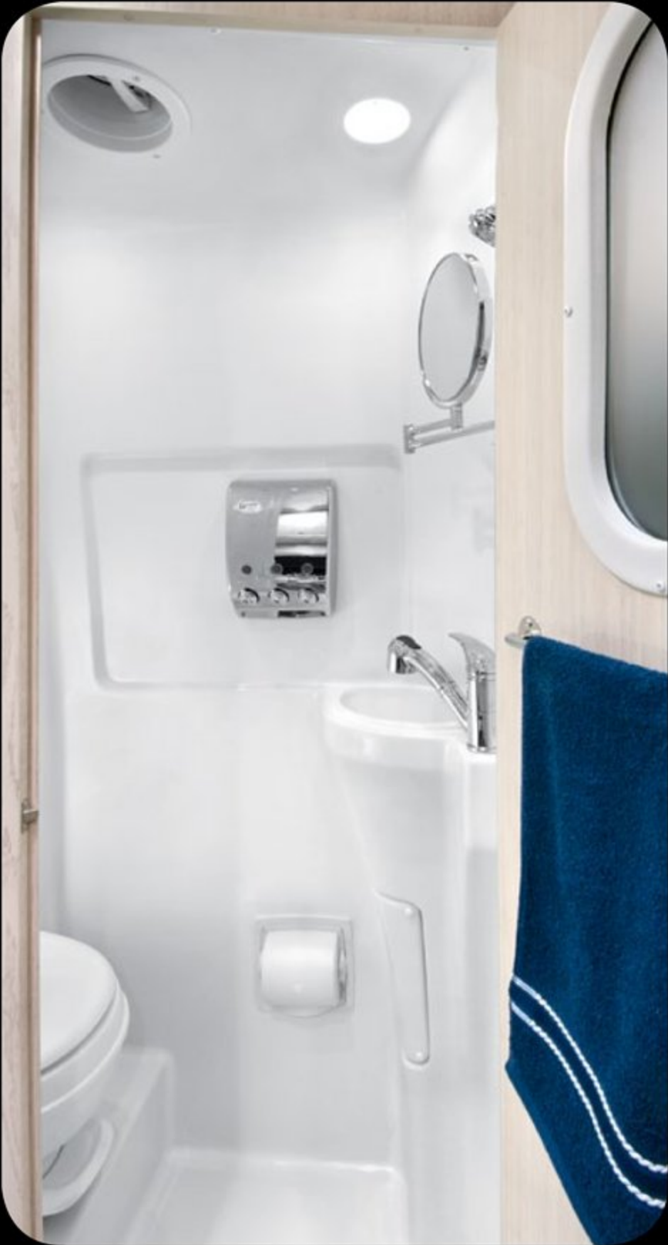
Rest stop without the stopping.