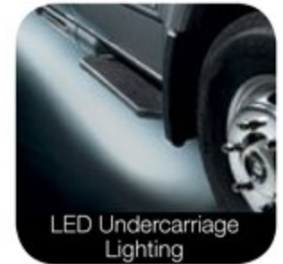
LED Undercarriage Lighting