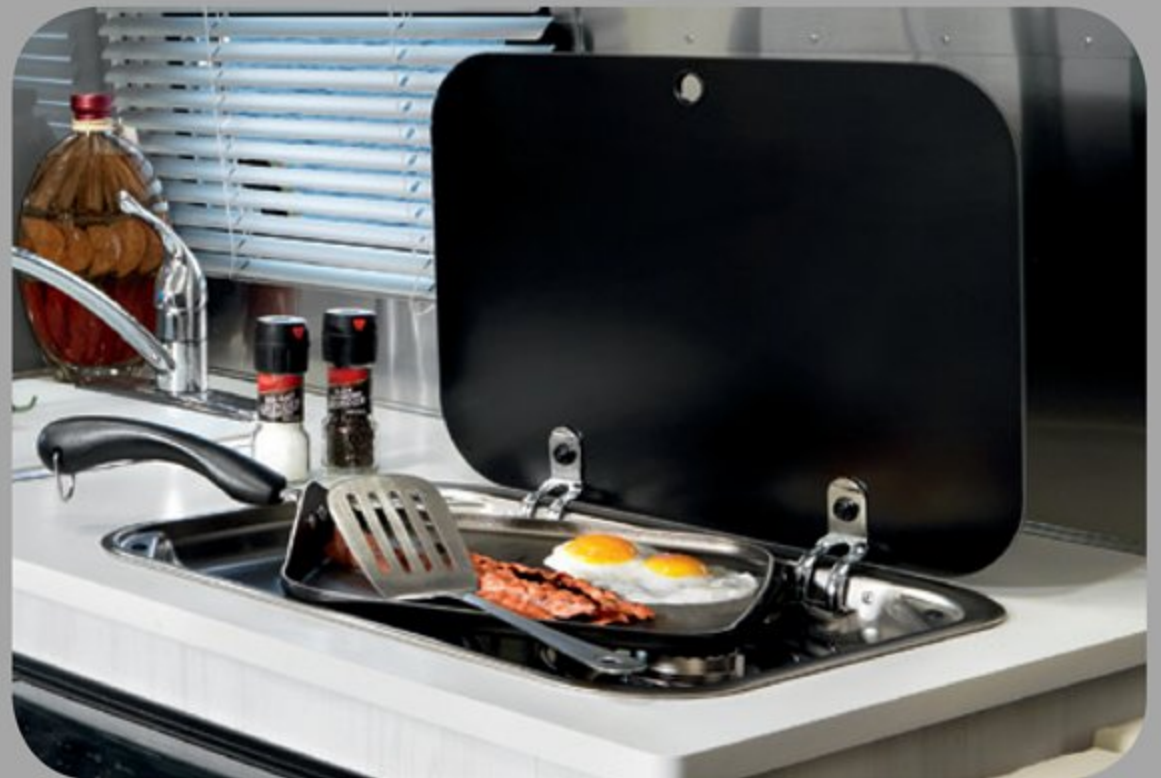
Two burners, infinite possibilities in the Sport's kitchen.