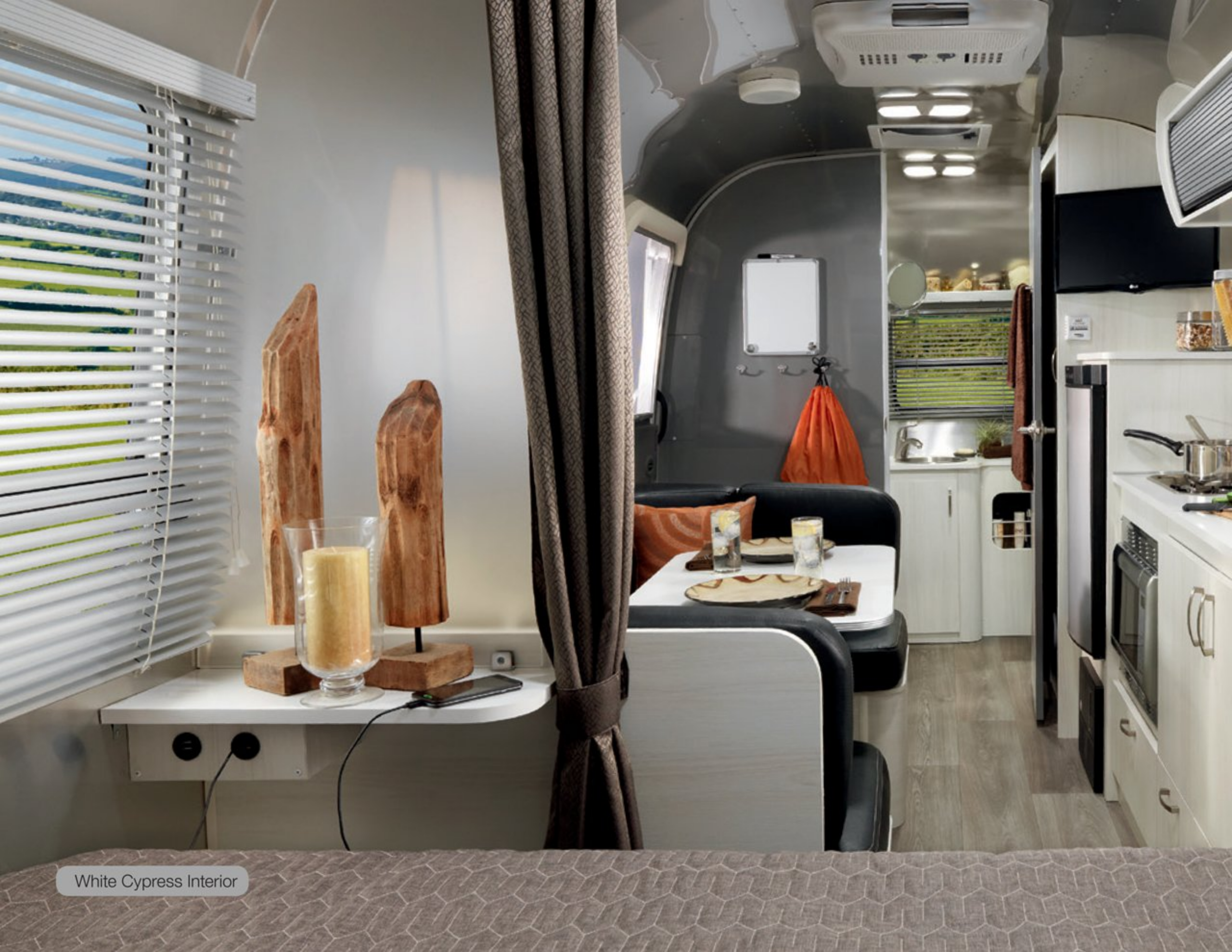
White Cypress Interior