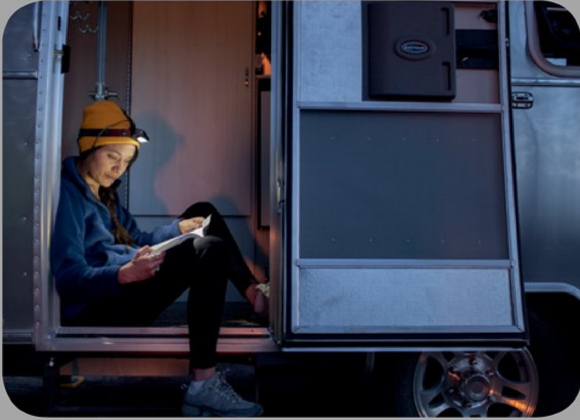
Read under the stars, by the light of the cabin, or a little bit of both.