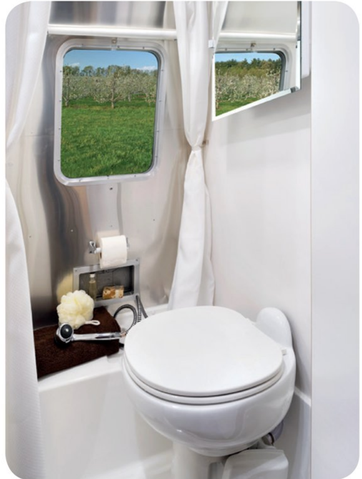
Bathe in natural light. Literally.