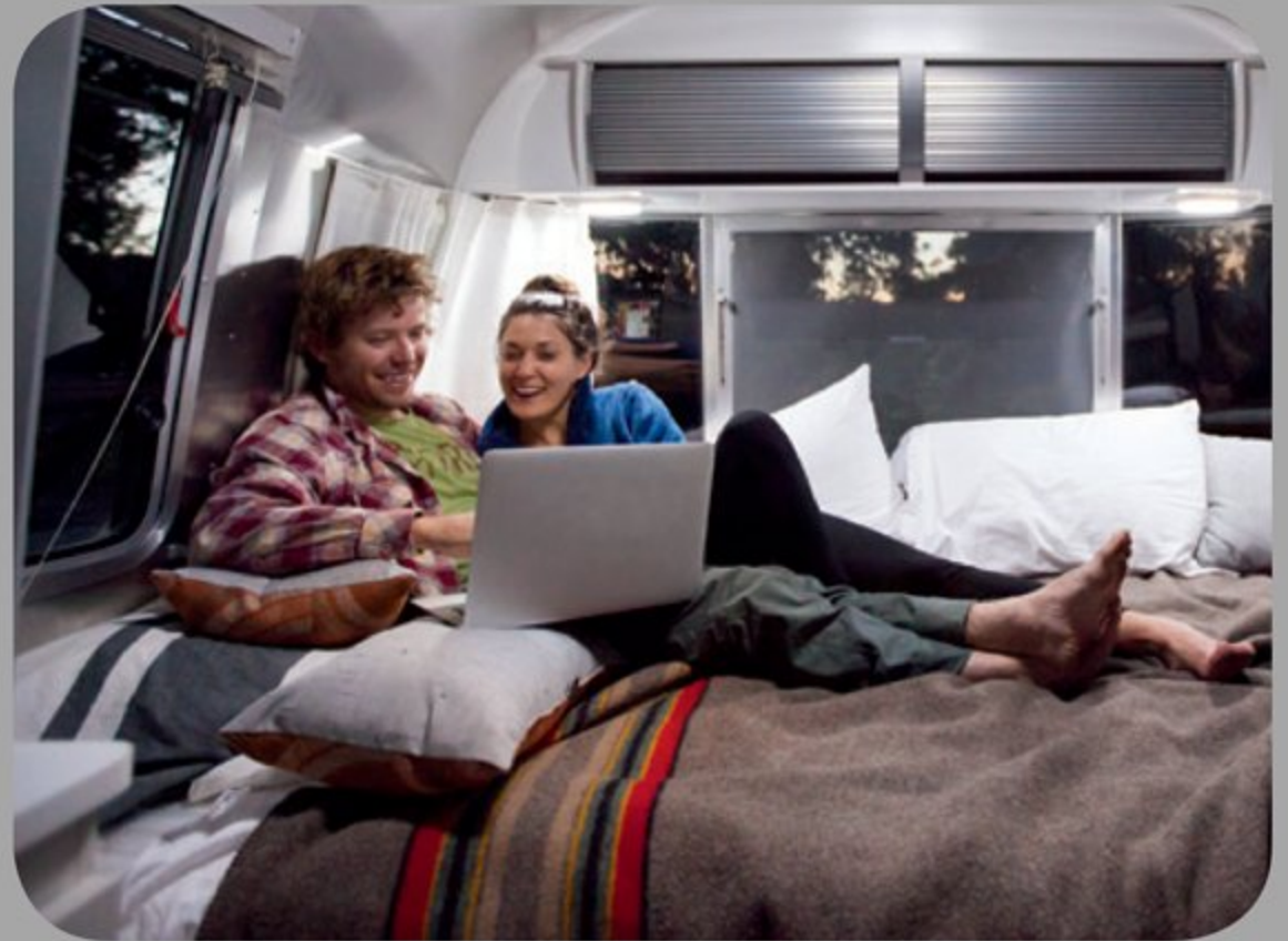
Sleep, watch a movie or relive the day's adventures in the spacious, cozy queen bed.