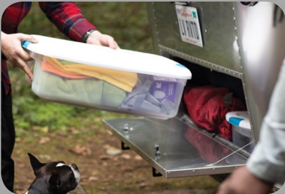
Stow gear and other bulk items in the convenient outdoor storage locker.